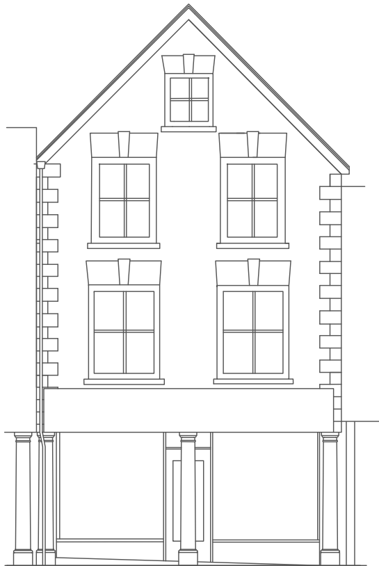
South Elevation (Existing shop front & doorway)

Grid Ref. SJ 0523 661, Recorded G Ward, 12/08/2004, Print Scale 1:100 at A4