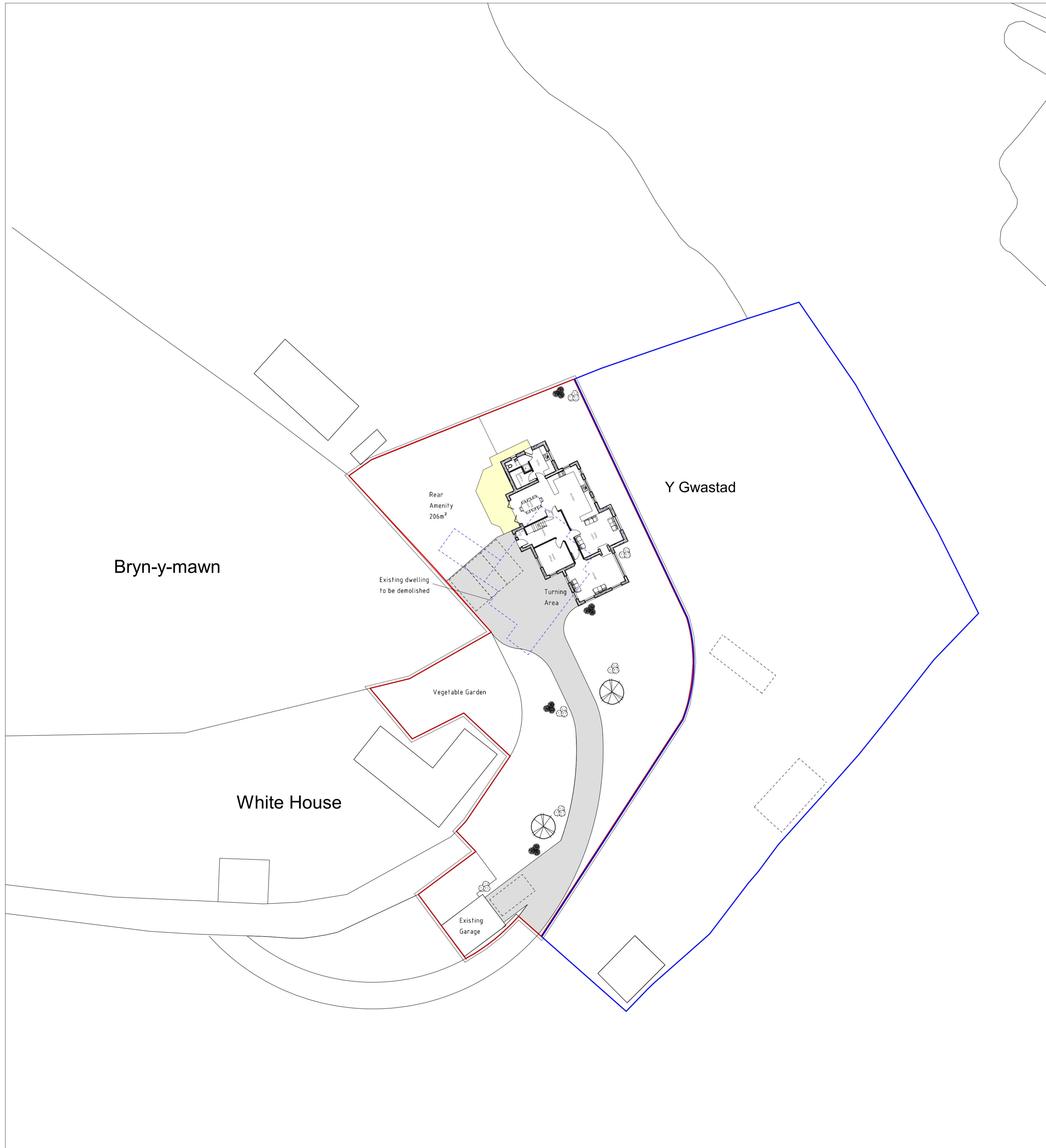
Site Plan 1:250