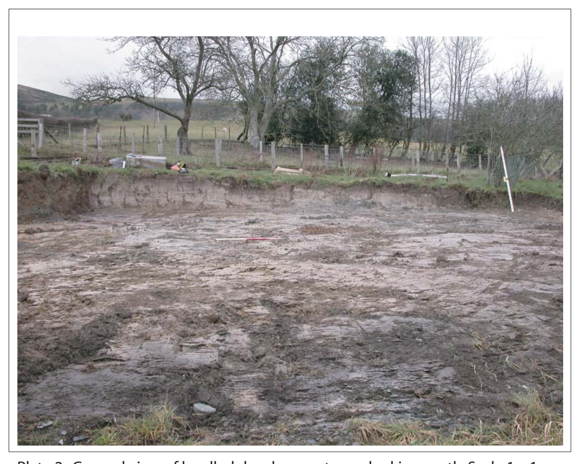
Plate 2: General view of levelled development area, looking north. Scale 1 x 1m.