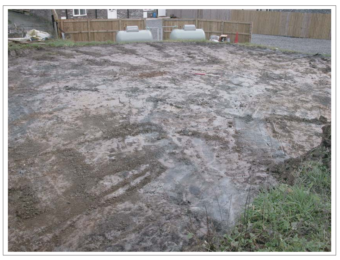
Plate 3: General view of levelled development area, looking east. Scale 1 x 1m.