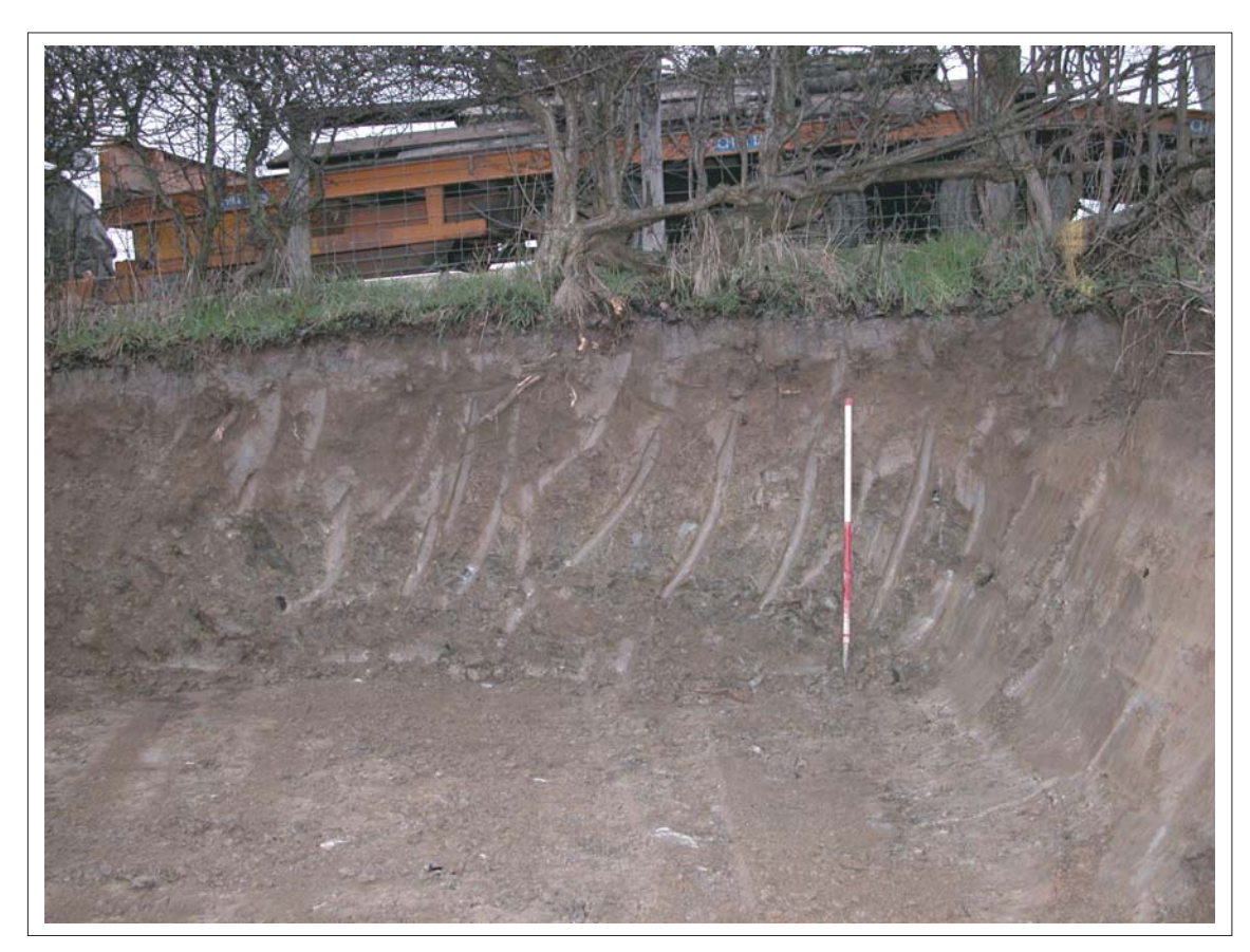
Plate 1: Photo showing depth of ground excavations, looking west. Scale 1 x 1m.