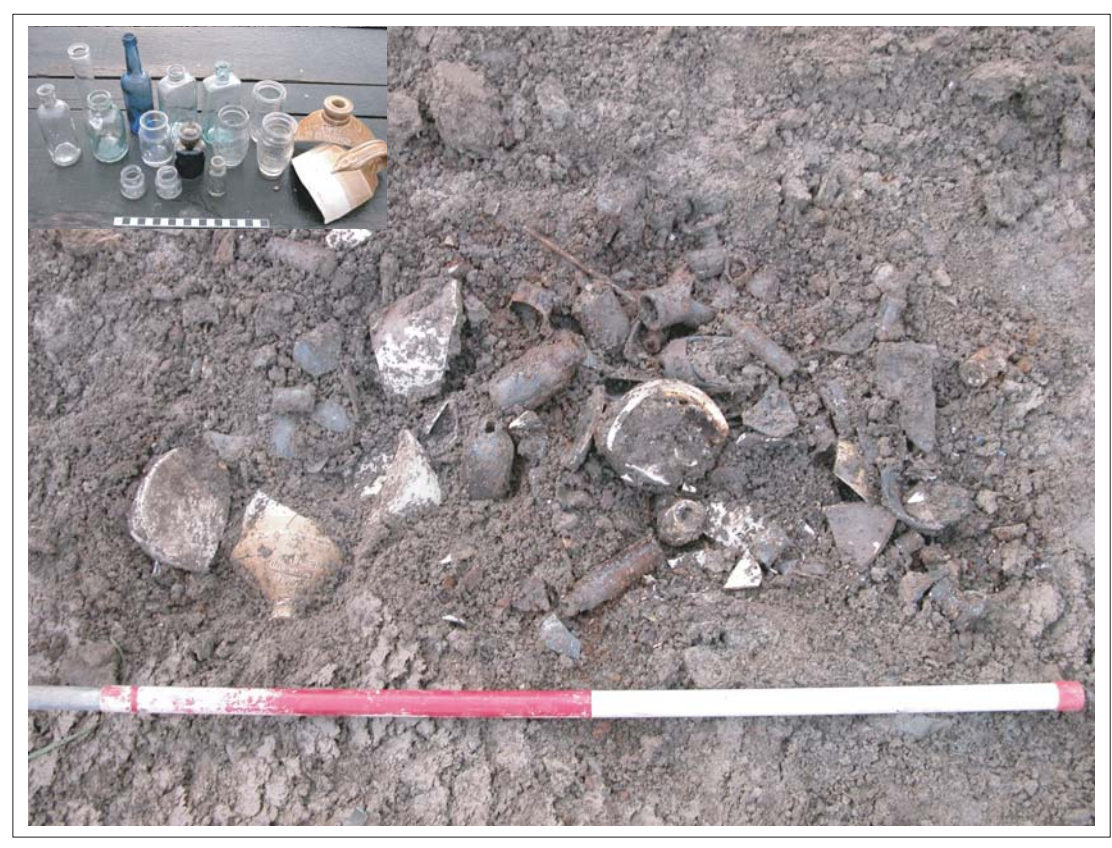
Plate 4: Photo of rubbish pit. Scale 1 x 1m. Inset: assemblage of bottles collected from the rubbish pits. Scale 0.2\ m.