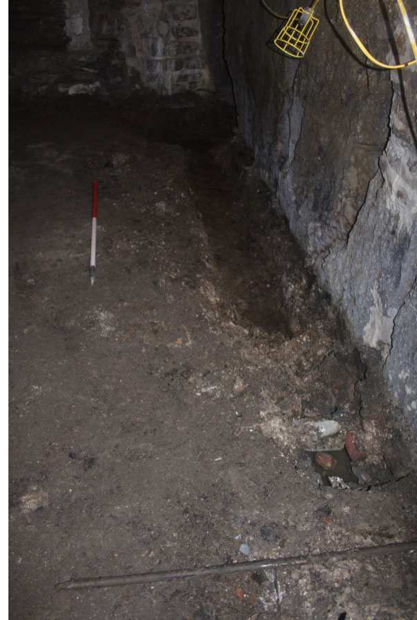
Photo. 4: Looking south along western wall of undercroft showing partly excavated drainage channel.