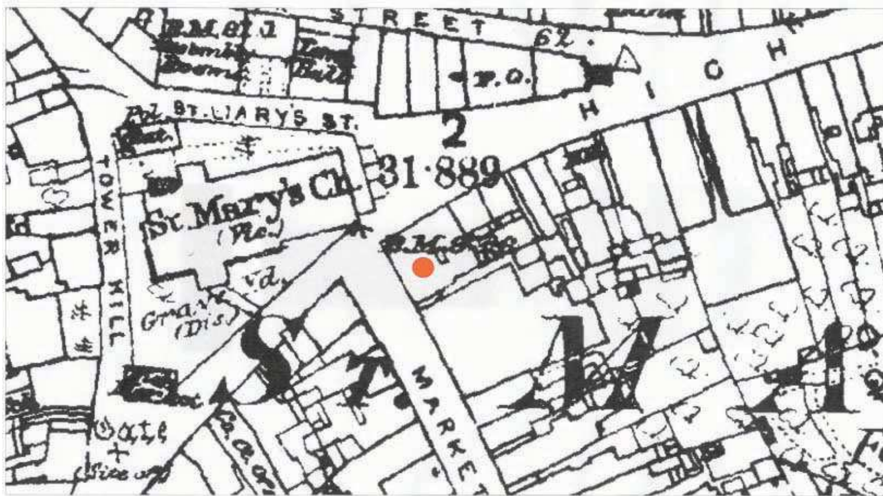
Figure 1: Pembrokeshire 1 st edition map showing Crypt location as red spot.