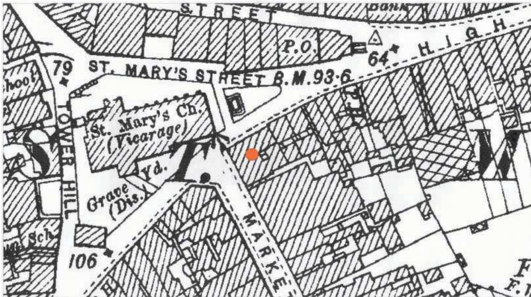
Figure 2: Pembrokeshire 2 nd edition map showing Crypt location as red spot.