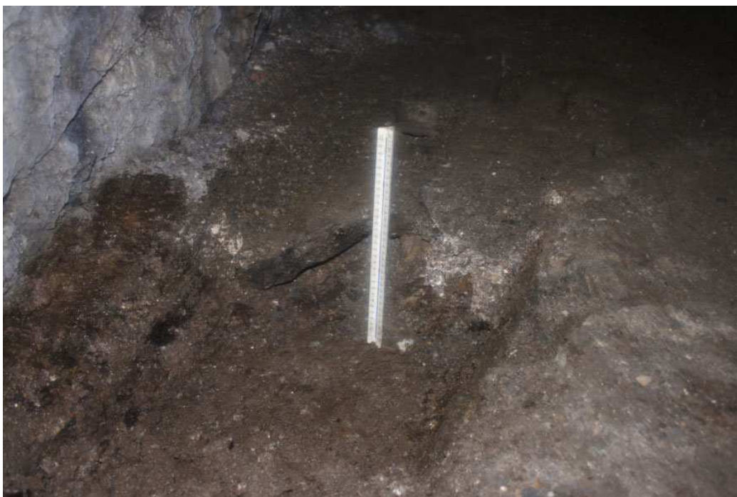
Photo. 2: North facing photo-showing rock cut gully and bed rock either side.