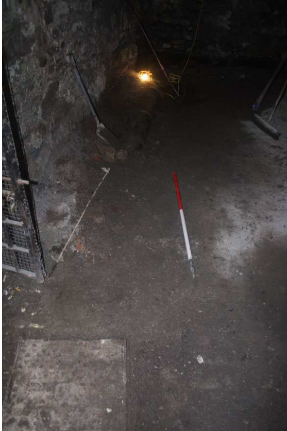
Photo. 3: Looking along eastern wall of undercroft showing modern services.