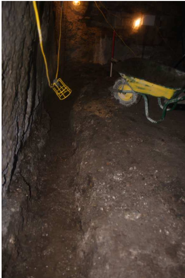
Photo. 5: Looking north along western wall of undercroft showing rock cut drainage channel.