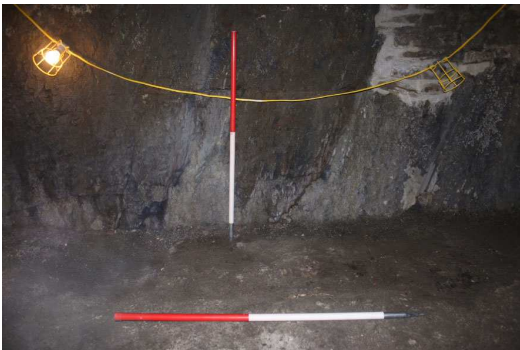
Photo. 1: Pre-ex photo showing drain situated at west wall of crypt.