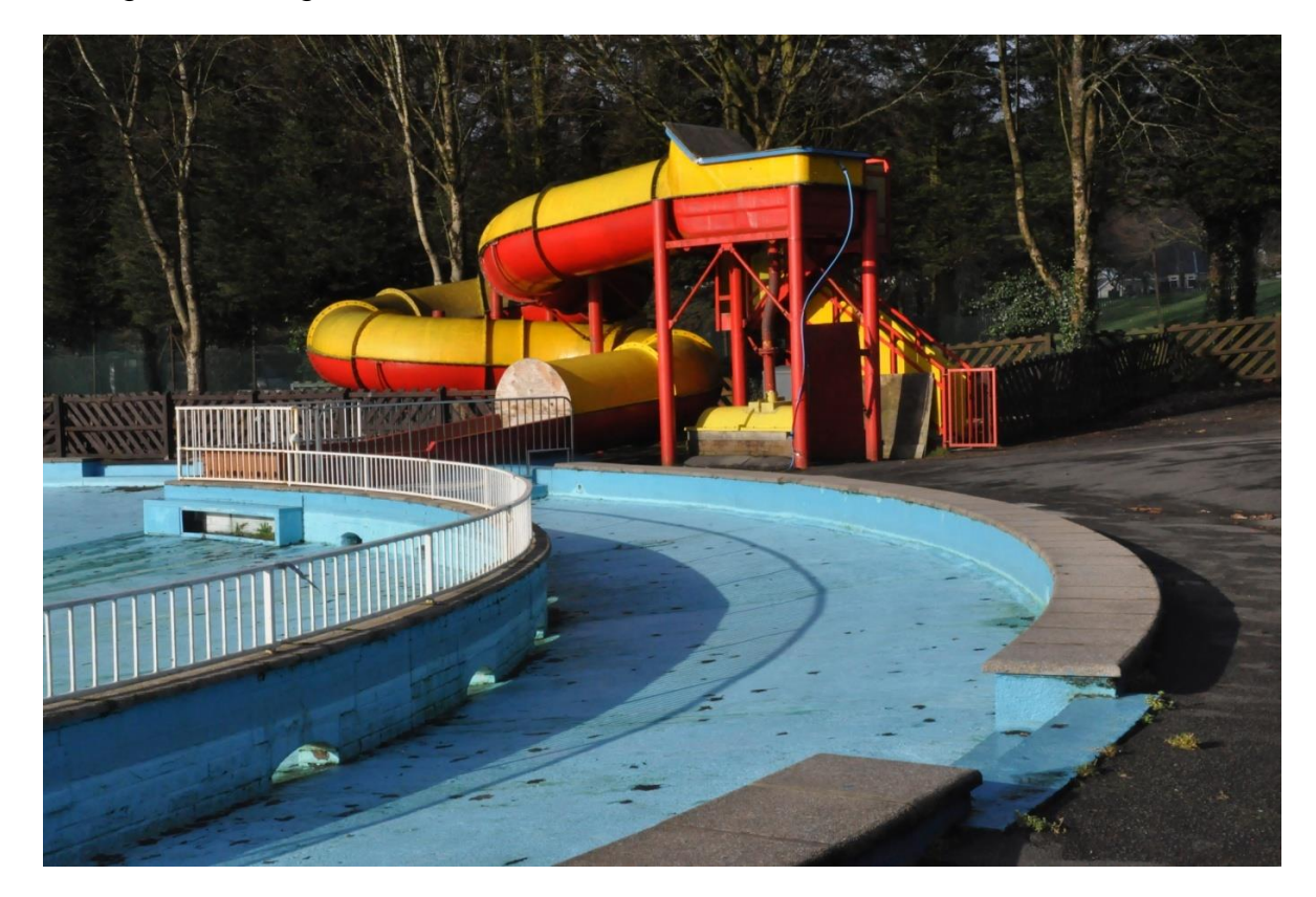
Image 4 - A view showing the detail of the dwarf concrete wall, topped with coping, constructed around the circumference of paddling pool. This view also shows a more detailed view of the spiral water flume, with its catch pool to the north east of the site. The brick built, internal wall, topped with metal railings, segregates an area for toddlers, from other older users, up to the age of 12 years old. Also shown are the steps on the east side, one of four entry points for paddlers, there are identical sets of steps on the north, south & west sides of the pool.