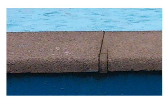
Image 5 - A close up view of the dwarf concrete wall, topped with coping, which forms the pool circumference.

Image 4 - A view showing the detail of the dwarf concrete wall, topped with coping, constructed around the circumference of paddling pool. This view also shows a more detailed view of the spiral water flume, with its catch pool to the north east of the site. The brick built, internal wall, topped with metal railings, segregates an area for toddlers, from other older users, up to the age of 12 years old. Also shown are the steps on the east side, one of four entry points for paddlers, there are identical sets of steps on the north, south & west sides of the pool.