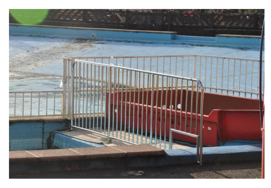
Image 6 - A close up view of the modern spiral water flume's, catch pool, showing the exit point, for users.