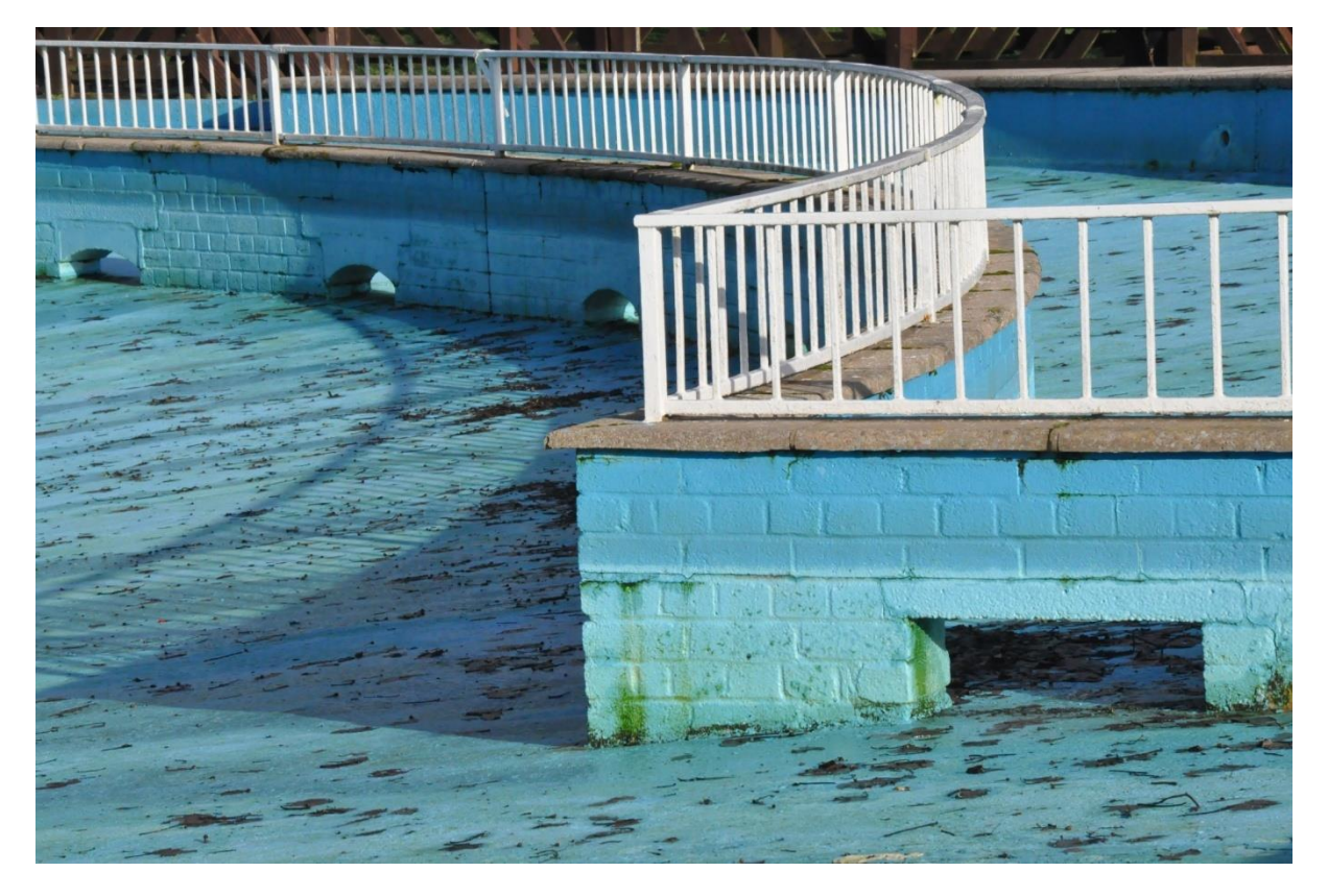
Image 7 - A more detailed view of the internal brick built wall, which segregates the toddler area, from older users of the paddling pool.