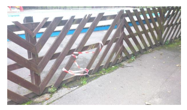
Image 2 - A close up view of the perimeter fencing, surrounding the circumference of the paddling pool.

Image 1 - A general view of the paddling pool from the park east side, looking towards the river Taff, with the Grade II listed Lido to the south, on the left and children's play area on the right towards the north west.