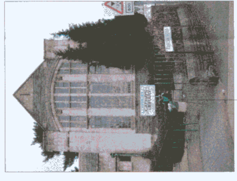
View 4 Existing railings to be replaced with new railings View from the main entrance approach onto the front elevation of the East wing showing the proximity of front conifer tree (to be removed)