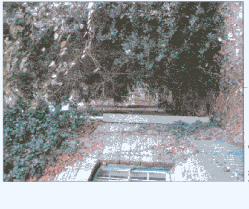
View 8 New gullies & storm drainage to be installed to mitigate damp ingress View along the rear track to the rear showing the proximity of triangular lightwell & the proximity of tree lines. Foliage is to be reduced & the trees to be well pruned back from overhanging the building, roof and parapet gutters