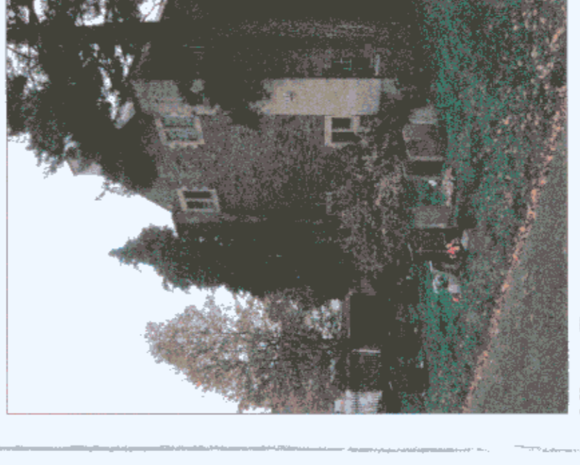
View 7 View from cemetery grounds onto the gable to the East wing showing the proximity of the rear conifer tree (to be removed) and grave stones