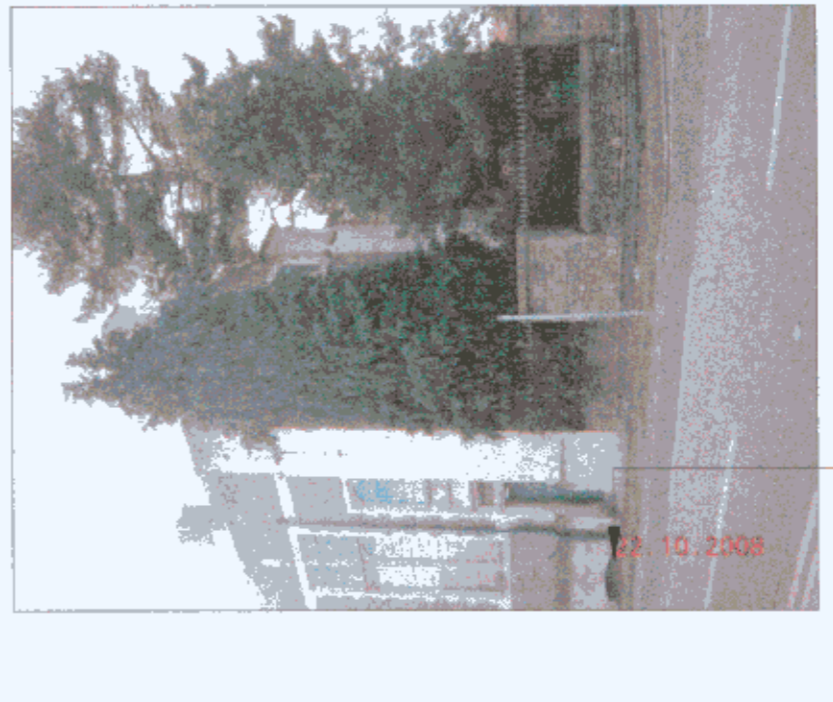
View 6 Plywood panel to be replaced with Banstone infill Ref Dwg SCHD(A)00A & 09 View from Fairbairn Road onto the rear corner to the East wing showing the proximity of rear conifer tree (to be removed)