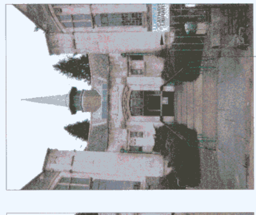
View 3 Existing signage to be replaced with new signage View from main entrance approach onto the front elevation of the West wing showing the proximity of front conifer tree (to be removed) and replaced with new signage