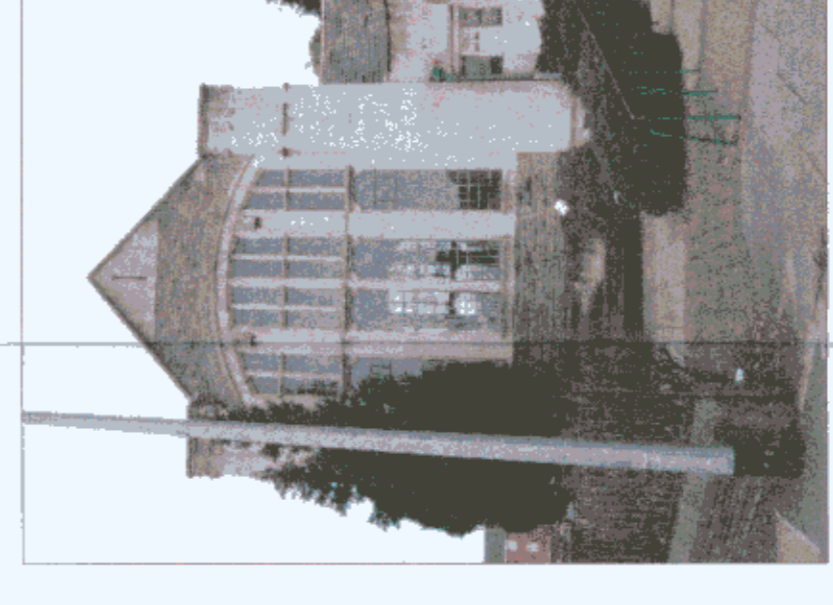
View 2 View from main entrance approach onto the front elevation of the West wing showing the proximity of front conifer tree (to be removed)