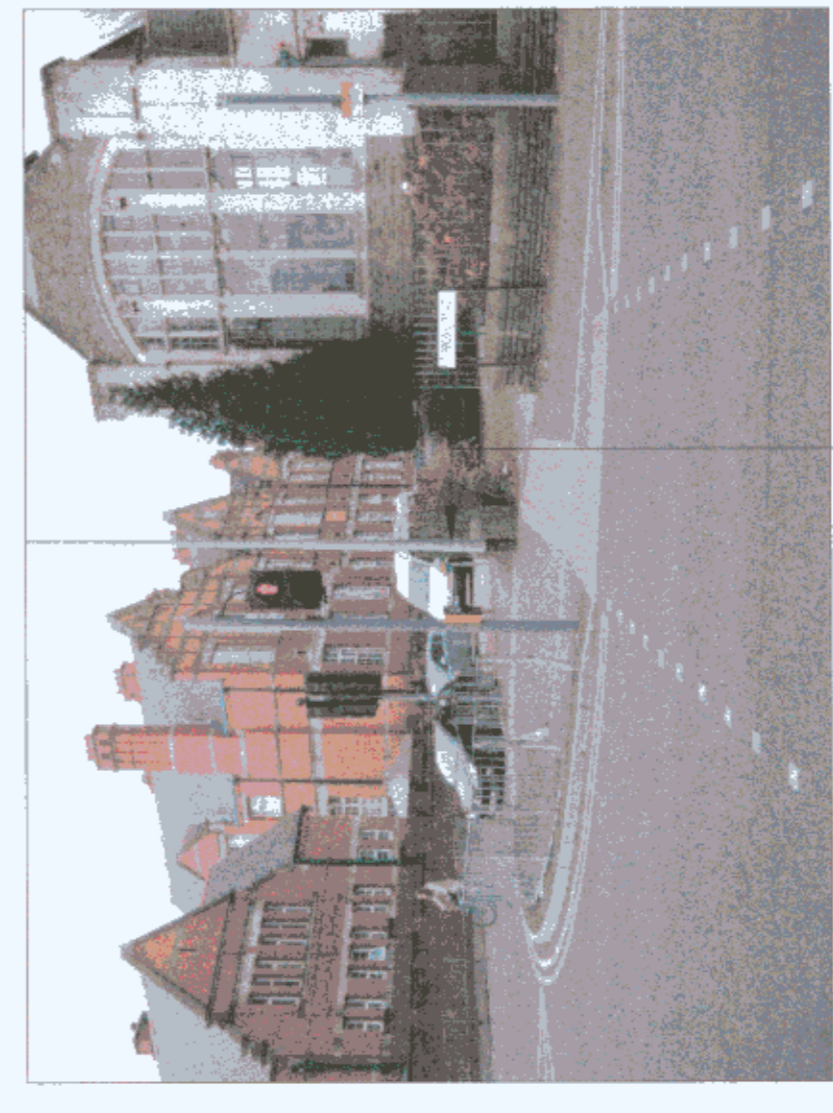
View 1 Existing lamppost View from Fairbairn Road towards junction with Whitchurch Road showing the lamppost and the pedestrian crossing points & the proximity of existing external lighting to the front amenity areas