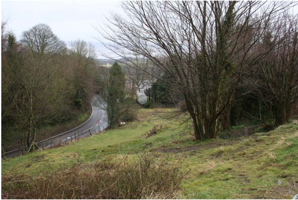
Plate 100 above: View down Brynford Road towards the Tank recorded on Fig. 1. The earthworks on the right are the remains of spoil tips resulting from leadmining