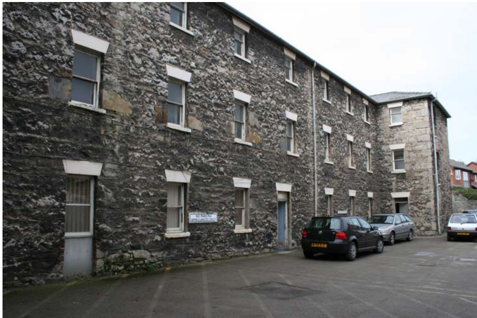
Plate 14 below: East elevation of the north wing of the workhouse, viewed from Chapel Yard