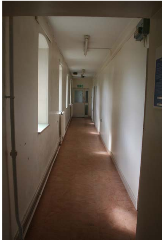
Plate 51: First floor corridor from Admin. to the Octagon