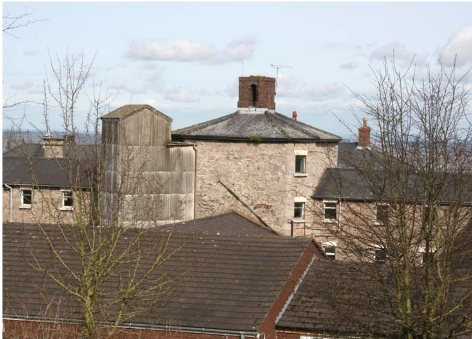
Plate 22 below : Central Octagon