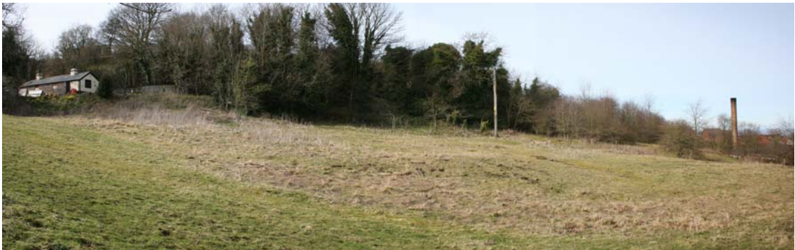
Plate 98 above: Rising land to the west of the Workhouse, included in development proposals. View from the southeast