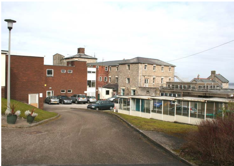
Plate 43 below: View from the southwest towards the modern additions to the Workhouse