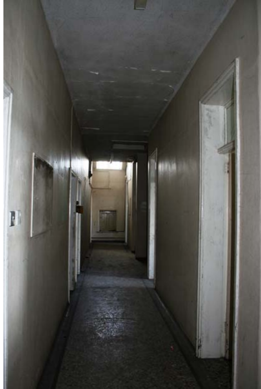
Plate 89: Second floor corridor