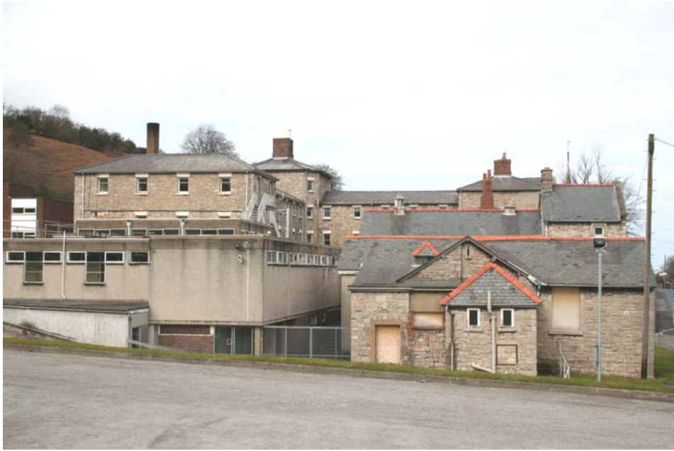
Plate 25 above: Workhouse viewed from the south