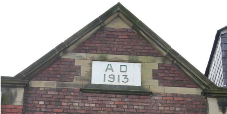
Plate 82 left: 1913 date stone