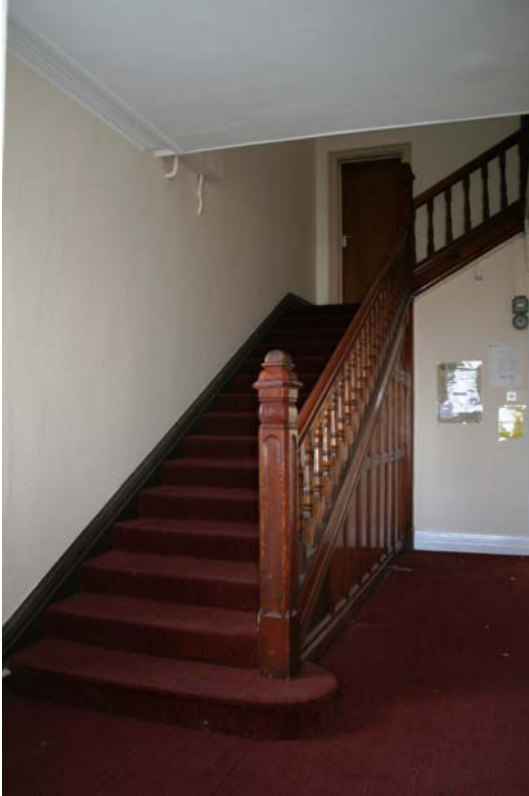
Plate 70 left: