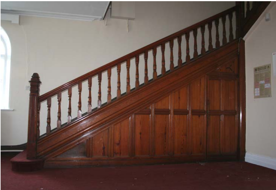
Plate 71 below: Side elevation