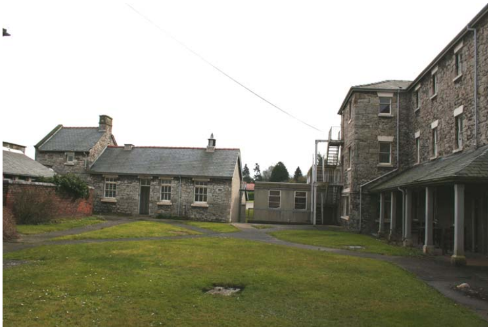
Plate 27 above: Pump Yard, viewed from the north towards the single storey building with Pump outside