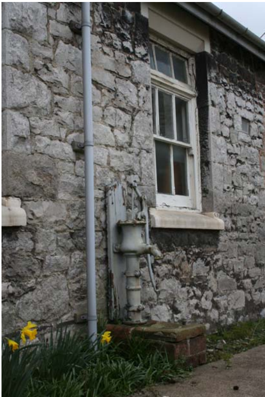
Plate 29 below right: South cross wing east elevation from Pump Yard