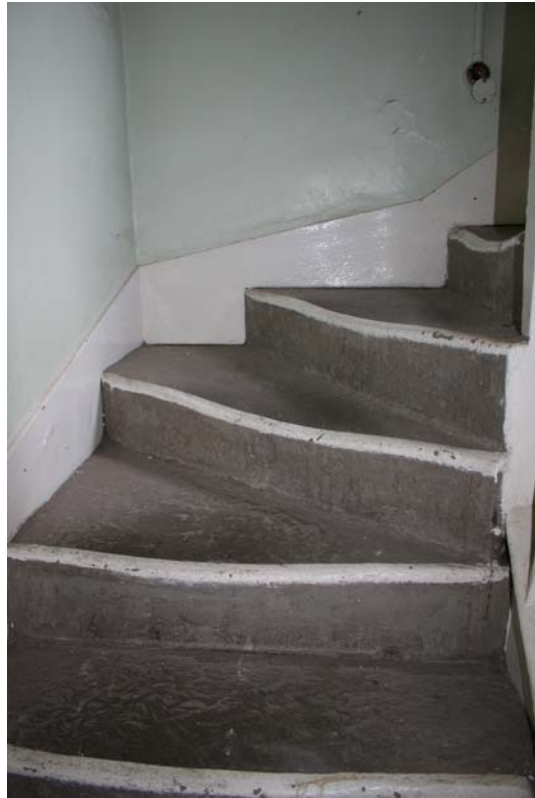
Plate 65 & Plate 66 above : Stone steps rear of Workhouse Admin. Block