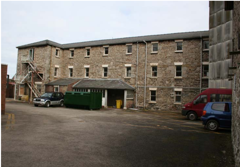
Plate 17 above: West elevation of the Workhouse north wing, view across the Bell Yard