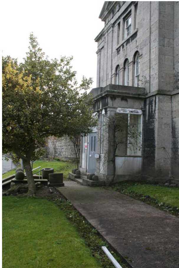
Plate 4 below: Workhouse entrance