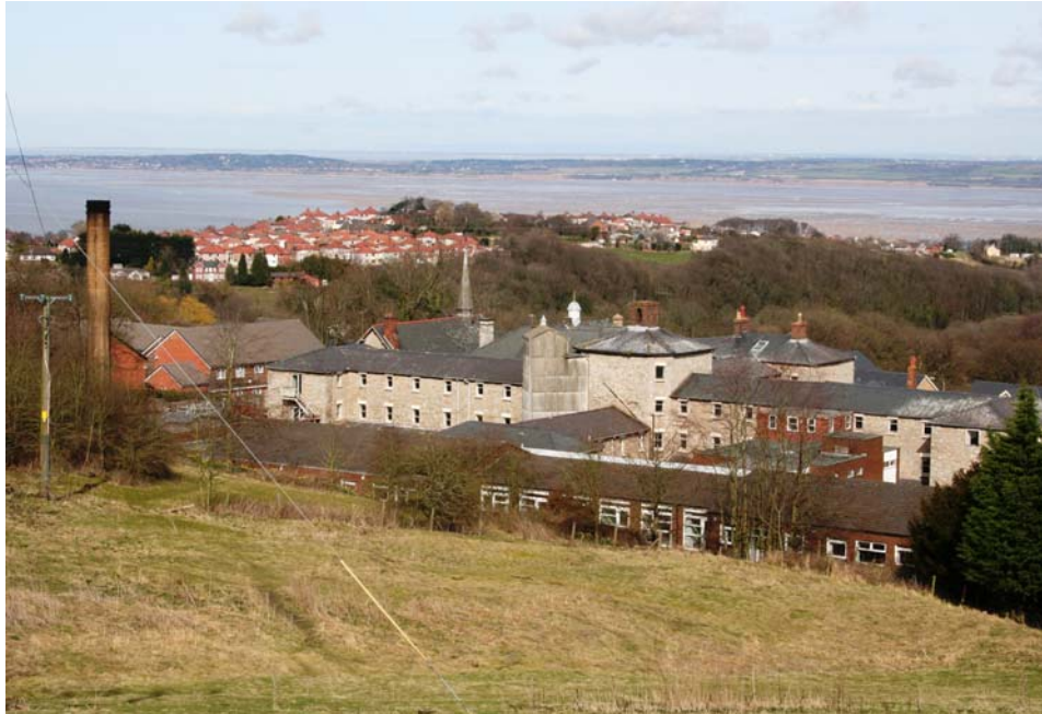
Plate 1 above : Workhouse viewed from the southwest