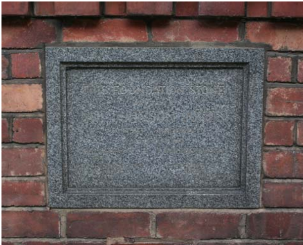
Plate 81 left: Foundation stone