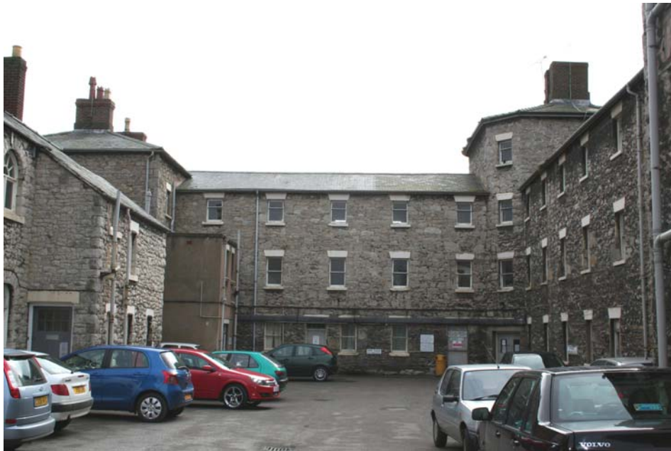
Plate 13 above: View from the north across Chapel Yard