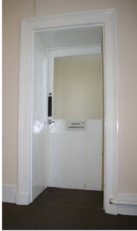
Plate 48: Admin, panelled door