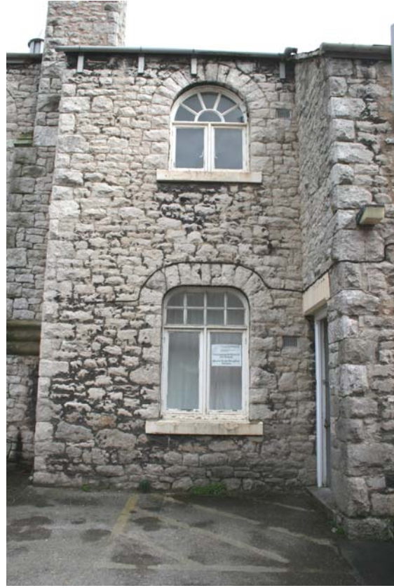
Plate 9 right: 1902 rear window detail