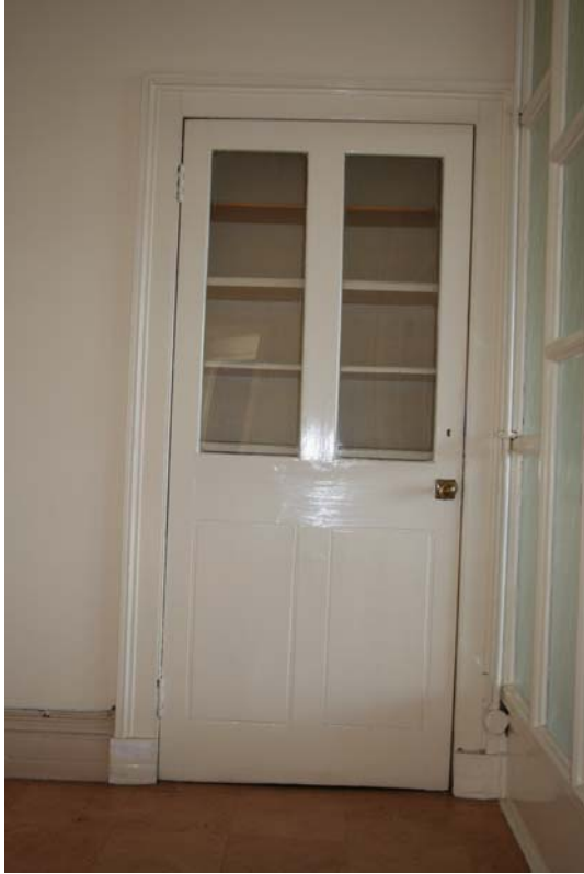
Plate 55: Workhouse first floor, door sample