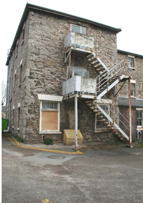
Plate 16 below : Cross wing, as above, view from the west from the northwest yard, known as the Bell Yard