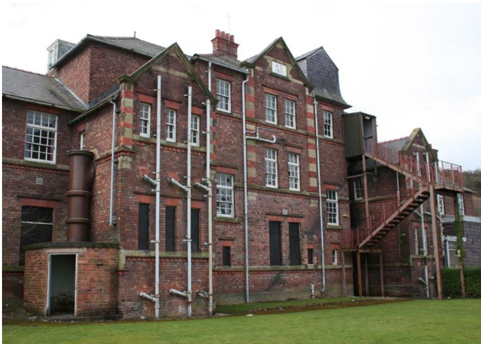
Plate 75 below: Central Block with 1913 datestone