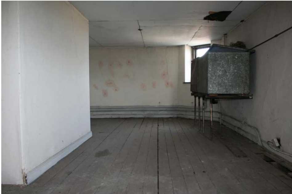
Plate 60 below: Octagon third floor water tanks, view from south