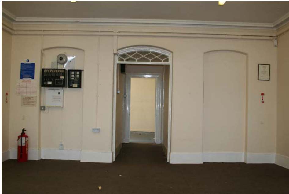
Plate 44 above: The 1838-40 Workhouse Administration Block, entrance hall