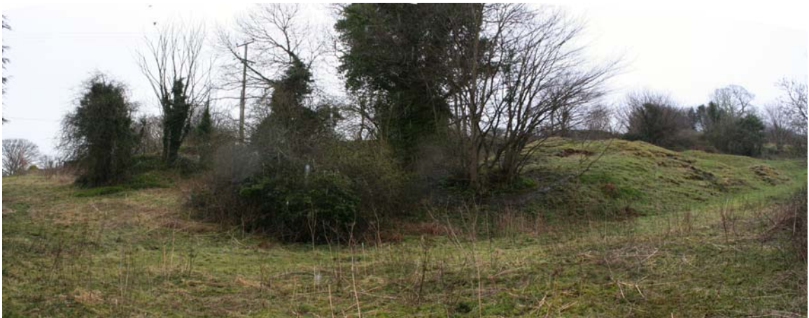
Plate 101 below: Spoil tips viewed from the northeast