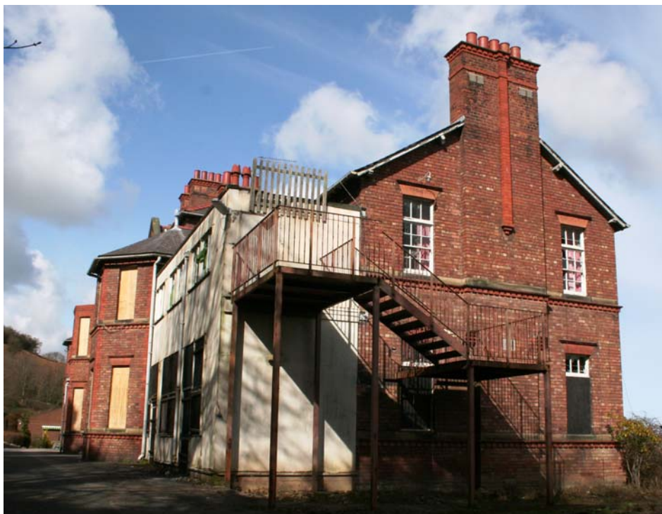
Plate 80 below: South elevation