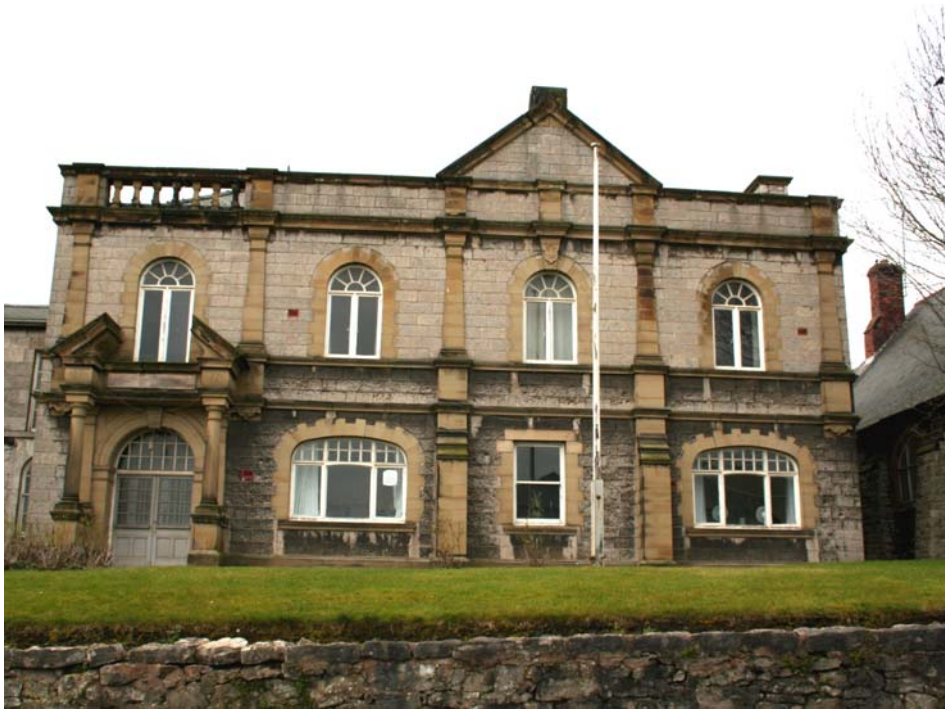
Plate 5 below: 1902 Extension, Nurses' Residence, classical facade