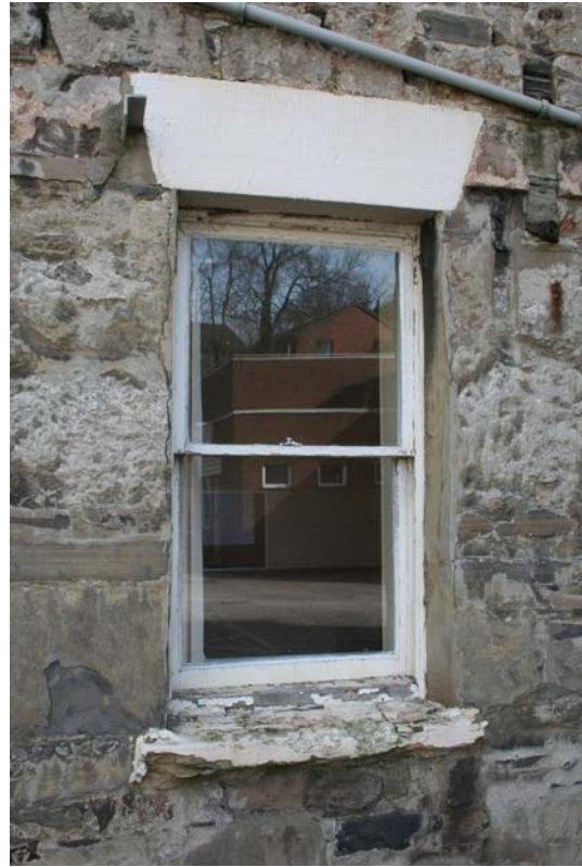
Plate 42 above: Workhouse window sample