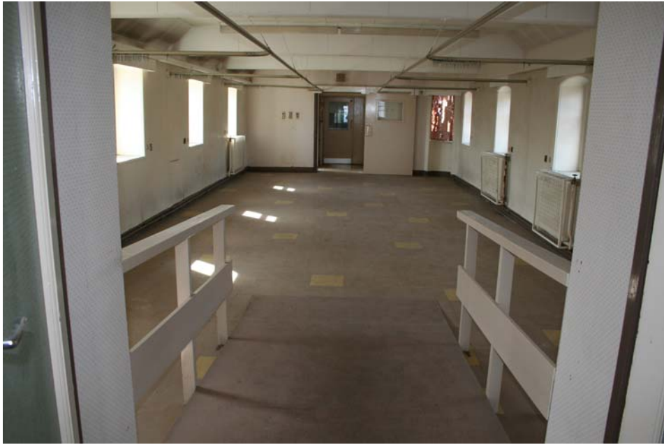
Plate 53 above: Ward 6B, Workhouse second floor, view from the east