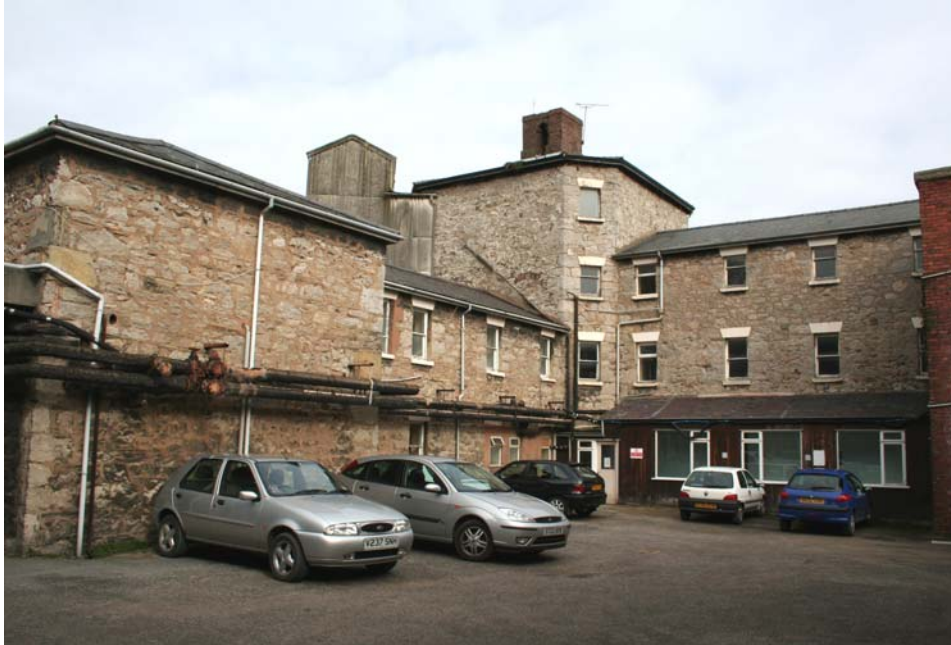
Plate 21 above : Workhouse West and South wings extending from the central octagon