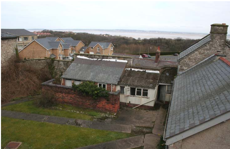
Plate 31 below : Pump Yard with lean-to additions to the ‘curtain wall’ that fronts Old Chester Road