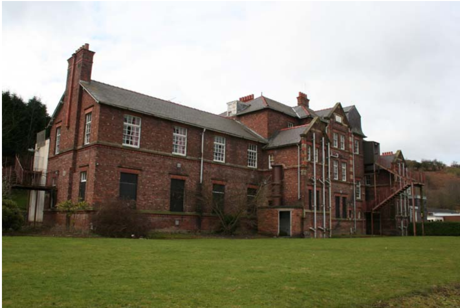
Plate 74 above: Infirmary viewed from Old Chester Road