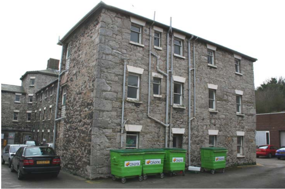
Plate 15 above : Cross wing of the north wing of the workhouse, view from the north