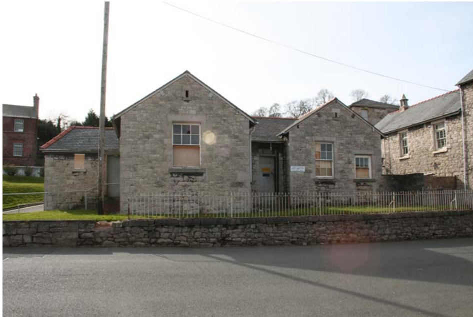
Plate 32 above: View across Old Chester Road towards the hospital works department, part of the former Vagrants' Wards complex