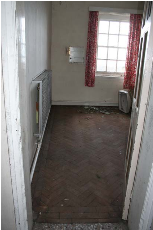
Plate 88: First floor room