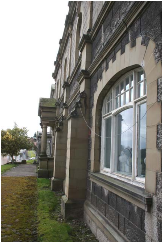
Plate 7 below right: Buttress detail