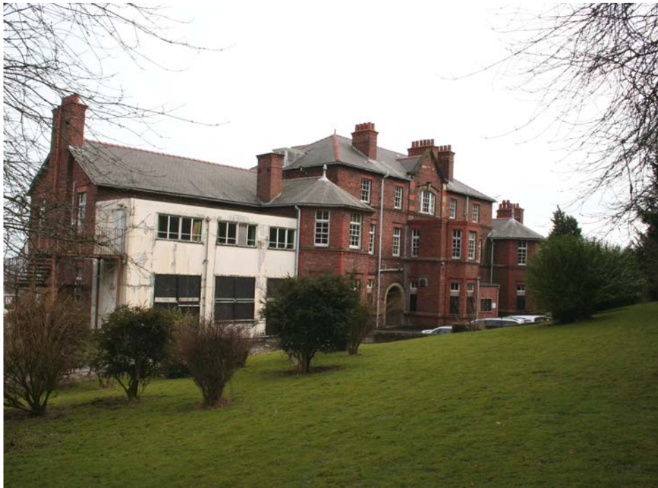
Plate 76 above: Front / west elevation, view from the northwest