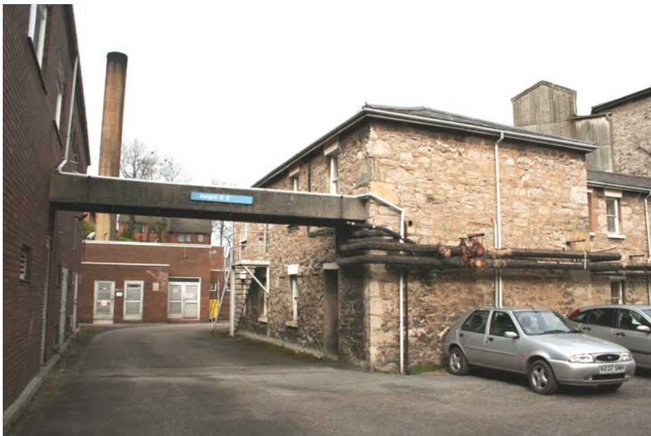
Plate 20 below: As above, south and west elevation with modern buildings and chimney in the background