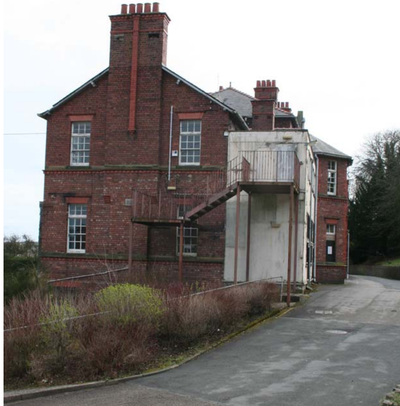
Plate 79 above: North elevation