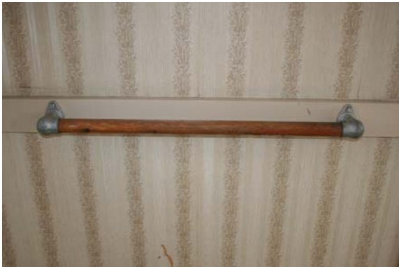
Plate 57: Towel rail fitting