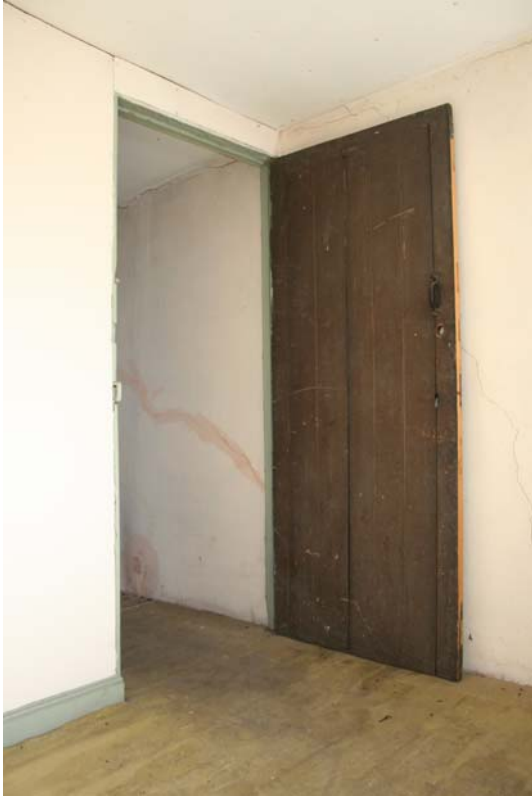
Plate 61: Octagon third floor southwest door