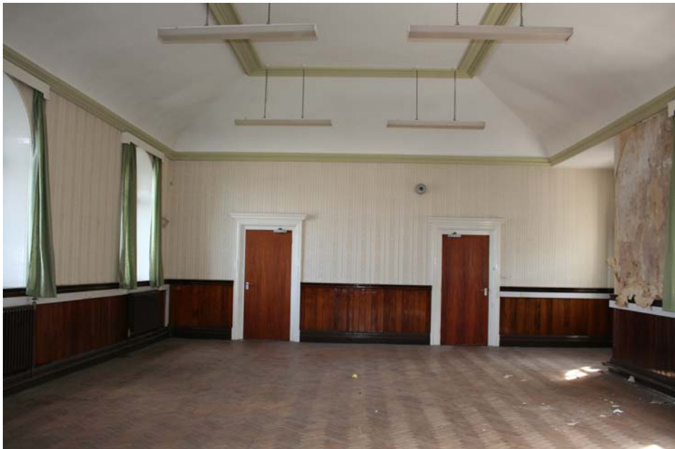
Plate 73 below: as above, view from the north