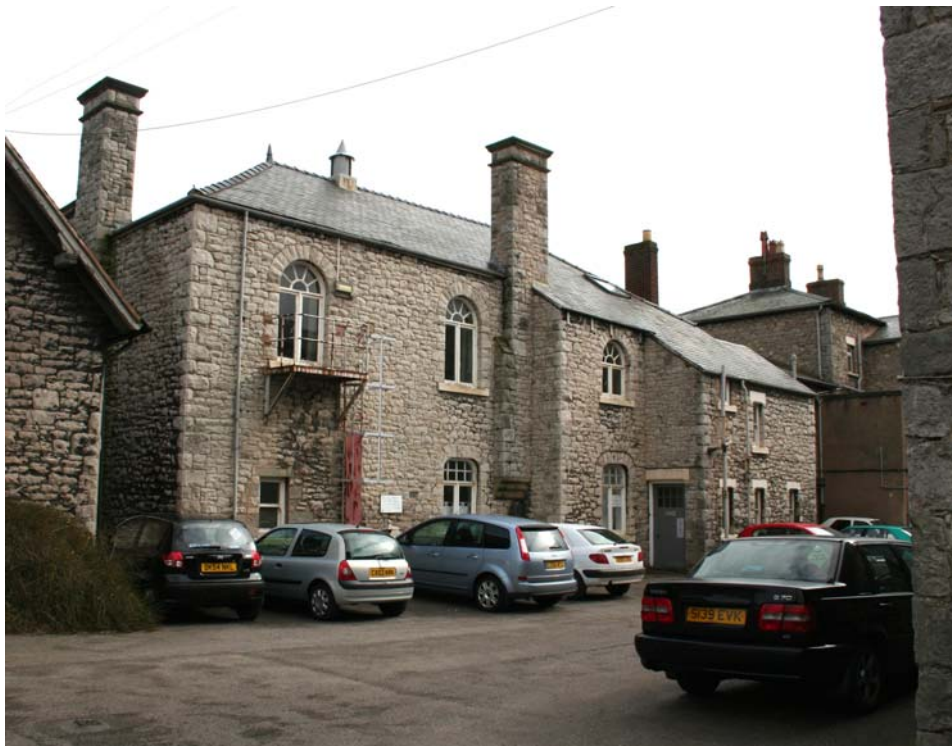
Plate 10 below: 1902 Rear elevation of Nurses' Residence, view across Chapel Yard