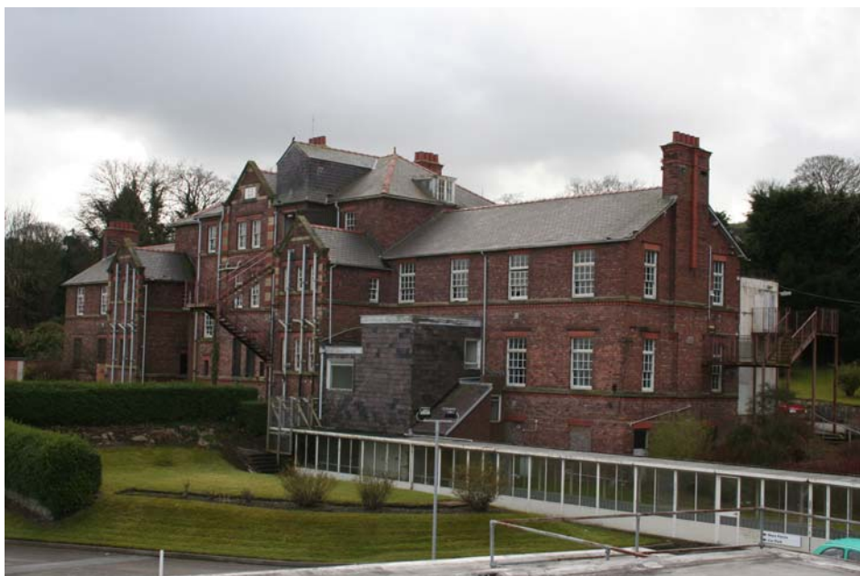
Plate 83 below: Infirmary viewed from the northeast