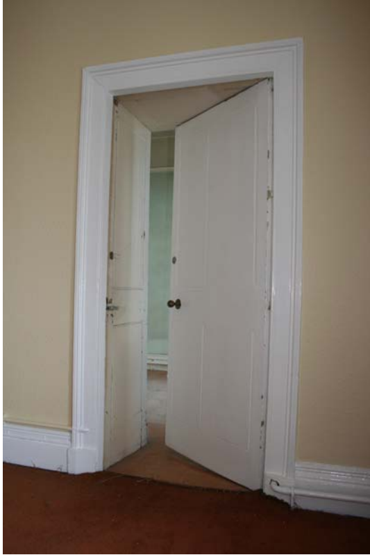
Plate 47: Main hall panelled door to front office