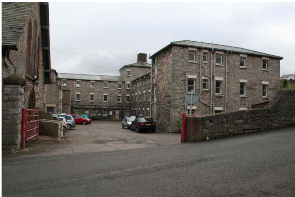
Plate 12 below : Entrance off Brynford Road into Chapel Yard