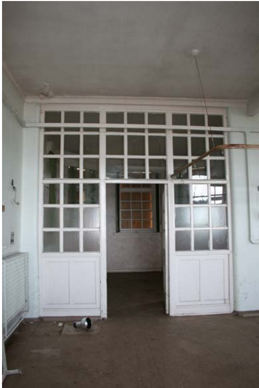
Plate 94 left:

First floor partition between main ward and the single ward in the octagonal bay