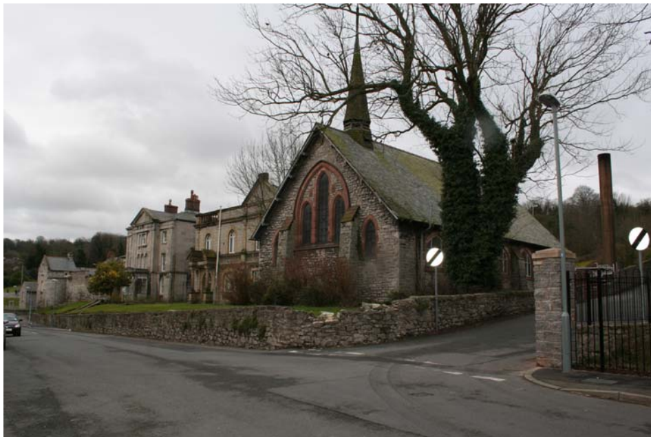
Plate 2 below : Llesty frontage, view from the north towards the 1884 Chapel, the 1902 building and the main block of Holywell Union Workhouse built 1838-40.