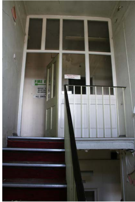
Plate 84 & Plate 85 above: Staircase from ground to first floor