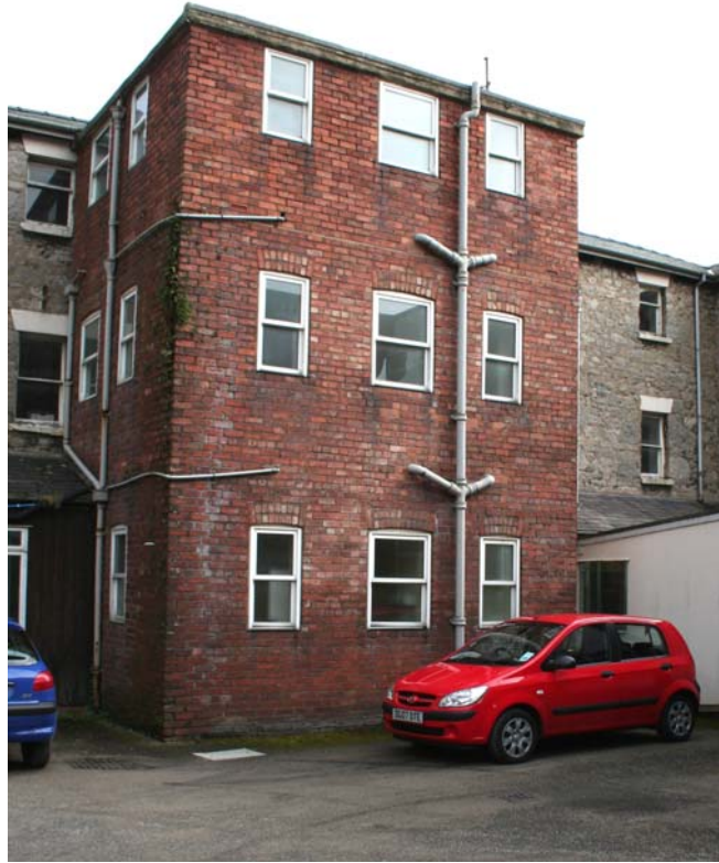
Plate 23 above: Toilet / bathroom addition to the west elevation of the Workhouse south wing