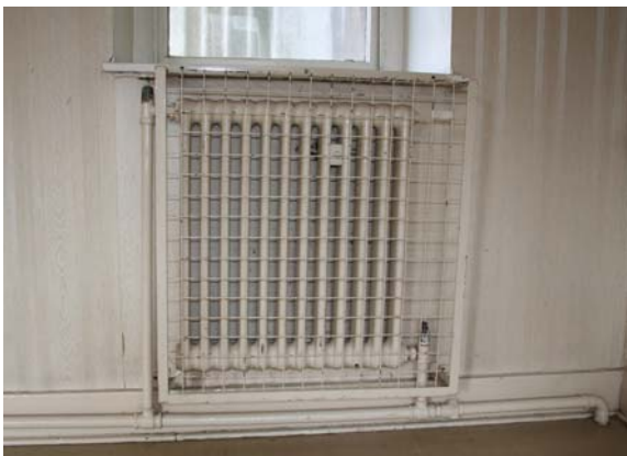
Plate 58: Radiator sample