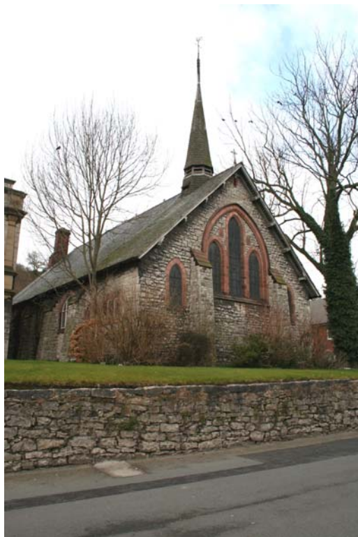
Plate 38 above: Chapel east elevation