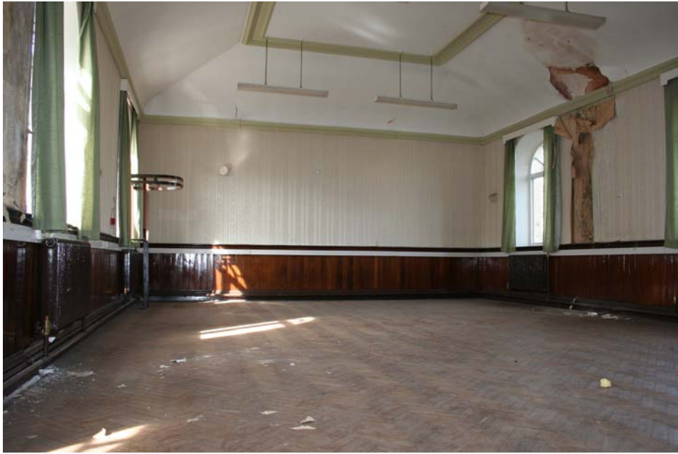
Plate 72 above: Nurses' Residence function room, view from the south