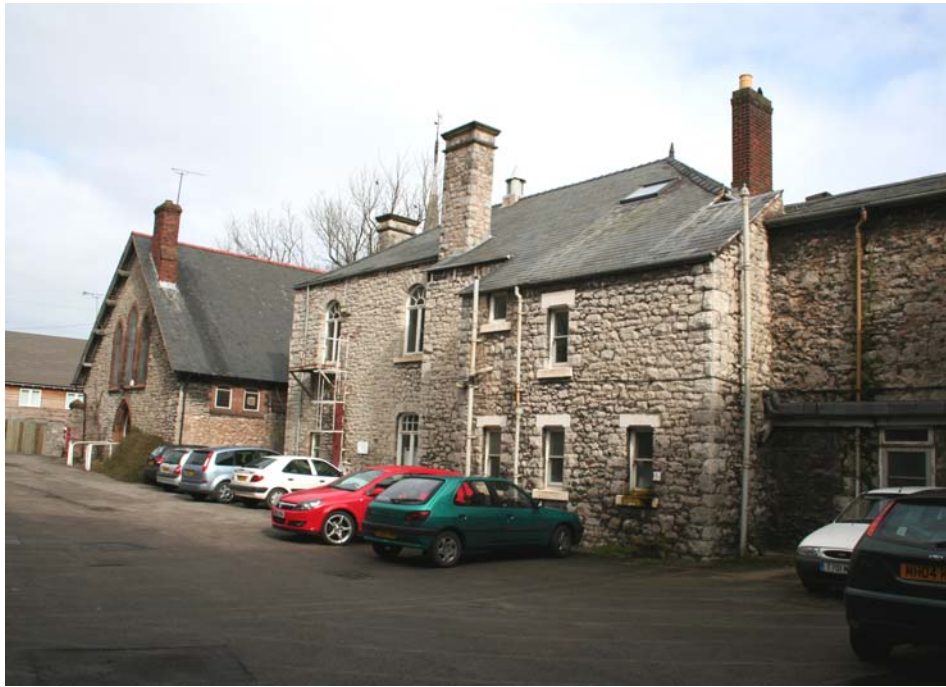
Plate 11 above : View across Chapel Yard towards the rear of the Nurses' Residence and the 1884 Chapel