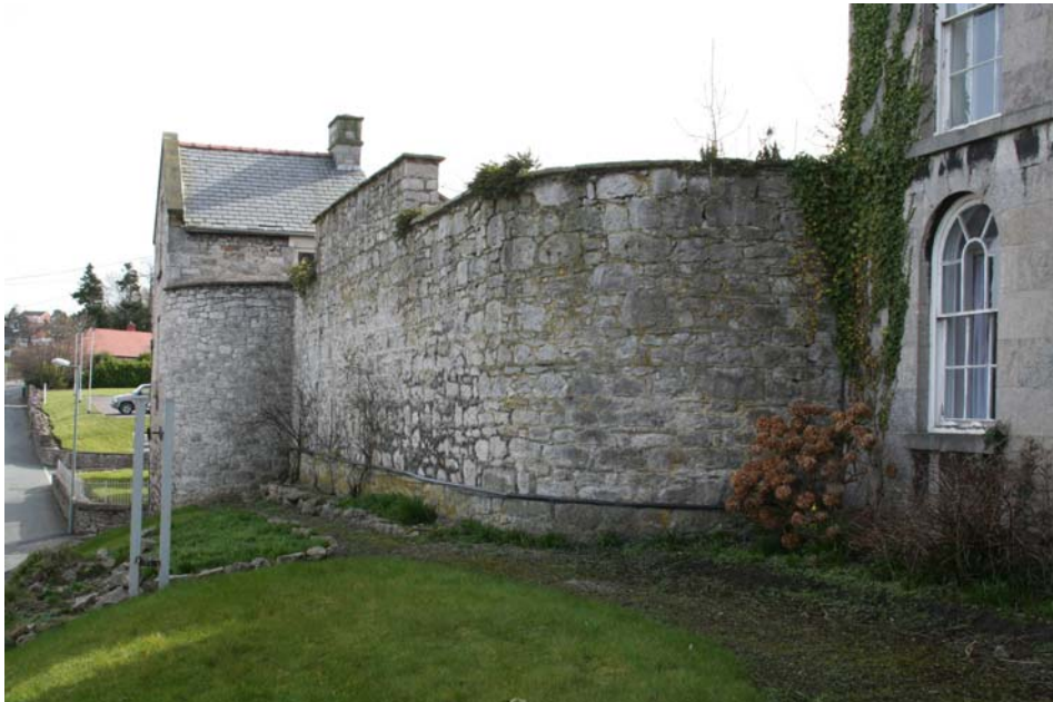
Plate 36 below : Enclosing east wall of the Pump Yard, connecting the main Administration Block to the Assistant Master's House