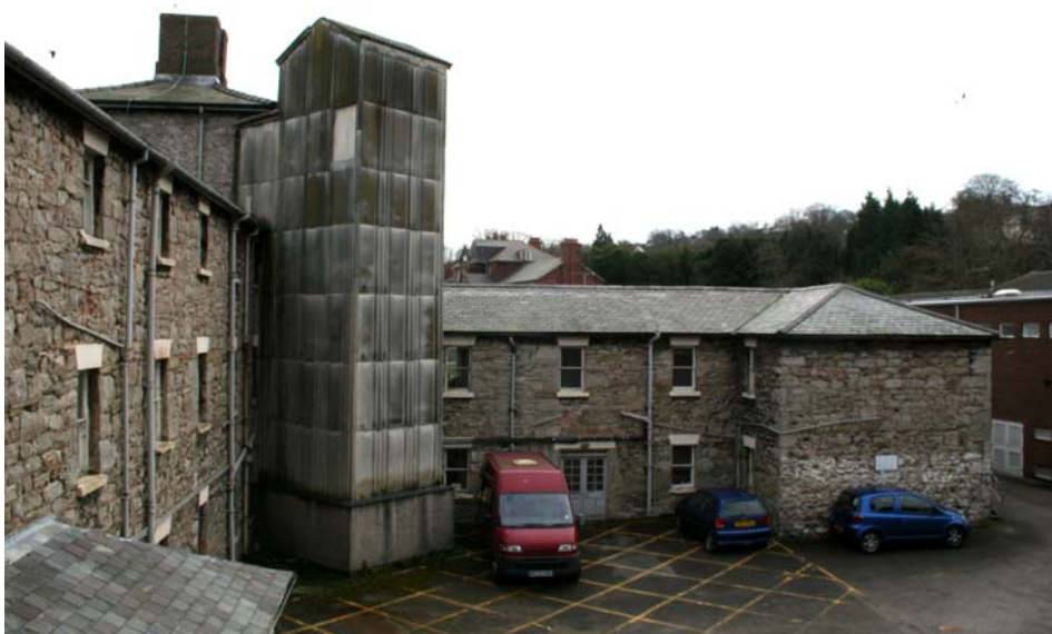
Plate 18 below: Bell Yard and the north elevation of the west wing