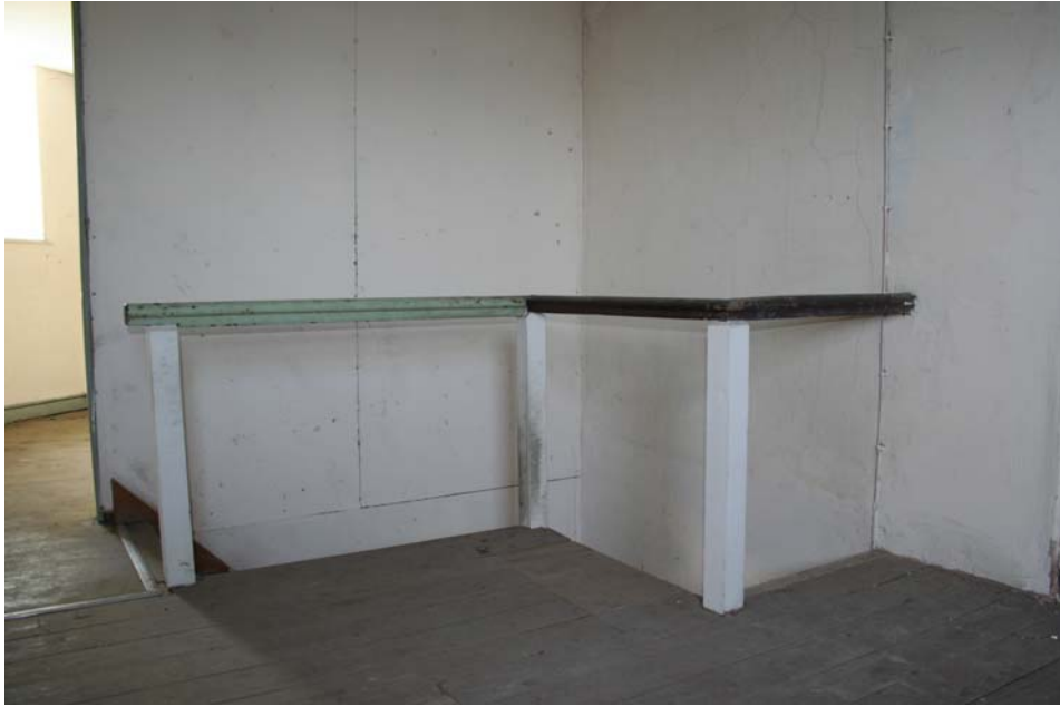
Plate 59 above: Octagon top / third floor; handrail at top of wooden dog-leg steps