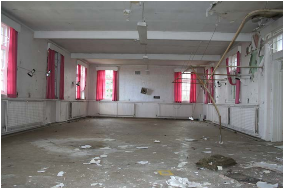
Plate 93 below : First floor south ward