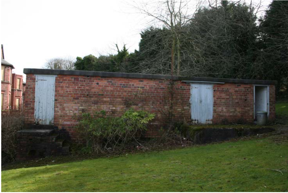
Plate 97 above: Single storey building / stores located northwest of the Infirmary