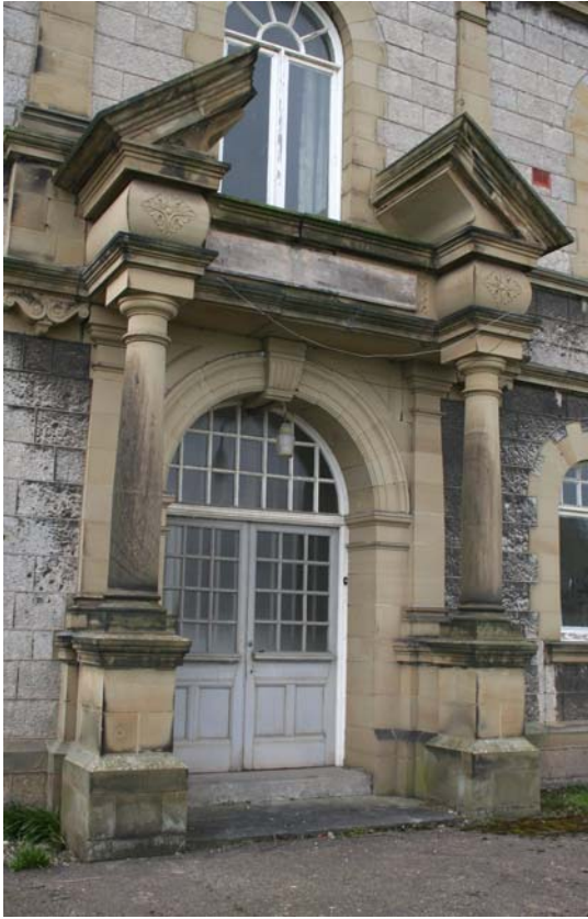
Plate 8 left: 1902 open pedimented porch