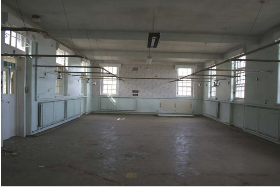
Plate 92 above : First floor north ward