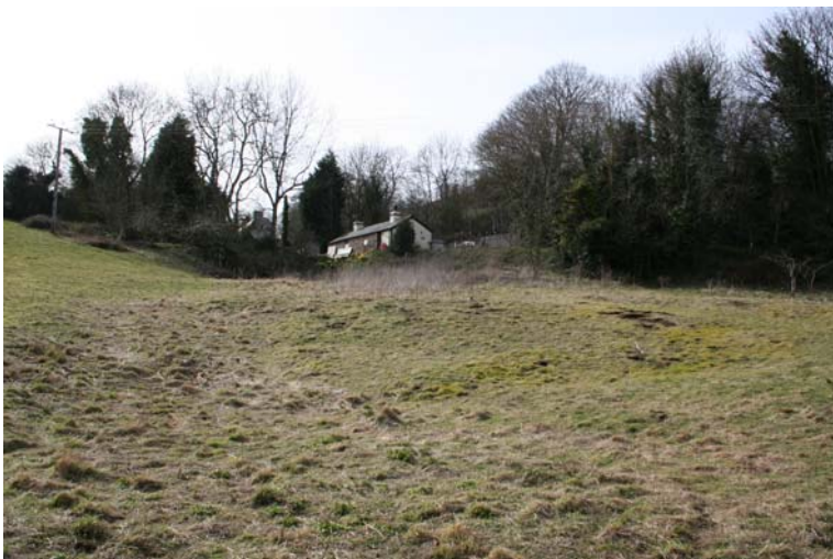
Plate 99 left: View from the northeast