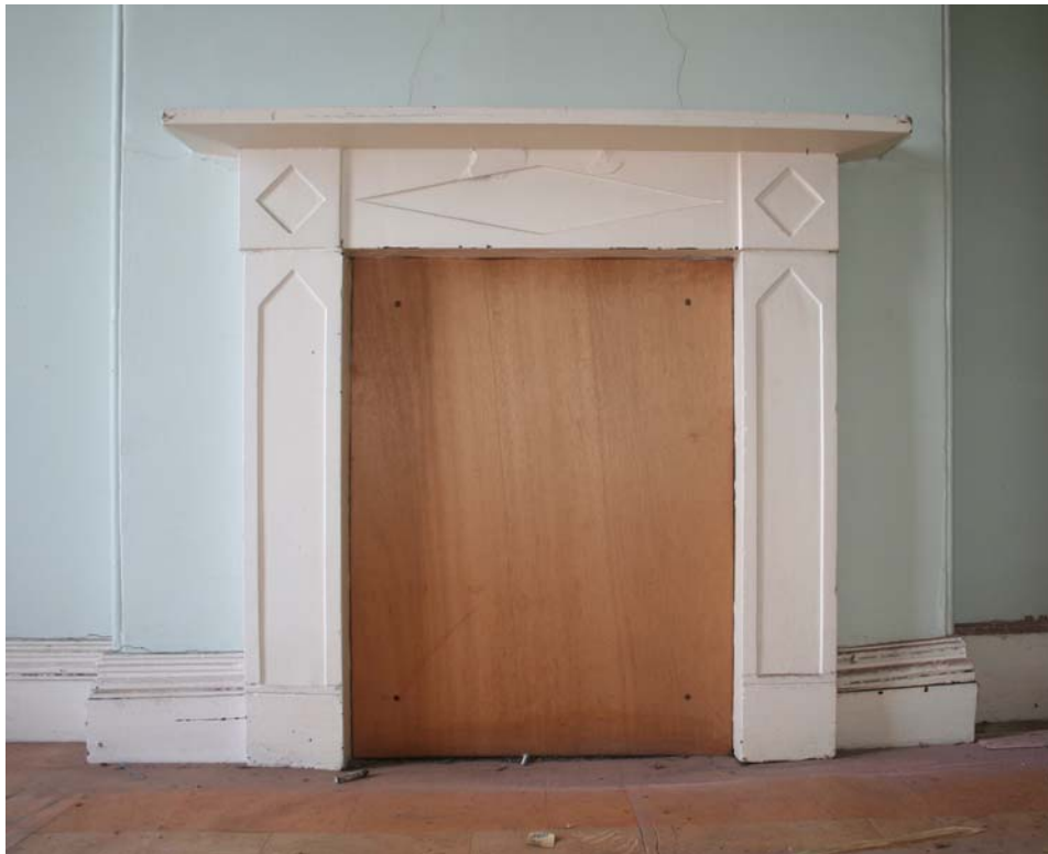
Plate 49 below: Front office fireplace