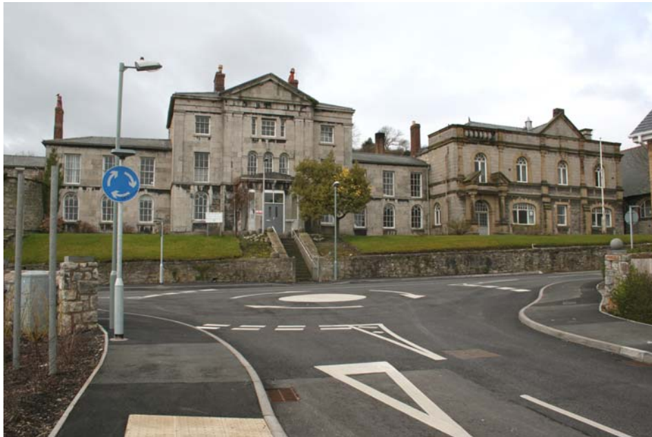
Plate 3 above: Holywell Union Workhouse façade built 1838-40 and the 1902 Nurses' Residence on the right. View from the northeast