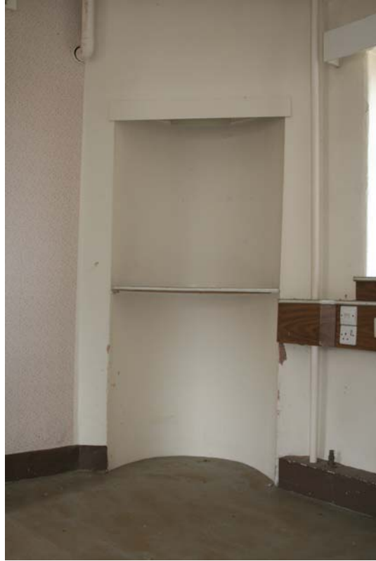
Plate 56: Ward 6B, second floor, former fireplace