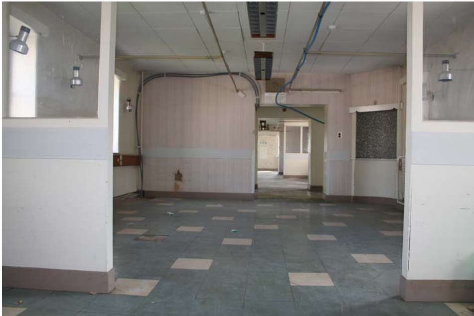
Plate 54 below: Ward 6A, Workhouse second floor, view from the south