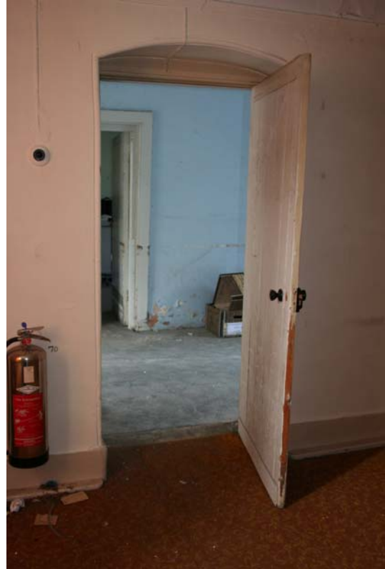
Plate 62: Workhouse north wing, ground floor