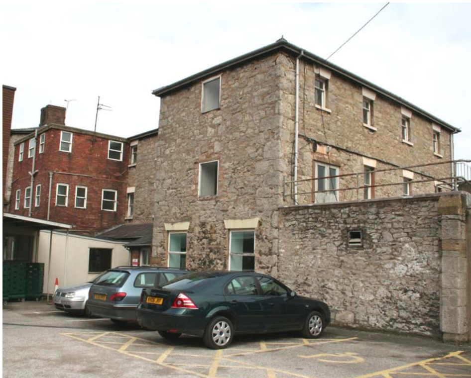
Plate 24 below: Cross wing of the Workhouse south wing