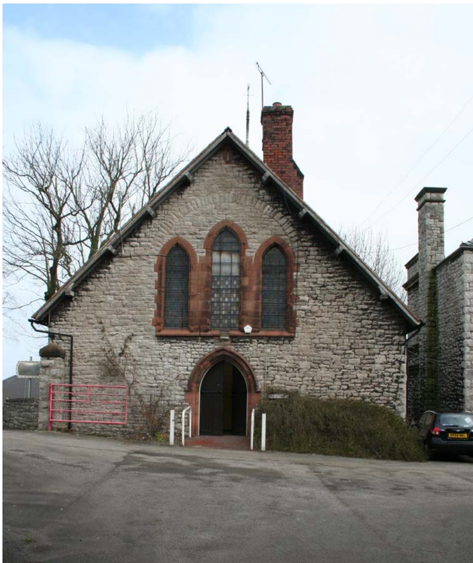
Plate 37: The 1884 Chapel designed by John Douglas, west elevation