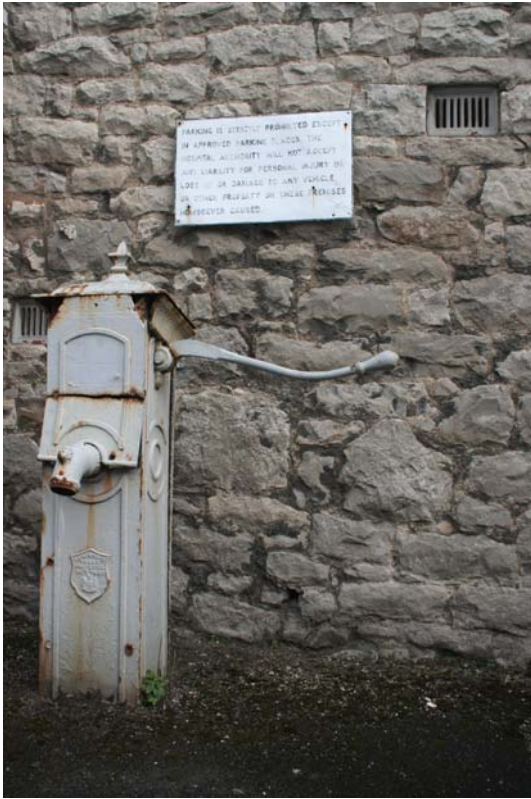
Plate 41 above: Chapel Yard Pump