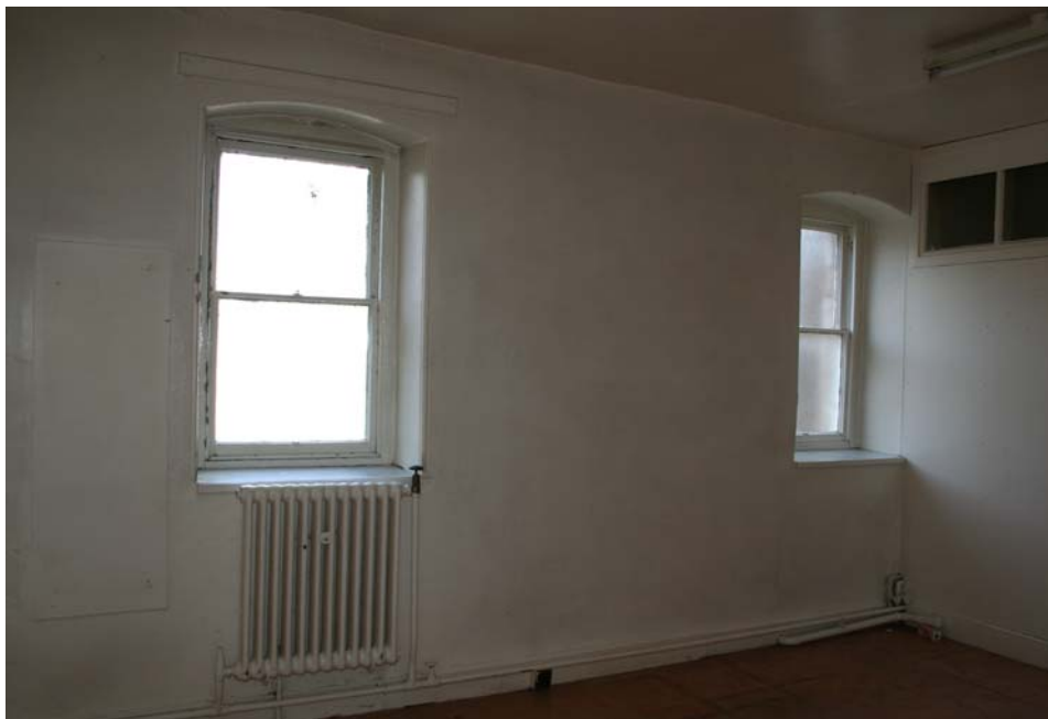
Plate 52 below: Workhouse, small room sample