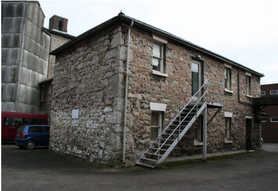
Plate 19 above: Cross wing of the Workhouse west wing, north and west elevation