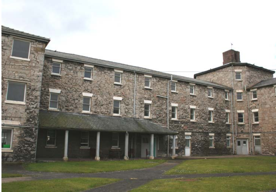
Plate 30 above : East elevation of the Workhouse south wing extending south from the Octagon