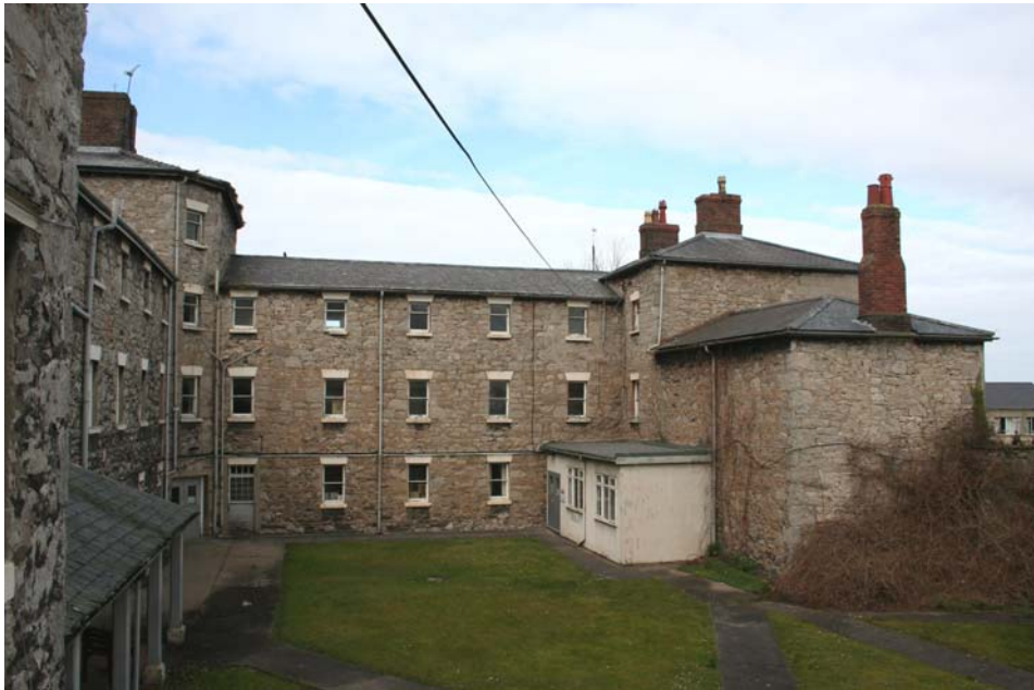
Plate 26 below: View over the Pump Yard towards the east wing that connects the Octagon to the Administration Block