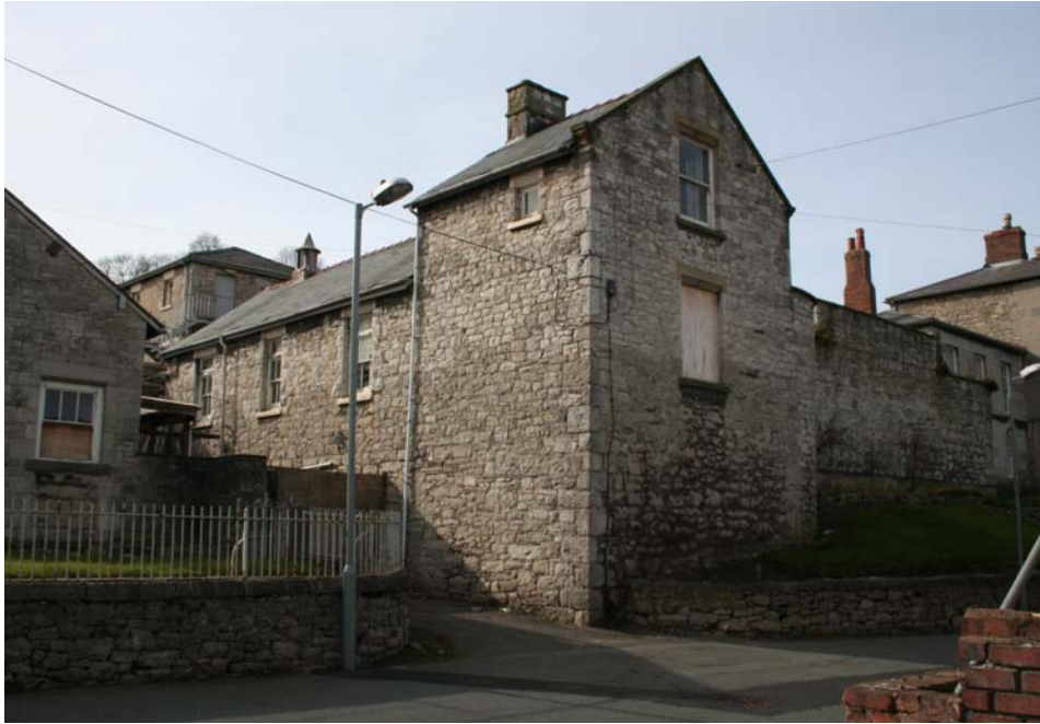
Plate 35 above : Former hospital Pharmacy building, previously the Assistant Master's House