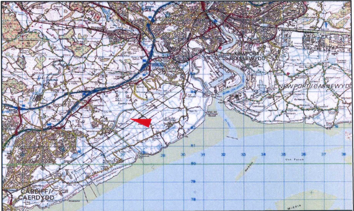
Figure 1: Marshfield AGI ST26738244