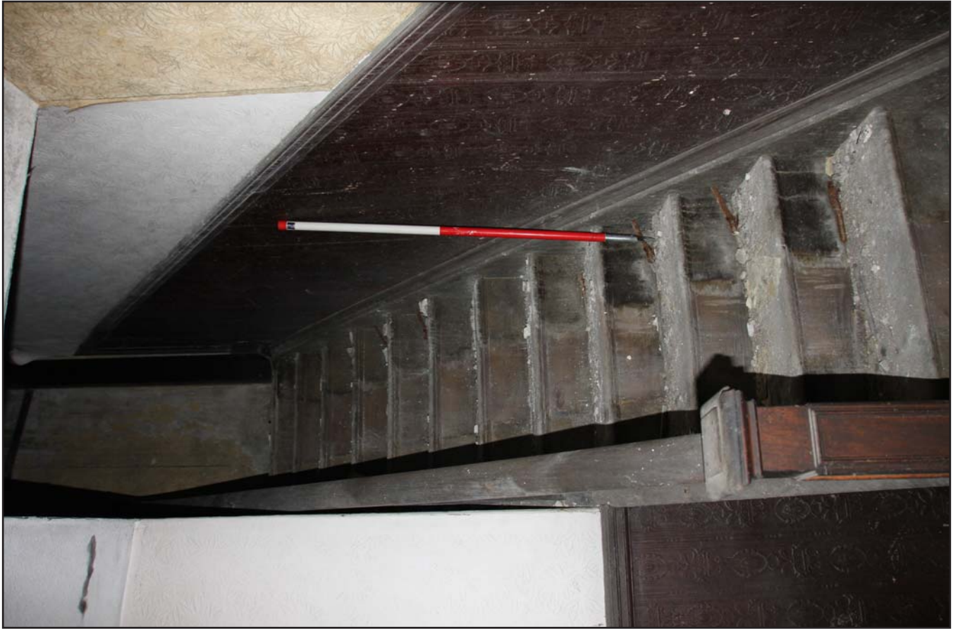
Plate 23: Stair well 2 within 19th Century phase, from the south. Scale 1.0m.