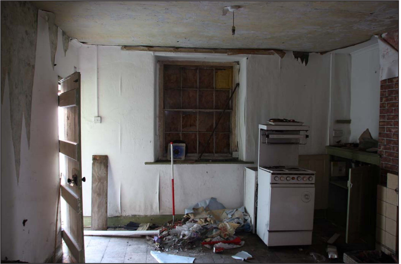
Plate 09: Living room 1 within 19th Century phase, from the east. Scale 1.0m.