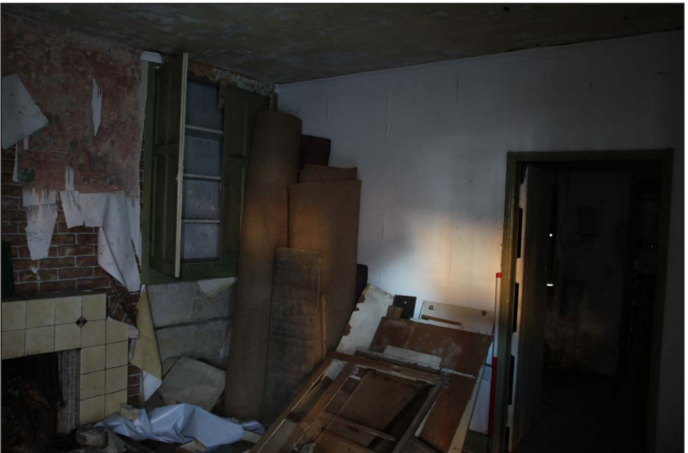
Plate 08: Living room 1 within 19th Century phase, from the southwest. Scale 1.0m.