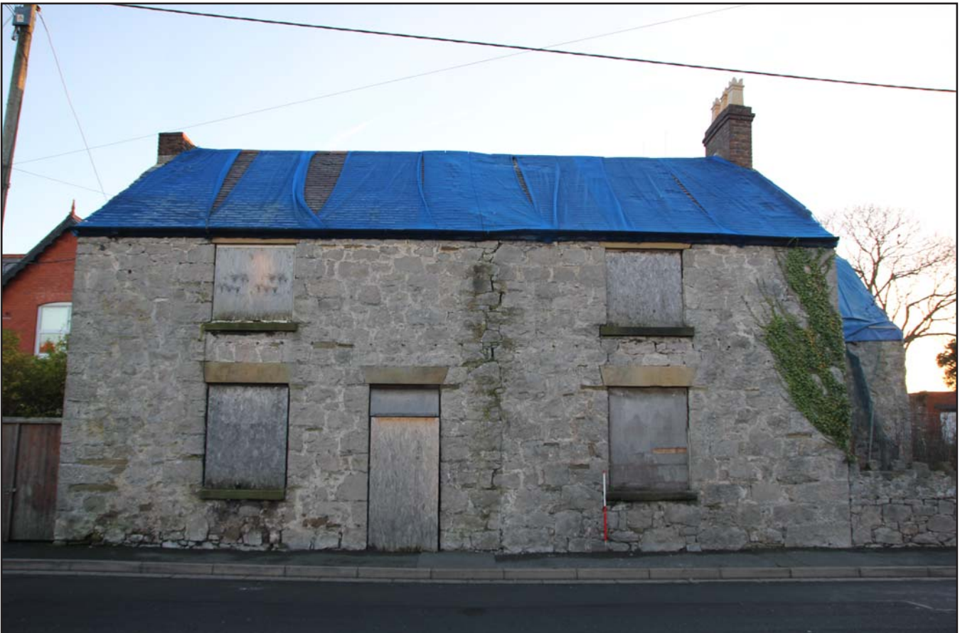
Plate 06: West facing principle external elevation, from the west. Scale 1.0m.