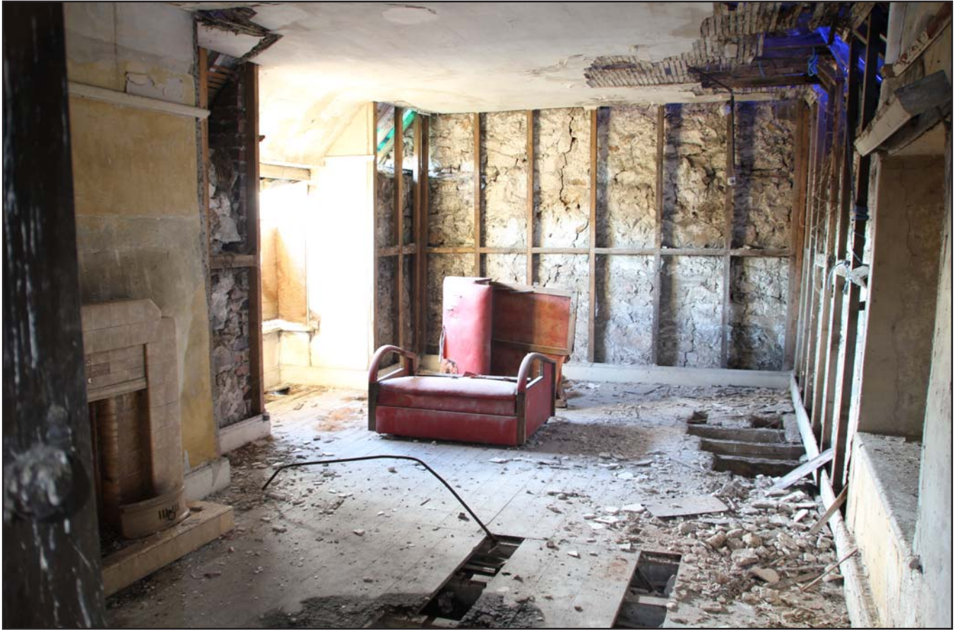
Plate 35: Living room in 17th Century phase, from the west (No scale due to dangerous floor).