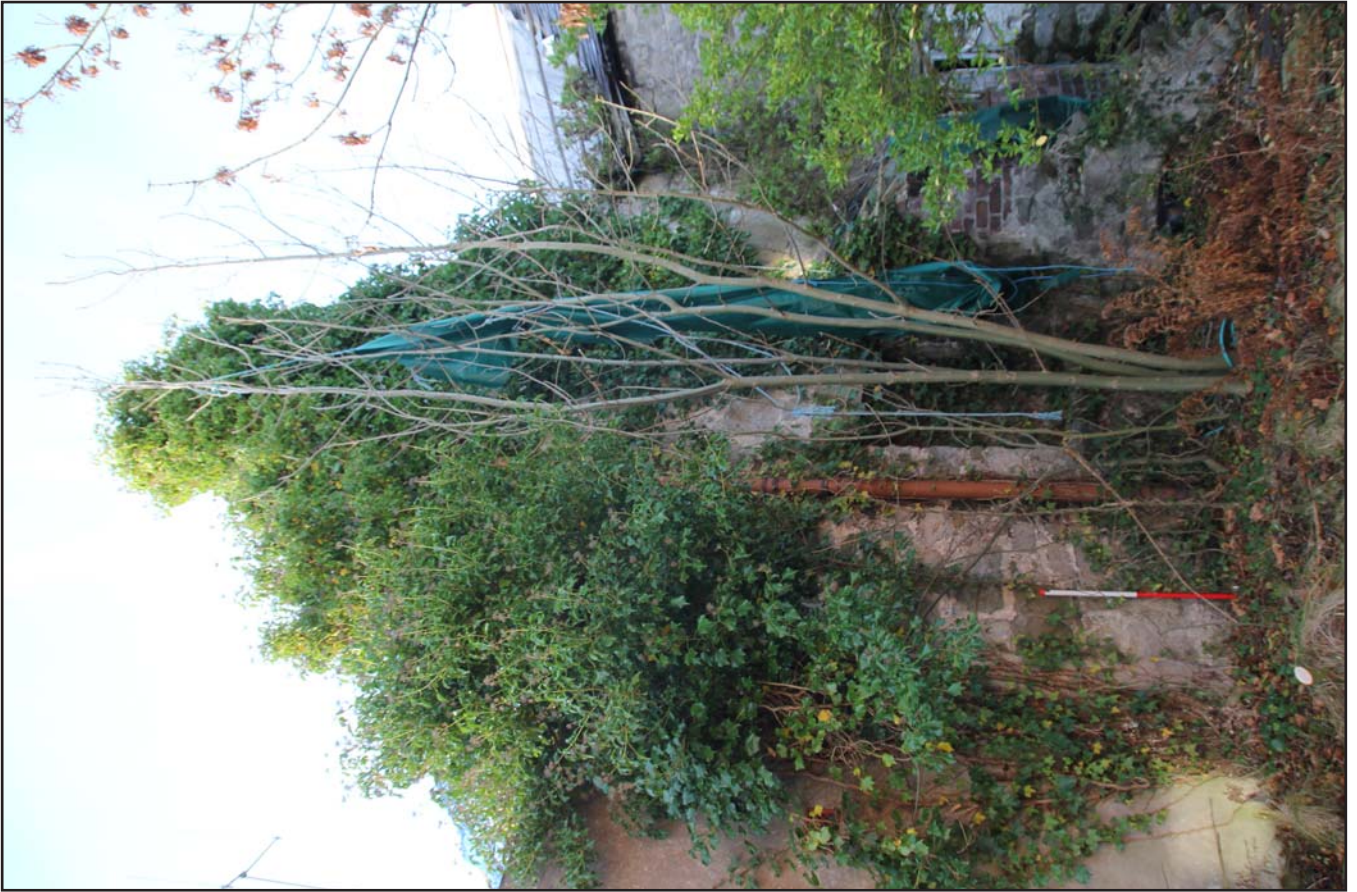
Plate 25: North facing external elevation, from the northeast. Scale 1.0m.