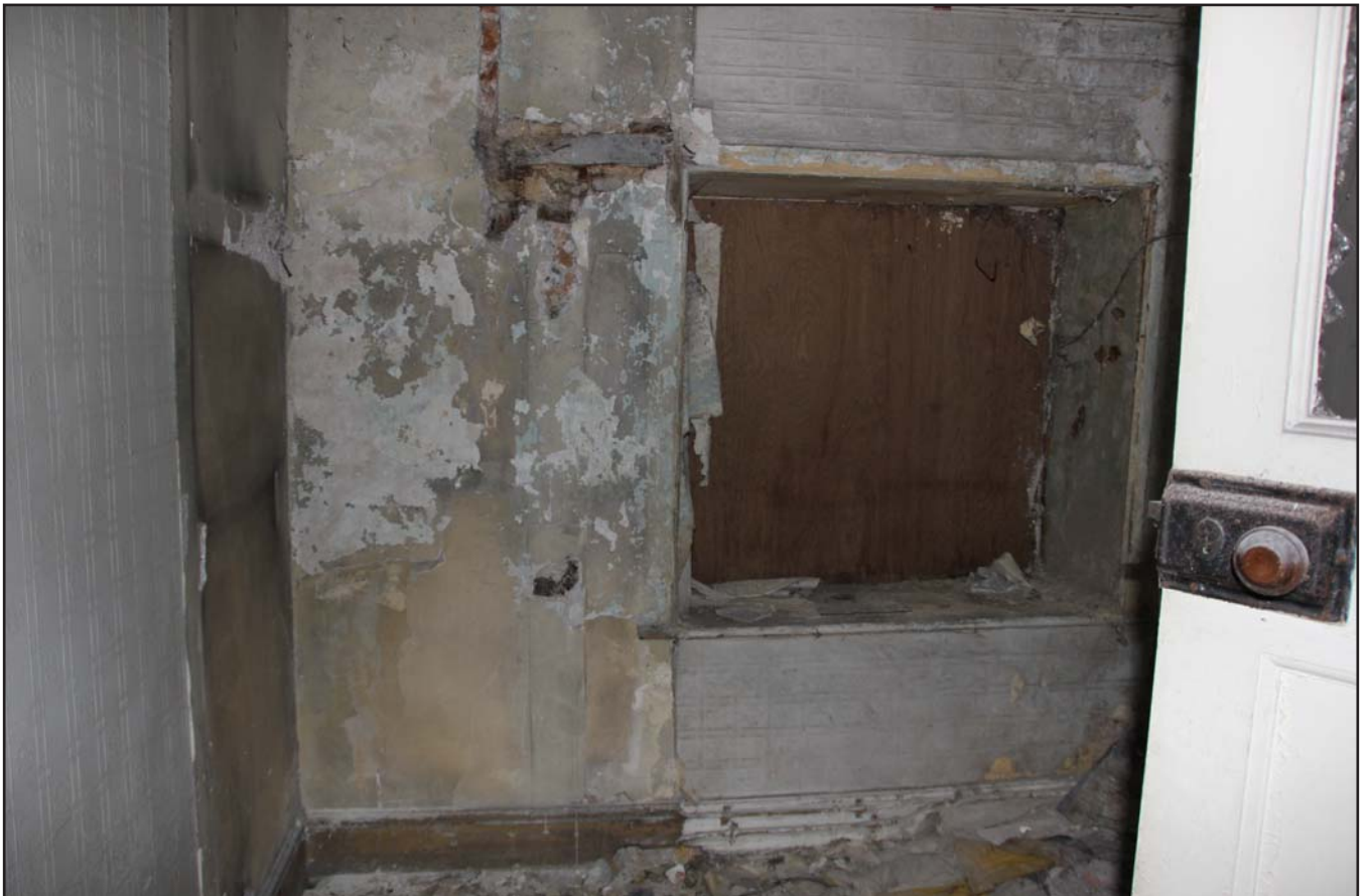
Plate 34: Bedroom 5 in 17th Century phase, from the south (No scale due to dangerous floor).