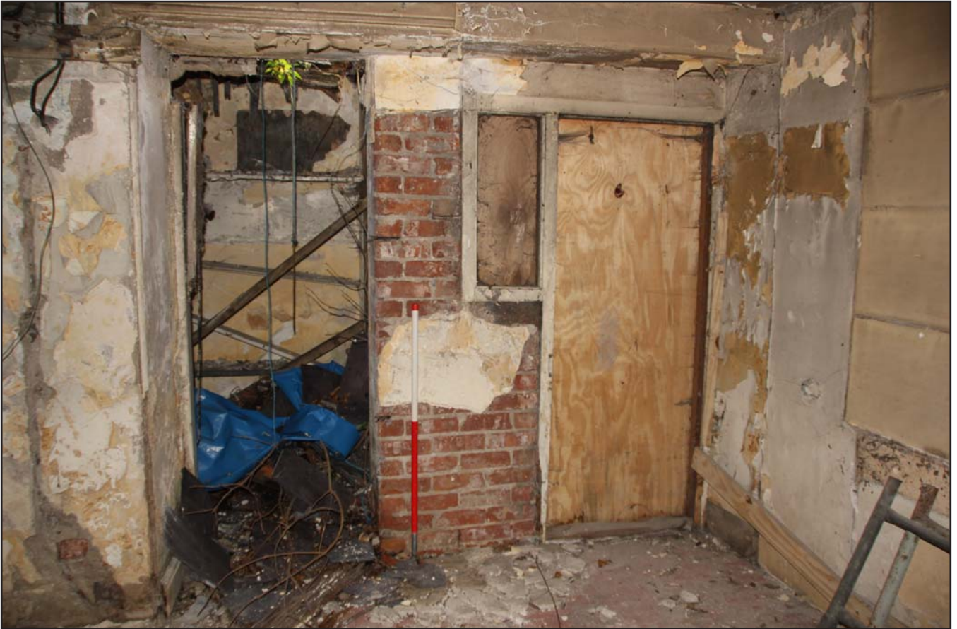
Plate 17: Parlour within 17th Century phase, from the west. Scale 1.0m.