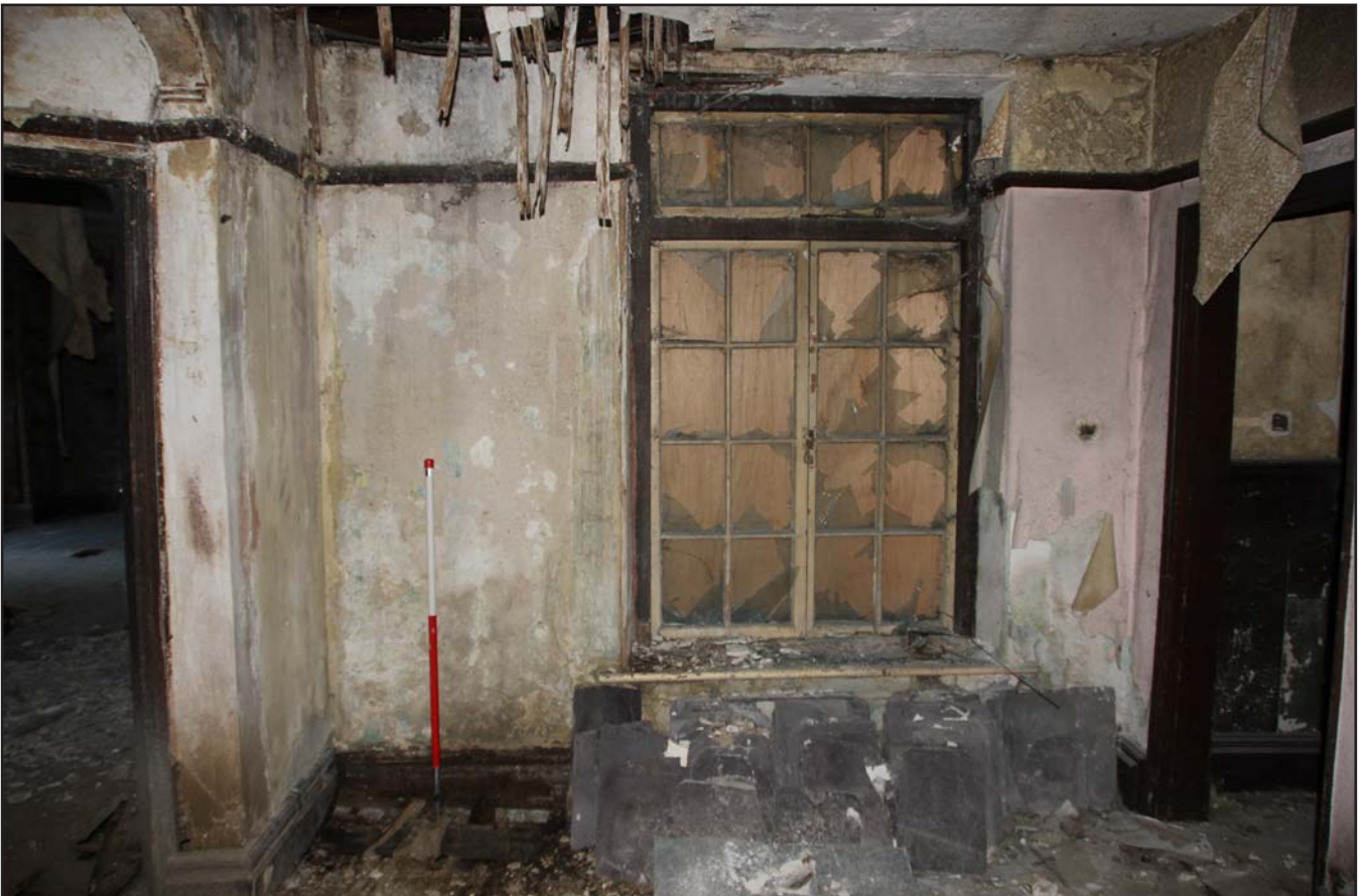
Plate 22: Parlour within 19th Century phase, from the north. Scale 1.0m.