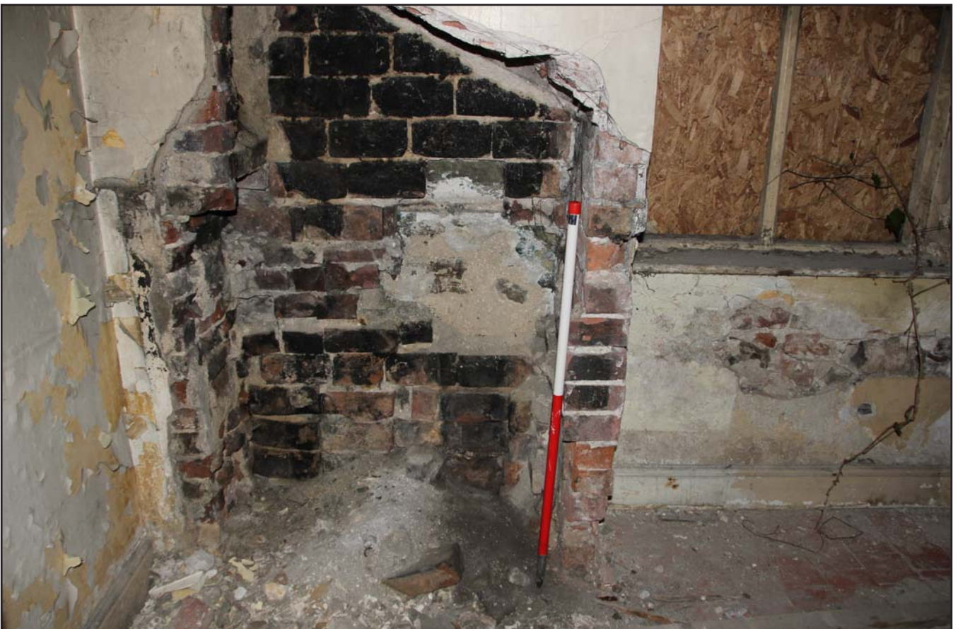
Plate 18: Parlour within 17th Century phase showing fireplace, from the south. Scale 1.0m.