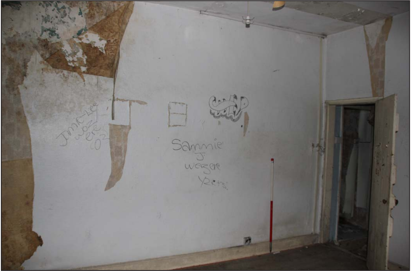
Plate 27: Bedroom 1 in 19th Century phase, from the southwest. Scale 1.0m.