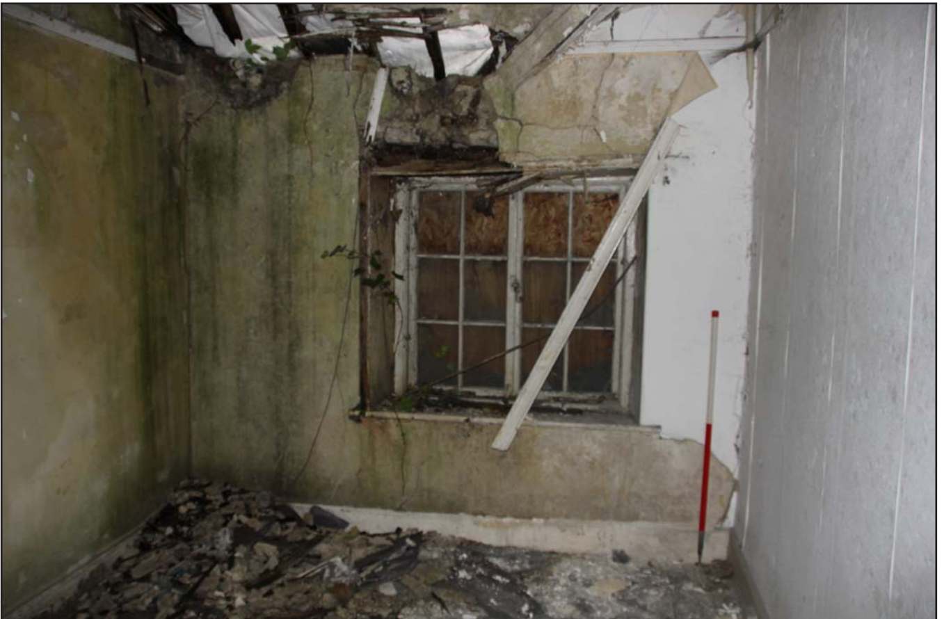
Plate 32: Bedroom 4 in 19th Century phase, from the west. Scale 1.0m.