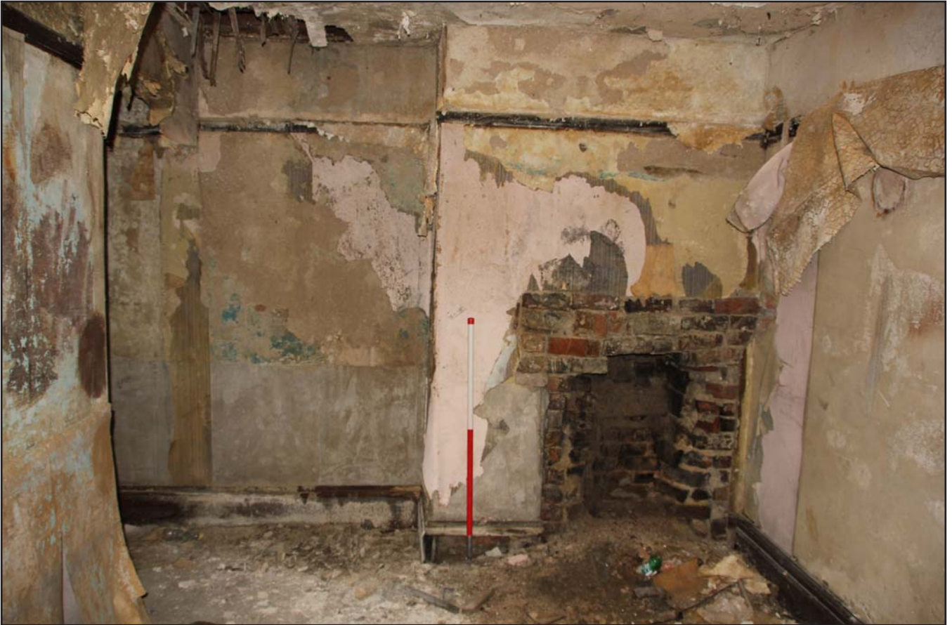
Plate 19: Parlour within 19th Century phase, from the south. Scale 1.0m.