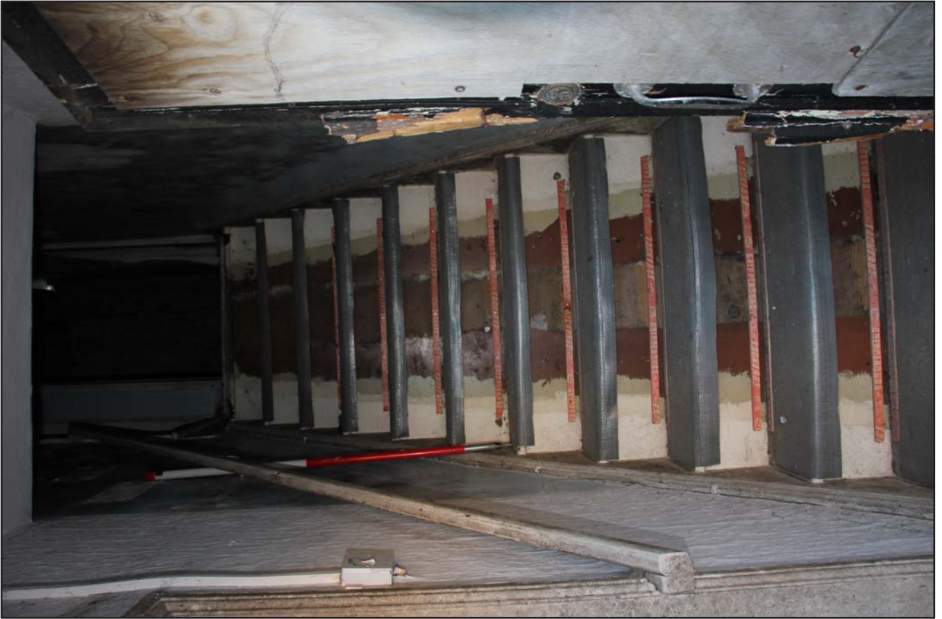
Plate 13: Stair well within 19th Century phase, from the west. Scale 1.0m.