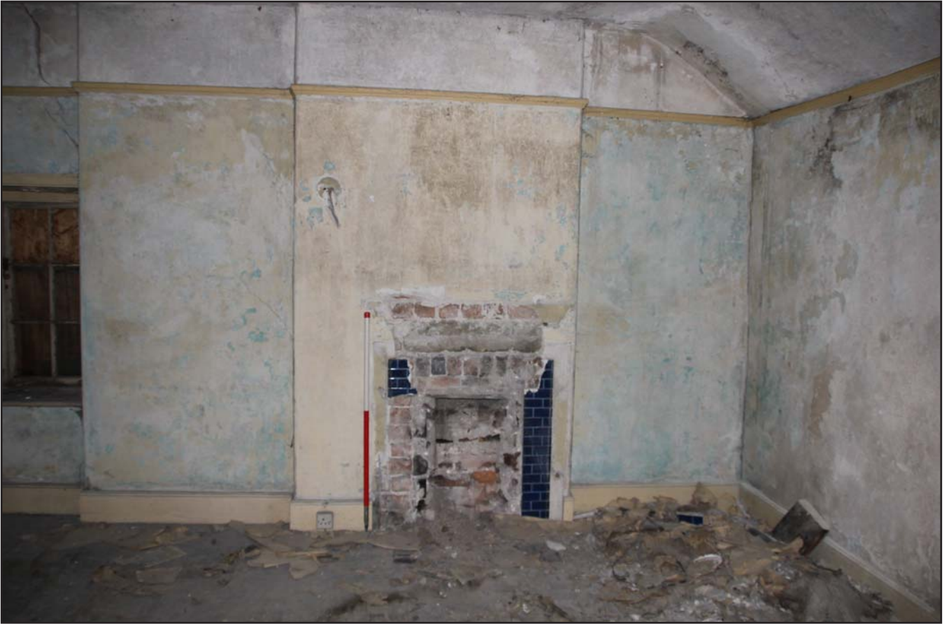
Plate 29: Bedroom 3 in 19th Century phase, from the west. Scale 1.0m.