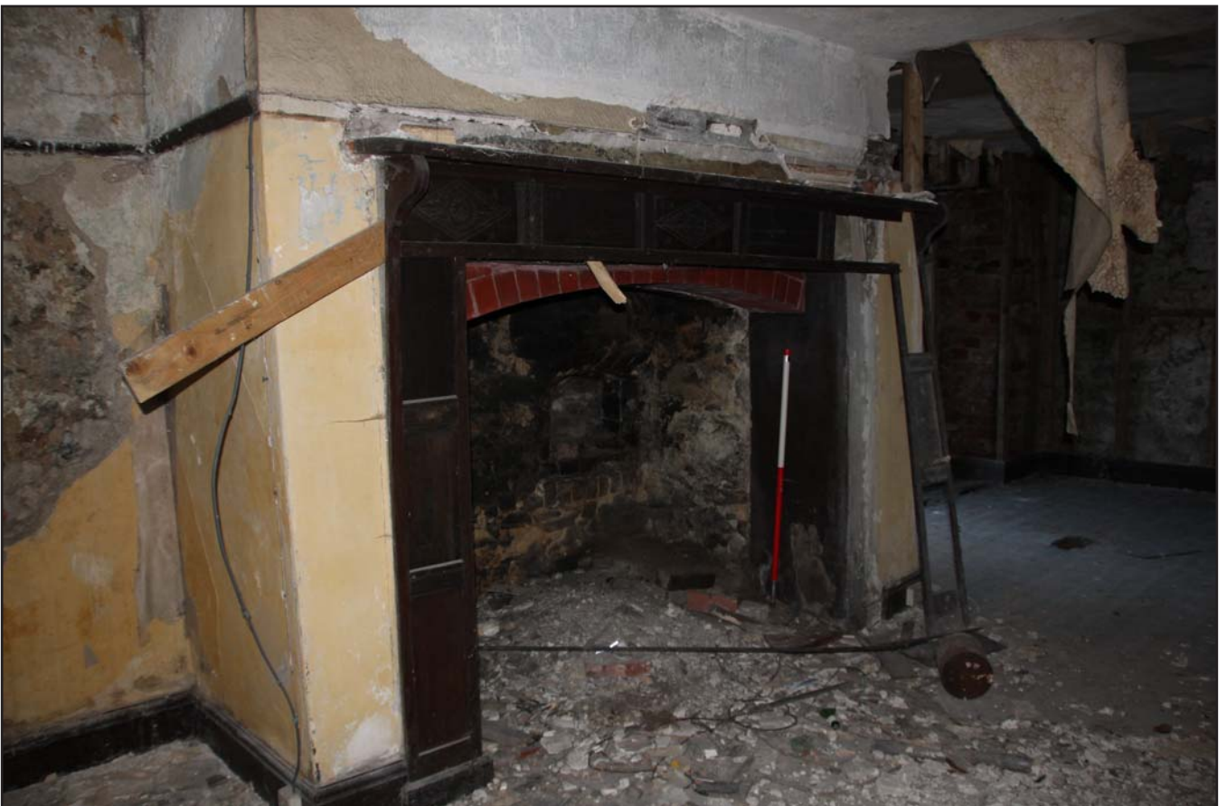
Plate 16: Hall within 17th Century phase showing fireplace, from the northwest. Scale 1.0m.