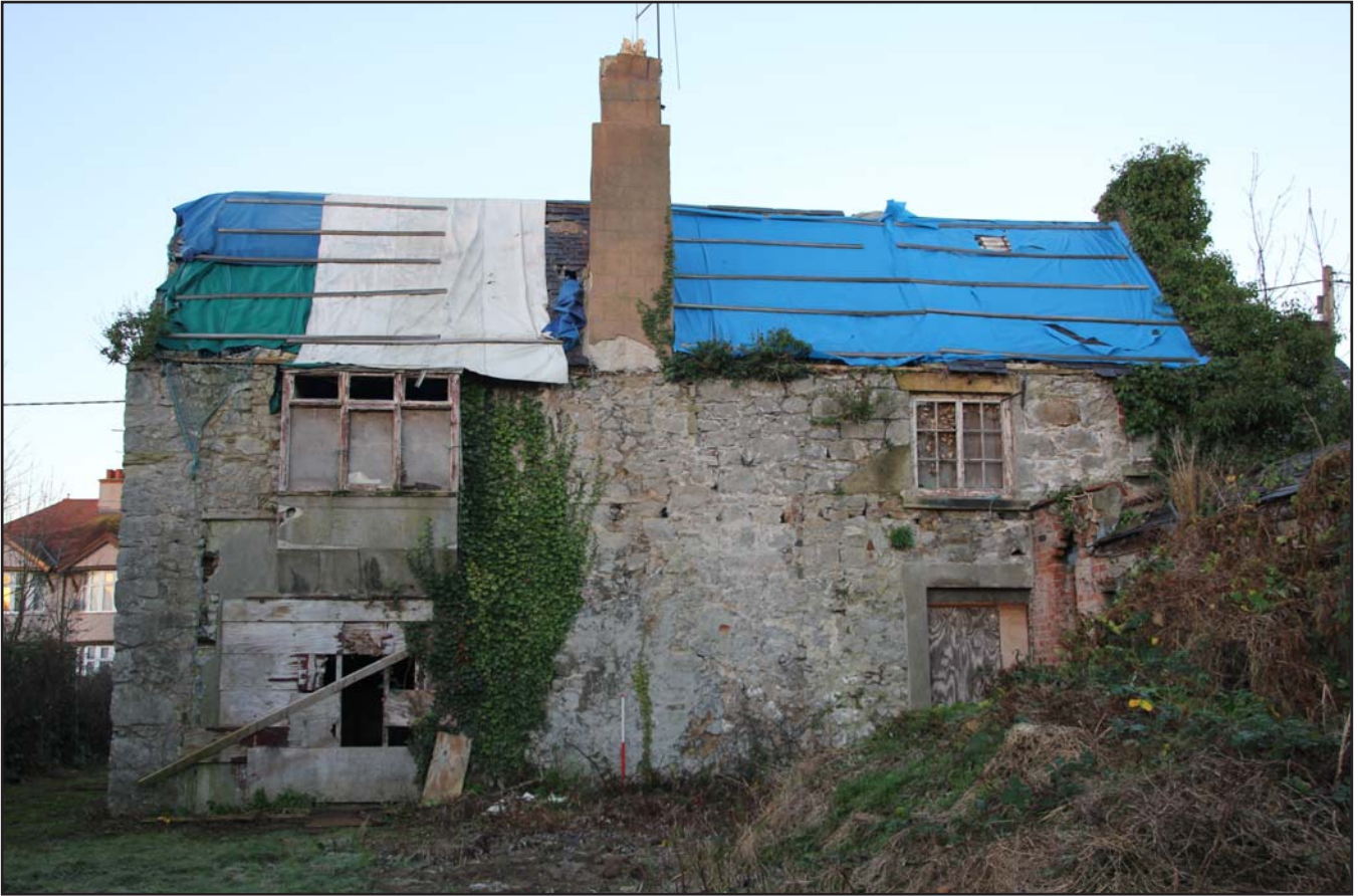
Plate 01: East facing external elevation, from the east. Scale 1.0m.