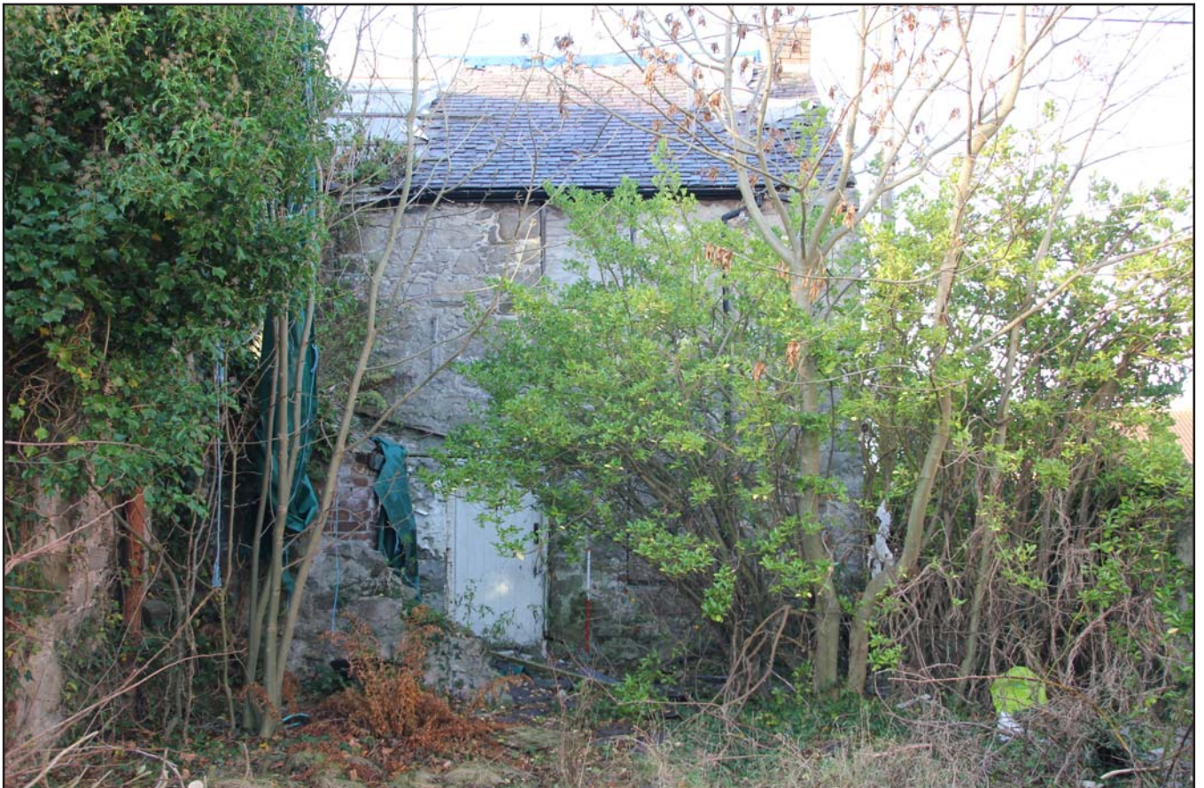
Plate 24: East facing external elevation, from the east. Scale 1.0m.