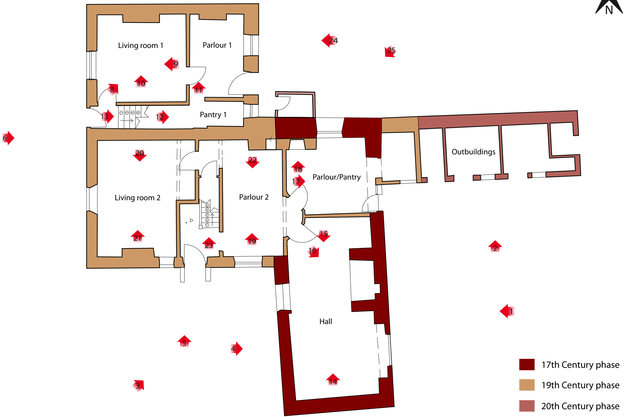
Figure 02: Location and orientation of photographs - ground floor (not scaled).