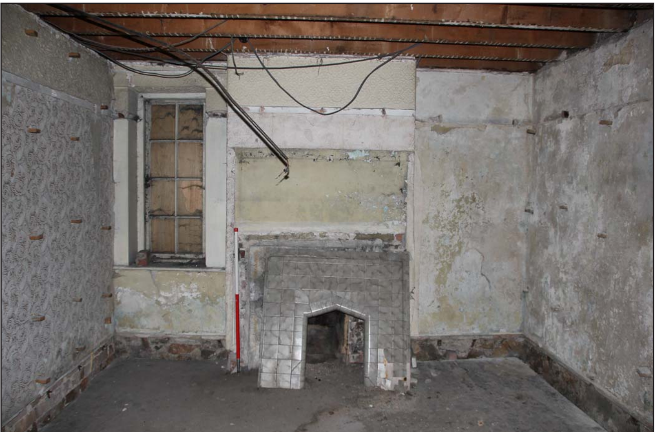
Plate 20: Living room 2 within 19th Century phase showing fireplace, from the north. Scale 1.0m.