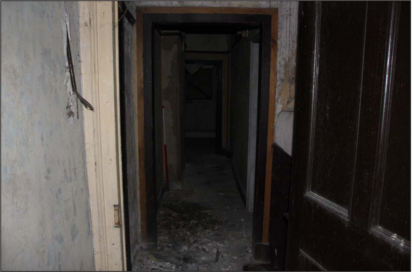
Plate 31: Landing in 19th Century phase, from the south. Scale 1.0m.