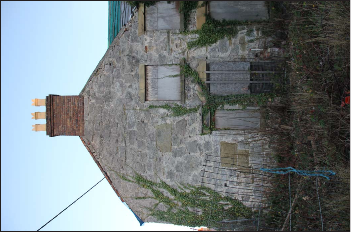
Plate 05: south facing external elevation, from the south. Scale 1.0m.