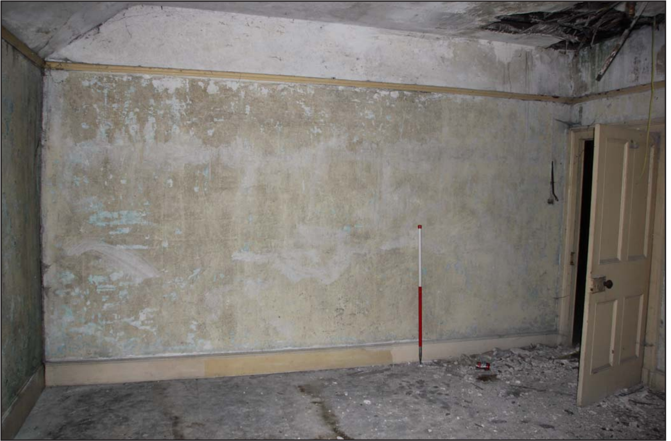
Plate 21: Living room 2 within 19th Century phase, from the south. Scale 1.0m. .