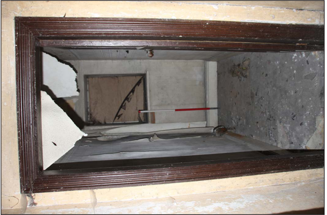
Plate 33: Toilet in 17th Century phase, from the south. Scale 1.0m.