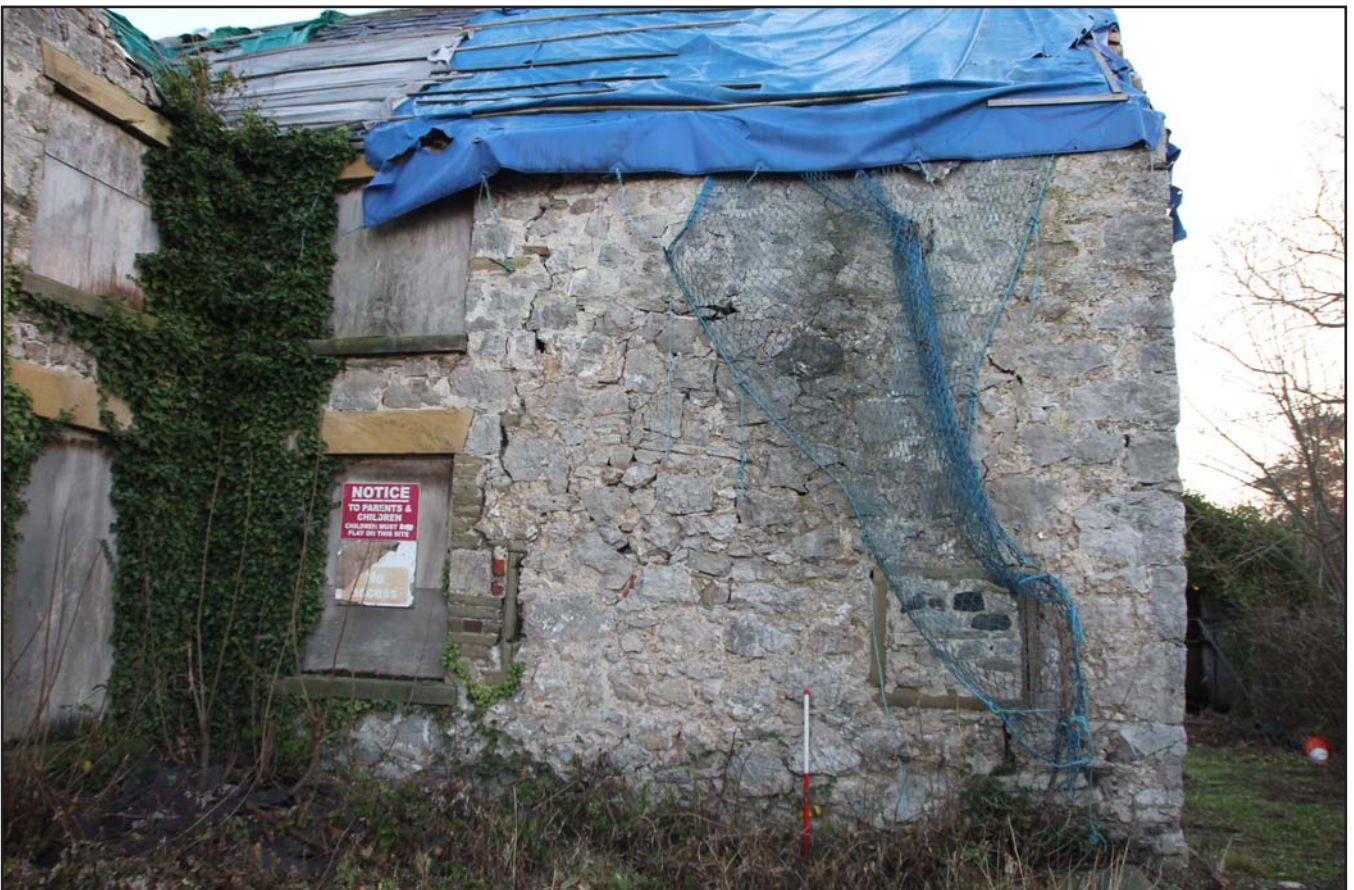
Plate 04: West facing external elevation, from the west. Scale 1.0m.