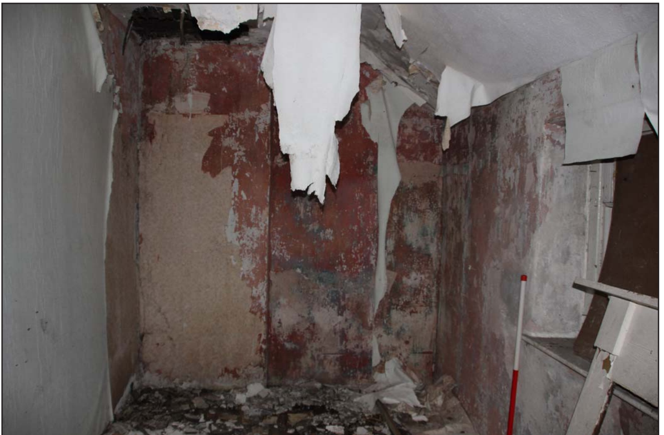
Plate 28: Bedroom 2 in 19th Century phase, from the east. Scale 1.0m.