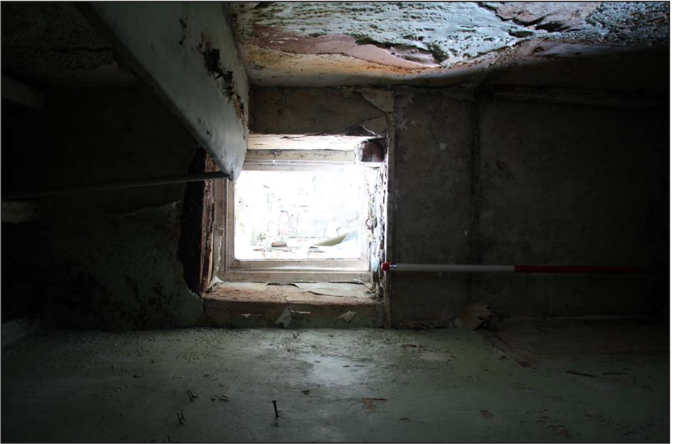
Plate 12: Pantry within 19th Century phase, from the west. Scale 1.0m.