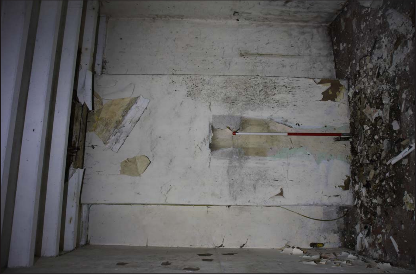
Plate 11: Kitchen within 19th Century phase, from the south. Scale 1.0m.