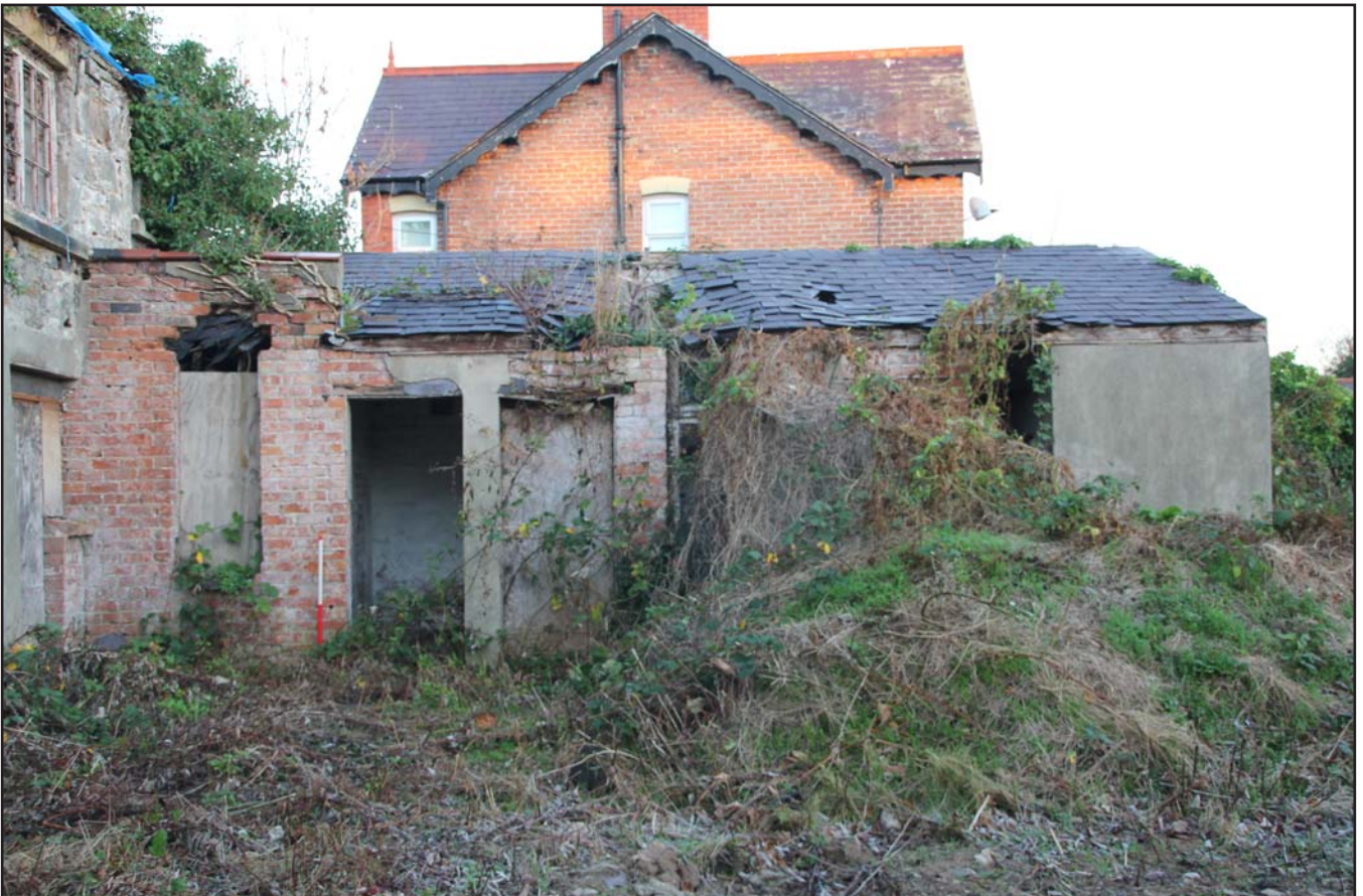
Plate 02: 19th and 20th Century outhouses, from the south. Scale 1.0m.