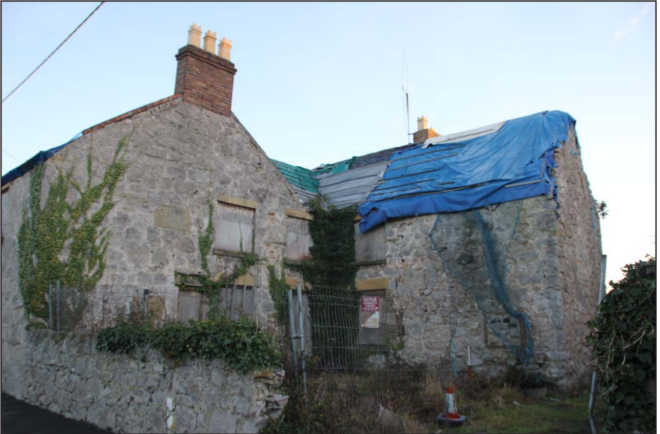
Plate 03: south and west facing external elevation, from the southwest. Scale 1.0m.