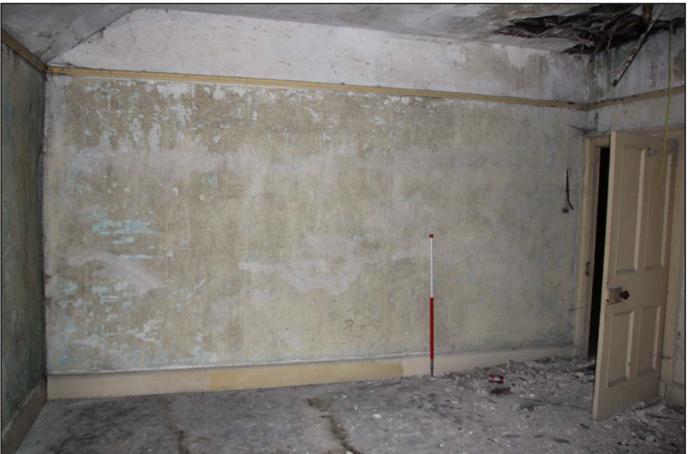
Plate 30: Bedroom 3 in 19th Century phase, from the southeast. Scale 1.0m.