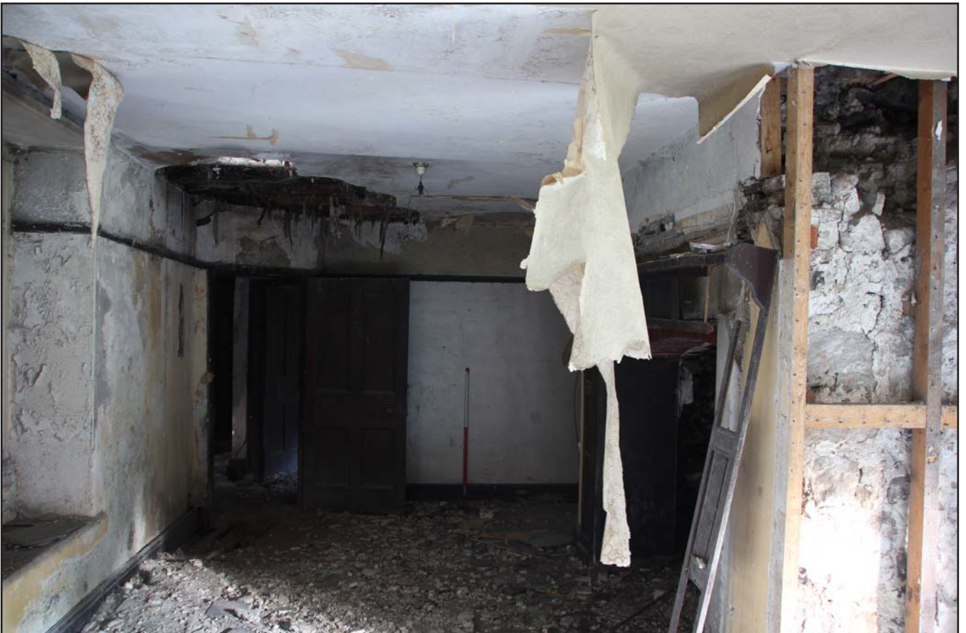
Plate 14: Hall within 17th Century phase, from the south. Scale 1.0m.