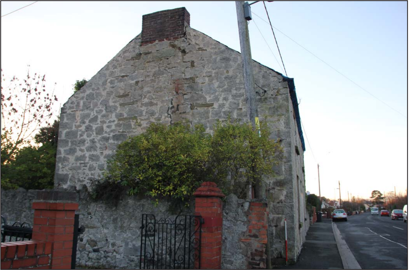
Plate 07: North facing external elevation, from the northwest. Scale 1.0m.