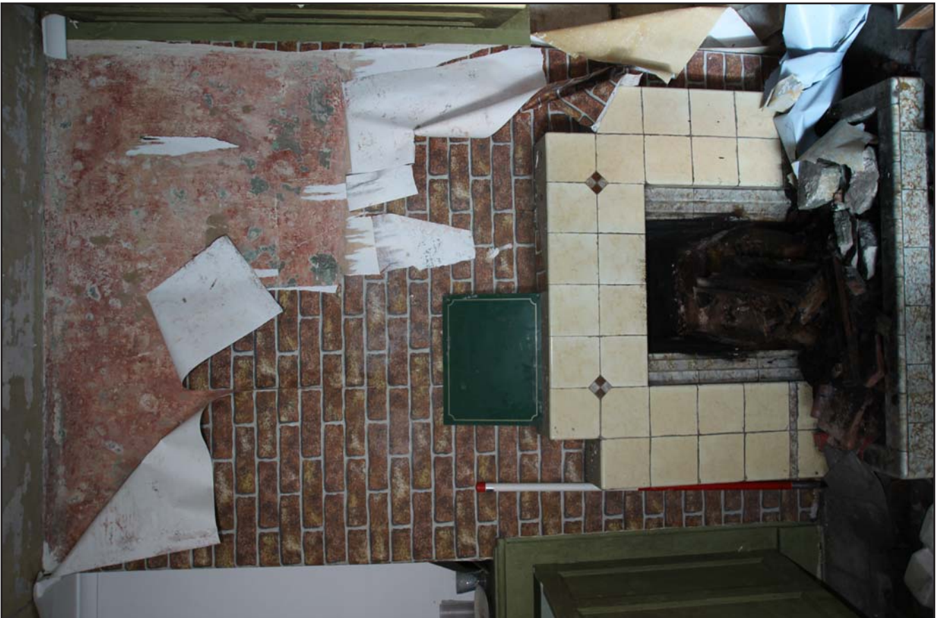
Plate 10: Fireplace in living room 1 within 19th Century phase, from the south. Scale 1.0m.