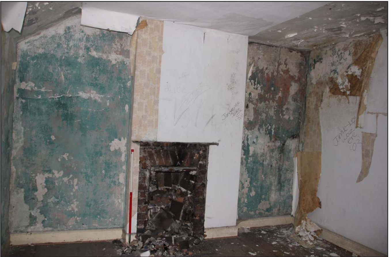
Plate 26: Bedroom 1 in 19th Century phase, from the southeast. Scale 1.0m.