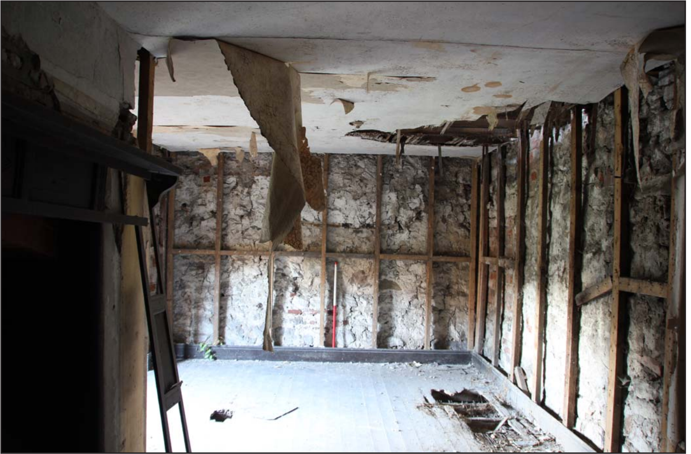
Plate 15: Hall within 17th Century phase, from the north. Scale 1.0m.