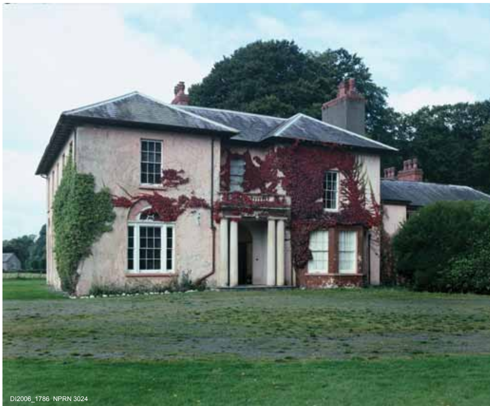
DI2006_1786 NPRN 3024

Left: Notice the railway line running close to Llannerchaeron House. This branch line was constructed between Lampeter and Aberaeron in 1911 as part of the Carmarthen to Aberystwyth railway line. Passenger services lasted only forty years and were withdrawn as early as 1951, while freight continued for a further fourteen years.