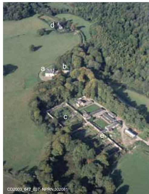
CD2003_642_037 NPRN 302081

Above: Llannerchaeron House in 1997, designed and built by John Nash in 1794. This eighteen-century villa is the most complete example of his early work; prior to his work at Llannerchaeron Nash also designed gaols at Cardigan, Hereford and Carmarthen.