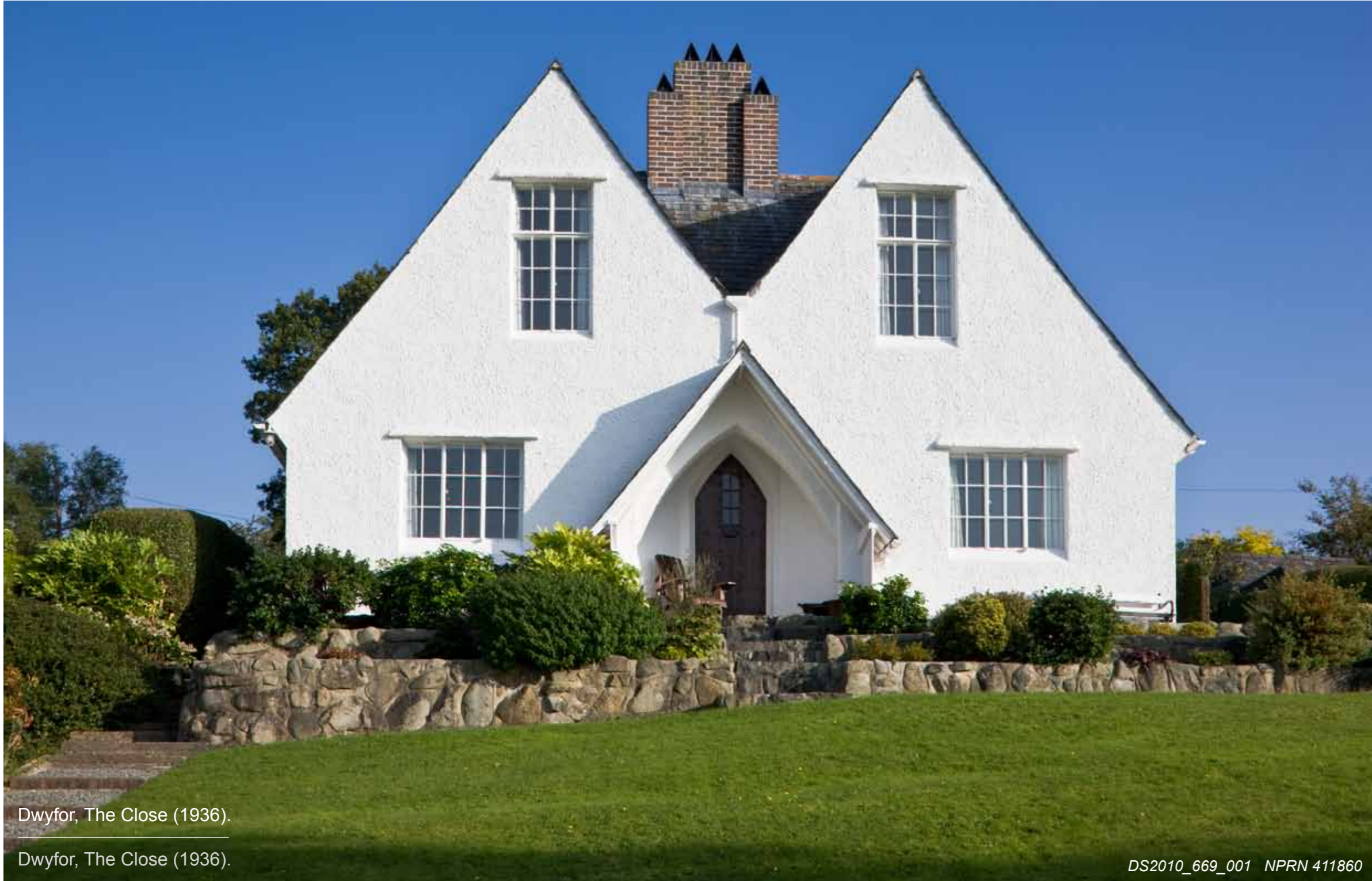
Dwyfor, The Close (1936).

Herbert North's 1920s small estate at The Close, Llanfairfechan, resembles the garden villages, but from the start had owner-occupiers. The houses were distinguished by detail influenced by the Arts & Crafts movement and vernacular architecture.