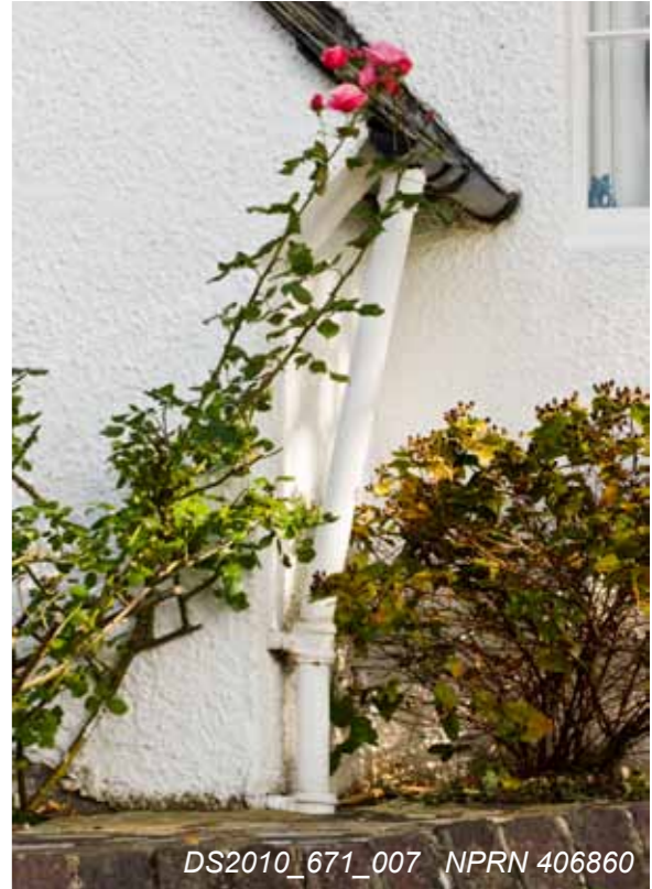
DS2010_671_007 NPRN 406860