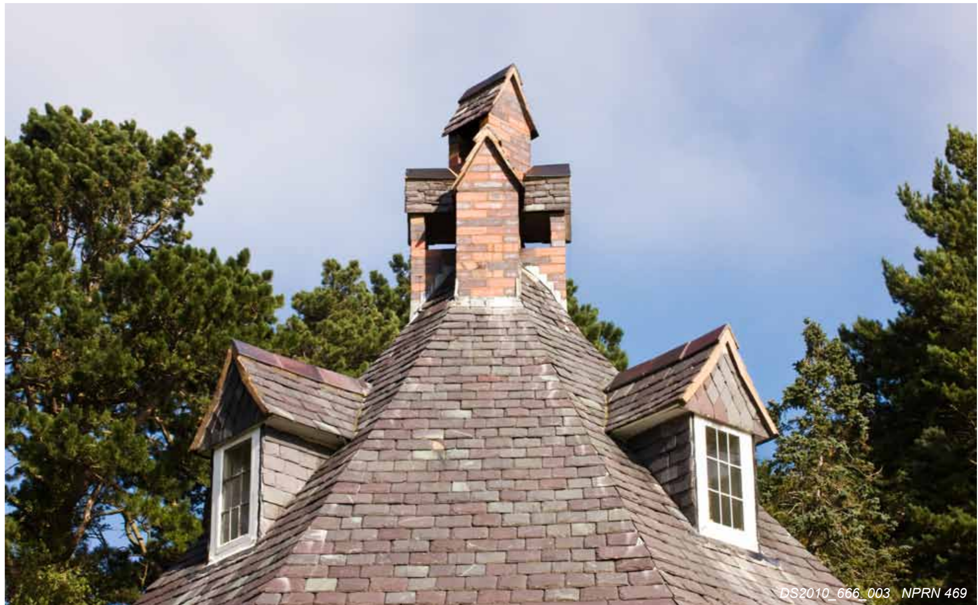
DS2010_666_003 NPRN 469