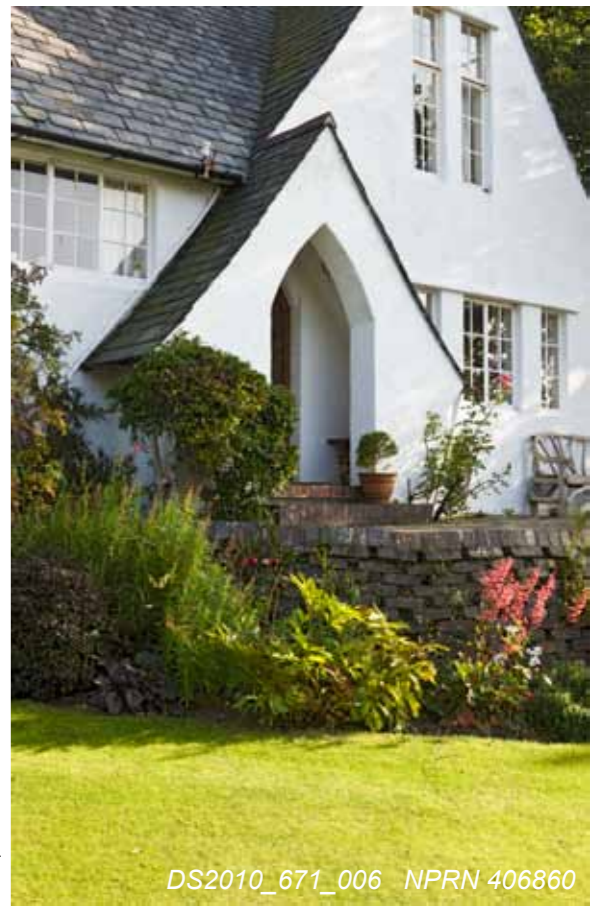
DS2010_671_006 NPRN 406860