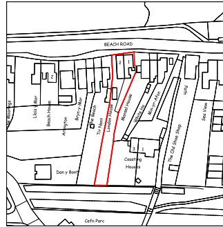
Site Location Plan Scale 1 : 1250