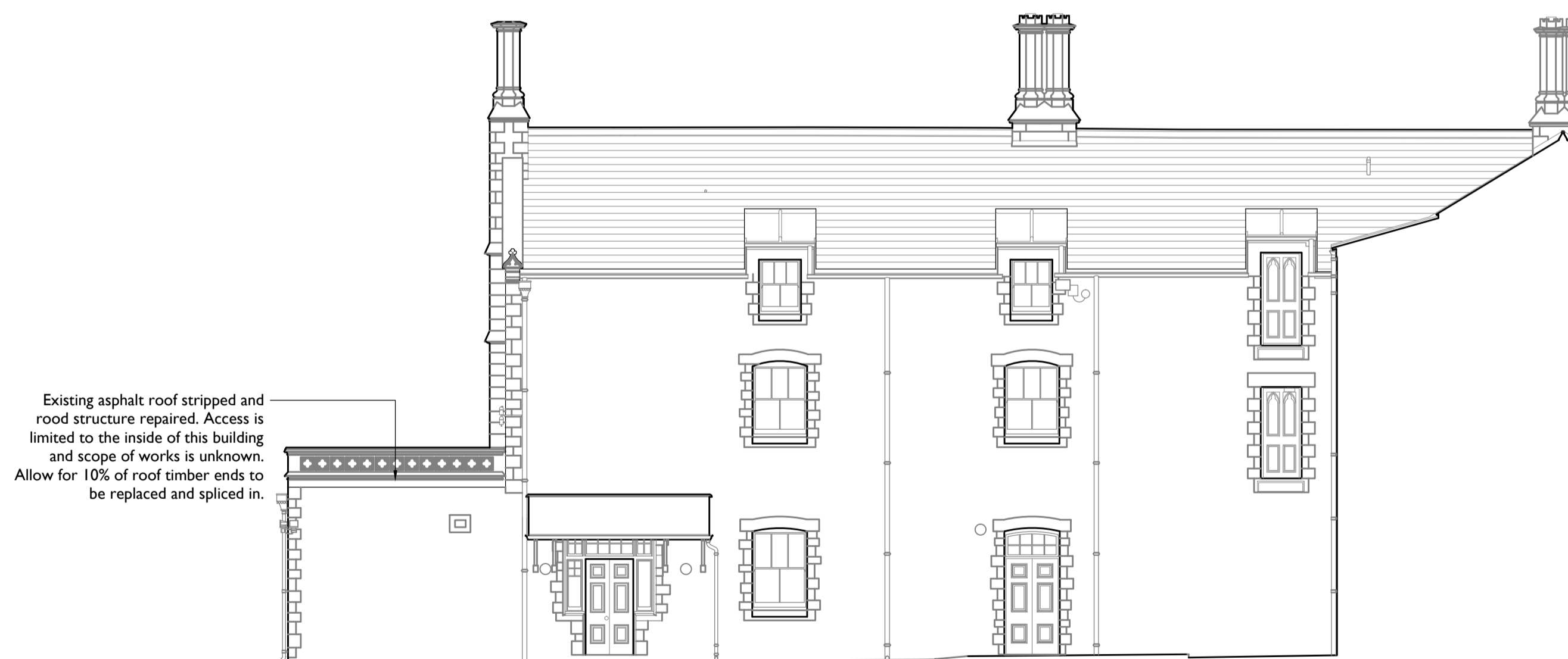
2 WEST ELEVATION AS EXISTING 108 1:100

Notes: Drawings are based on survey data and may not accurately represent what is physically present. Do not scale from this drawing. All dimensions are to be verified on site before proceeding with the work. All dimensions are in millimeters unless noted otherwise. Purcell shall be notified in writing of any discrepancies.