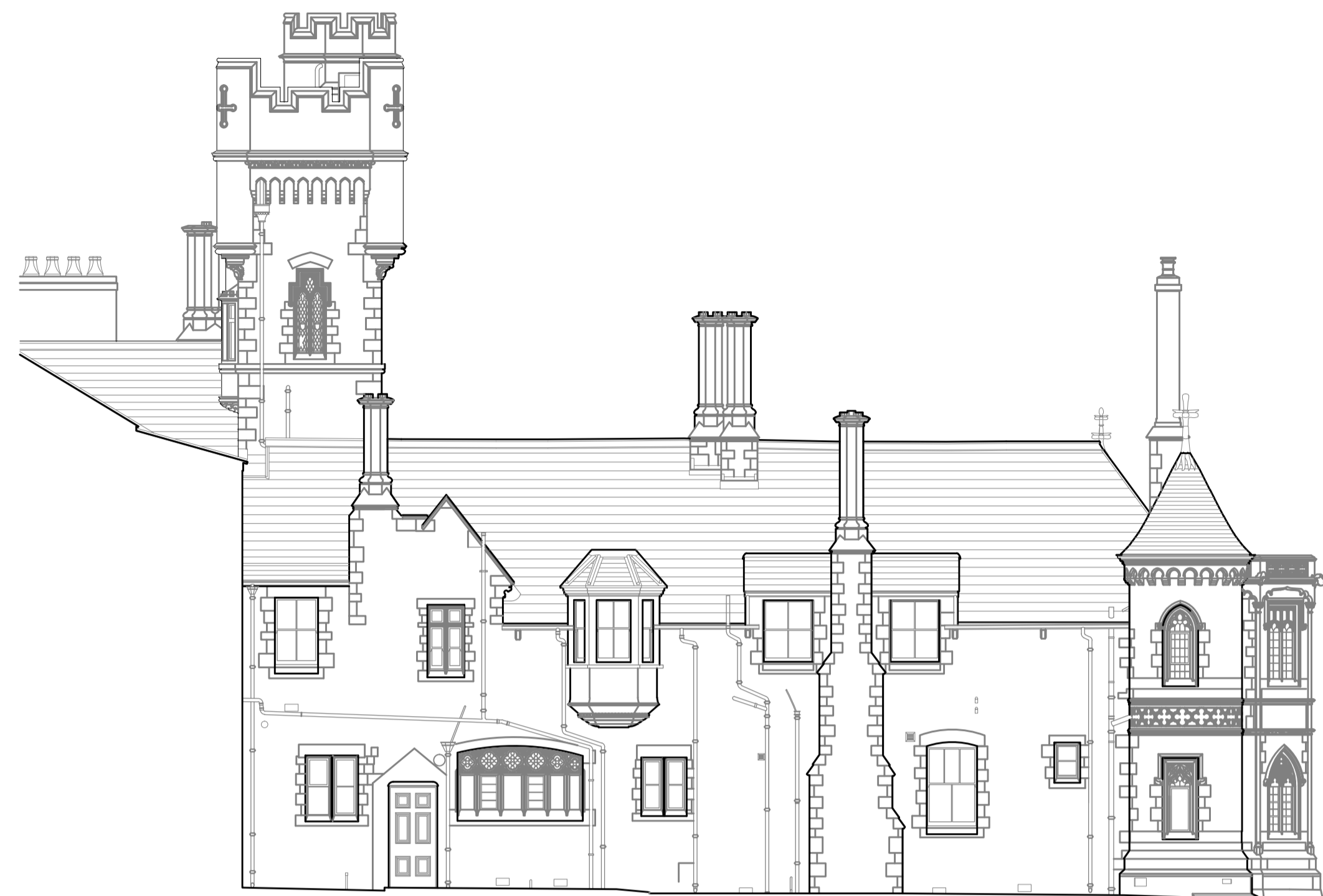
1 EAST ELEVATION AS EXISTING 108 1:100