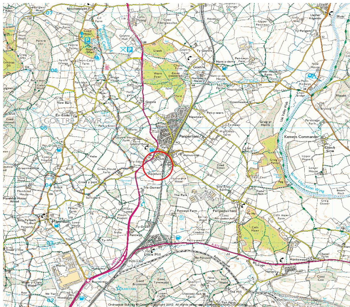
Fig. 1 Location of site