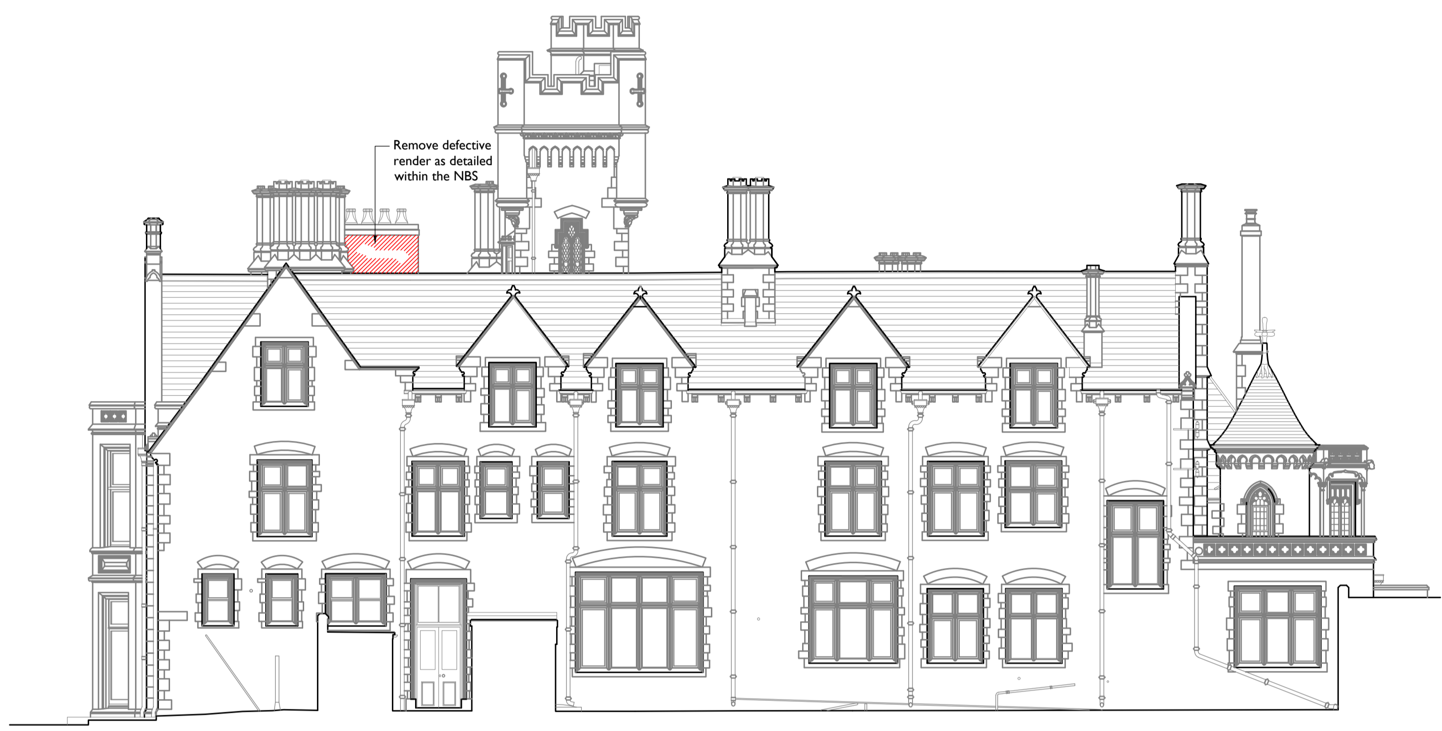
1 EAST ELEVATION AS EXISTING 107 1:100