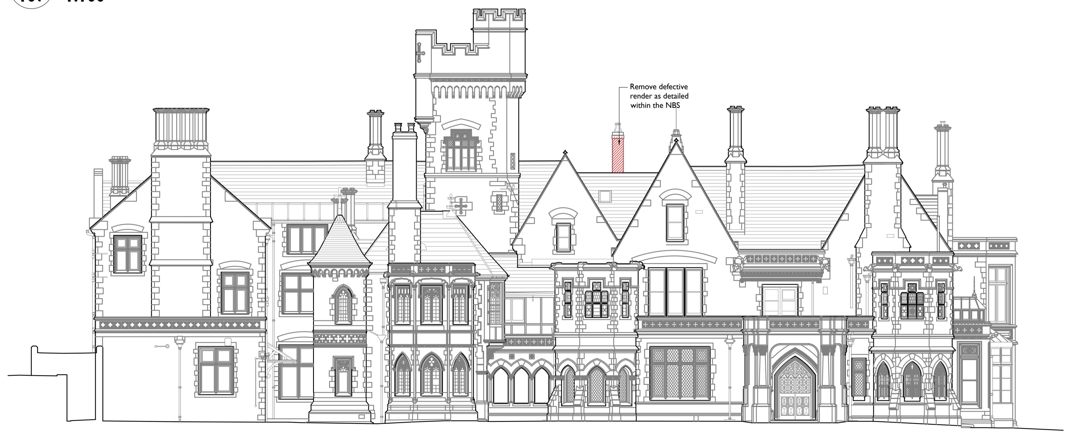
2 NORTH ELEVATION AS EXISTING 107 1:100