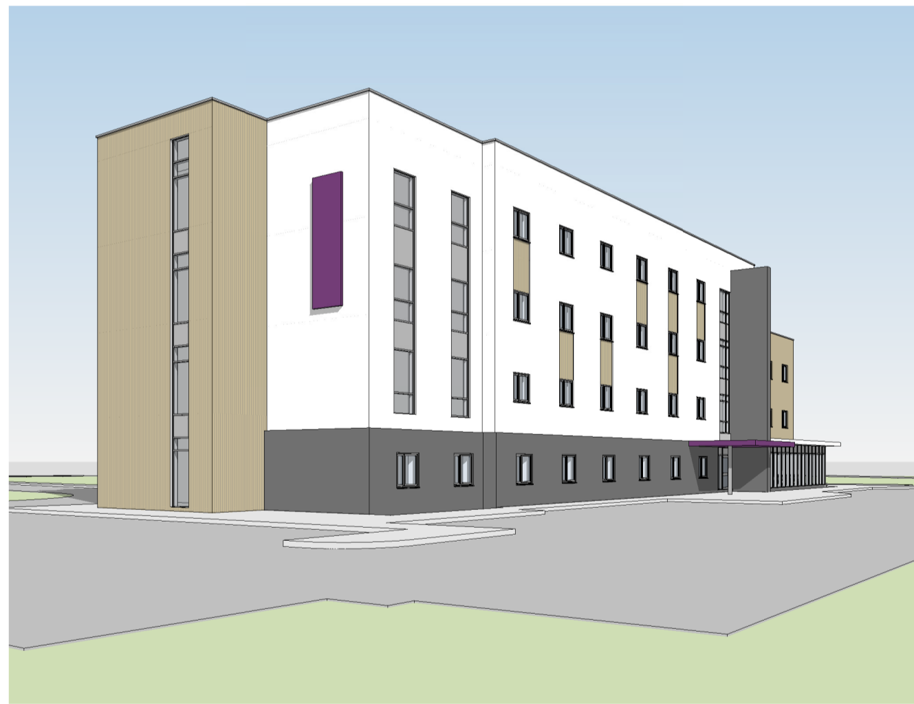
3D View 3 - North East