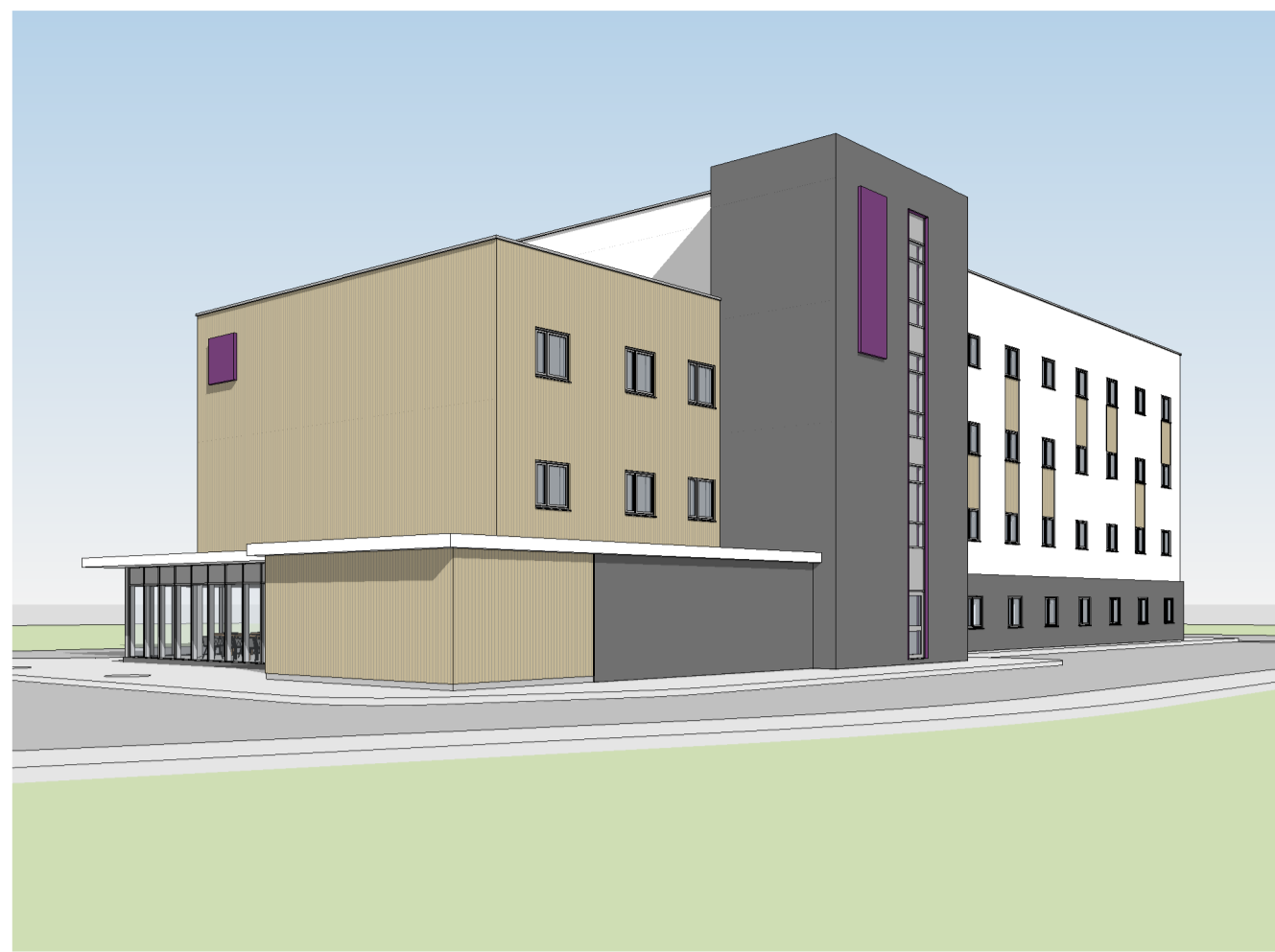
3D View 1 - South West