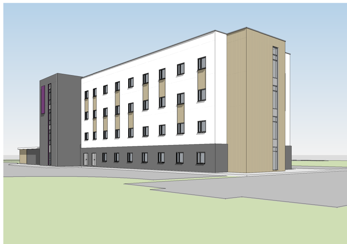
3D View 4 - South East