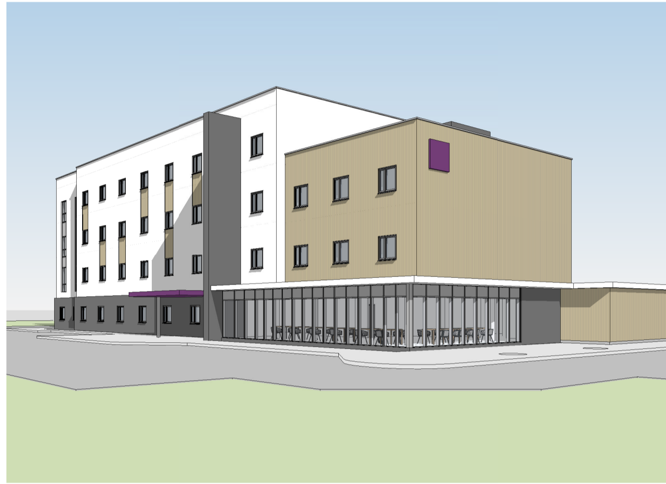
3D View 2 - North West