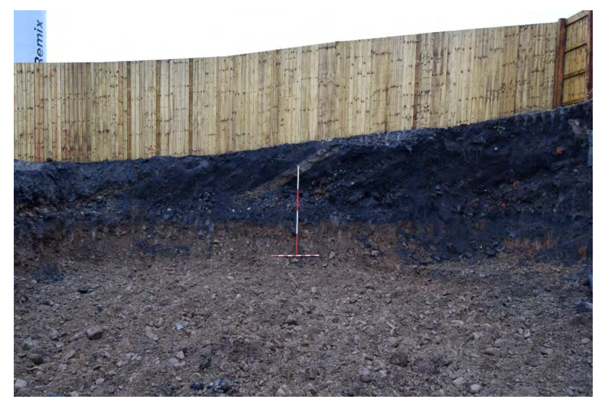
Plate 12: View west of northwest corner of plot 12-19, deposit 016 visible at the base, overlaid by 017 and 018 with landscaped tip lines visible. 2m & 1m scales.