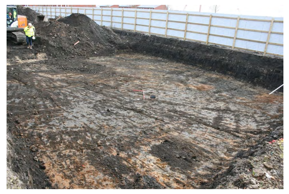
Plate 7: View east of western half of plot 6-11 footprint reduced down onto the superficial geology 009. 1m scales.