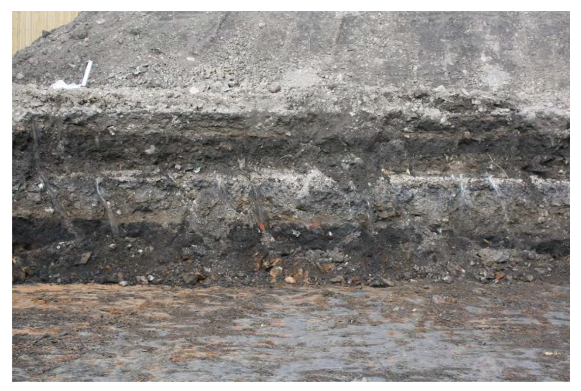
Plate 8: View north of south facing section plot 6-11, showing deposits 001-009.