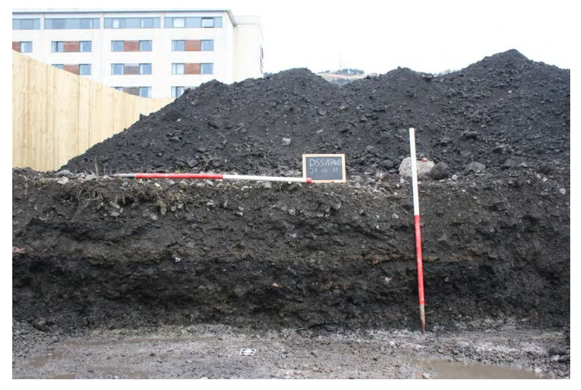
Plate 5: South facing section of plot 6-11, showing deposit 004 with overlying deposits 003, 002 & 001. 1m scales.