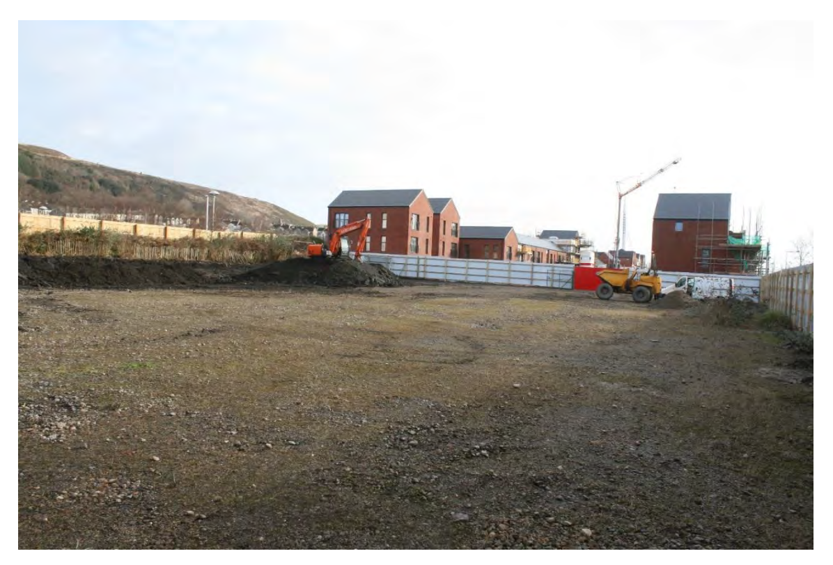
Plate 1: View east across the site prior to excavation works.