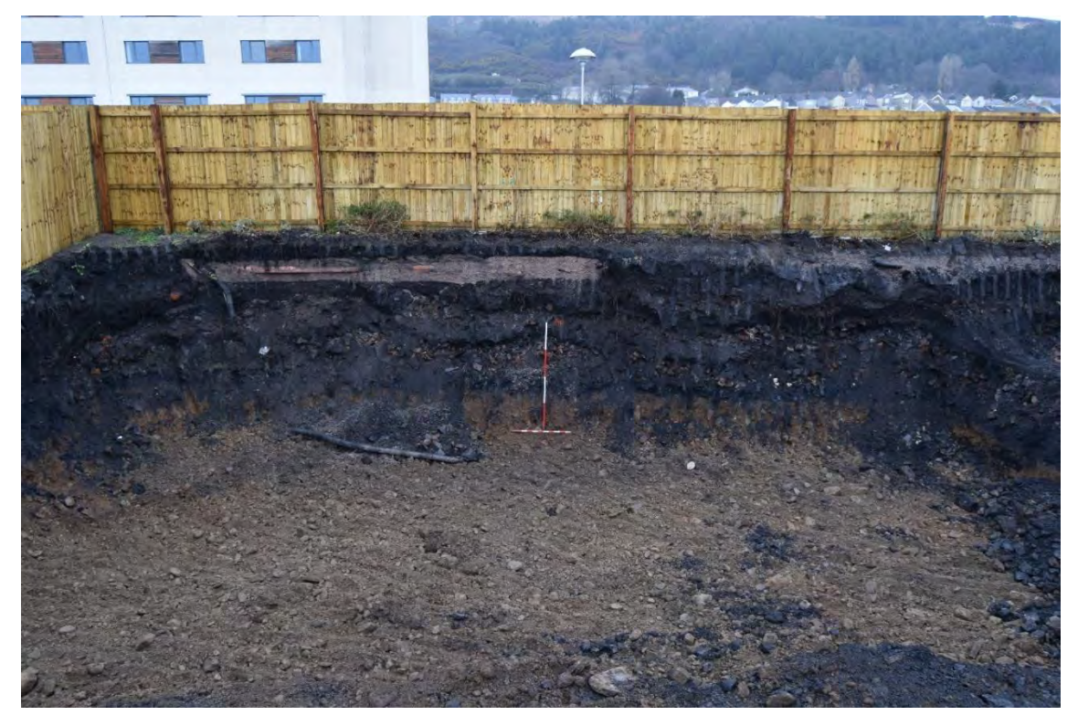
Plate 13: View north of western area of plot 12-19 fully excavated. 2m & 1m scales.