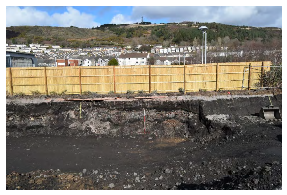
Plate 15: View north of eastern area of plot 12-19 fully excavated. 2m & 1m scales.