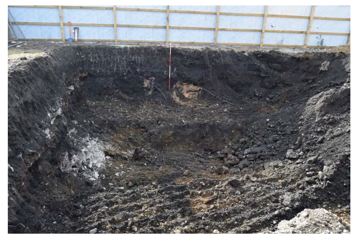
Plate 11: View south of plot 1-5 being reduced. The remains of the concrete and wooden post structure 013 are visible to the left, with deposit 012 also becoming apparent, all overlaid with deposits 014 & 015. 2m scale.