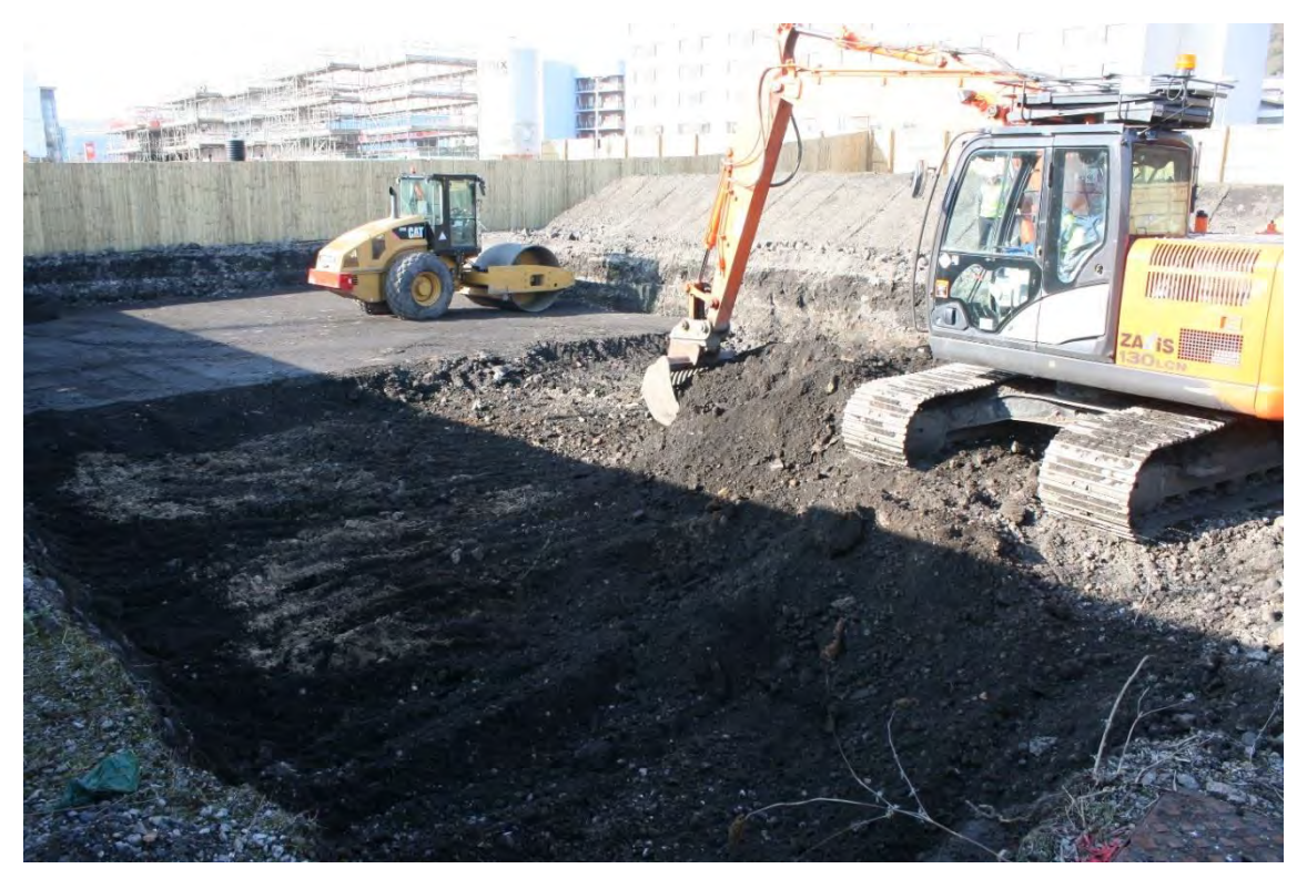
Plate 10: View northwest of western half of plot 6-11 being backfilled and compressed.