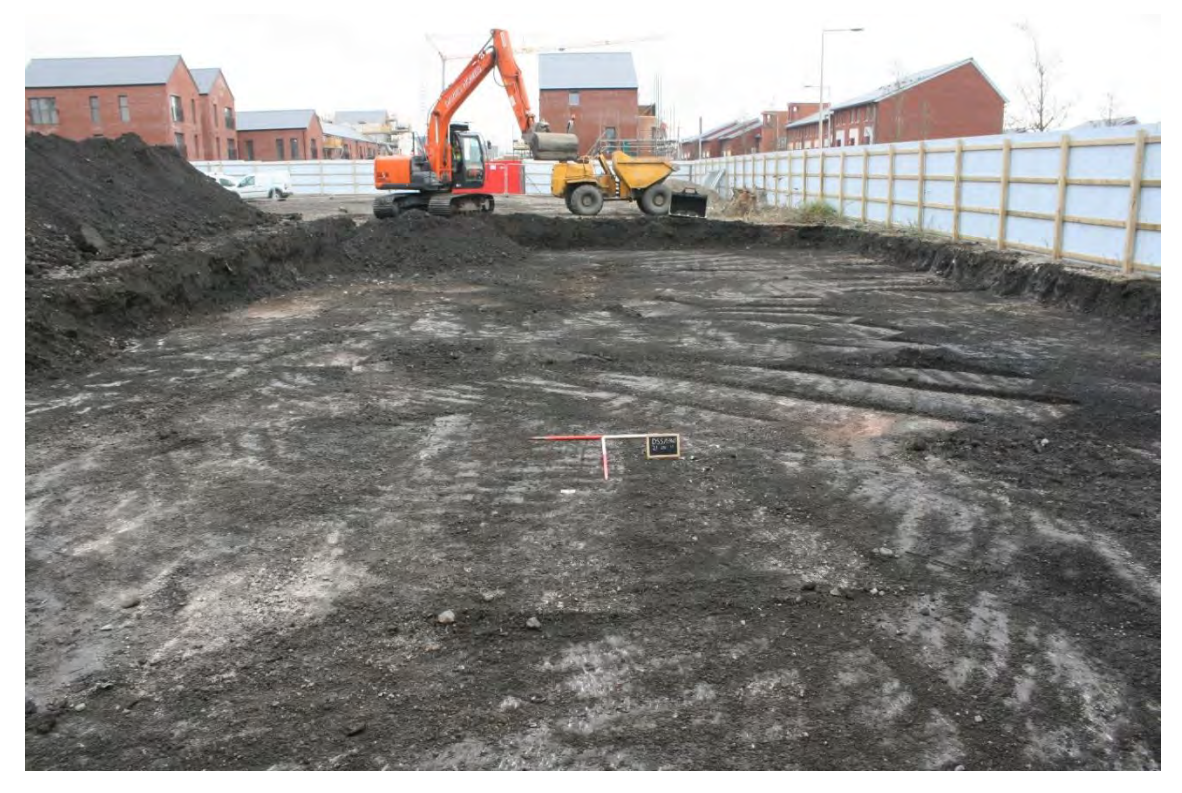
Plate 6: View east of plot 6-11 footprint reduced down onto deposit 004. 1m scales.