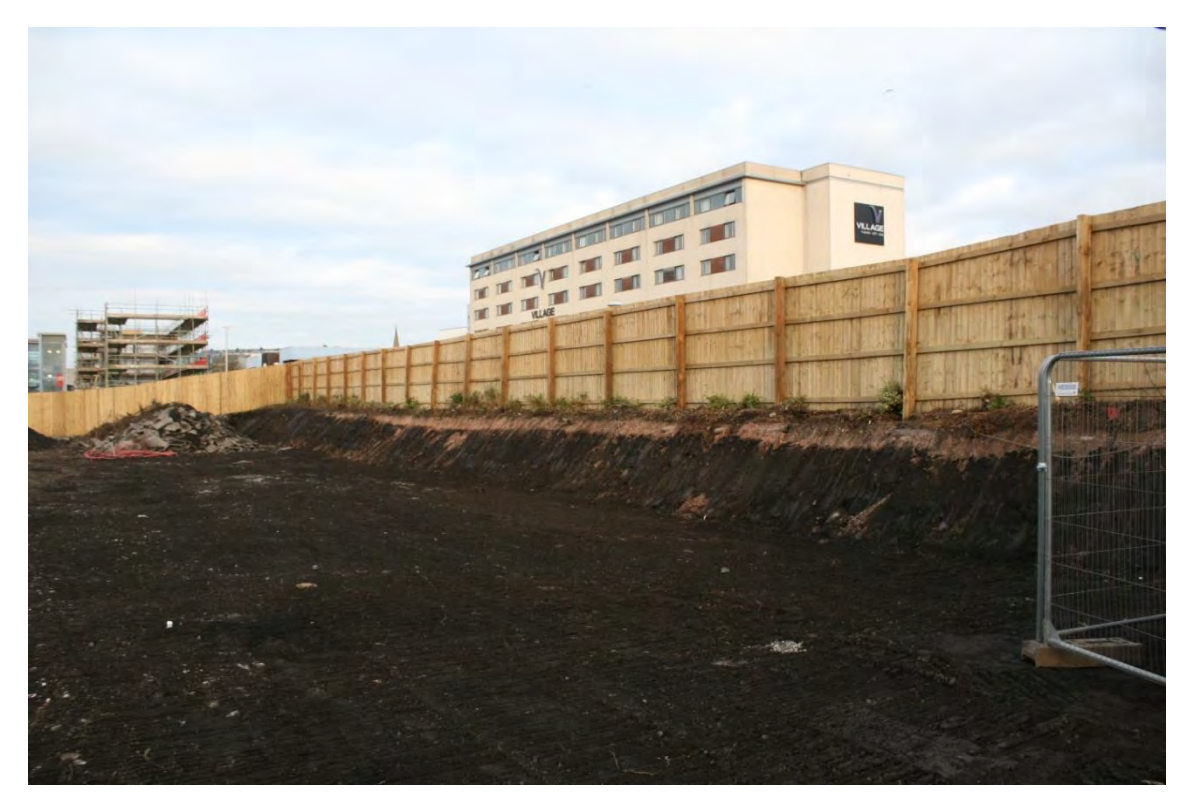
Plate 3: Northern boundary of site after removal of soil deposit and partial levelling. View northwest