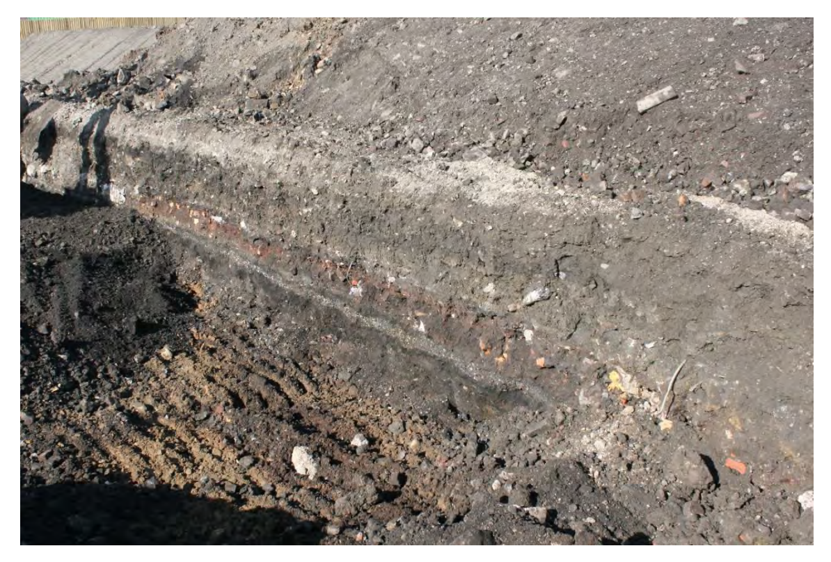
Plate 9: View northwest of plot 6-11 stratigraphy and area containing preserved peat deposit 011.