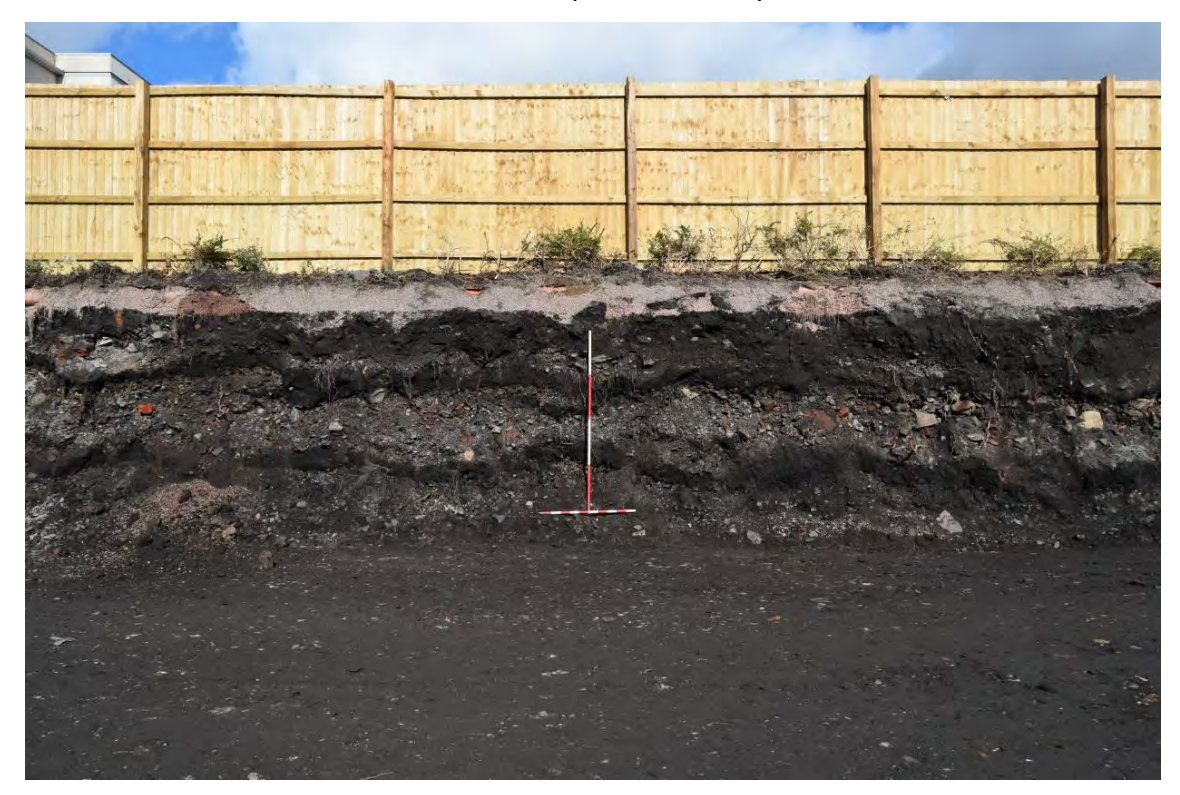
Plate 14: View north of central area of plot 12-19 fully excavated. 2m & 1m scales.