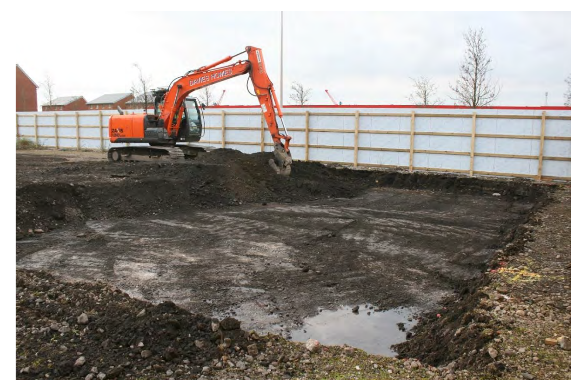
Plate 4: View southeast of initial excavation of plot 6-11, through deposits 003, 002 & 001.