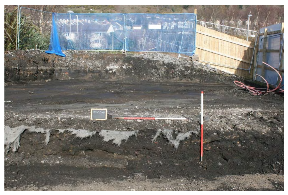
Plate 2: Minor reduction of ground within north east corner of site for site cabin. View north, 1m scales.