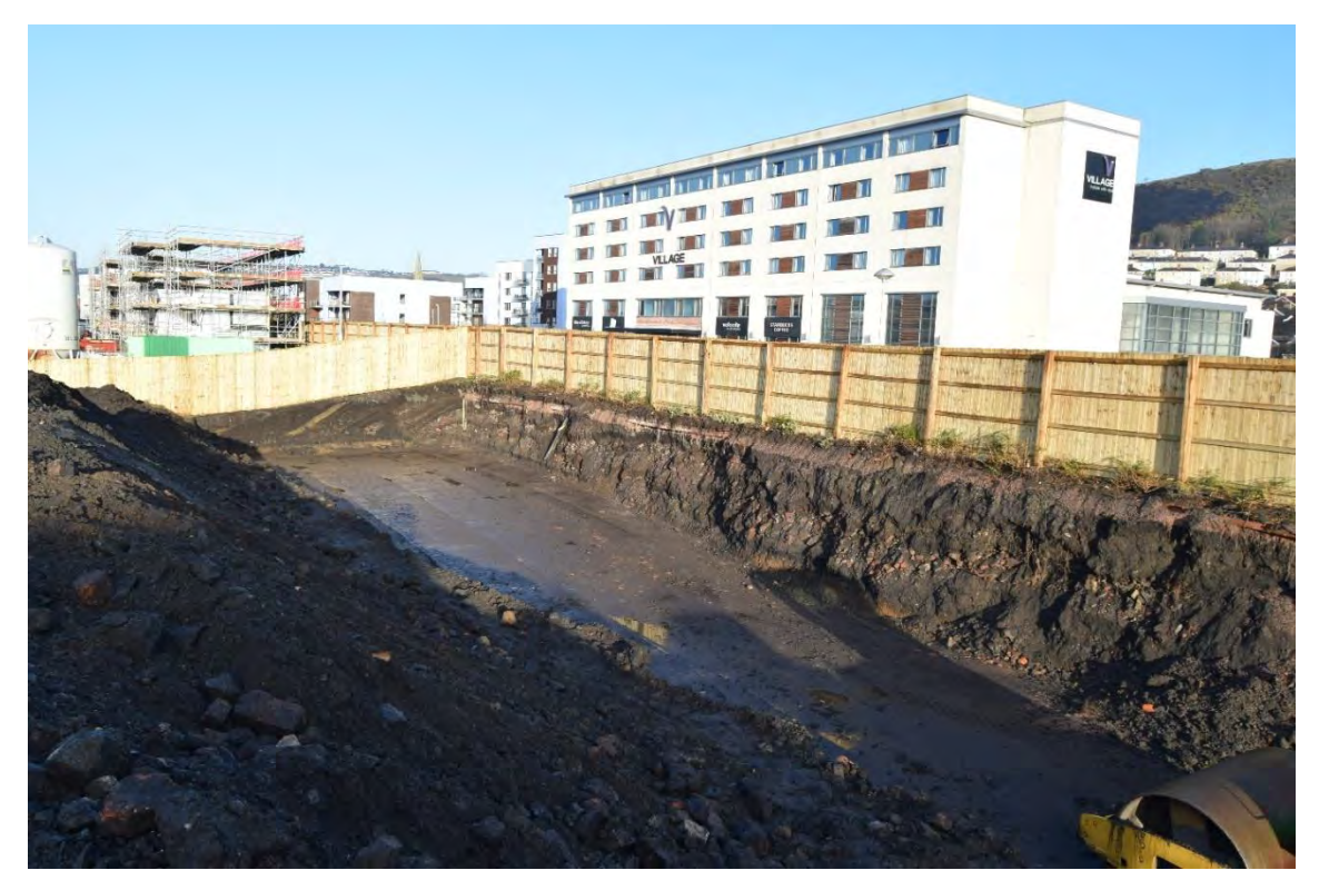
Plate 16: View northwest of plot 12-19 fully excavated and material being re-deposited and compressed.