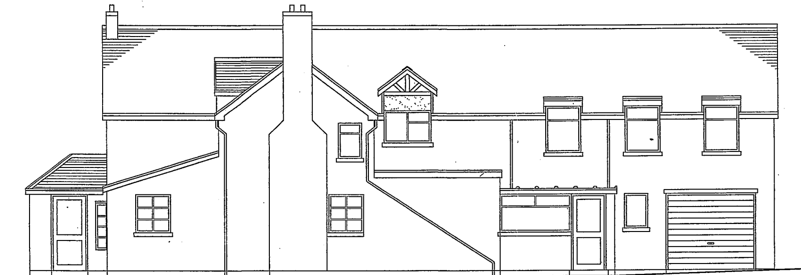
SIDE ELEVATION (1:100)