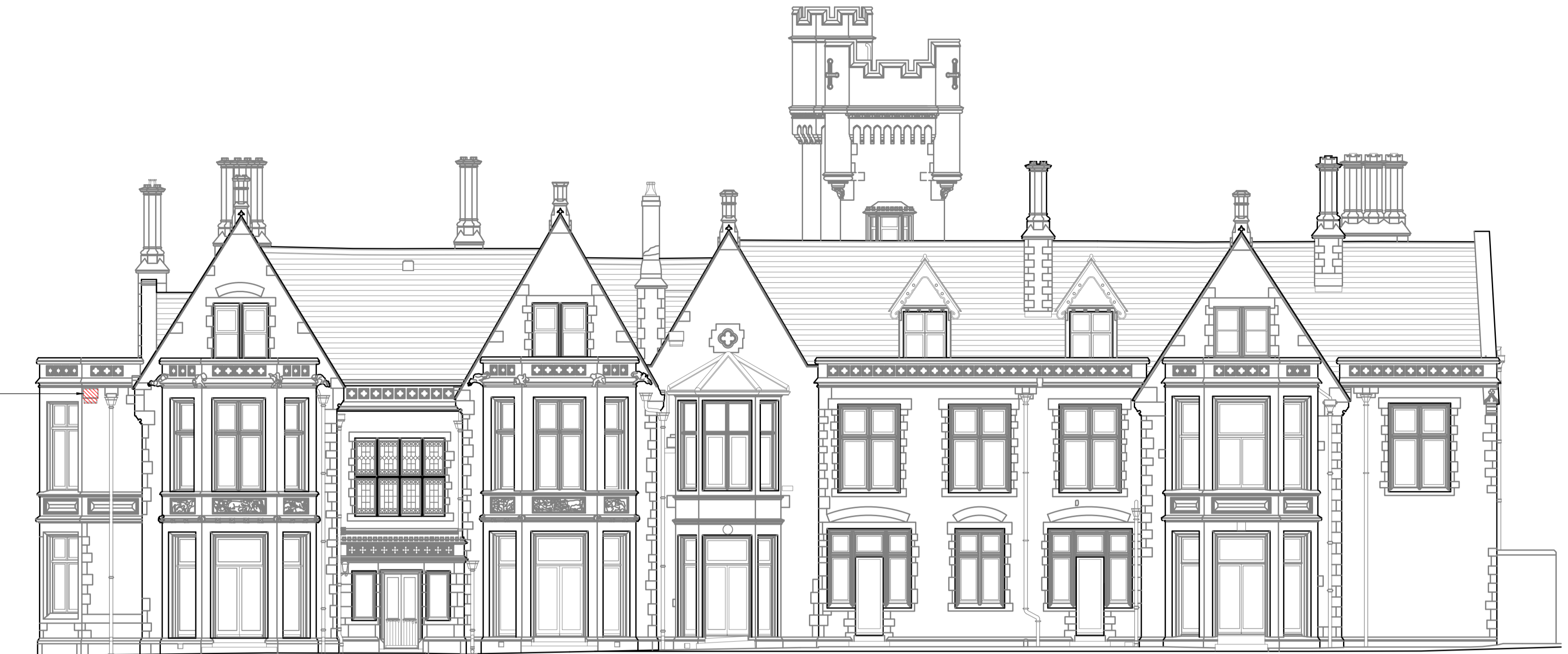
1 SOUTH ELEVATION AS EXISTING 106 1:100

Remove unsightly modern flood and emergency light and cables and fit new lights in alternative locations. refer to electrical engineers details for further details