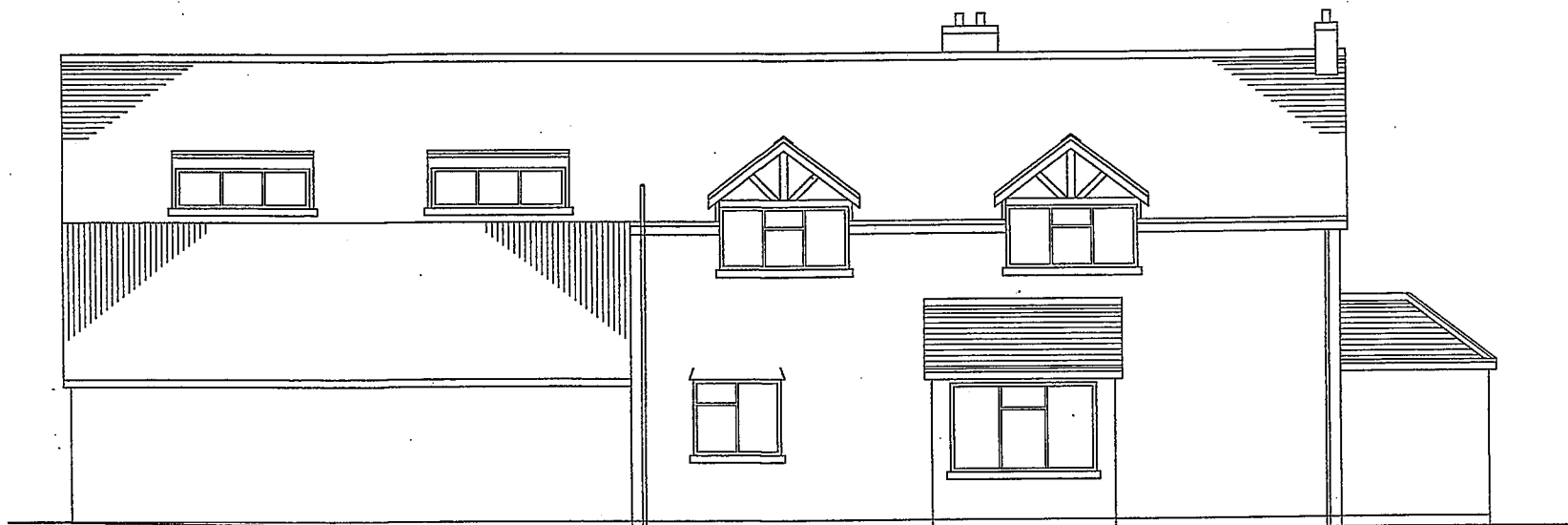
SIDE ELEVATION (1:100)