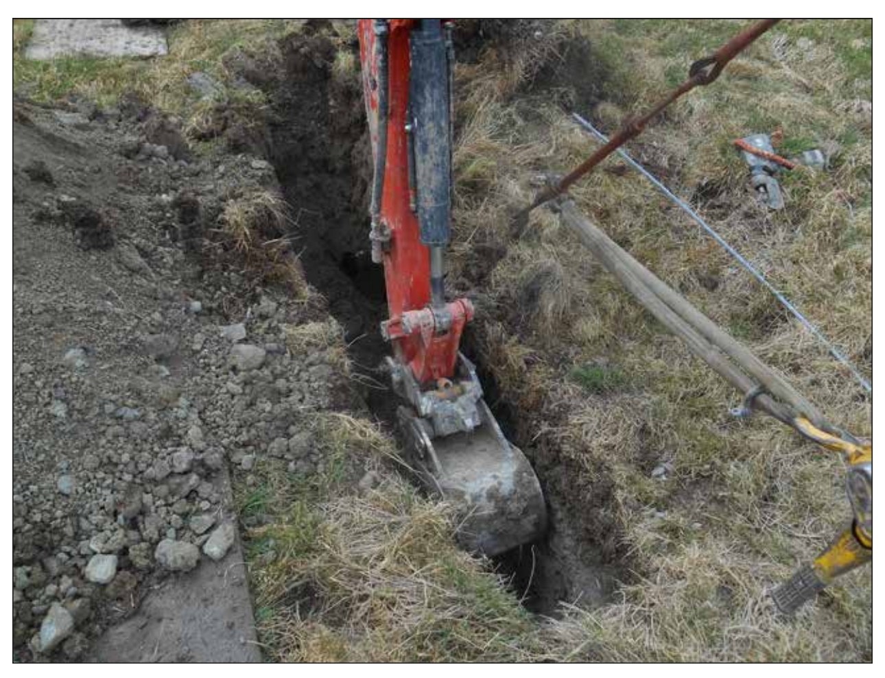
Plate 9. Working shot, Trench 2, looking north-east.