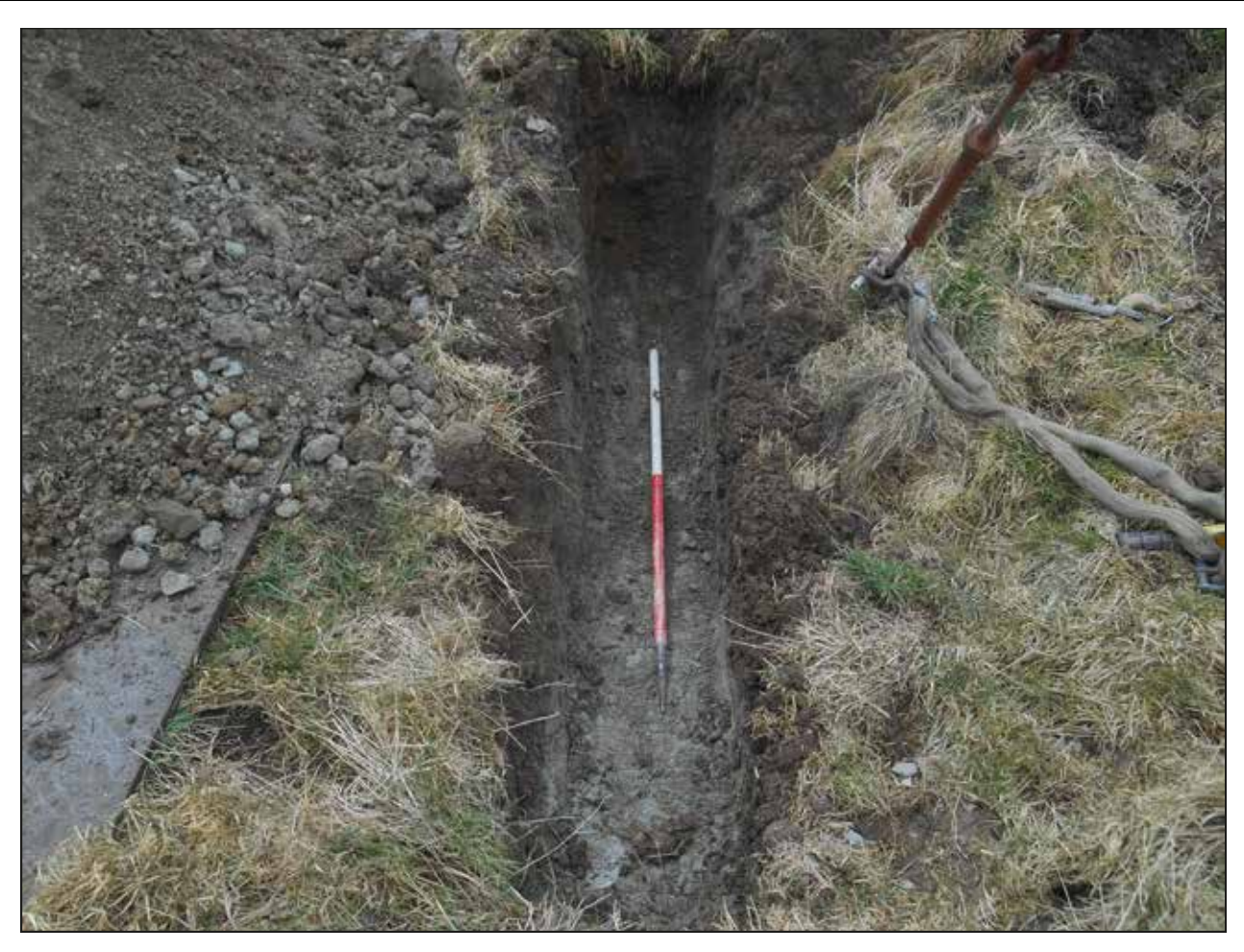
Plate 7. Trench 2 after excavation to top of (2003), looking north.