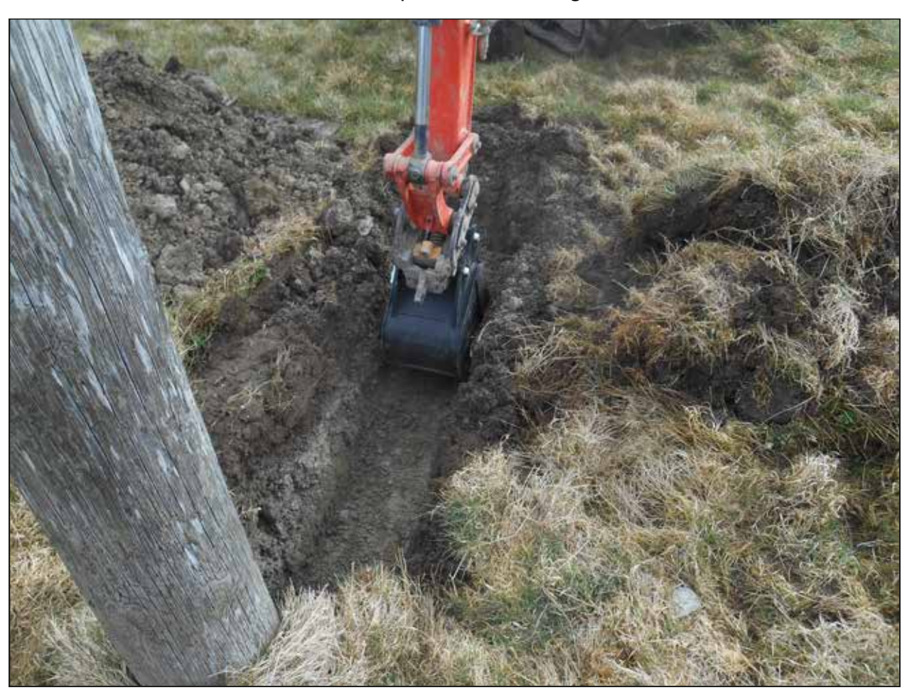
Plate 4. Working shot of Trench 1, looking south.