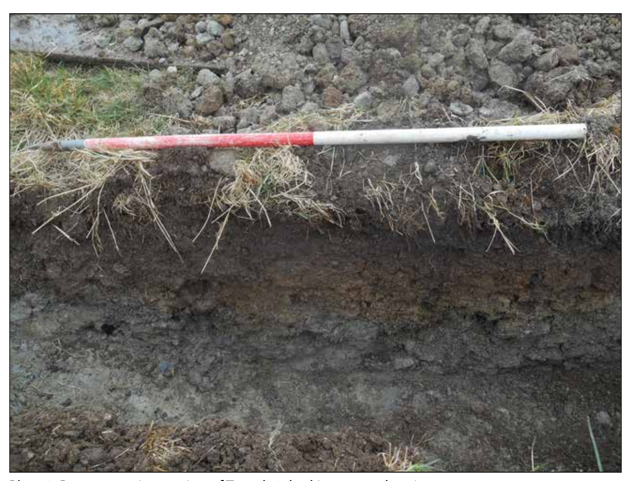
Plate 8. Representative section of Trench 2, looking west, showing contexts (2001), (2002) and (2003).