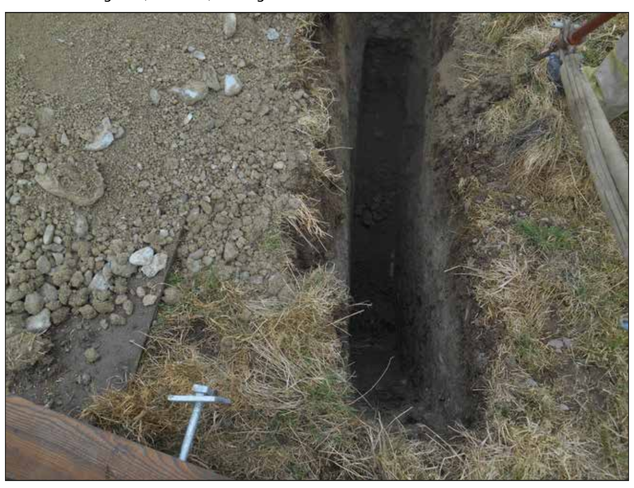
Plate 10. Trench 2 after excavation, looking north.