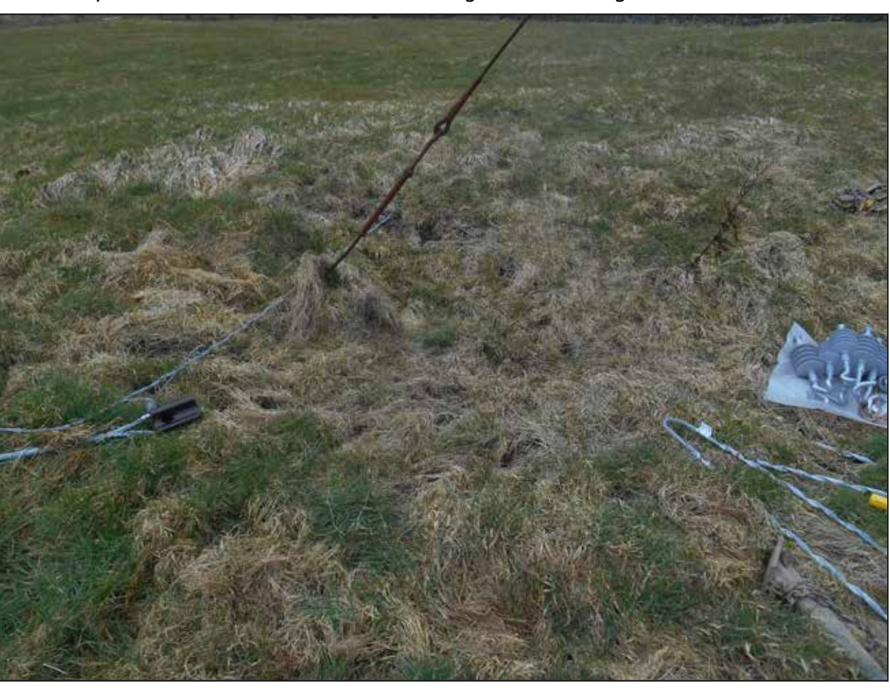
Plate 6. View of existing stay, looking north-east.