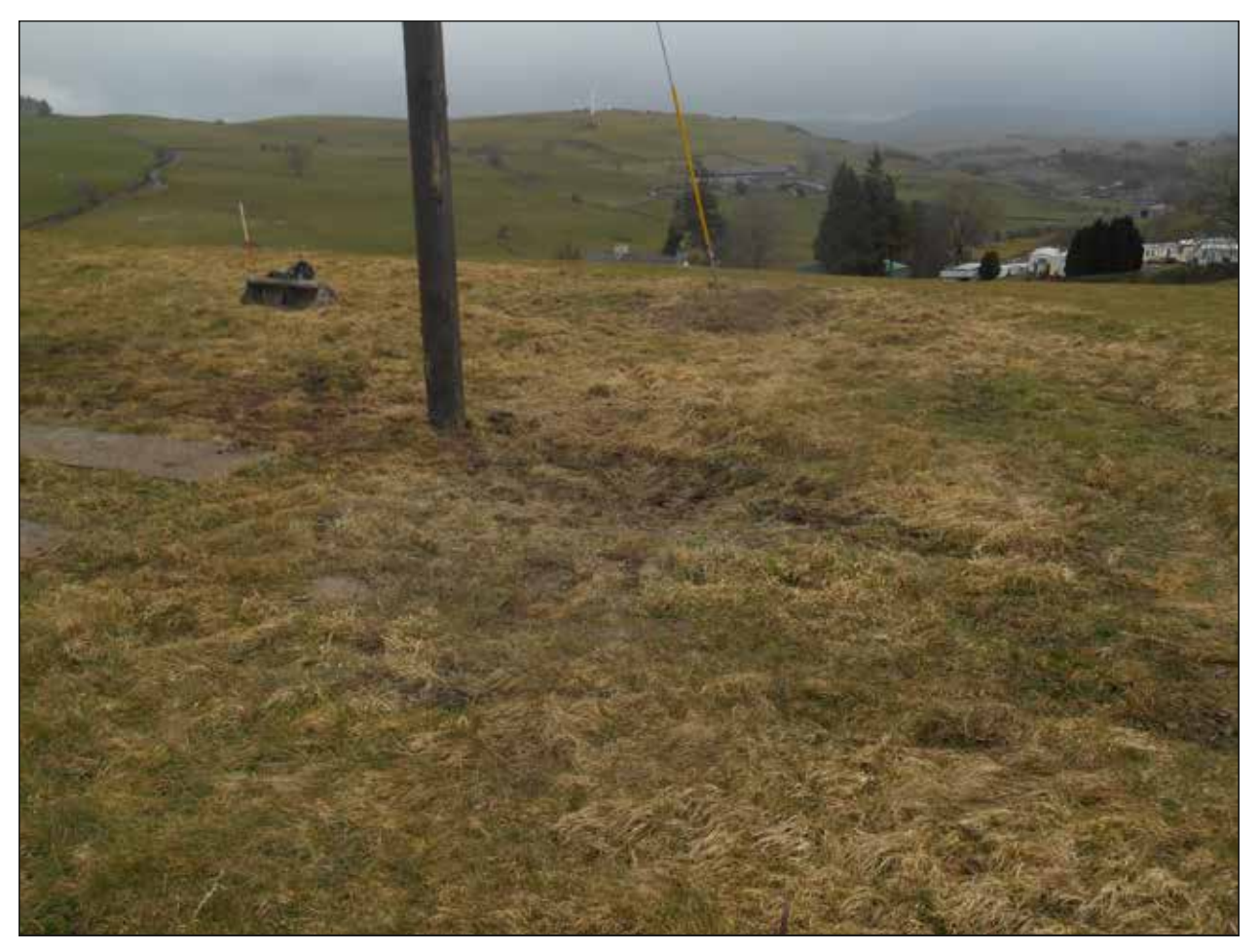
Plate 11. Pole and stay after backfill, looking south.