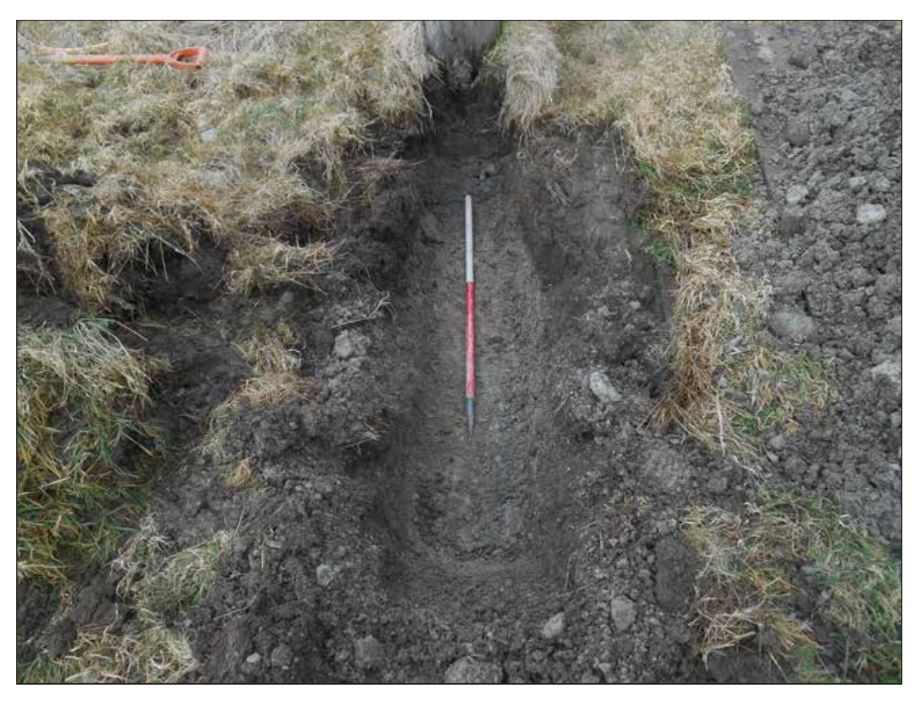
Plate 3. Trench 1 after excavation on to top of (1003), looking south-east.