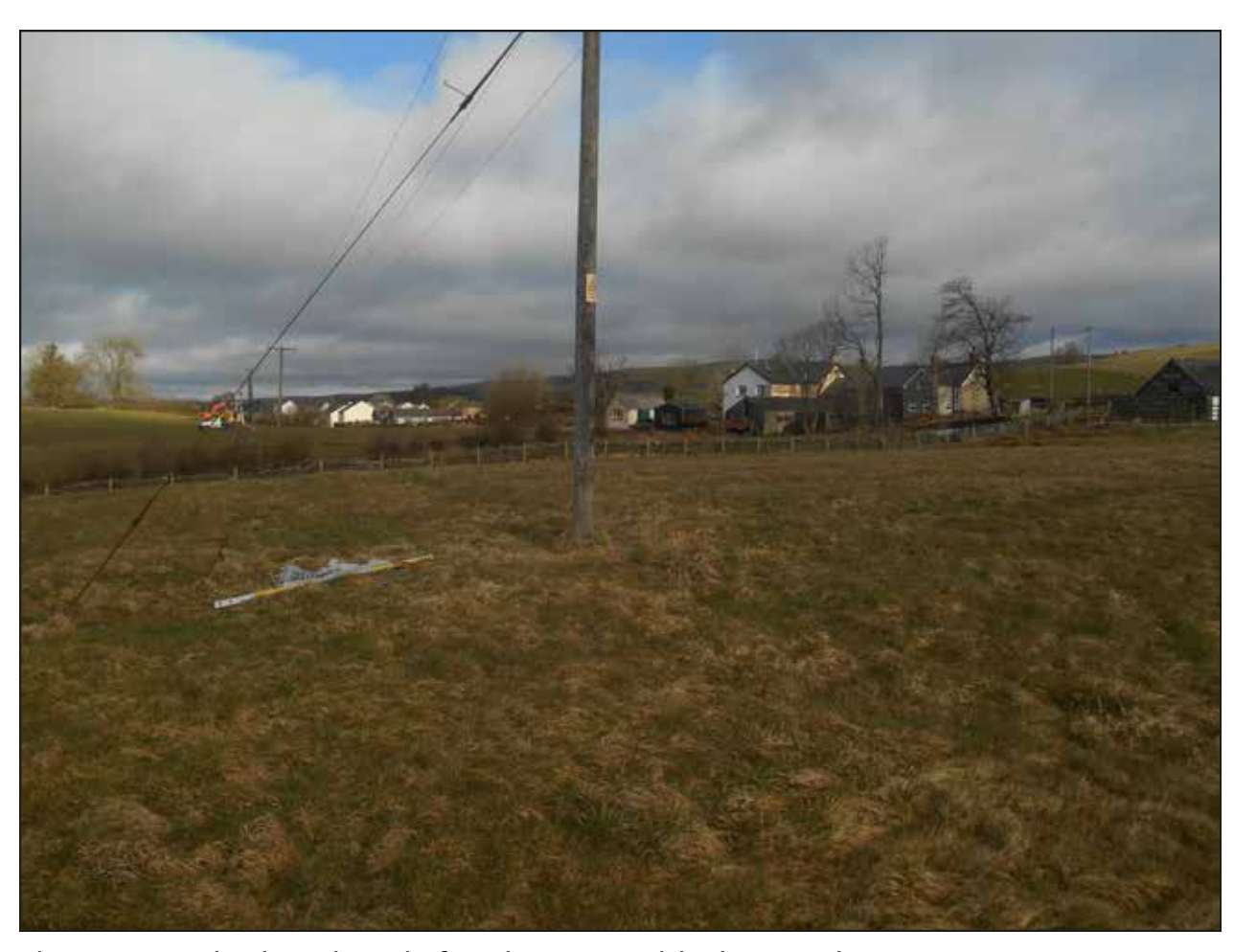
Plate 2. Original pole and stay before their removal, looking north.