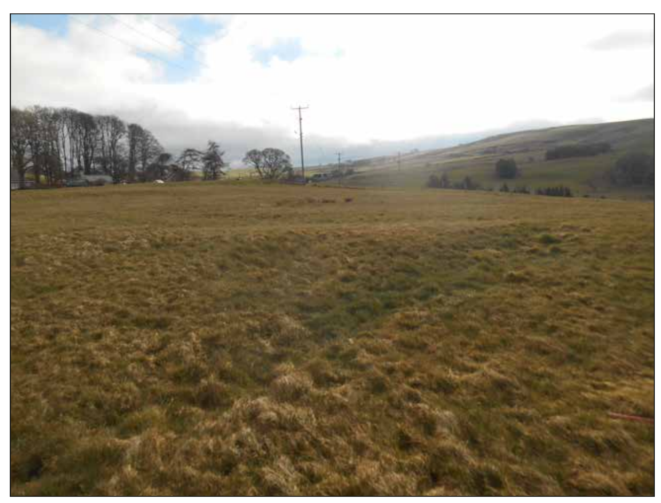
Plate 1. Bryn Teg, looking east.