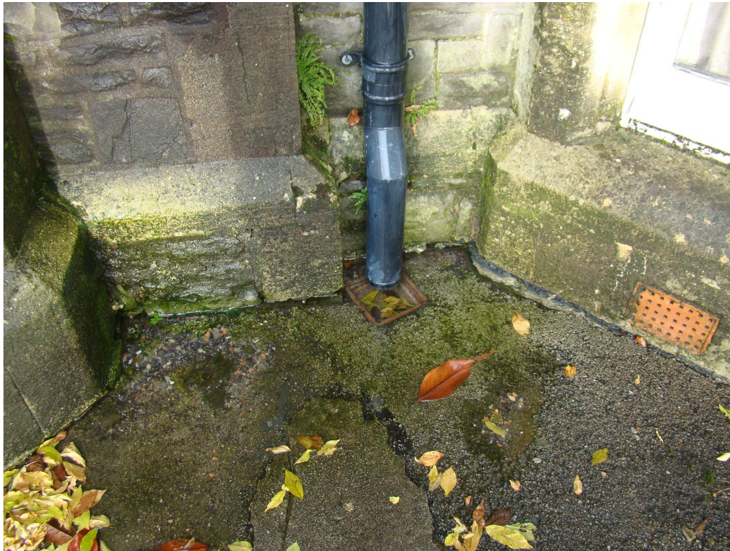
013 – blocked gully and tarmac area