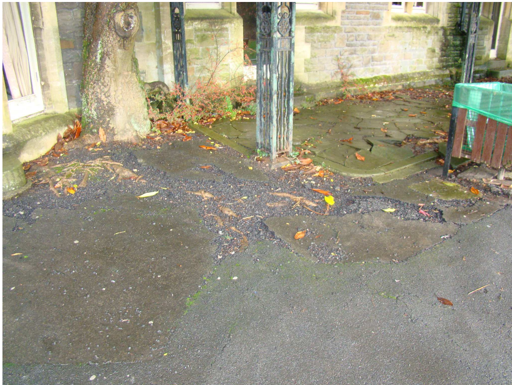
171 – tree roots penetrating foot path