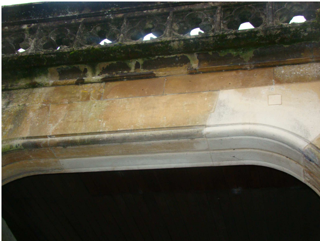
032- damage to head over main entrance