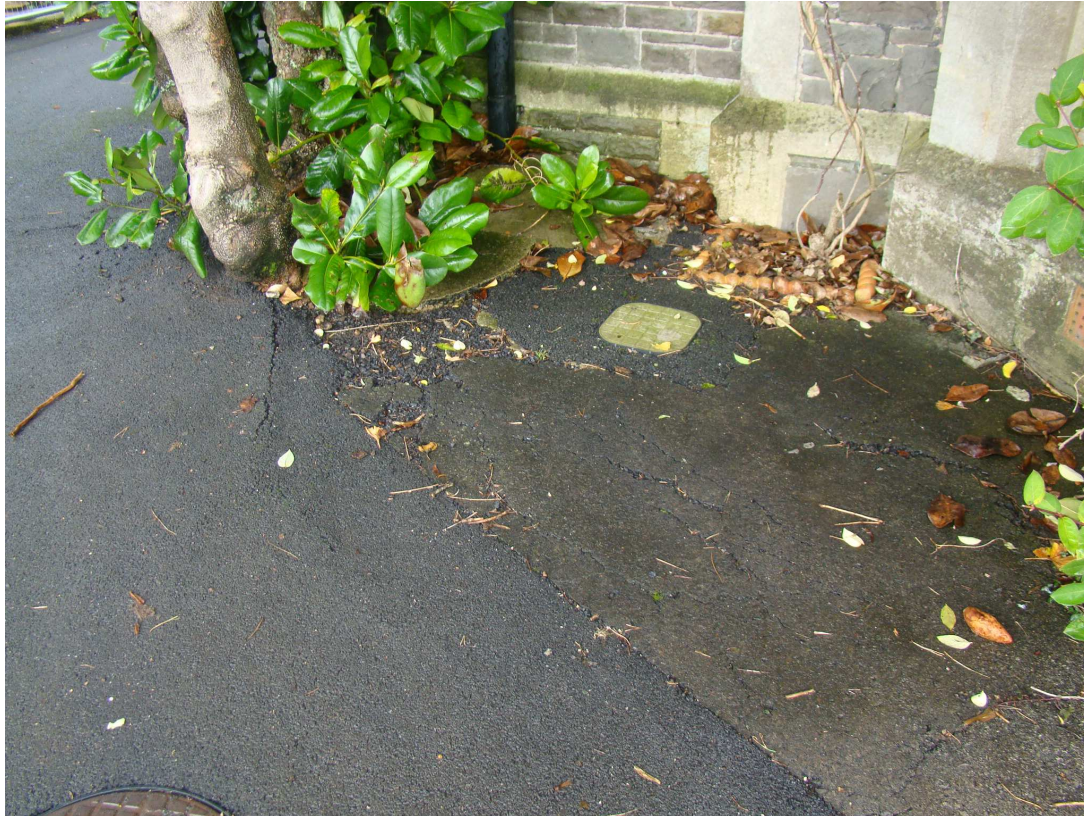
075 – gully blocked and damaged footpath