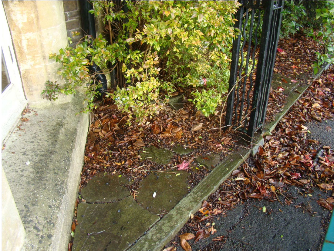
093 – paving to door