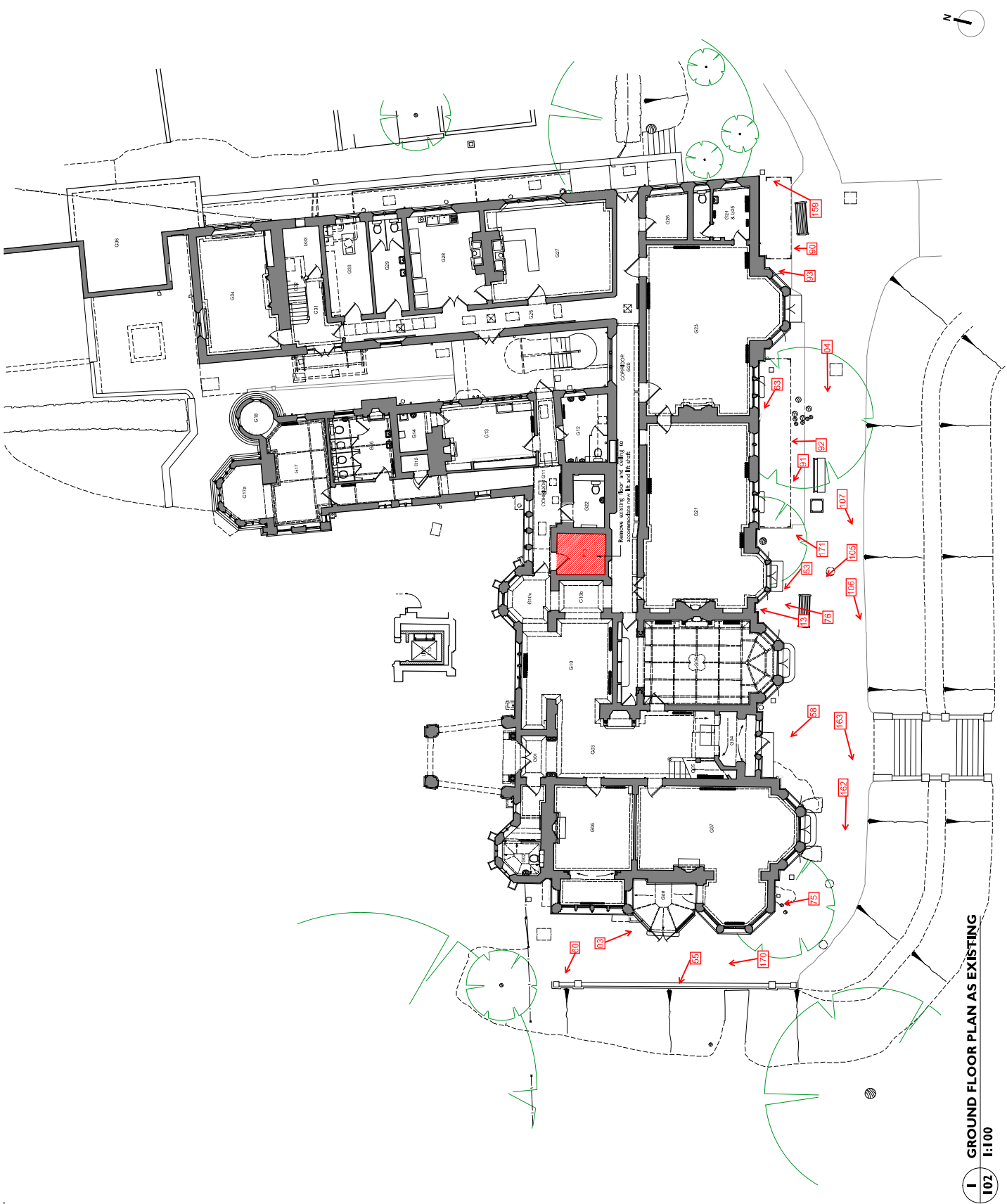
I GROUND FLOOR PLAN AS EXISTING 102 1:100