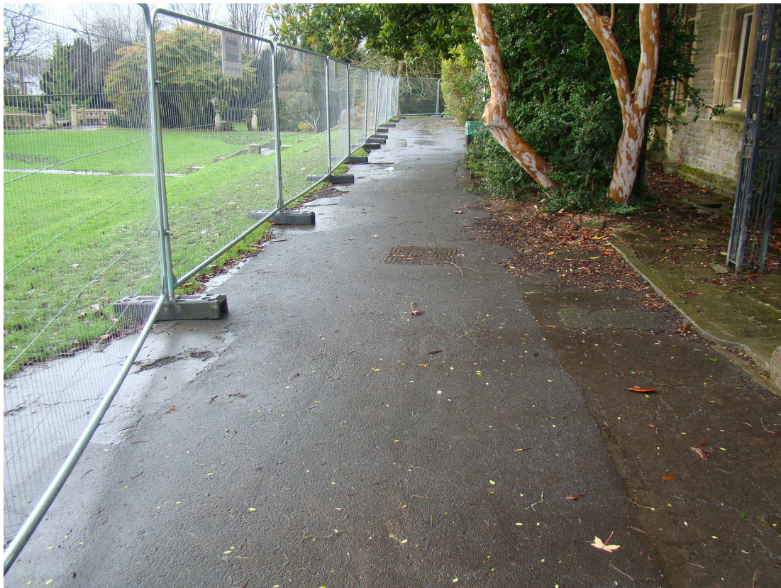
004 – area of undamaged footpath