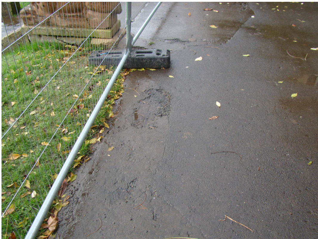
163 – tarmac damage to left hand side of steps