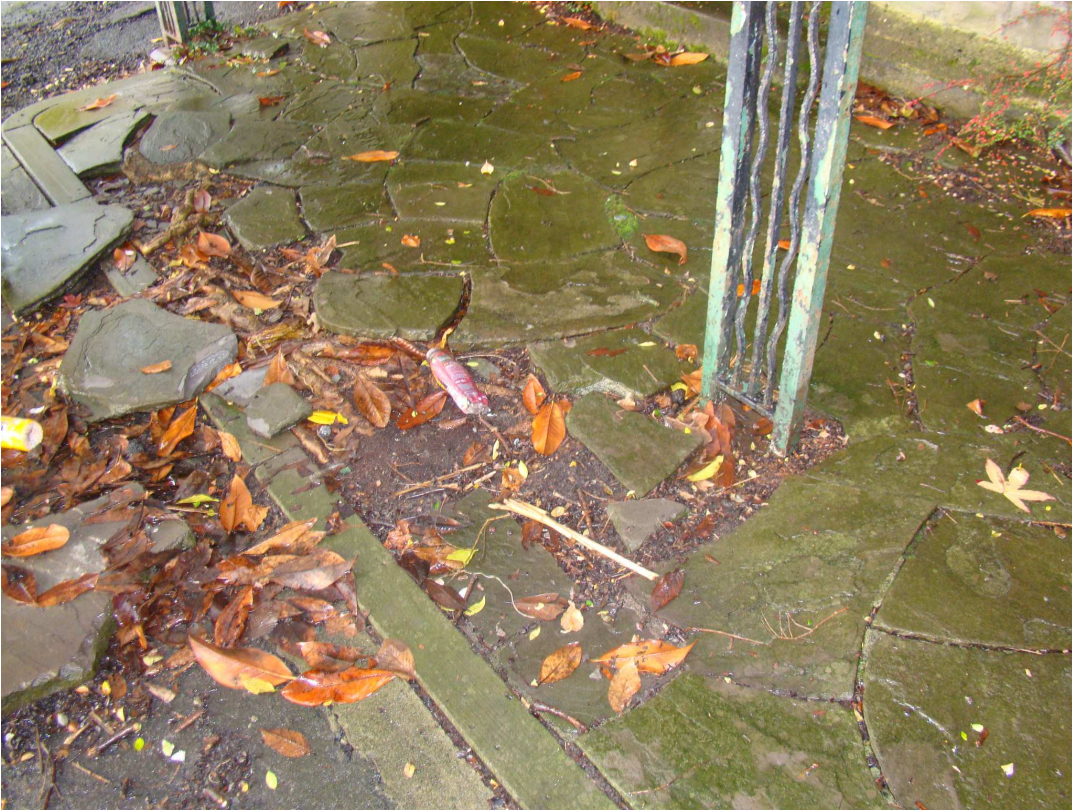
091 – paving lifted and damaged