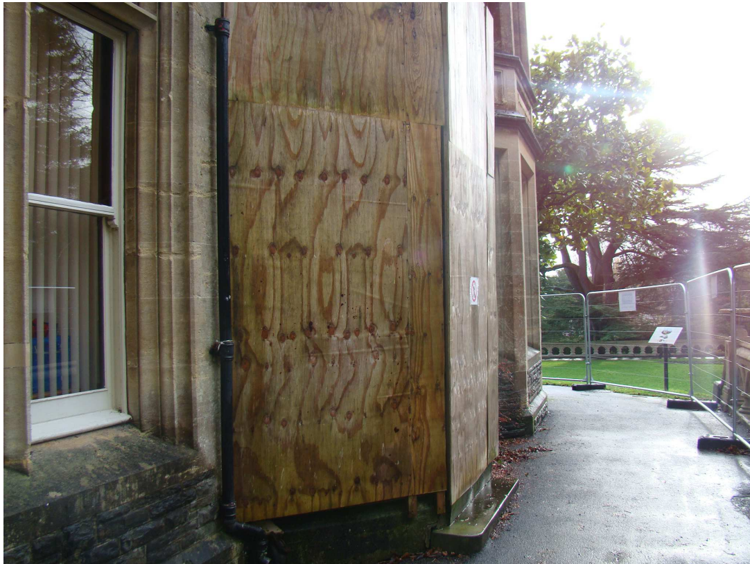
003 – area boarded up for safety reasons