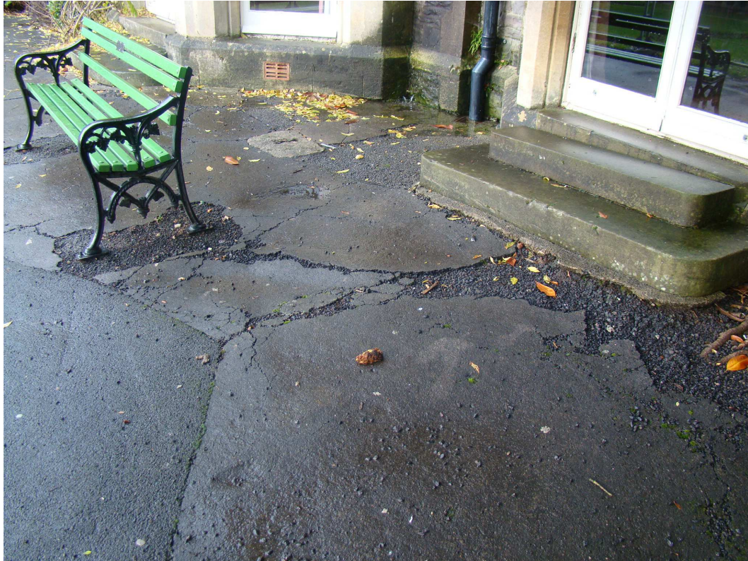
053 – footpath in front of door