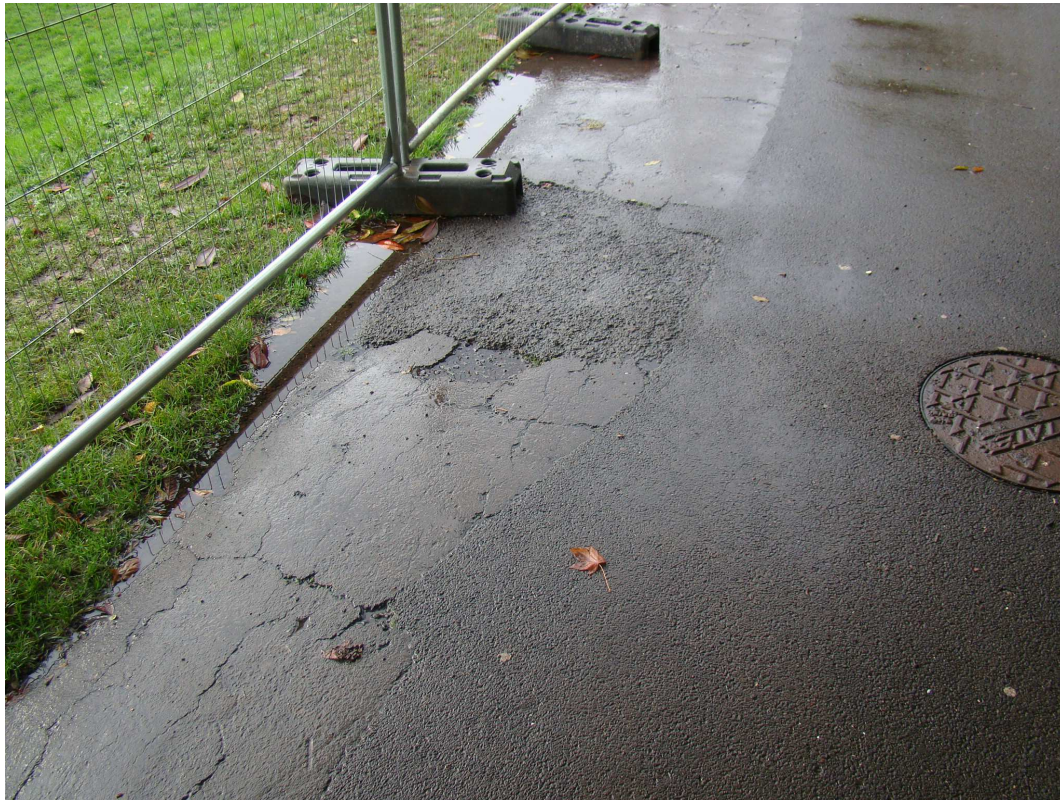
106 – poor repairs to tarmac