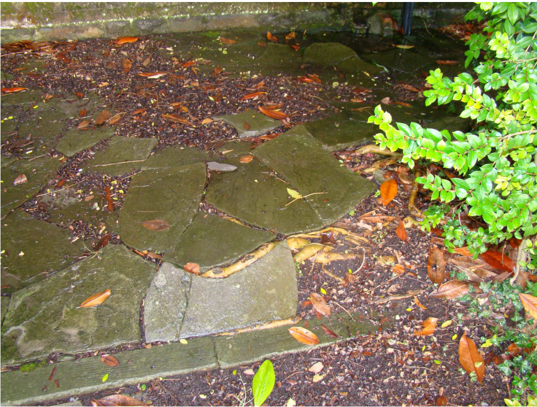
092 – paving lifting