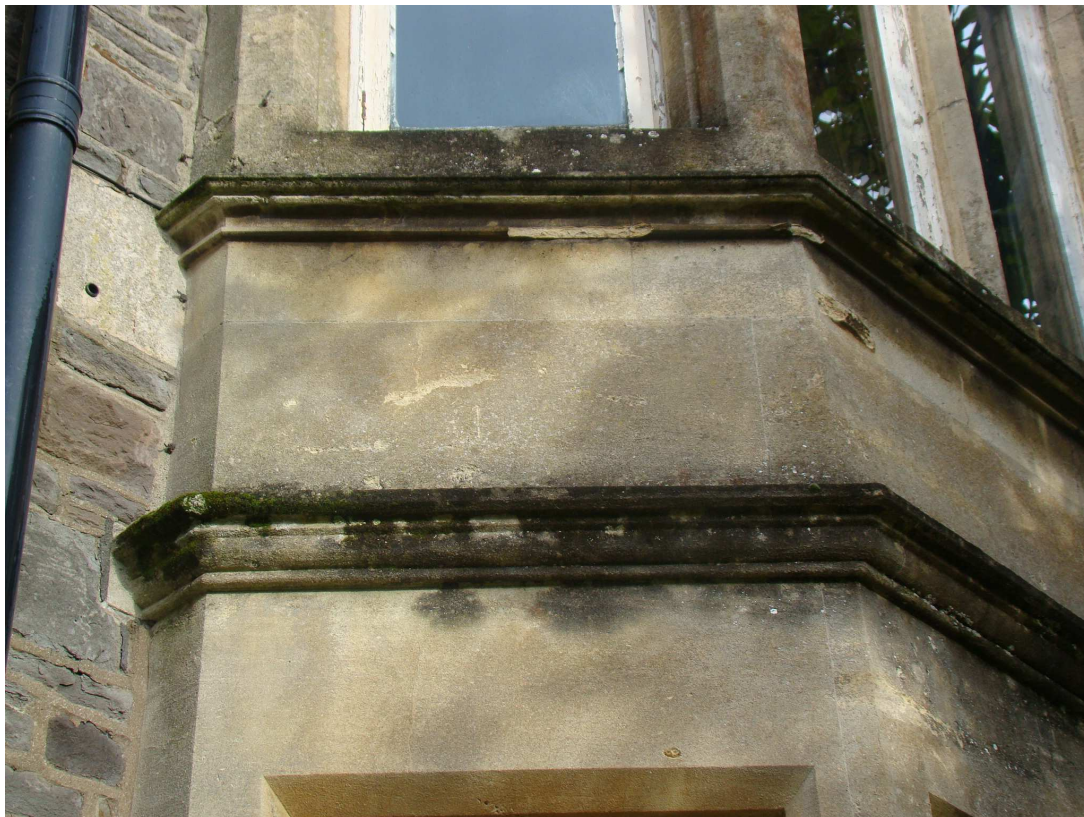
076 – high level damage to stone work