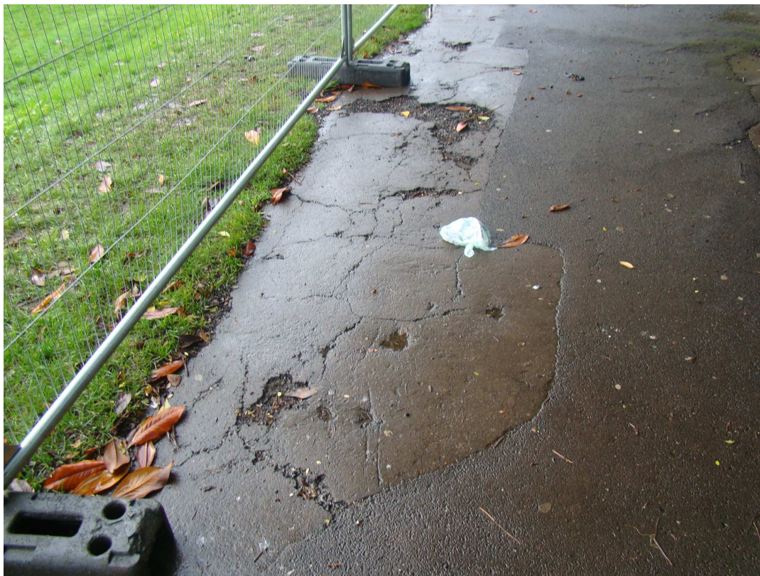
107 – poor repairs to footpath