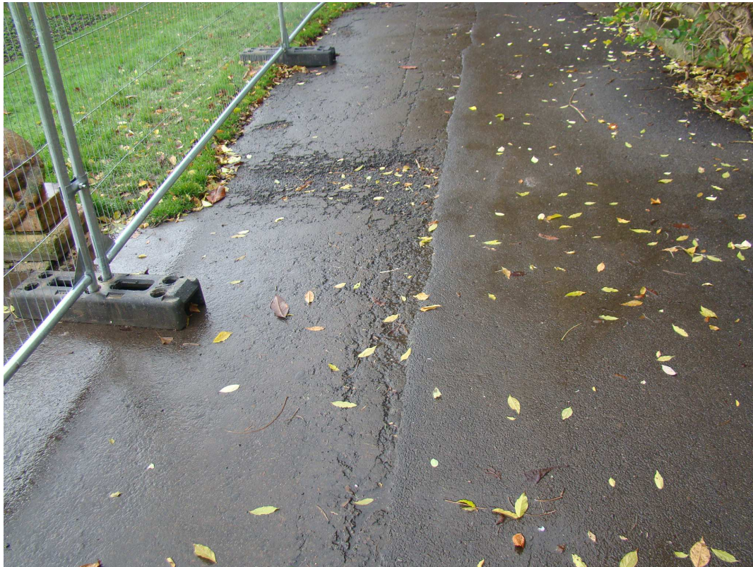
162 – tarmac damage to right hand side of steps