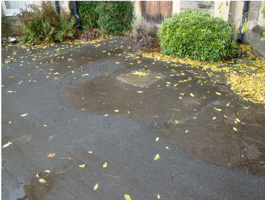
058 – footpath badly repaired