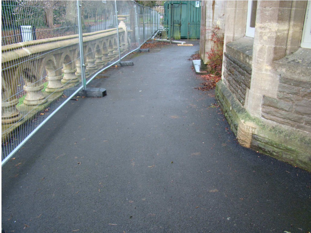
170 – tarmac to side of house has been replaced