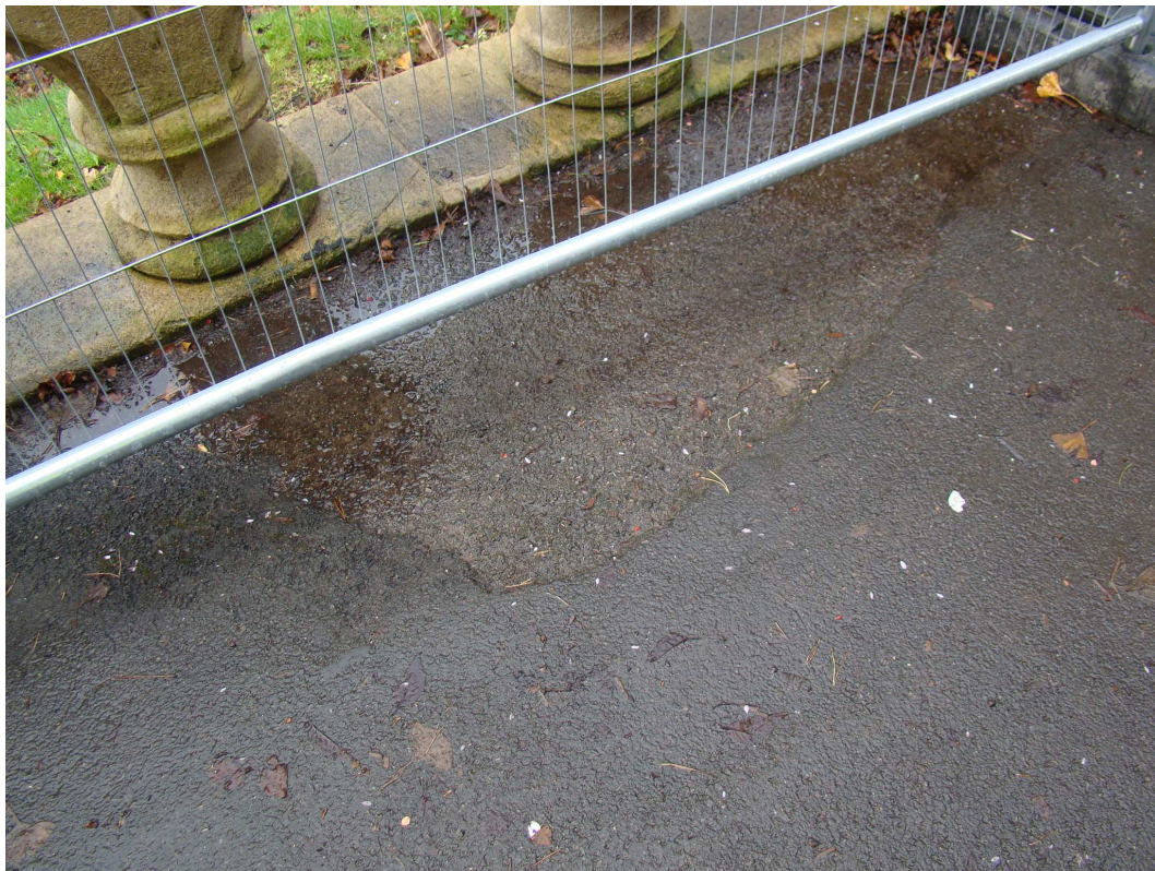
055 – footpath outside of office area