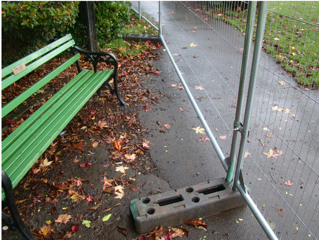
159 – tarmac damage in front of commemorative bench