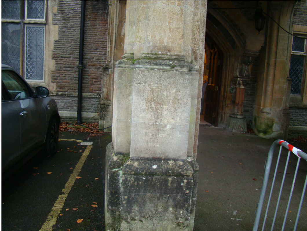
086 – Left hand column to porch