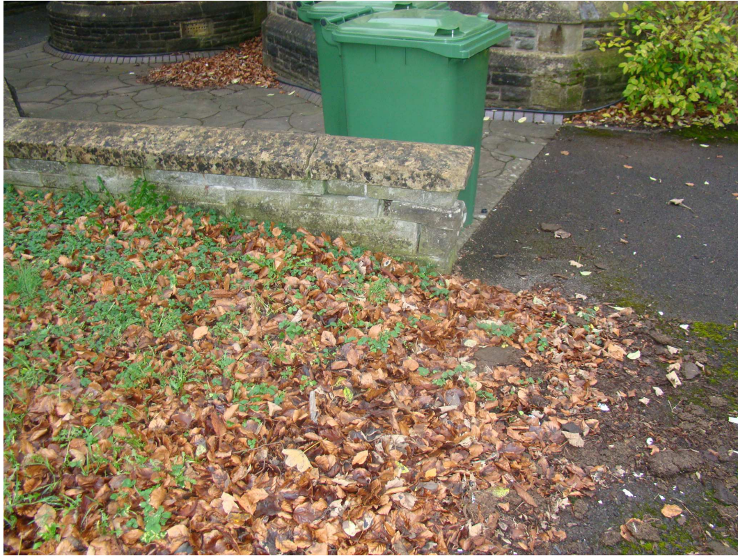
174 – wall damage to swiss wing area