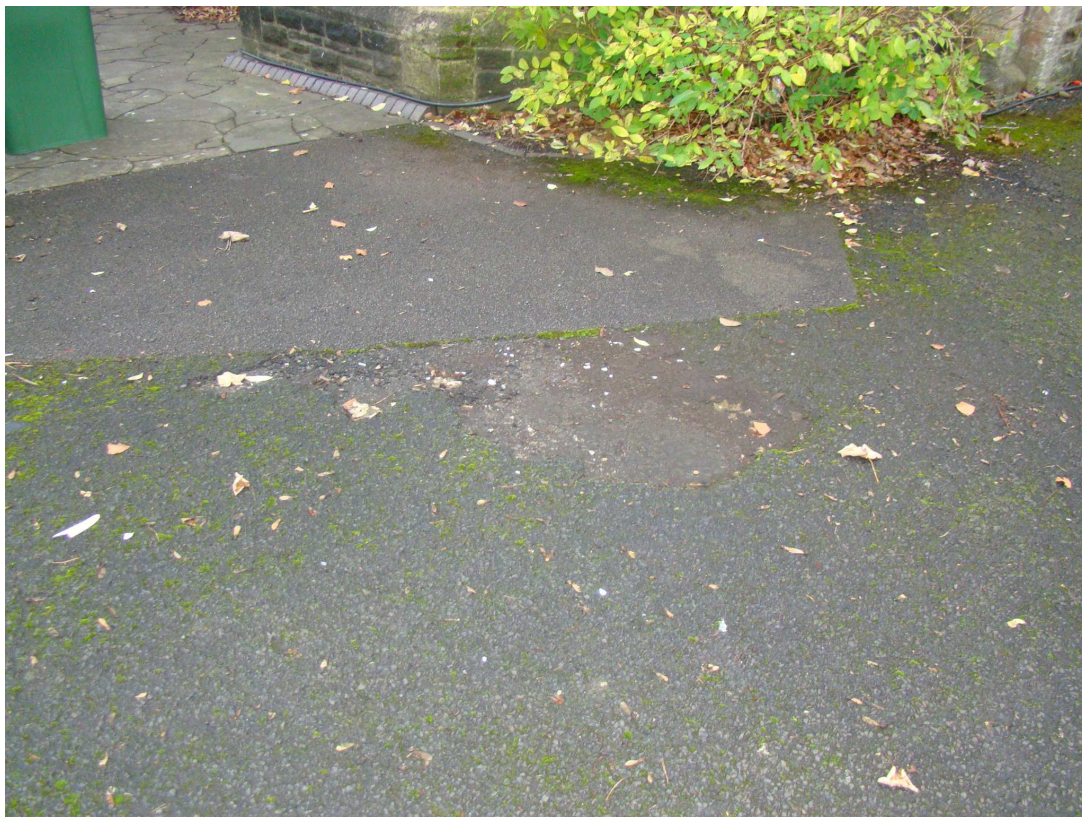
161 – tarmac damage to footpath to swiss wing