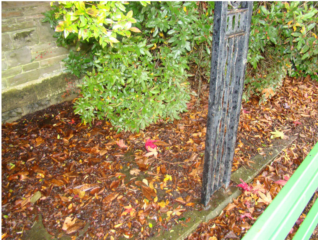
090 – paving damage