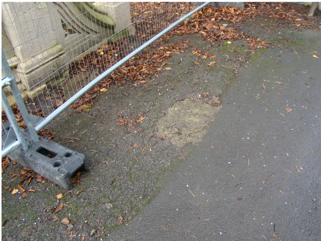
060 – footpath to outside of office