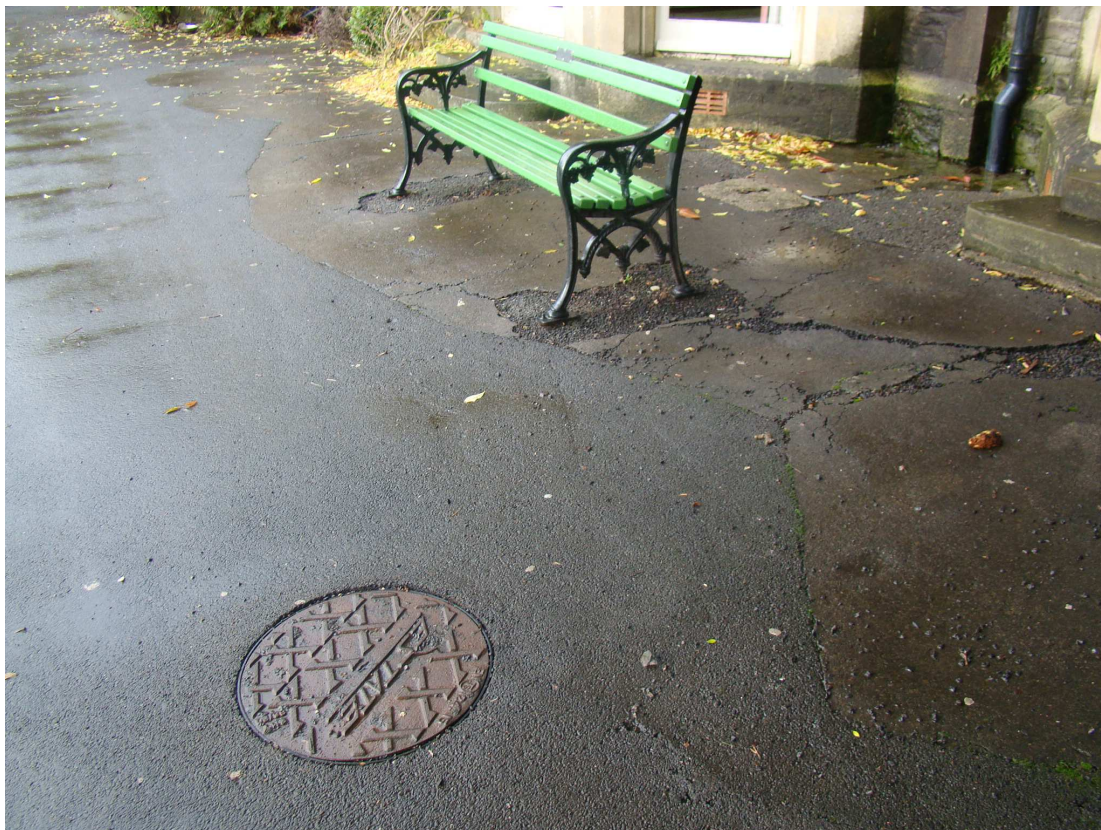
105 – poor repairs to tarmac foot path