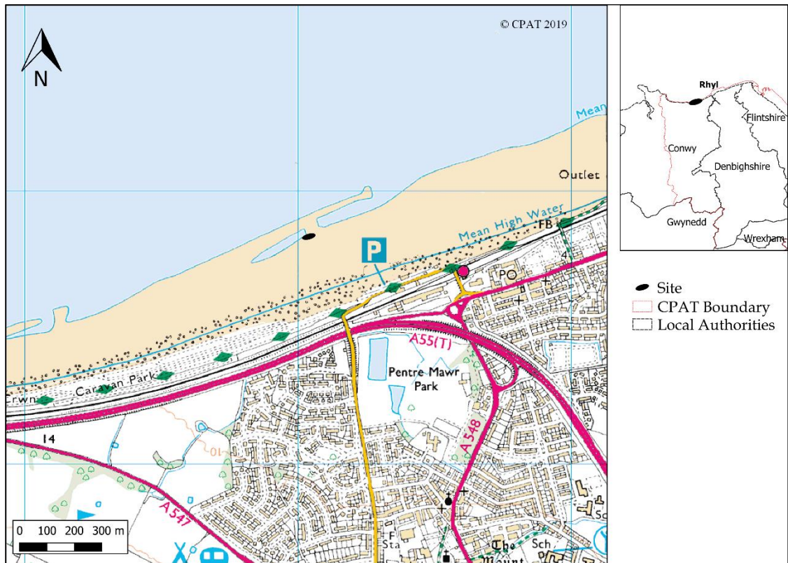
Contains Ordnance Survey data © Crown copyright and database right 2018