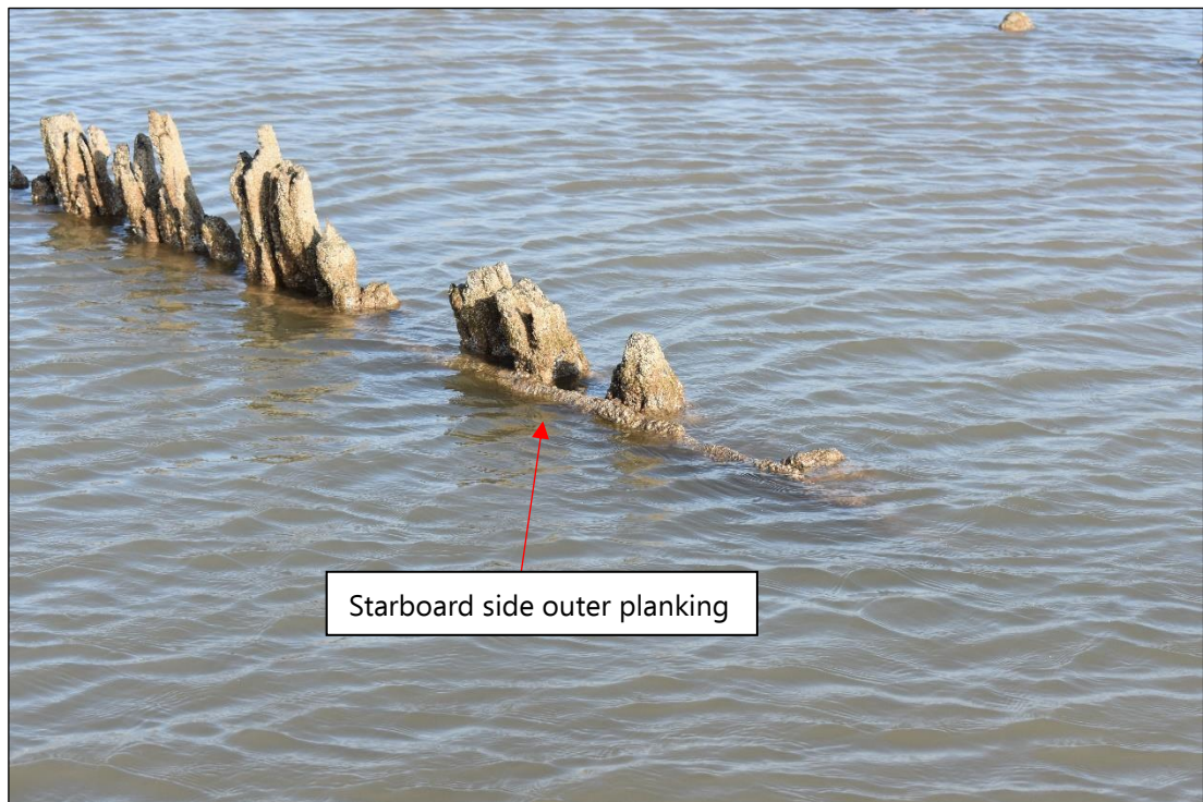
Fig. 5 Starboard side viewed from the north-west.