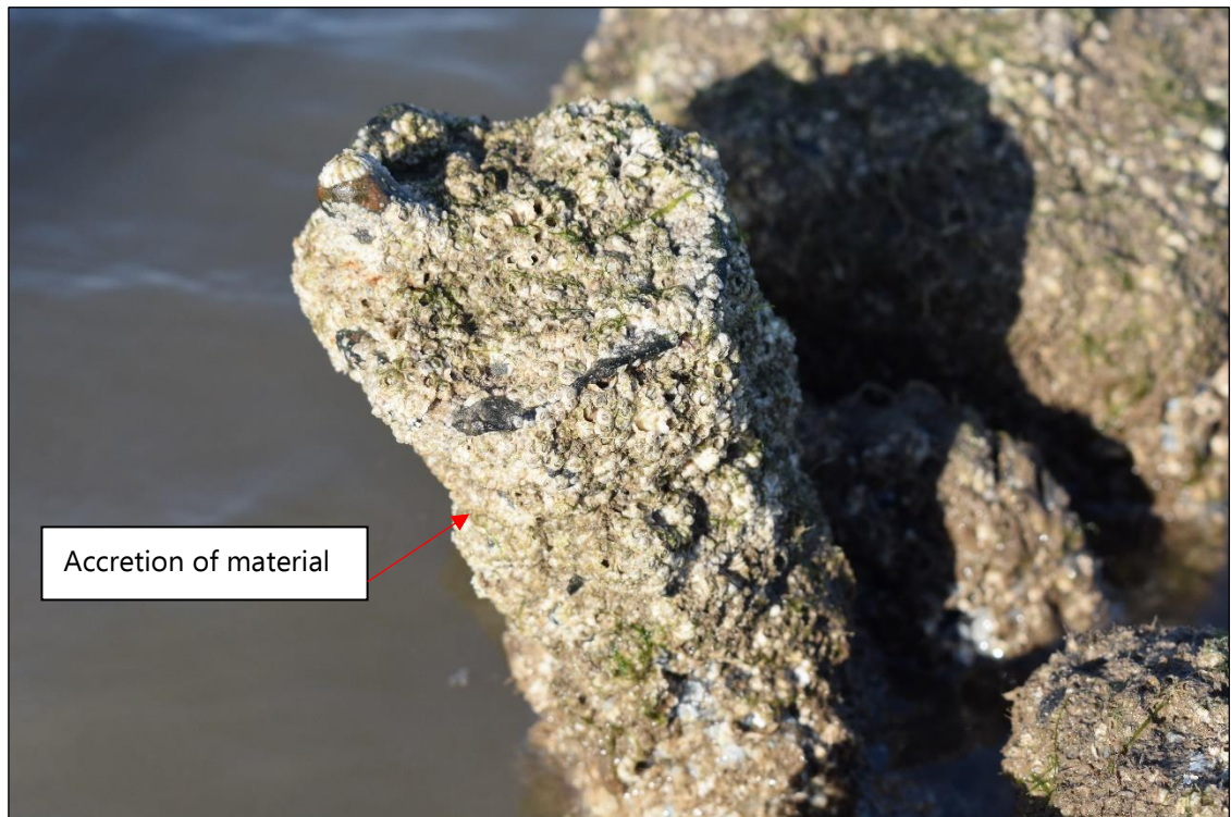
Fig. 7 Accretion materials of timber.