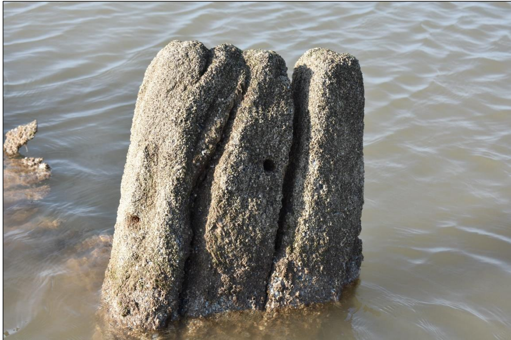
Fig. 3 Sternpost viewed from the south 4674-0004