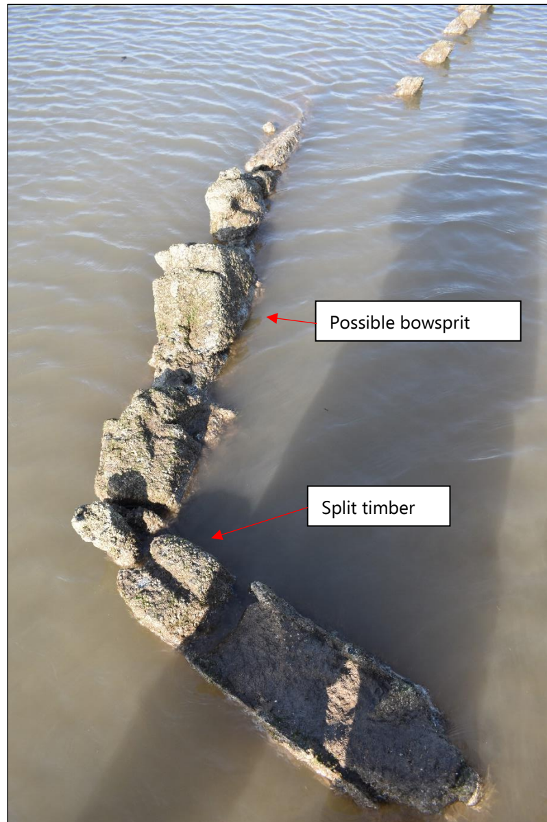
Fig. 6 Timber, extending beyond the bow, viewed from the west.