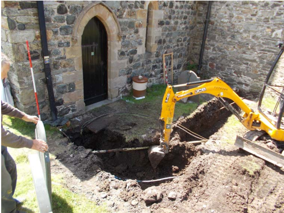
Plate 1: General view of work in progress on foundations, looking south-east. Scale 2m