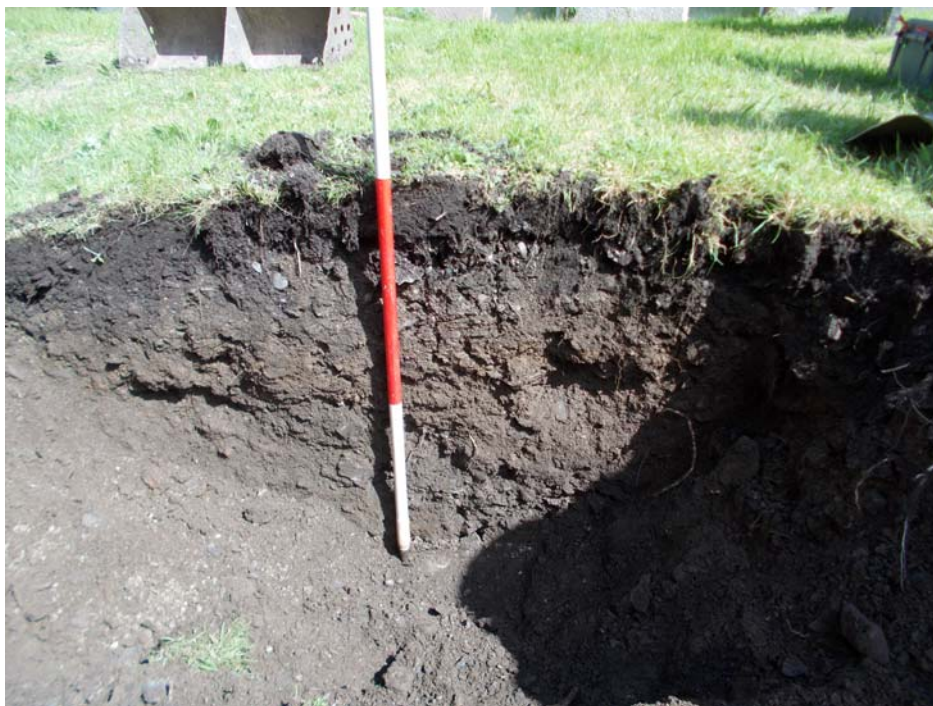
Plate 4: Section of cutting into raised area, looking north. Scale in 0.5m divisions