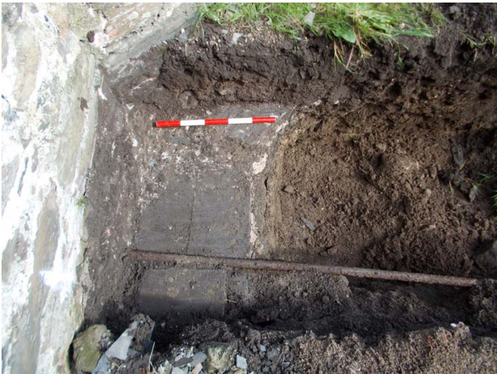
Plate 2: Detail of stone and slate foundation (3) for north transept, looking north. Scale 0.5m