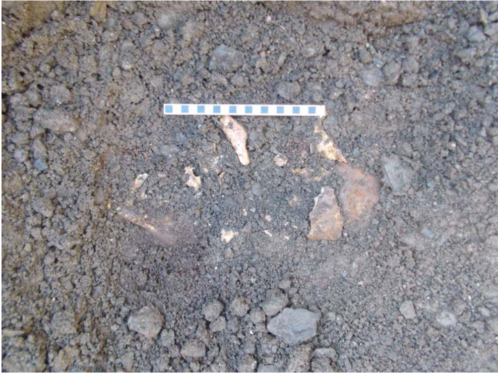
Plate 5: Part of skeleton (7) uncovered. Note skull and left shoulder, looking north. Scale 0.2m