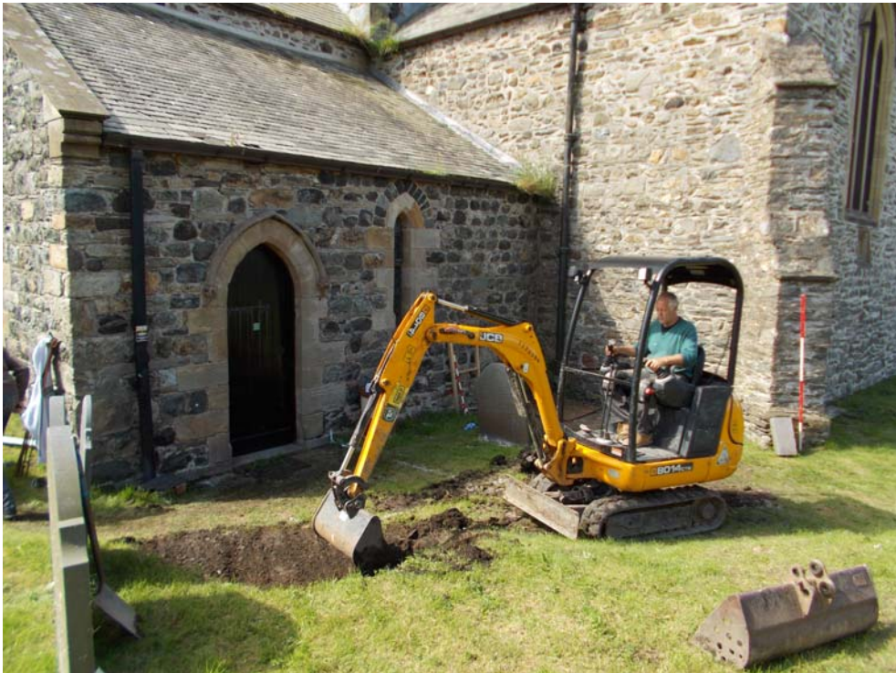
Plate 3: General view of machine work on cutting into raised area, looking south-east. Scale 2m