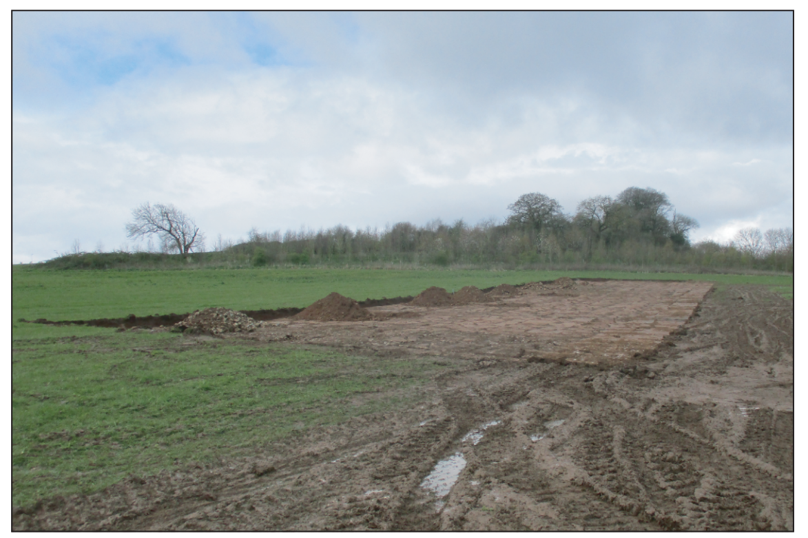
Area of observed groundworks during excavation, looking west