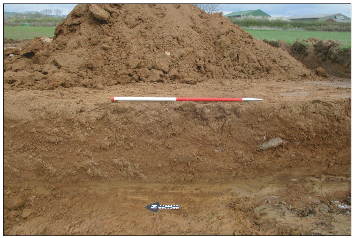
Representative section showing site stratigraphy, looking east (1m scale)