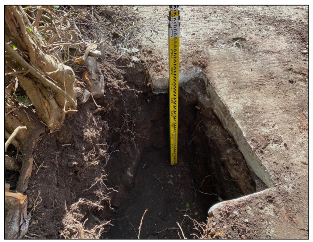
Plate 6. Test Pit 6 (view southwest)