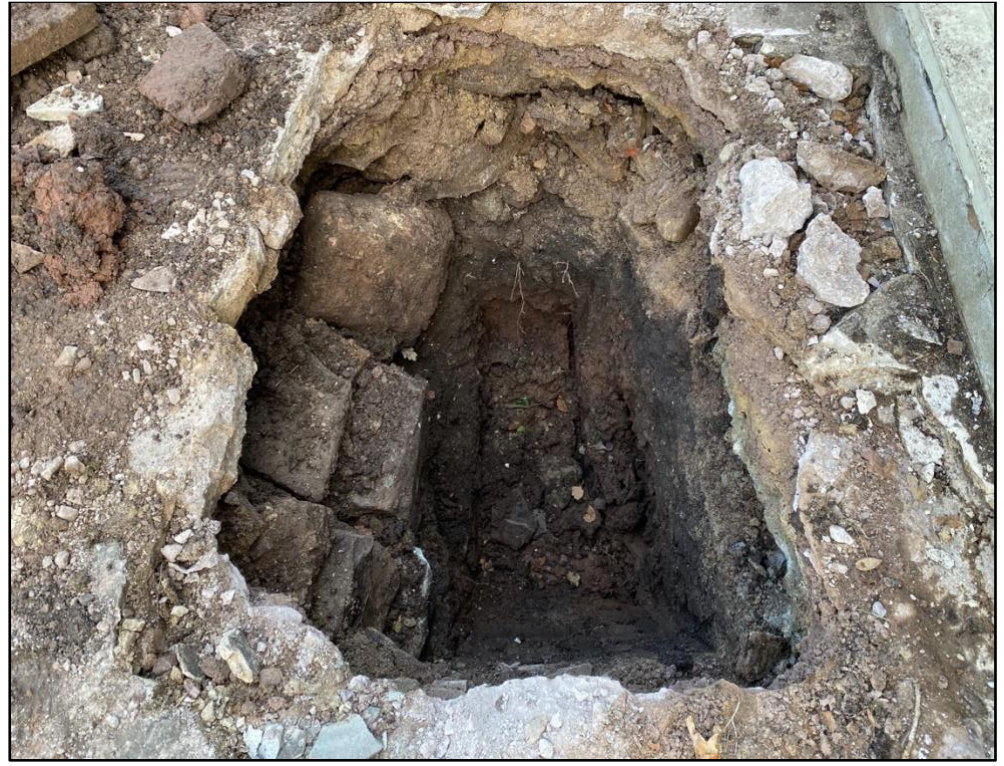
Plate 2. Plan view of Test Pit 2 showing wall [203] running along its northern edge (view east)