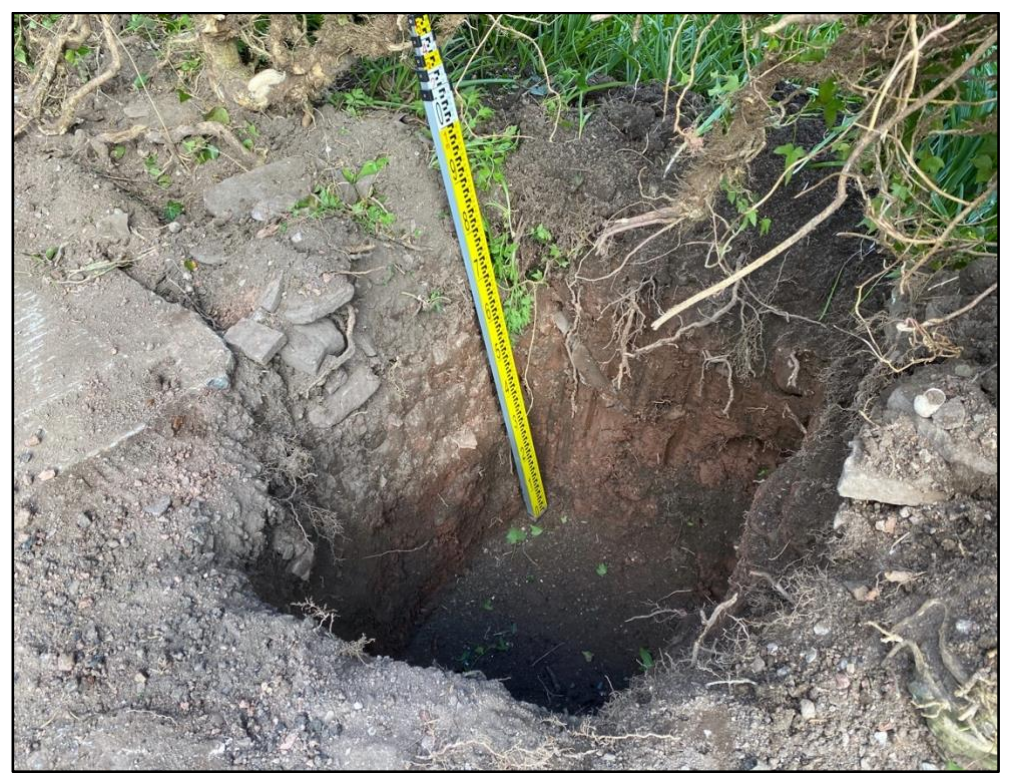
Plate 7. Test Pit 7 (view northeast)