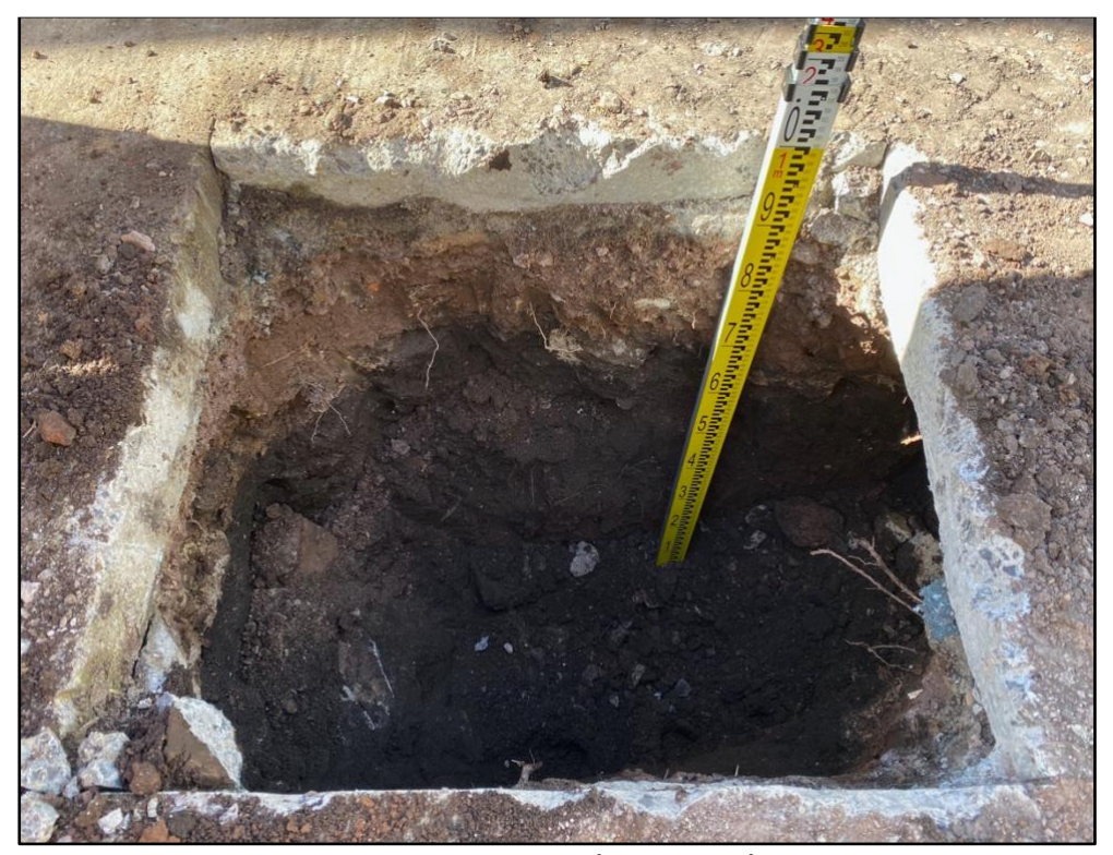
Plate 4. Test Pit 4 (view north)