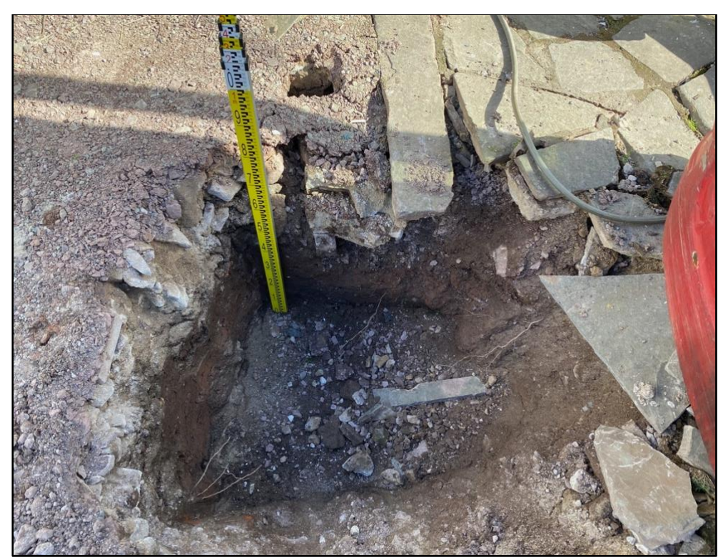
Plate 3. Test Pit 3 (view north)