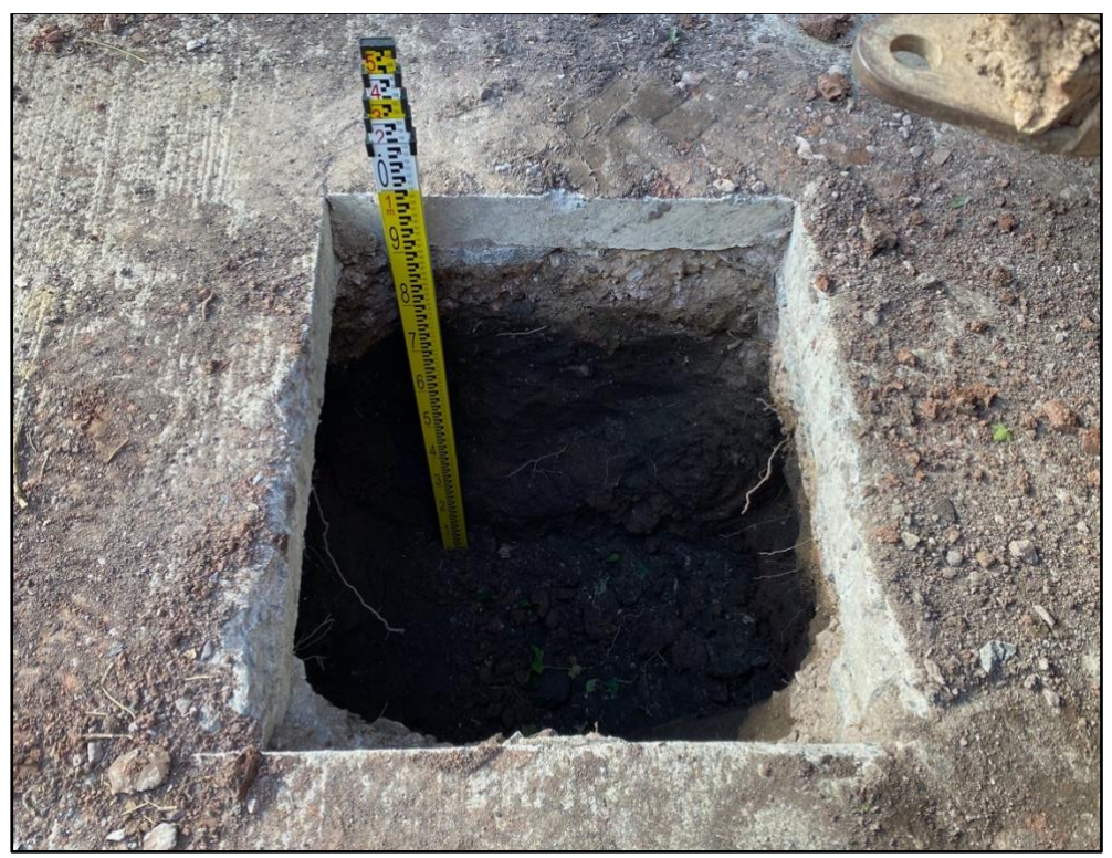
Plate 5. Test Pit 5 (view north)