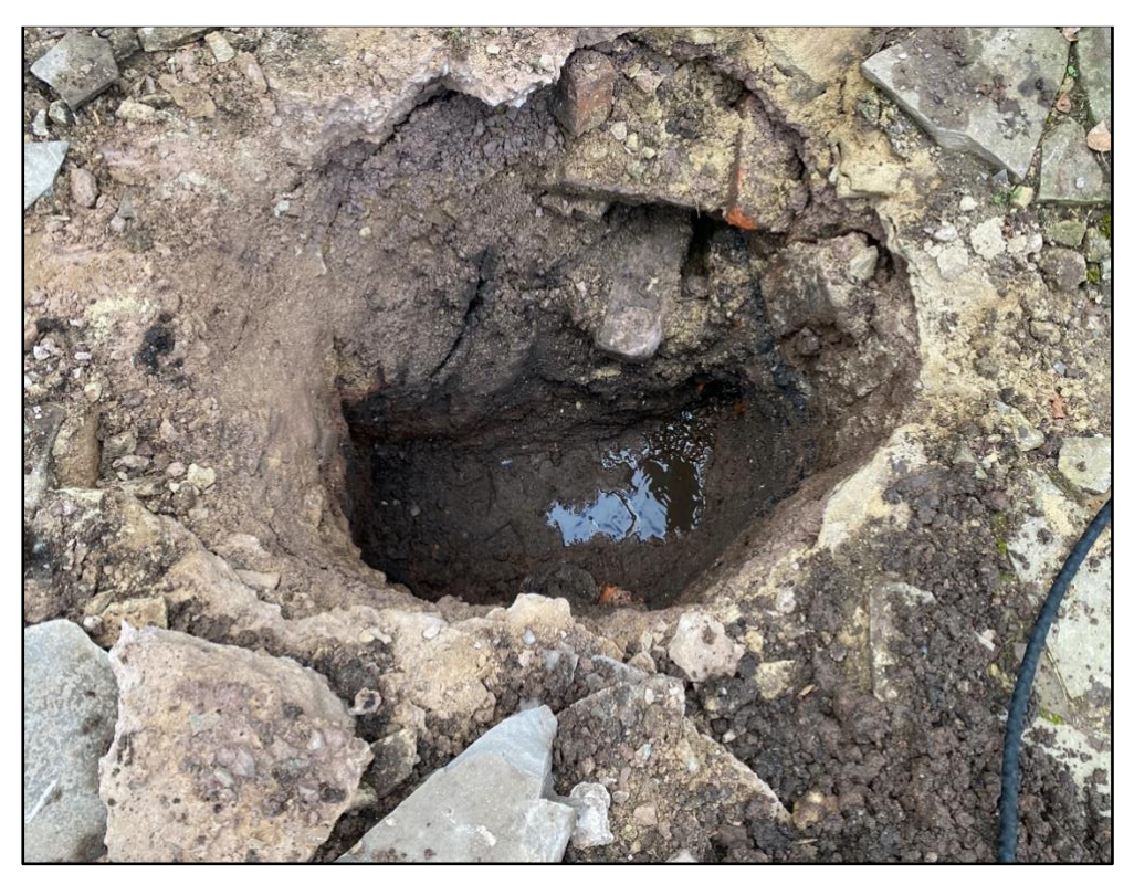
Plate 1. Plan view of Test Pit 1, with wall [102] running along its northern edge (view north)