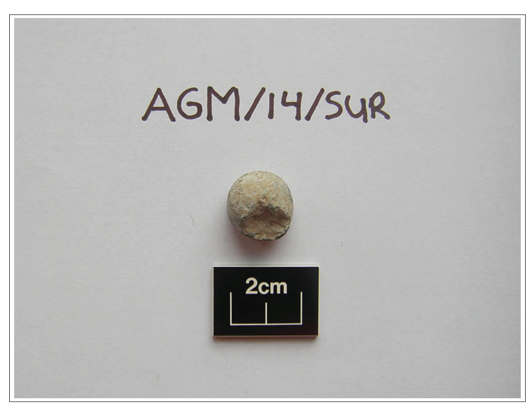
Plate 9: Small Find No. 1 - Musket Ball, reverse side