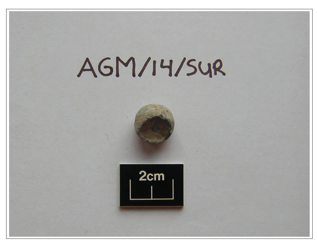
Plate 8: Small Find No. 1 - Musket Ball