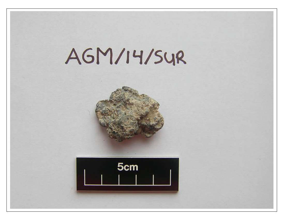
Plate 10: Small Find No. 2 - Scrap Lead