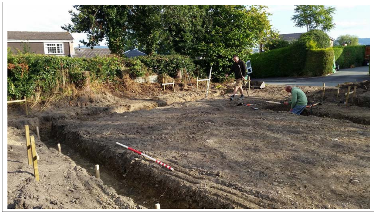
Plate 6: View north west across assessment area after cutting of foundation trenches Scale 1x2m