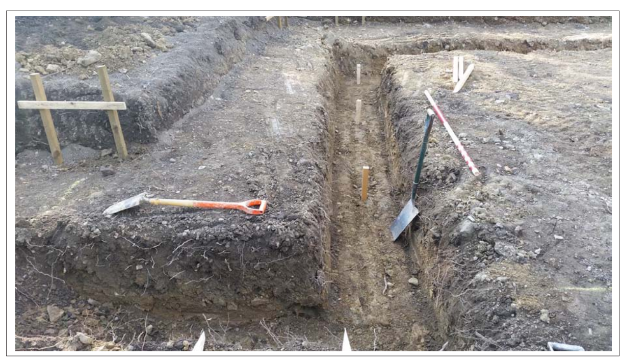
Plate 7: Example view of foundation trench showing dimensions/depth, Looking north west. Scale 1x2m