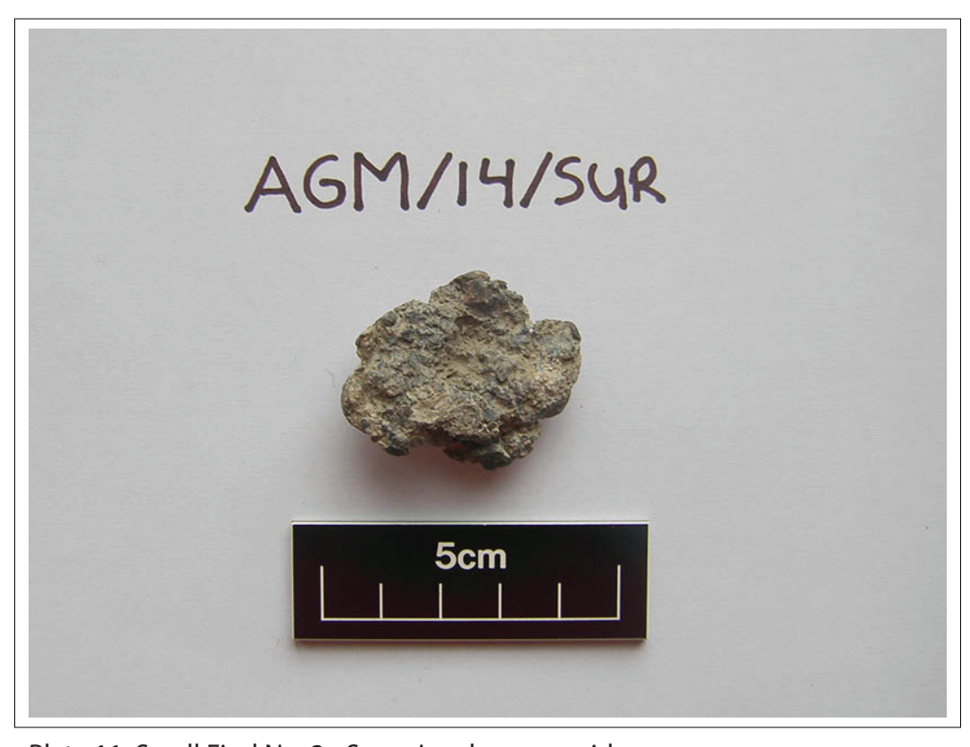
Plate 11: Small Find No. 2 - Scrap Lead, reverse side