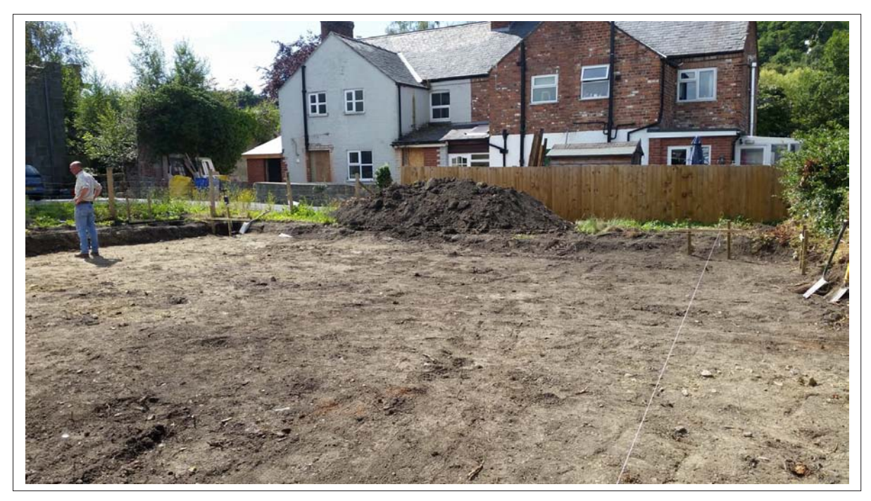
Plate 1: View south across assessment area after levelling fo ground