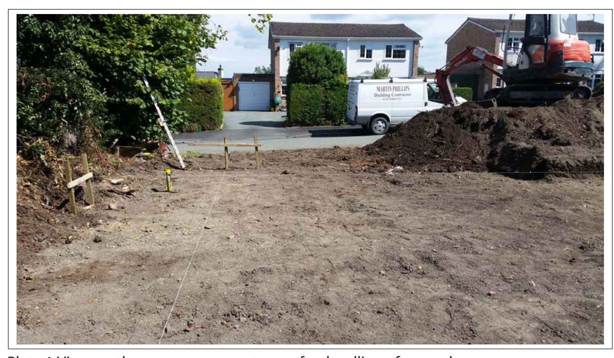
Plate 4: View north across assessment area after levelling of ground