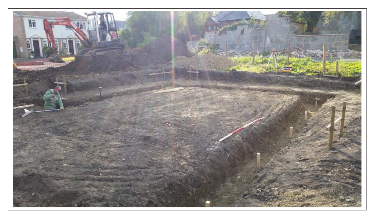
Plate 5: View north east across assessment area after cutting of foundation trenches Scale 1x2m