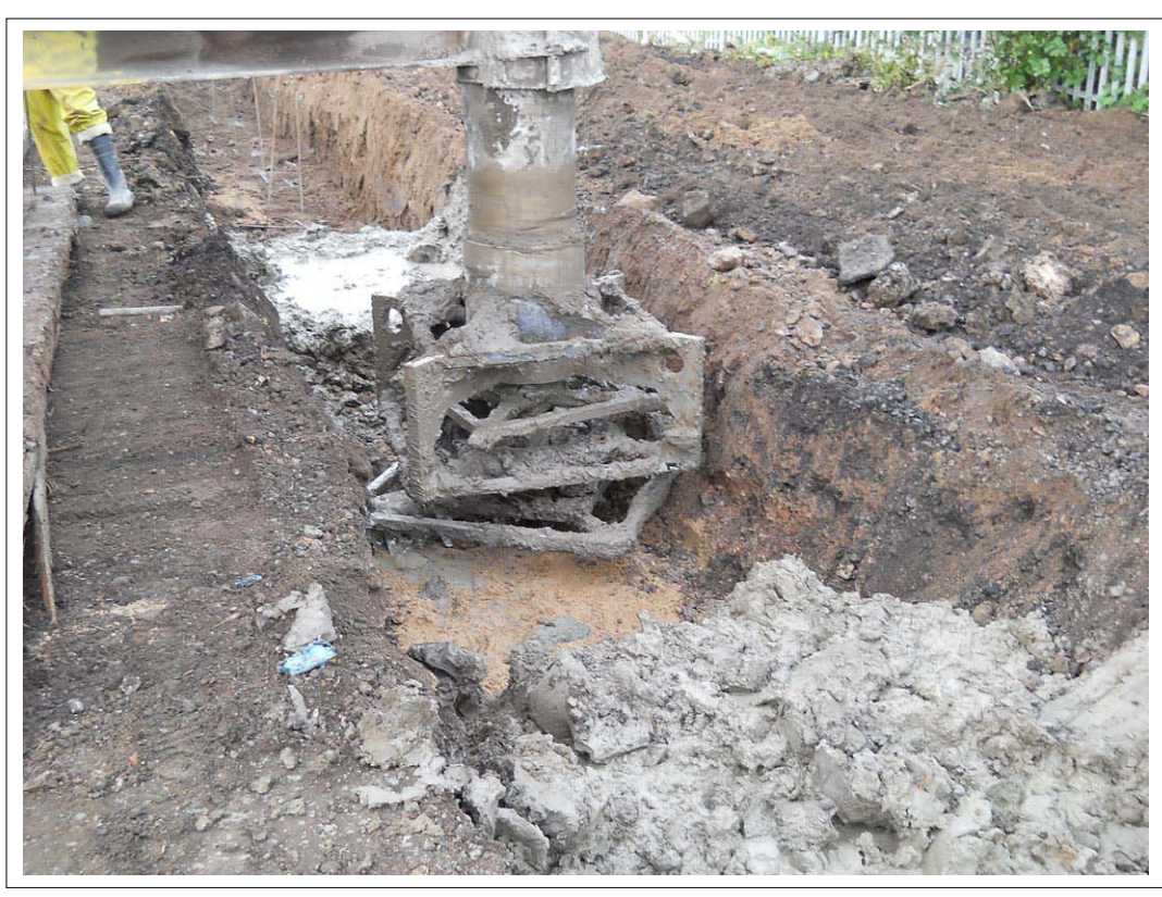
Plate 11: View of soil mixing within Area 3.