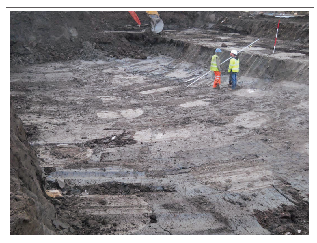
Plate 1: View of maximum depth within Area 1. Scale 1x2m