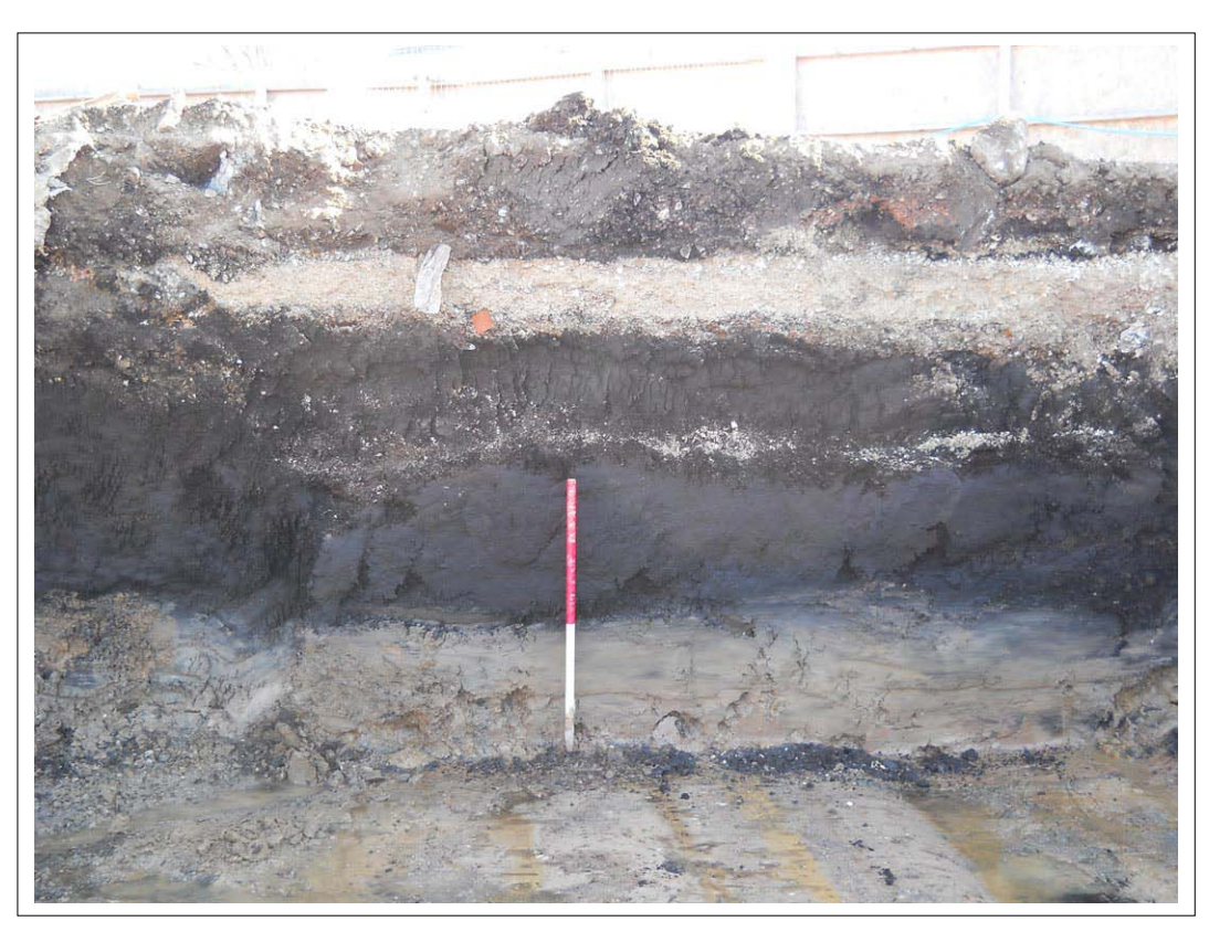
Plate 9: View of sample section within Area 3 showing disturbed overburden above peat layer. Scale 1x1m