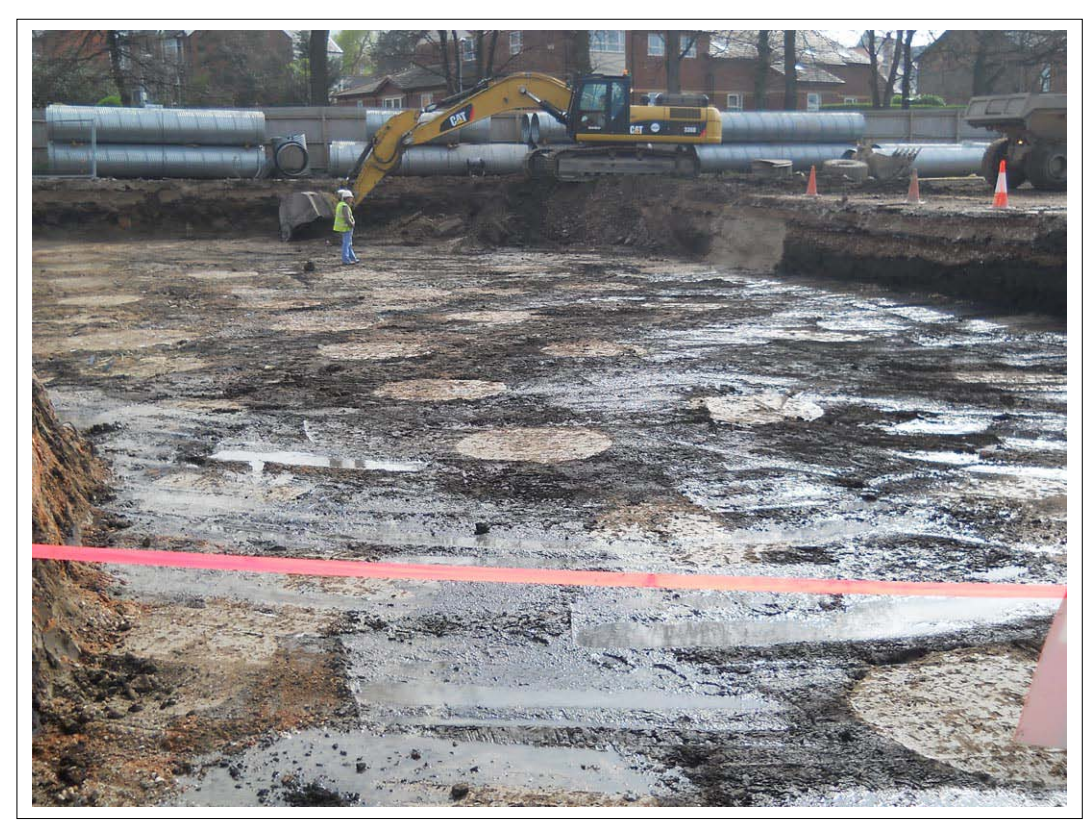
Plate 6: General view of Area 3 under excavation