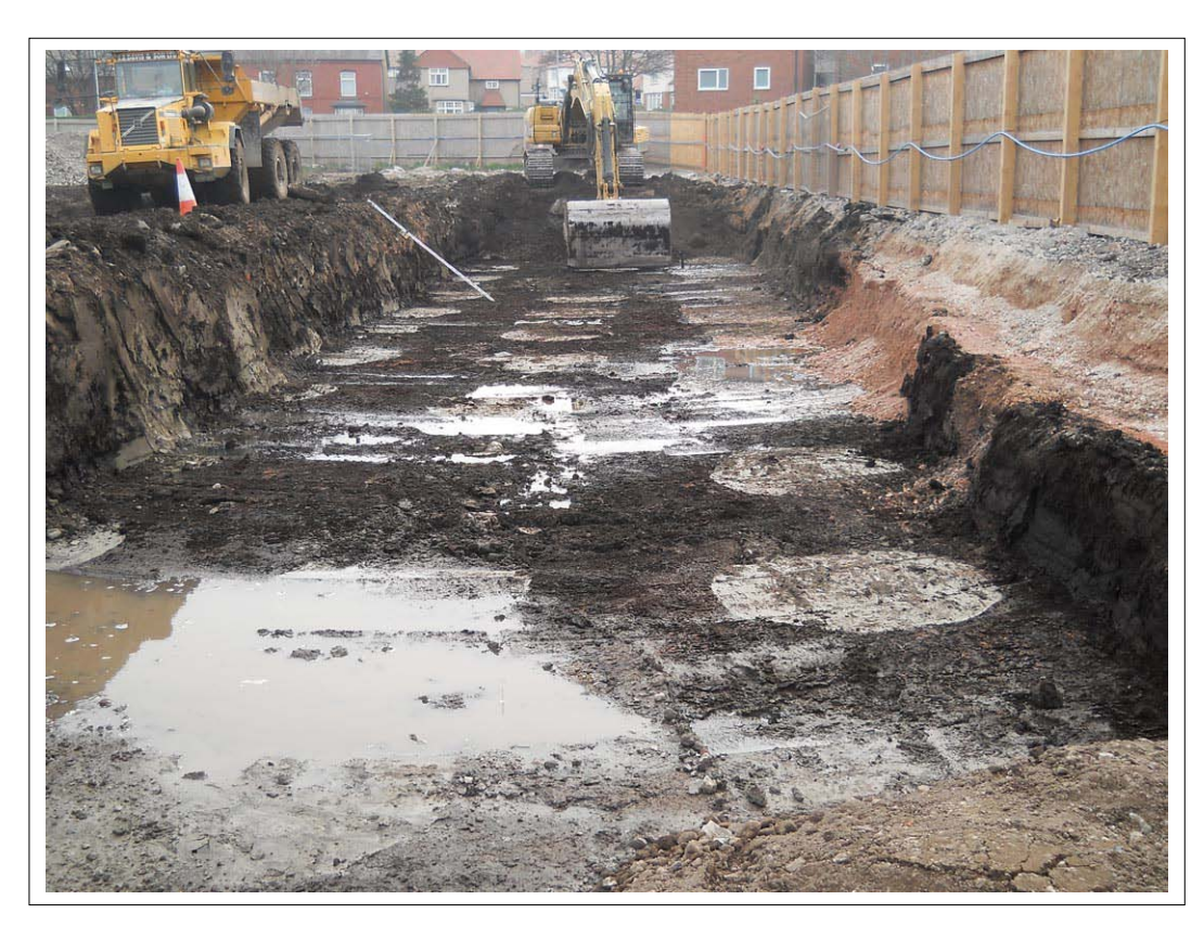
Plate 8: View of Area 3 under excavation