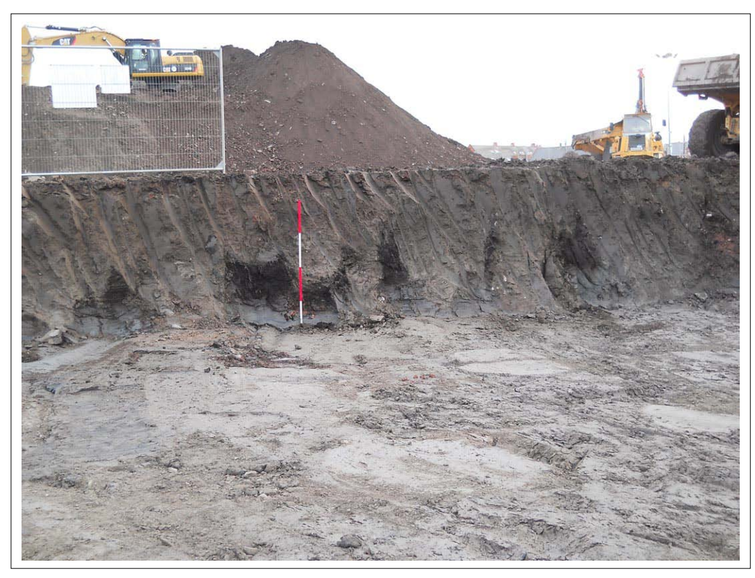
Plate 3: View of section edge within Area 1 showing intermittent peat deposits Scale 1x2m