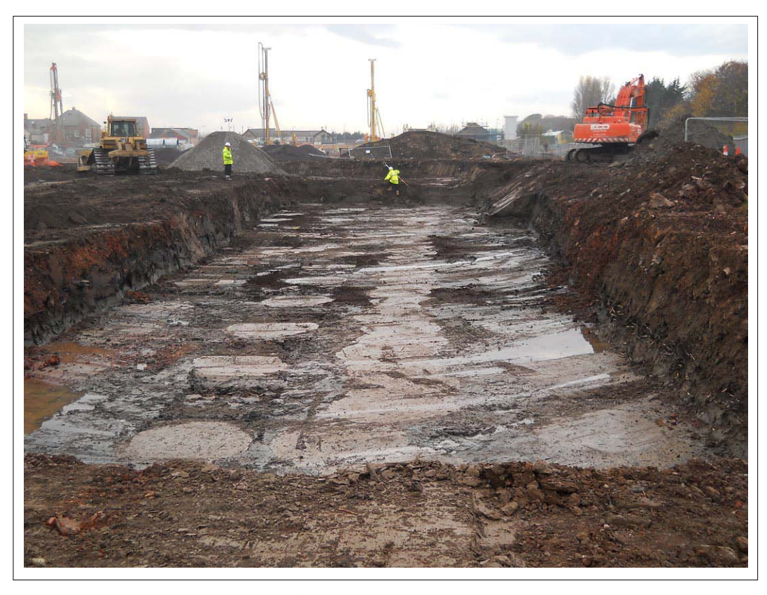
Plate 4: Post excavation view of Area 2, Note more consistent peat deposits within sections