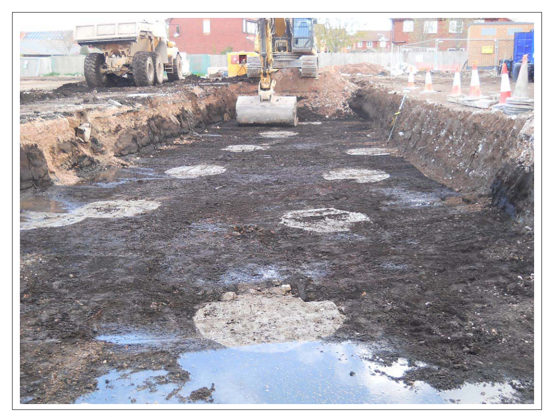
Plate 7: View of Area 3 under excavation