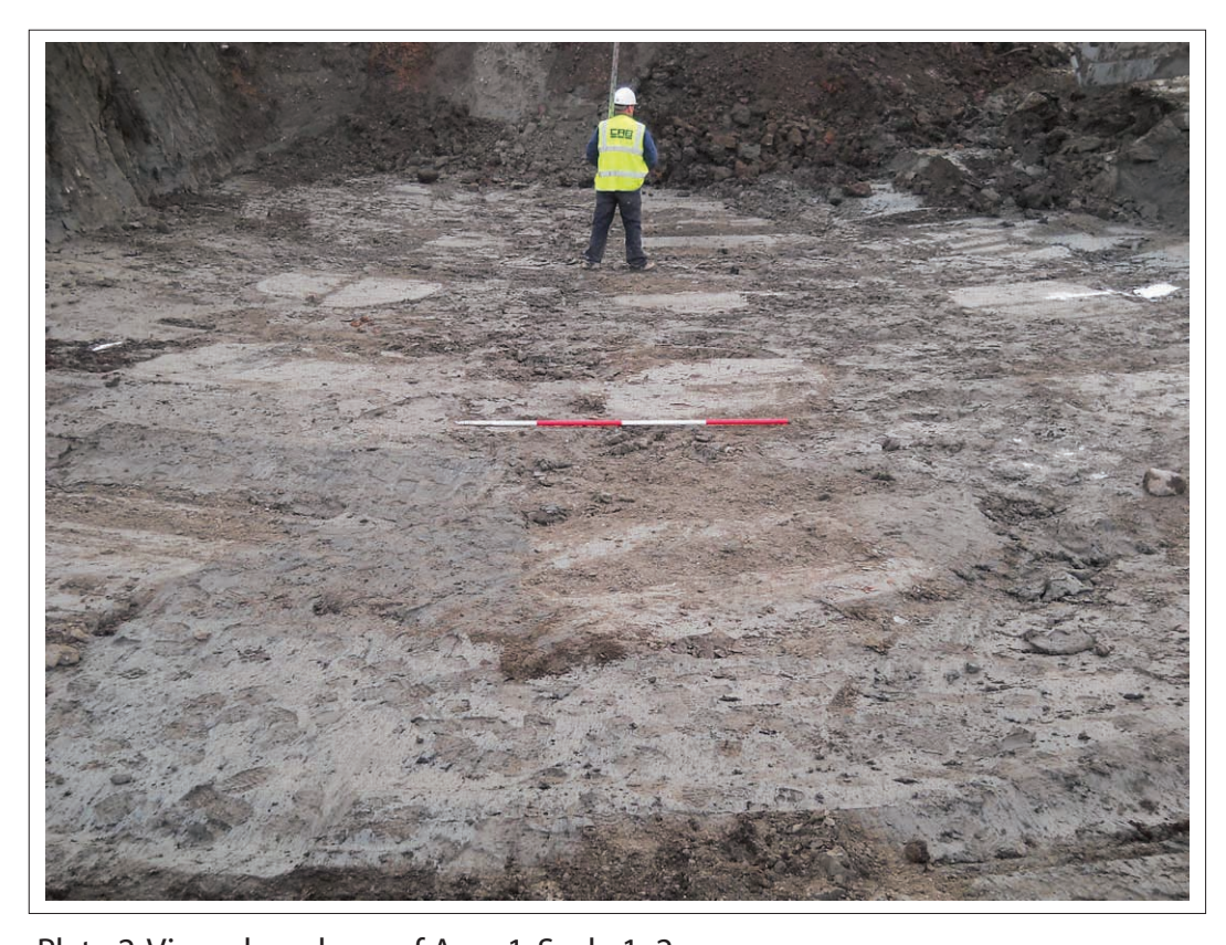
Plate 2: View along base of Area 1, Scale 1x2m