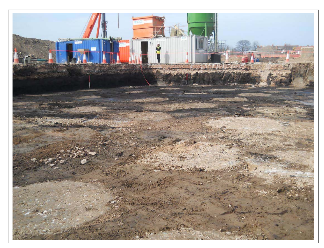
Plate 5: General view across Area 3, Scales 2x1m