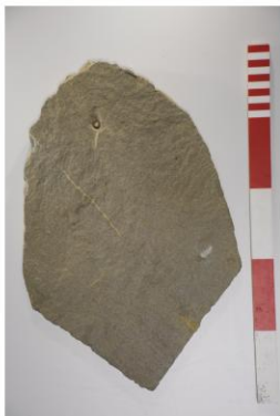
27. Abermagwr Slate ABR15 119 G - 4.jpg