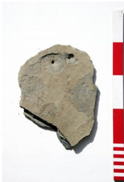
07. Abermagwr Slate ABR11 082 - E 4.jpg