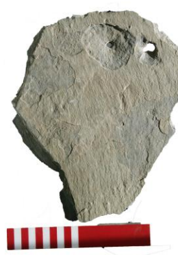
07. Abermagwr Slate ABR11 082 - E 3 crop.tif