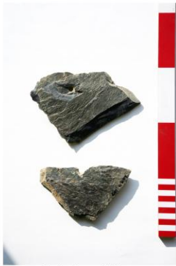
14 and 15. Abermagwr Slate - lower ABR10 003 - upper ABR11 037...