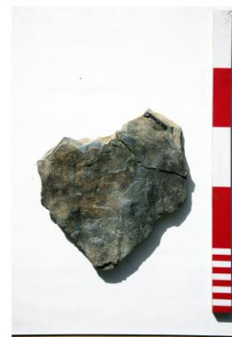
20. Abermagwr Slate ABR10 - 014 2.jpg