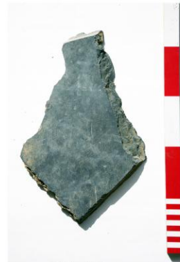
08. Abermagwr Slate ABR10 004 - 1 marked.JPG