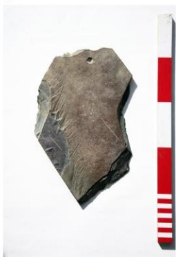
02. Abermagwr Slate ABR11 038 - 1 marked.JPG