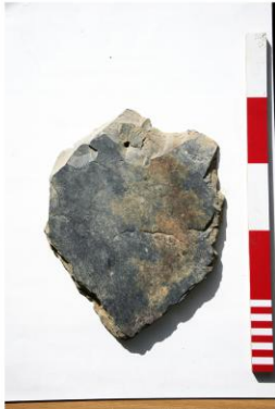
05. Abermagwr Slate ABR11 083 C - 1.jpg