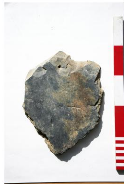
05. Abermagwr Slate ABR11 083 C - 1 marked.JPG