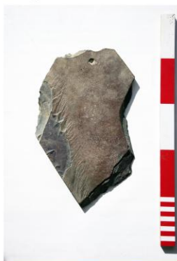
02. Abermagwr Slate ABR11 038 - 1.jpg