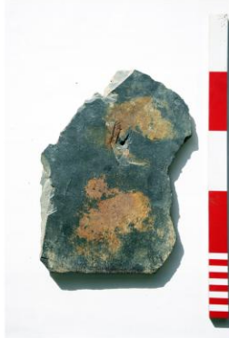
06. Abermagwr Slate ABR 037 - 2.jpg