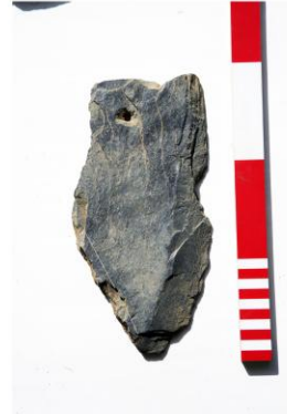
09. Abermagwr Slate ABR 004 - 1 marked.JPG