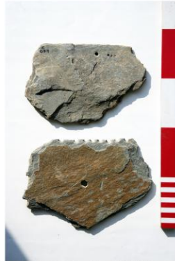
23 and 24 Abermagwr Slate - top 089 C - lower 079 C(12).jpg25 and 26 Abermagwr Slate lower 062 C - upper ABR11 062 C(11).jpg