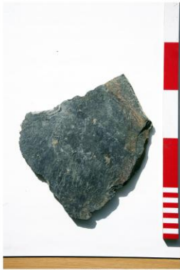
16. Abermagwr Slate ABR10 009 2 marked.JPG