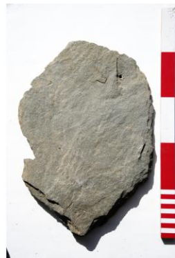
03. Abermagwr Slate ABR11 051 - C - 1.jpg