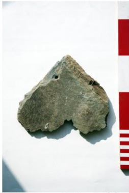
21. Abermagwr Slate 077 (4).jpg