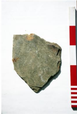
22. Abermagwr Slate ABR11 062 - C.jpg