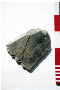
19. Abermagwr Slate ABR10 - 014 - 2.jpg