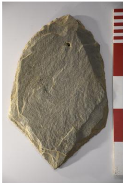
27. Abermagwr Slate ABR15 119 G - 1.jpg