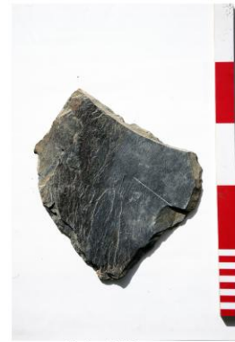
16. Abermagwr Slate ABR10 - 009 1 marked.JPG