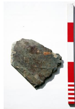
19. Abermagwr Slate ABR10 - 014 - 1.jpg