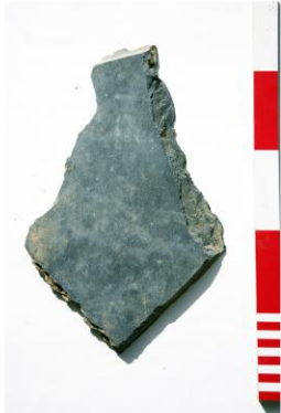
08. Abermagwr Slate ABR10 004 - 1.jpg