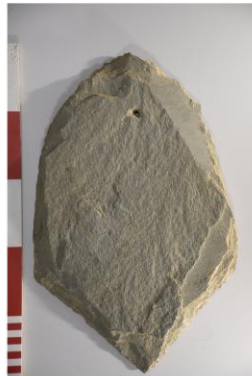
27. Abermagwr Slate ABR15 119 G - 2.jpg