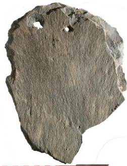
07. Abermagwr Slate ABR11 082 - E 5 marked copy.jpg