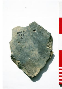
05. Abermagwr Slate ABR11 083 C - 2.jpg