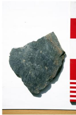
16. Abermagwr Slate ABR10 009 2.jpg