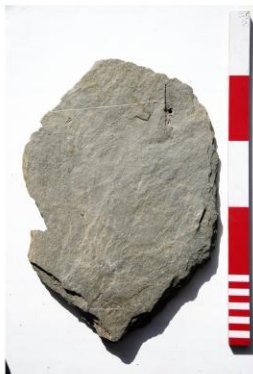
03. Abermagwr Slate ABR11 051 - C - 1 marked.JPG