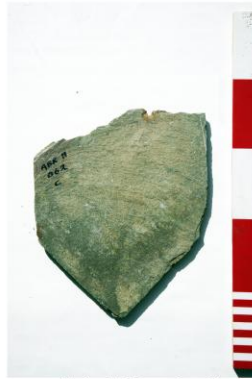
22. Abermagwr Slate ABR11 062 - C 2 marked.JPG