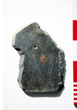
06. Abermagwr Slate ABR 037 - 1 marked.JPG