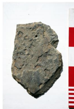
01. Abermagwr Slate ABR 11 - C 062 - 1.jpg