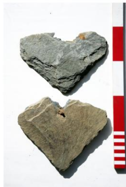
12 upper and 13 lower. Abermagwr Slate ABR11 Upper C 077, - Lo... 12 upper and 13 lower. Abermagwr Slate ABR11 Upper C 077, - Low...