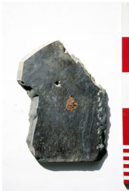
06. Abermagwr Slate ABR 037 - 1.jpg