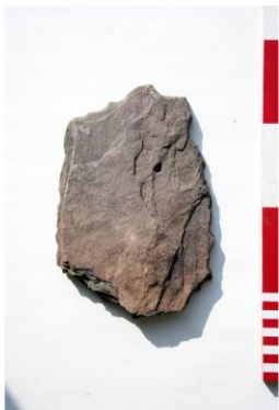
11. Abermagwr Slate No context (8).jpg