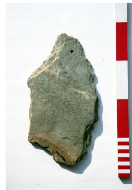
10. Abermagwr Slate .jpg