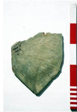
22. Abermagwr Slate ABR11 062 - C 2.jpg