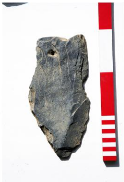
09. Abermagwr Slate ABR 004 - 1.jpg