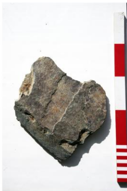
18. Abermagwr Slate ABR 003 - 2.jpg