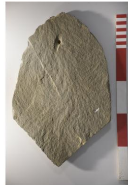
27. Abermagwr Slate ABR15 119 G - 3.jpg