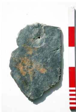
01. Abermagwr Slate ABR 11 - C 062 - 2.jpg