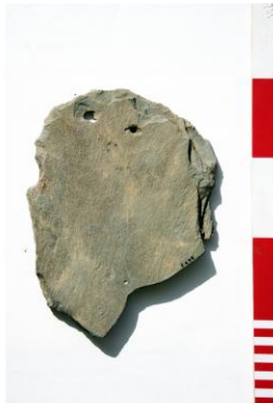
07. Abermagwr Slate ABR11 082 - E 1.jpg