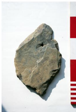
04. Abermagwr Slate ABR11 - 077 c (14).jpg