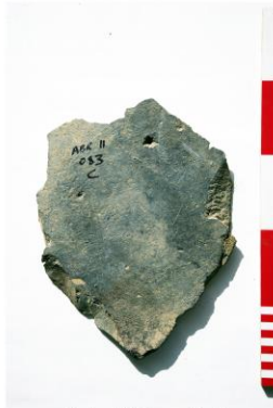
05. Abermagwr Slate ABR11 083 C - 2 marked.JPG