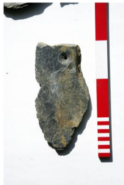
09. Abermagwr Slate ABR 004 - 2.JPG