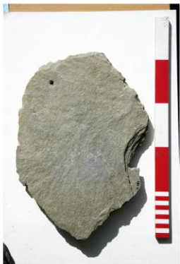
03. Abermagwr Slate ABR11 051 - C - 2.jpg