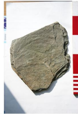
17. Abermagwr Slate No context (7).jpg