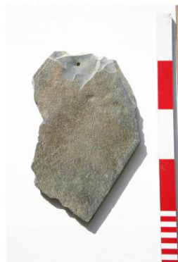
02. Abermagwr Slate ABR11 038 - 2 marked.JPG