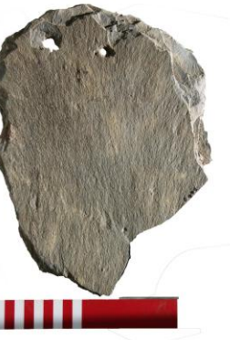
07. Abermagwr Slate ABR11 082 - E 5 copy.tif