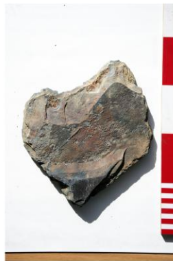
18. Abermagwr Slate ABR 003 - 1.jpg