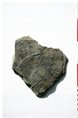
20. Abermagwr Slate ABR10 - 014 1.jpg