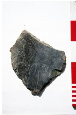
16. Abermagwr Slate ABR10 - 009 1.jpg