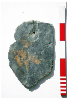
01. Abermagwr Slate ABR 11 - C 062 - 2 marked.JPG