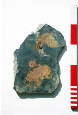
06. Abermagwr Slate ABR 037 - 2 marked.JPG