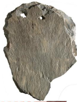
07. Abermagwr Slate ABR11 082 - E 5 marked.tif