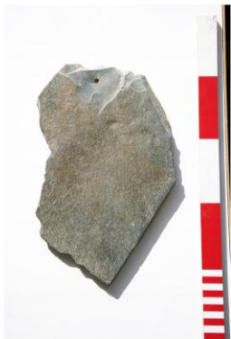
02. Abermagwr Slate ABR11 038 - 2.jpg