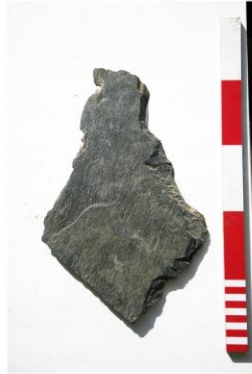
08. Abermagwr Slate ABR10 004 - 2.jpg