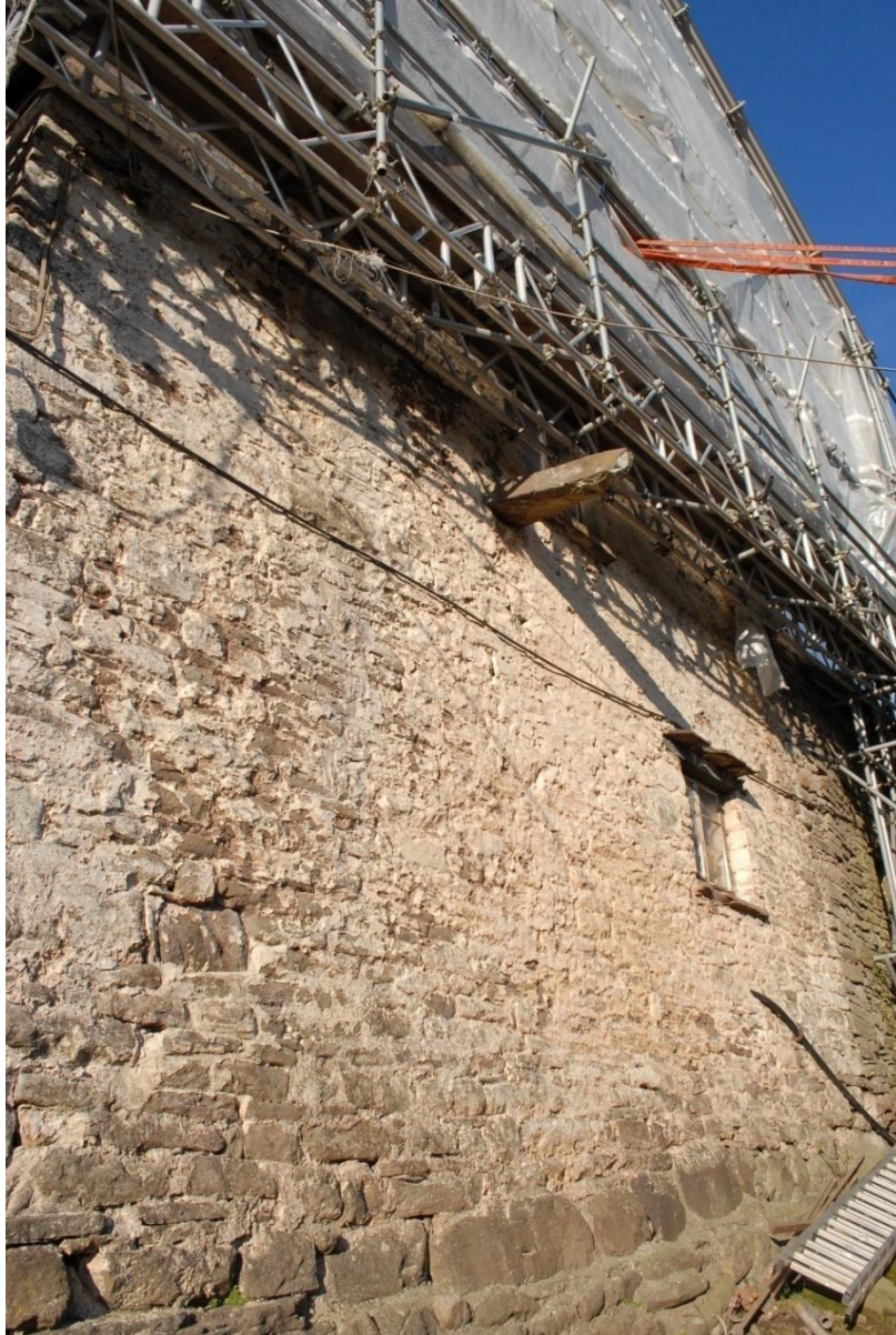
Pl.8: The lower part of the east elevation, showing first-floor louver spout.