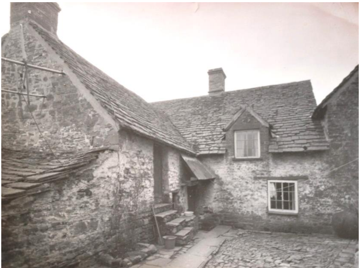
Pl.2: The rear yard of the house in the 1960's.