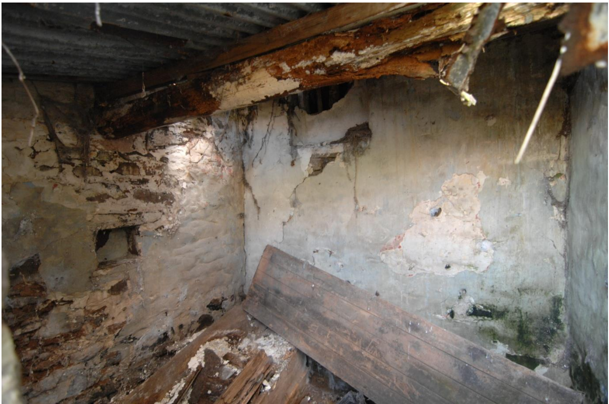
Pl.67: The interior of the east end of the bread oven lean-to.