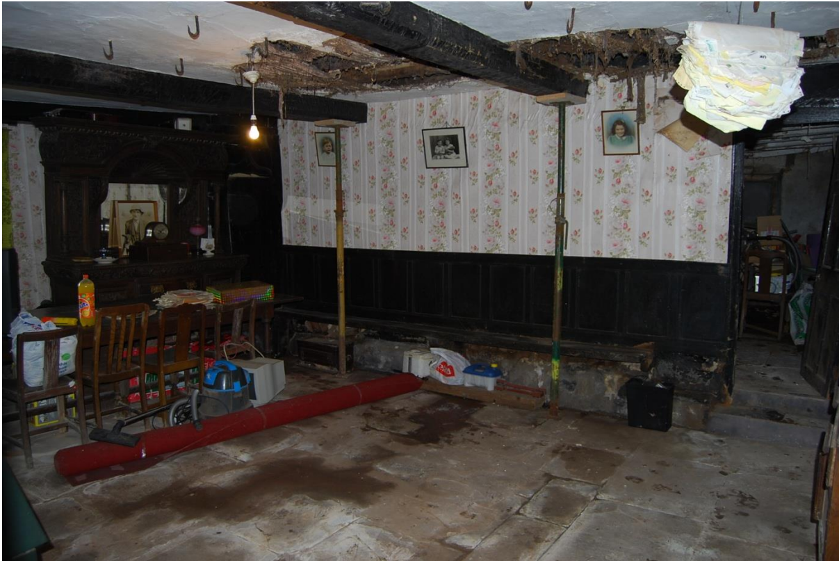
Pl.32: The hall looking south-west.