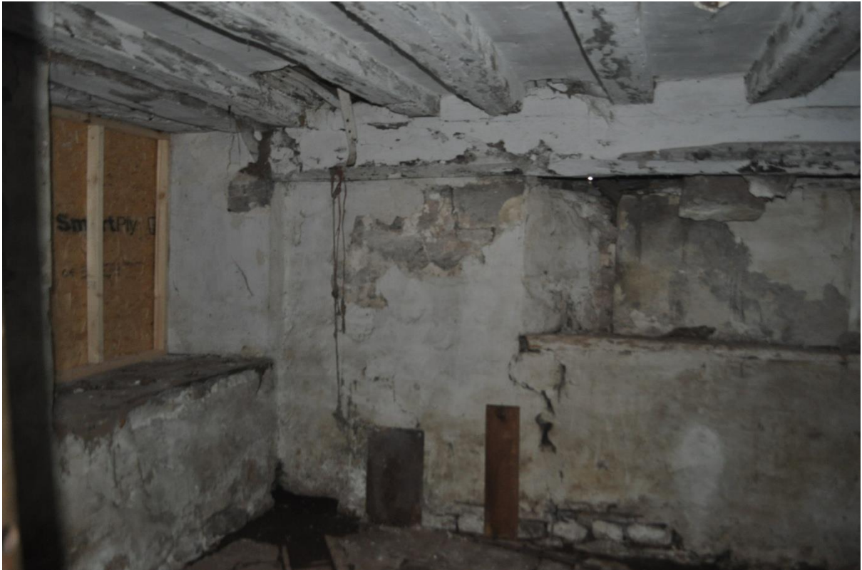
Pl.39: The inner south-east corner of the ground floor room in the Solar (G5).