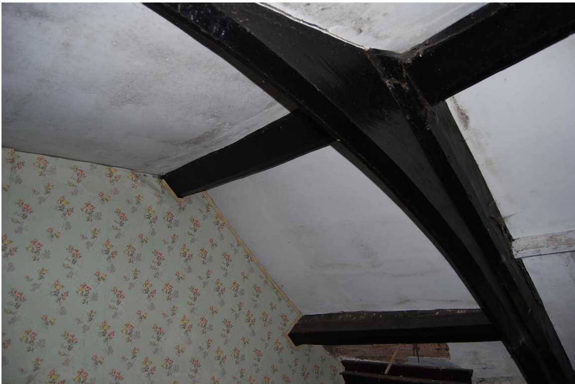
Pl.18: Northern arched brace over the Hall section.