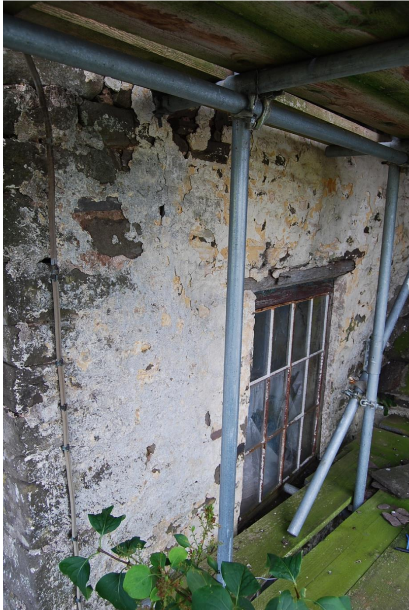
Pl.11: Detail of limewashed butter-pointed render finish.