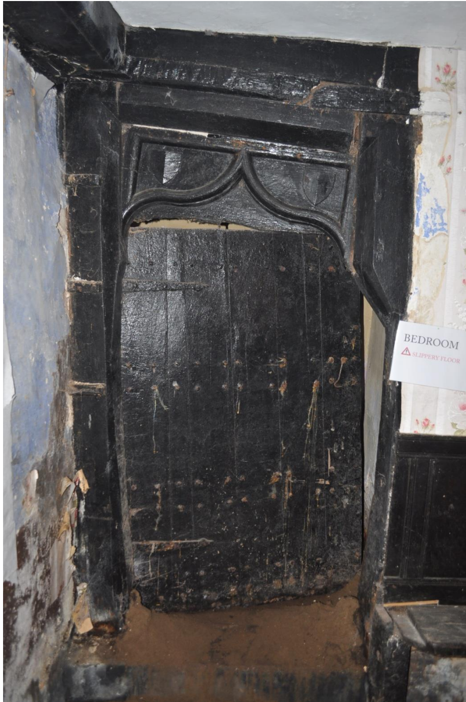
Pl.36: Detail of doorway at the southern end of the dais end of the hall (G3).