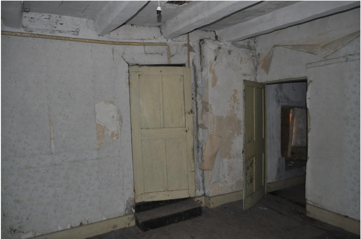
Pl.55: The south-eastern corner of F5.