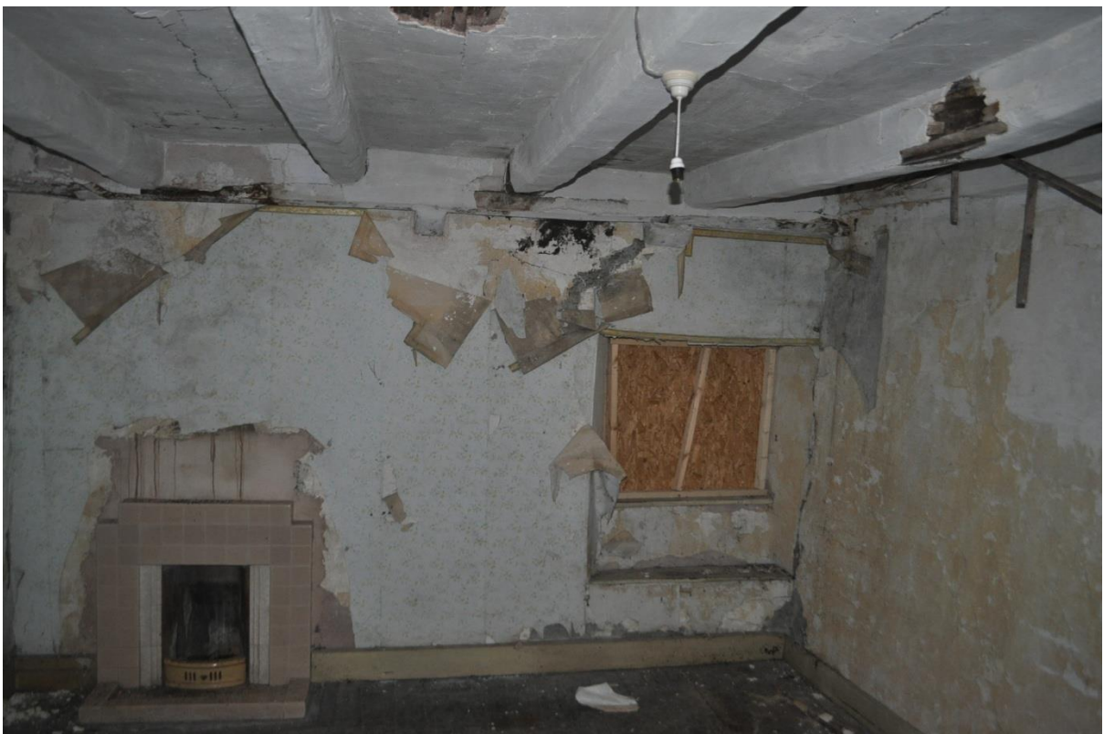
Pl.54: The west wall of the central first floor room in the Solar wing after clearance.