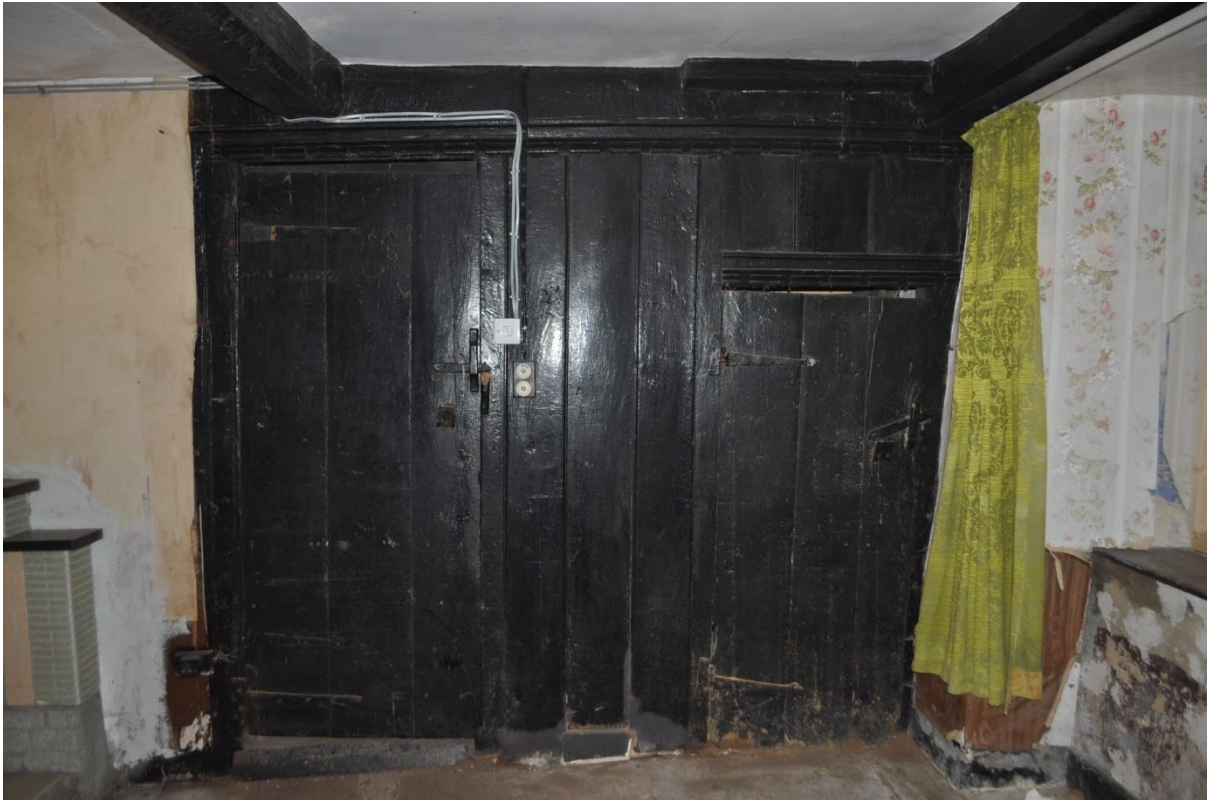
Pl.34: Detail of the boxing to the stairs.