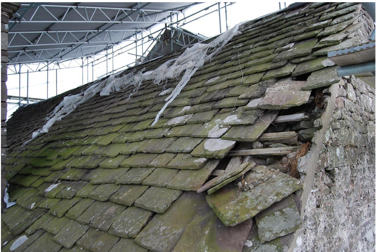
Pl.15: The west slope of the roof of the Solar.