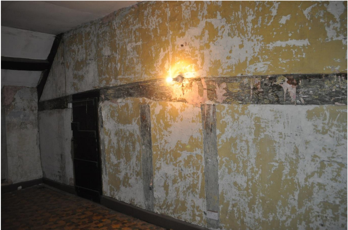
Pl.48: The east side of the timber-framed west wall of the east first floor room (F1).