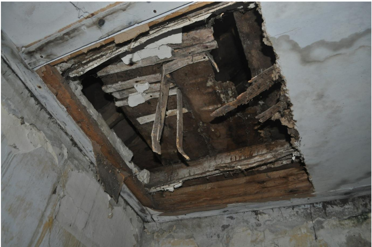
Pl.52: Detail of ceiling in F6).