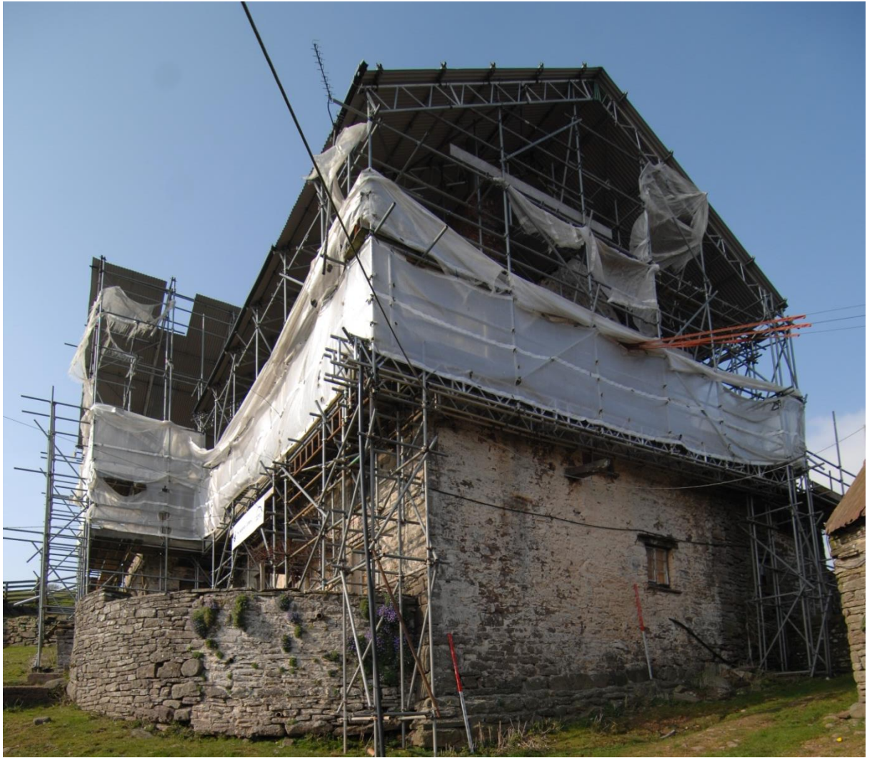
Pl.3: The scaffolded house from the south-east in 2016.