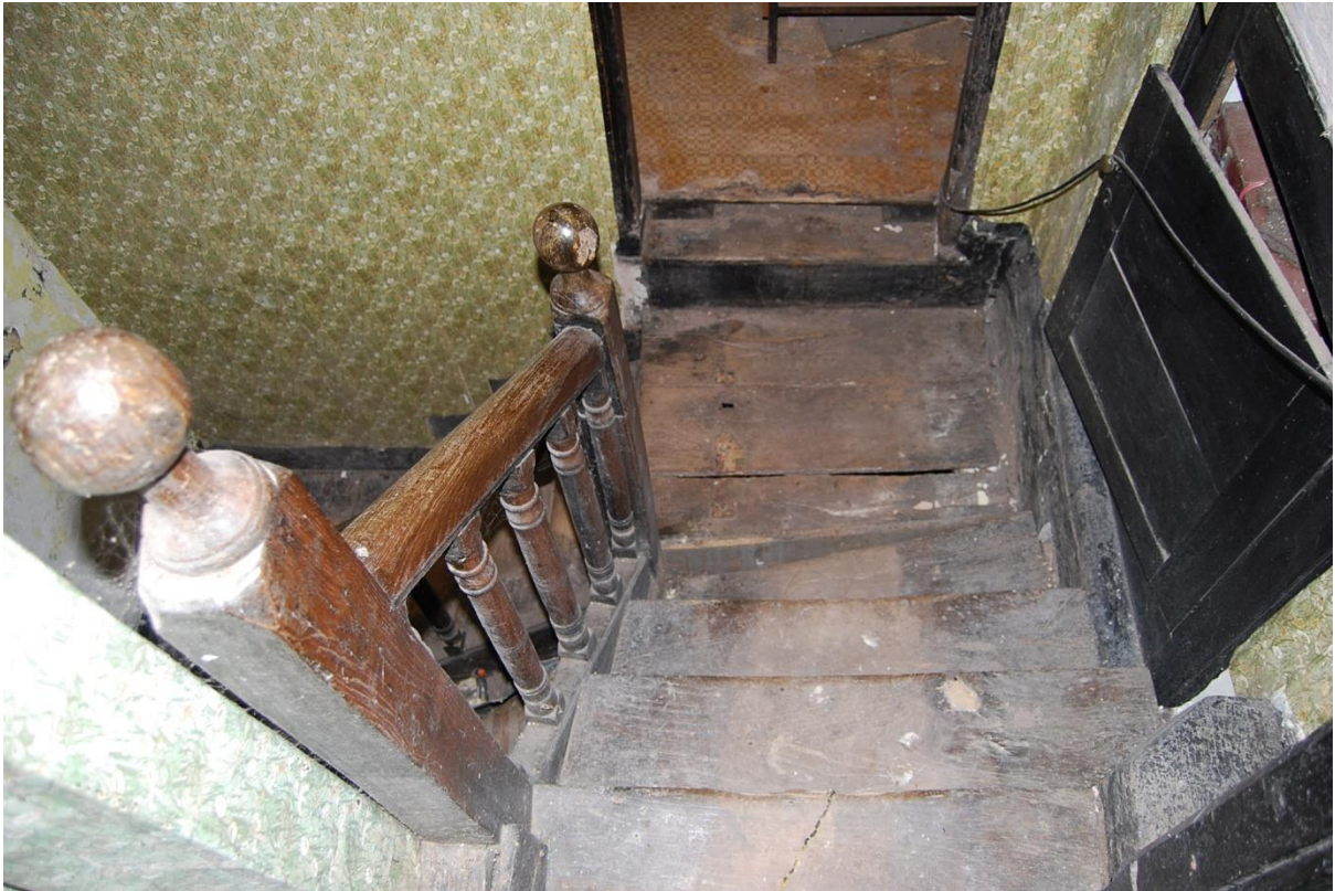
Pl.42: Looking down the stairs from the top quarter landing.