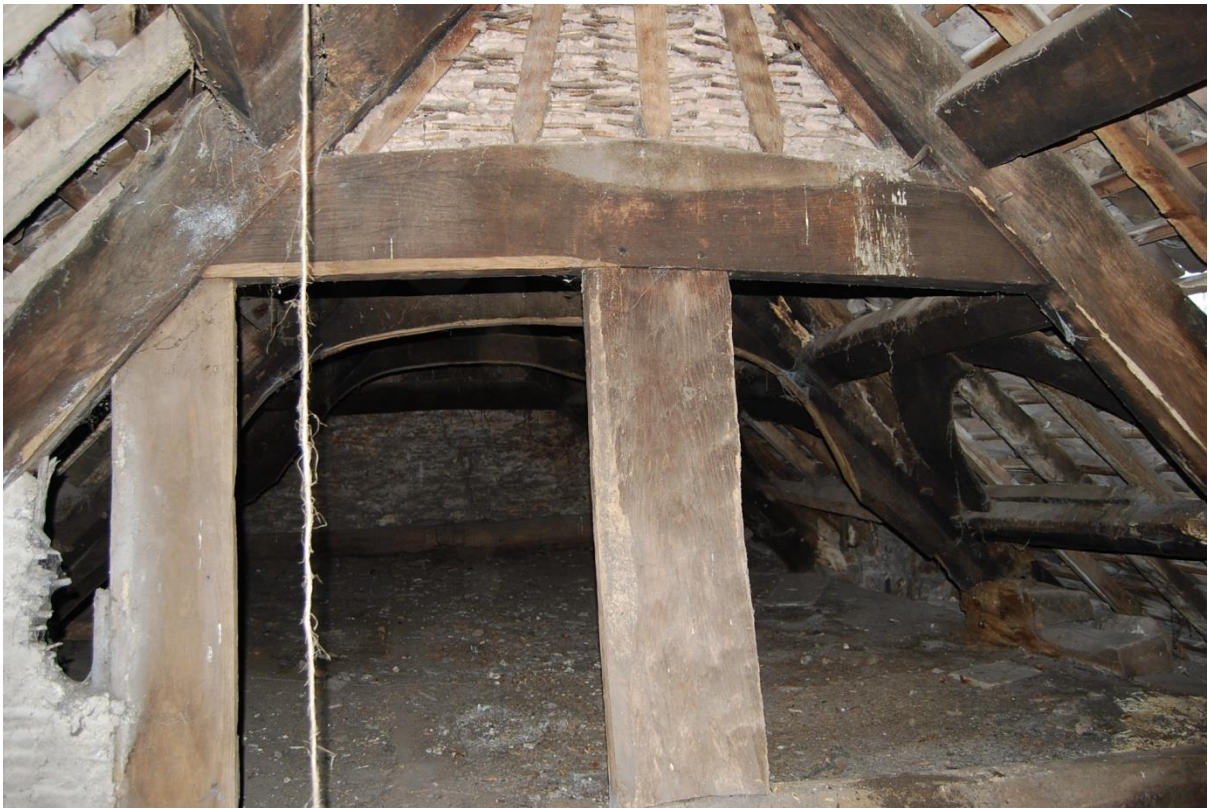
Pl.25: The closed truss of the Solar wing roof from the north.