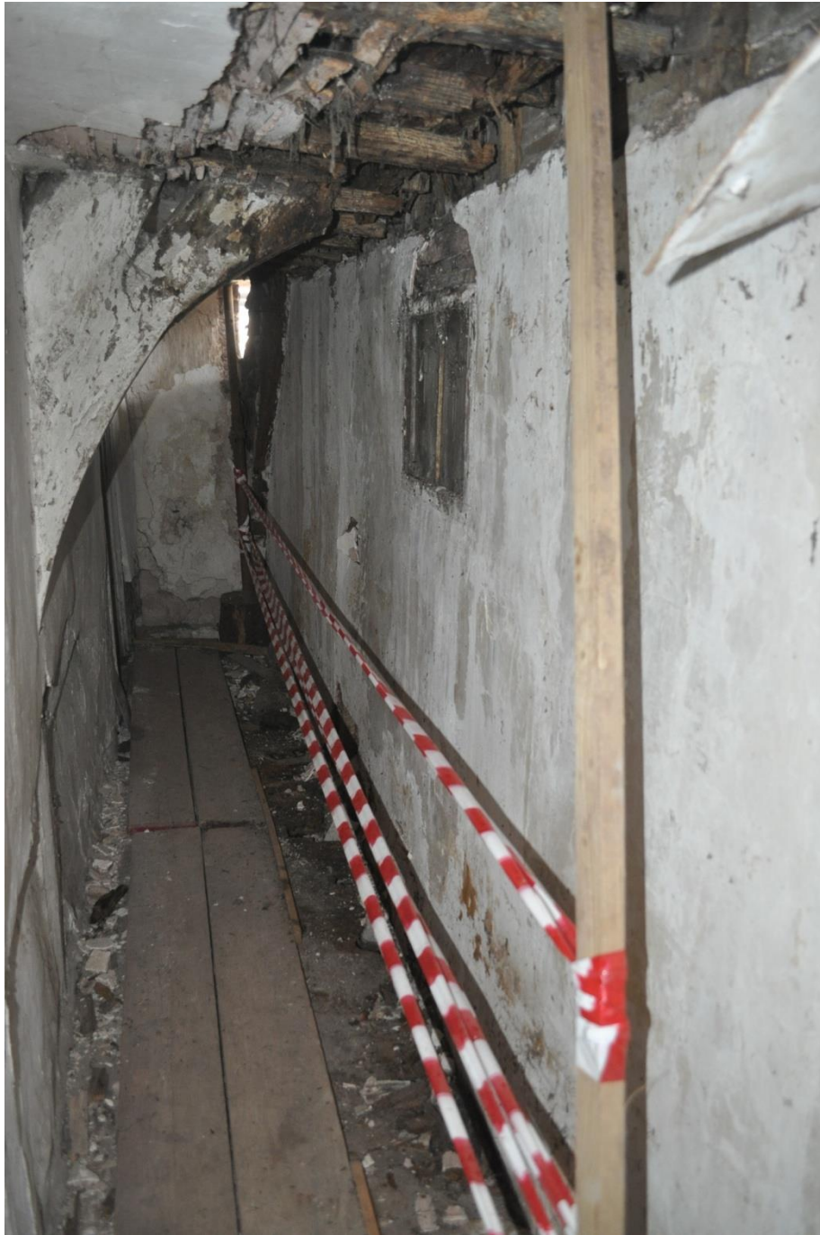
Pl.50: The first-floor cross-corridor (F10) linking the rooms in the Solar wing, looking north.