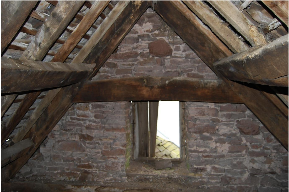
Pl.24: The north gable truss of the Solar wing roof.