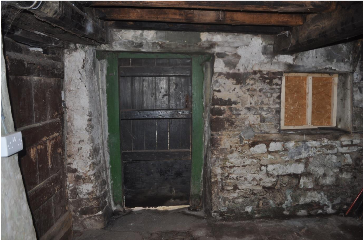
Pl.64: The west wall of G8.