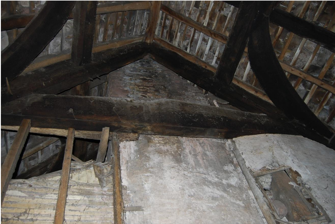
Pl.17: The east face of the spere truss in the Hall range.