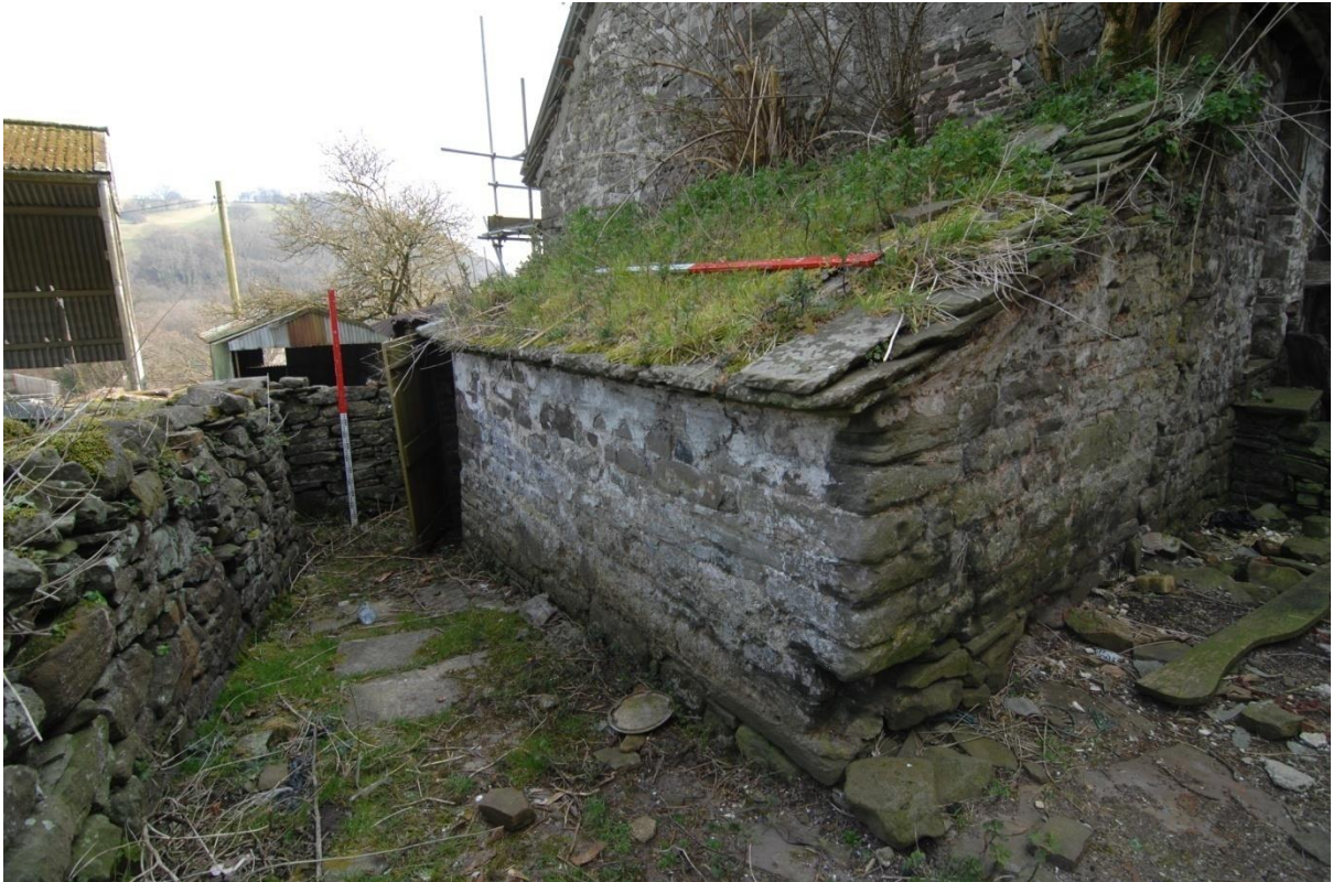
Pl.66: The bread oven lean-to attached to the north gable of the Rear Wing.