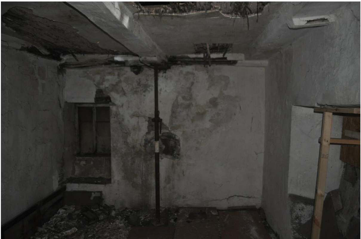
Pl.56: The north first floor room (F4) in the Solar wing, looking west.