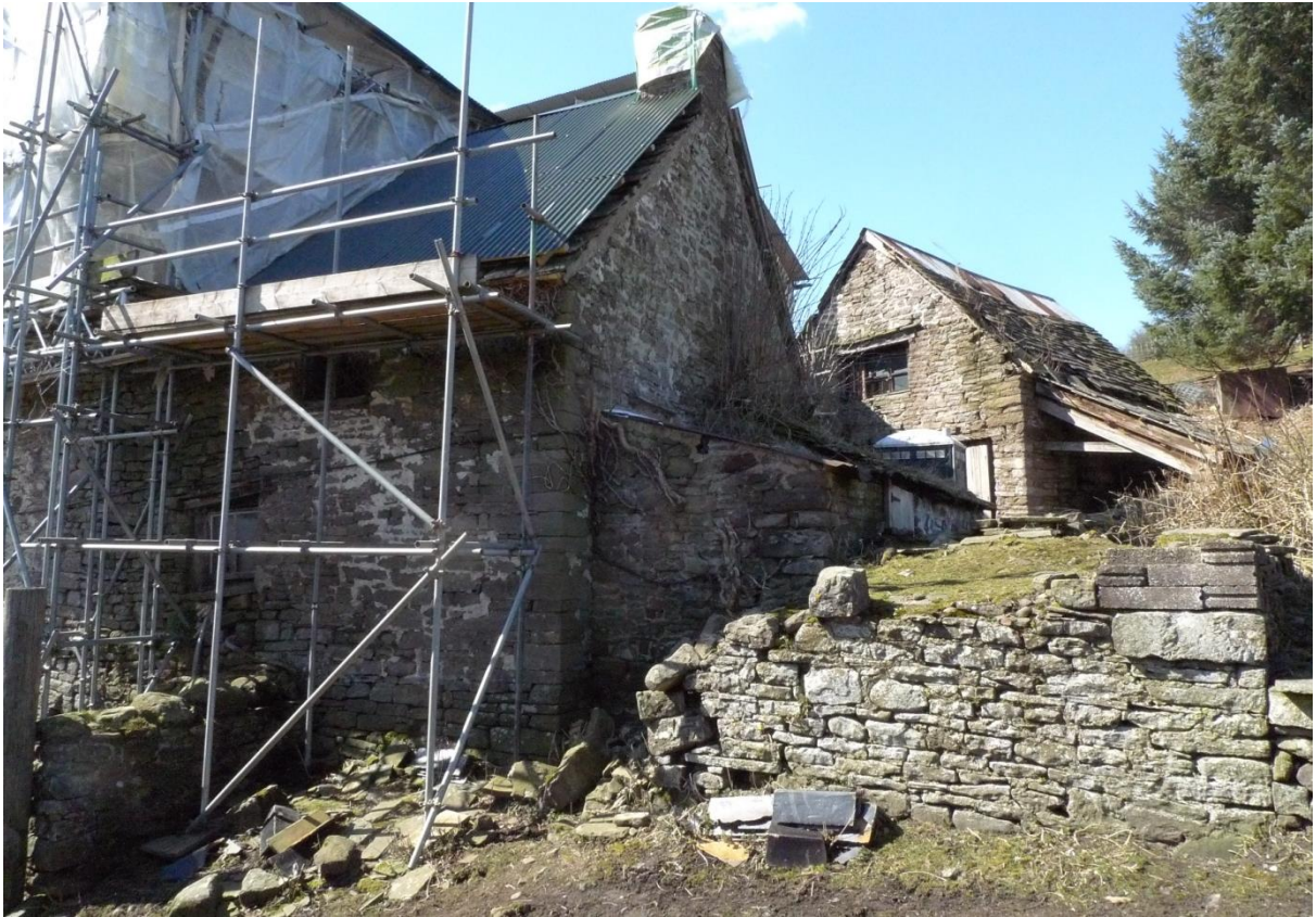
Pl.58: The rear wing from the north-east.