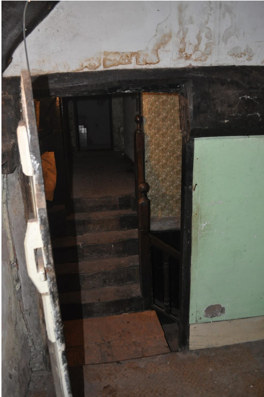
Pl.44: View west from the first-floor 'lobby', F9.