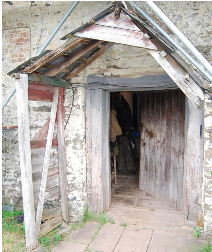
Pl.7: Detail of the porch and main entrance.