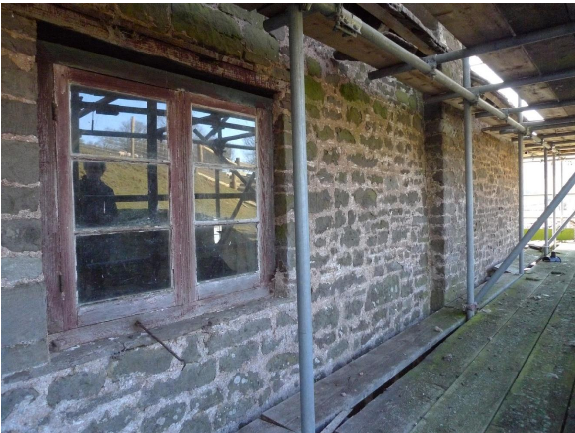
Pl.10: Part of the west elevation of the Solar wing.