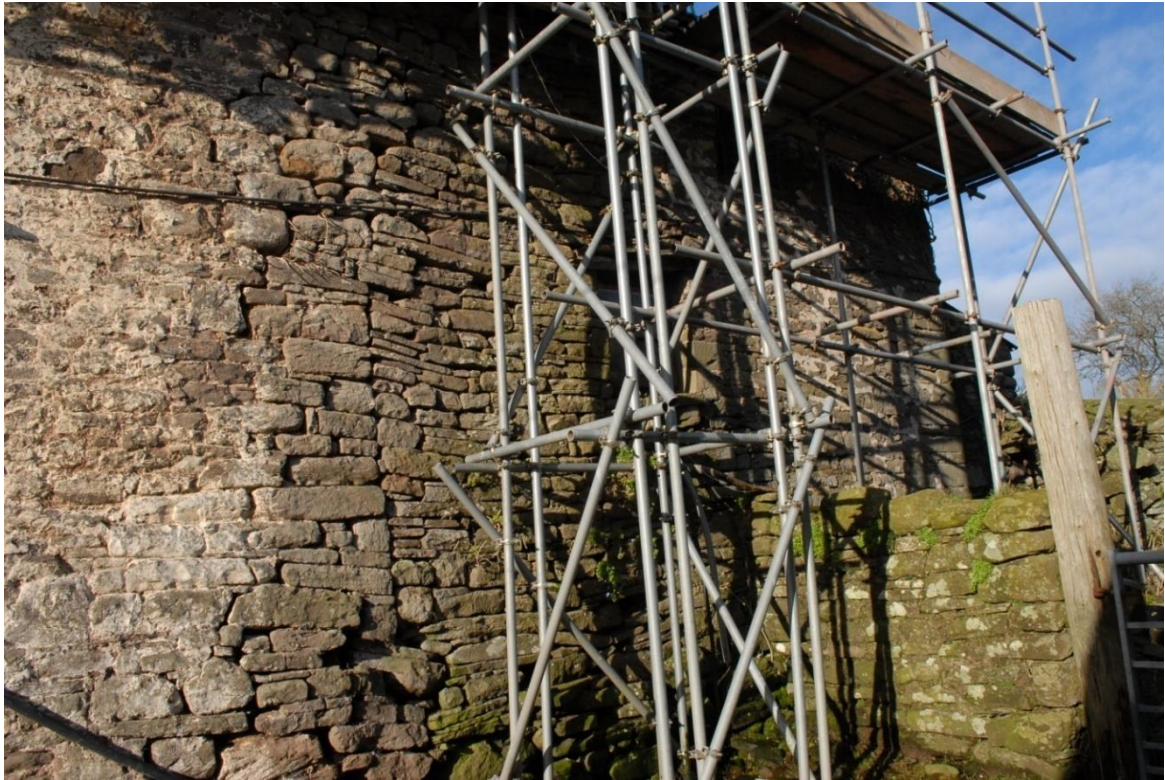
Pl.9: The east elevation showing junction between original build and later Rear Wing.