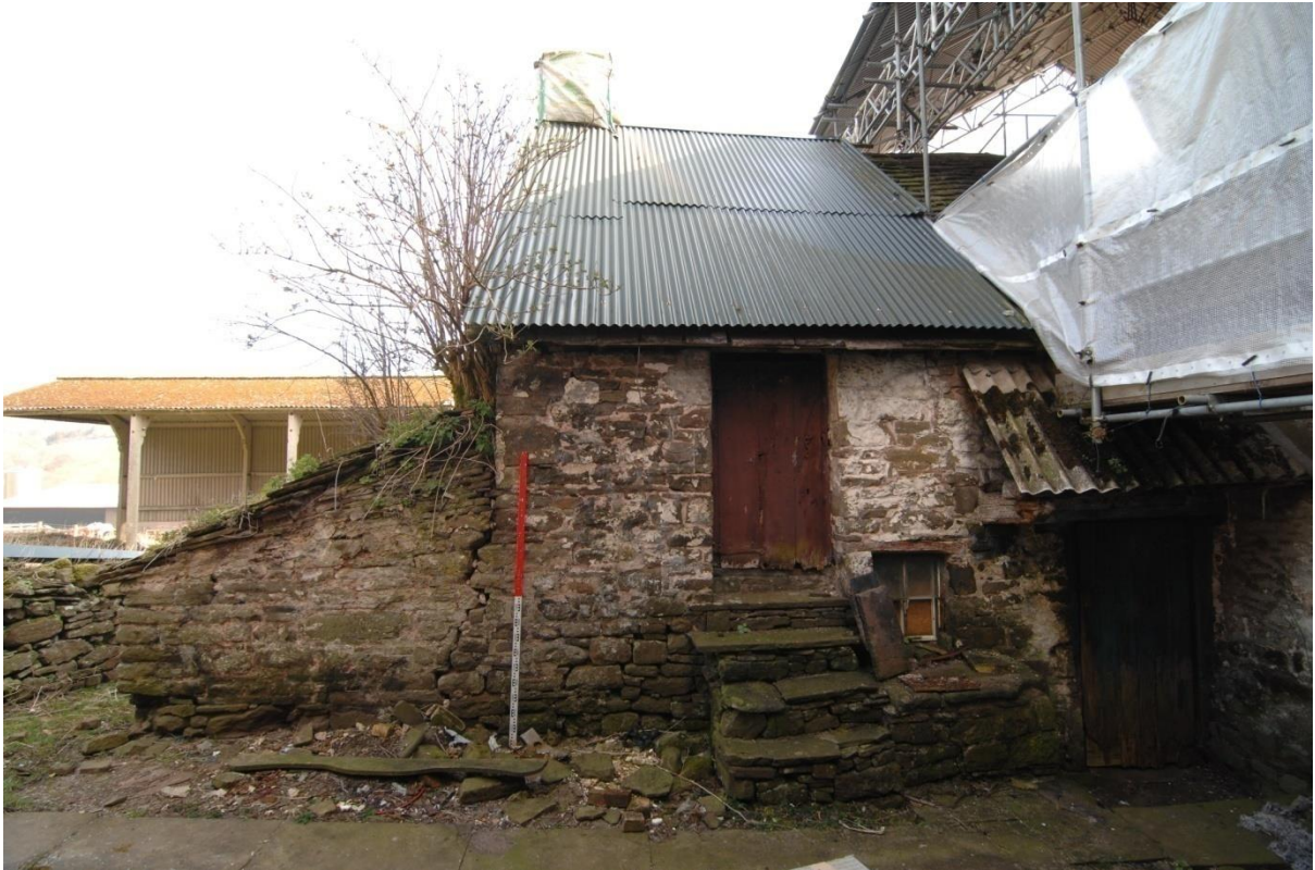
Pl.60: The west, or courtyard elevation of the Rear Wing, with bread oven lean-to to left.