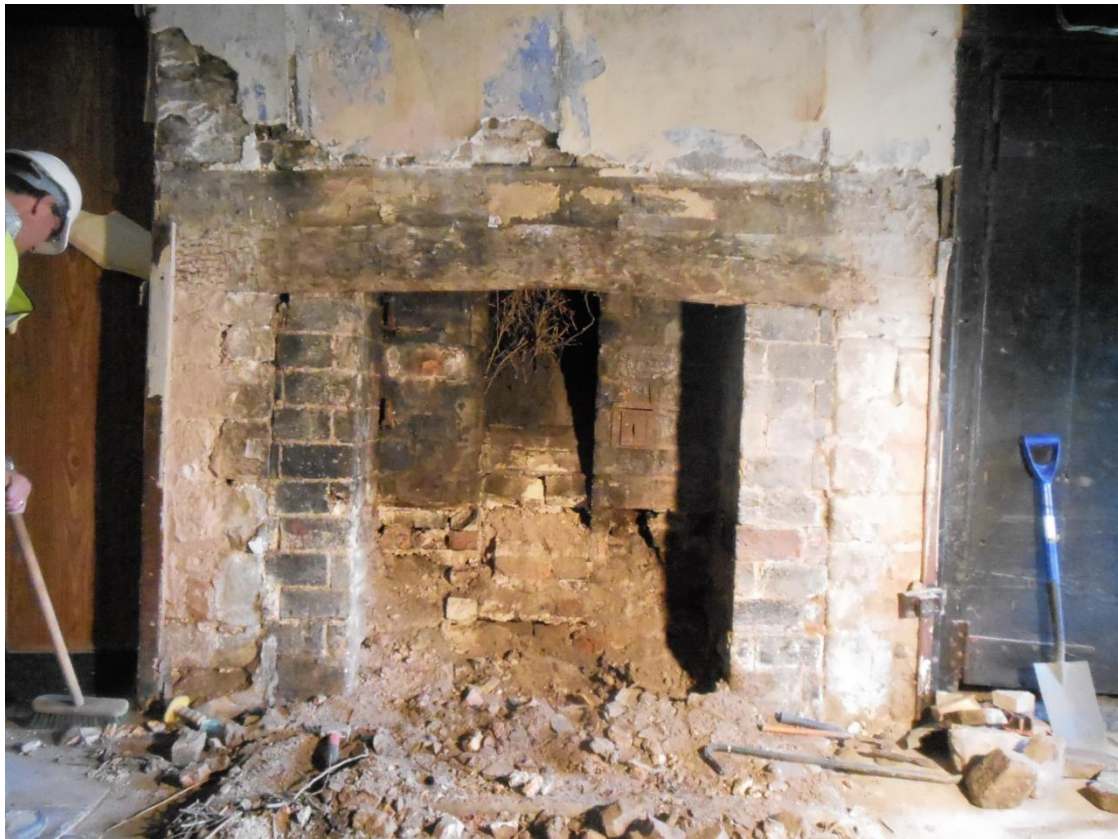
Pl.31: Initial phase of fireplace explorations in the hall in 2015.