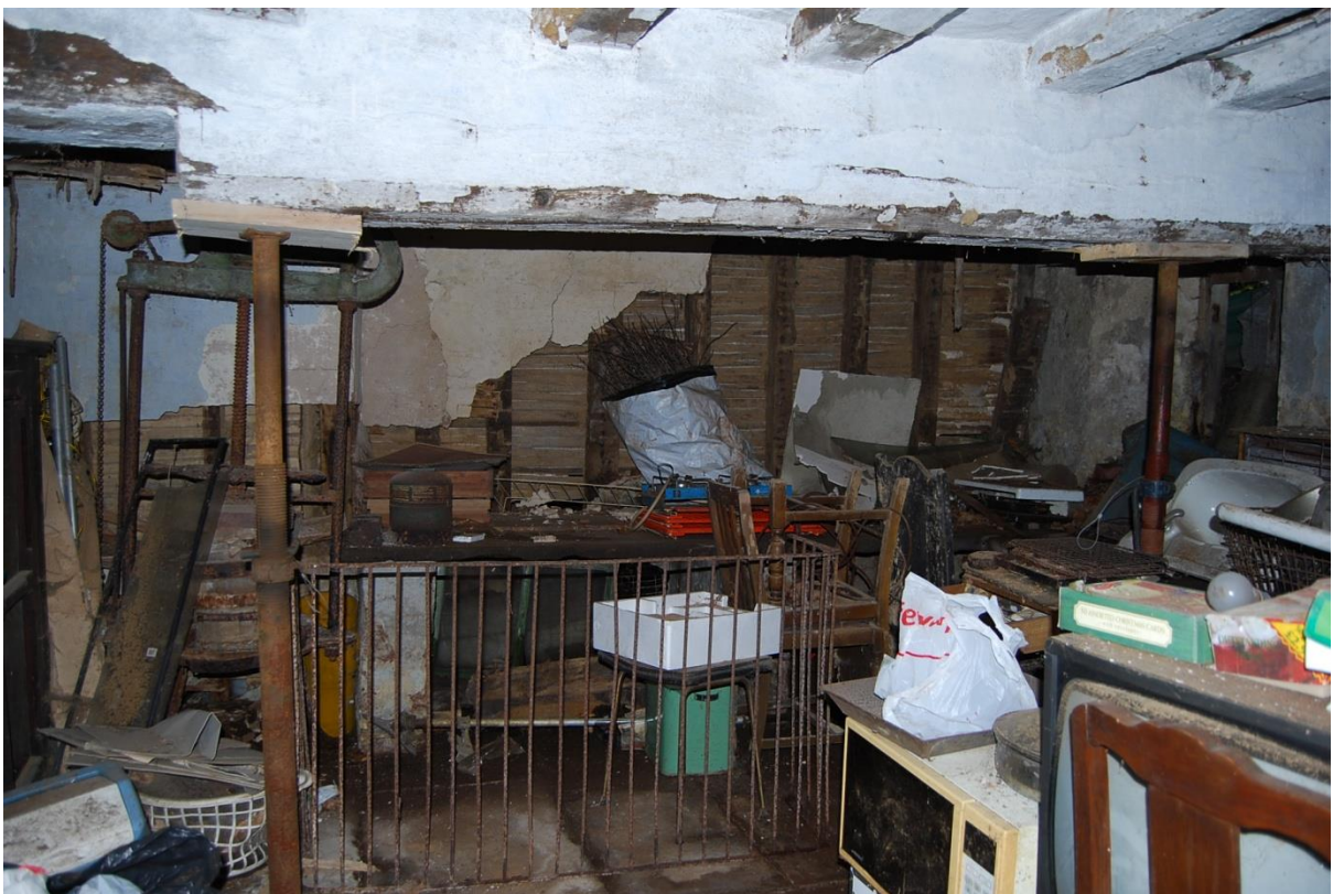
Pl.38: View southwards in the ground floor of the Solar wing.