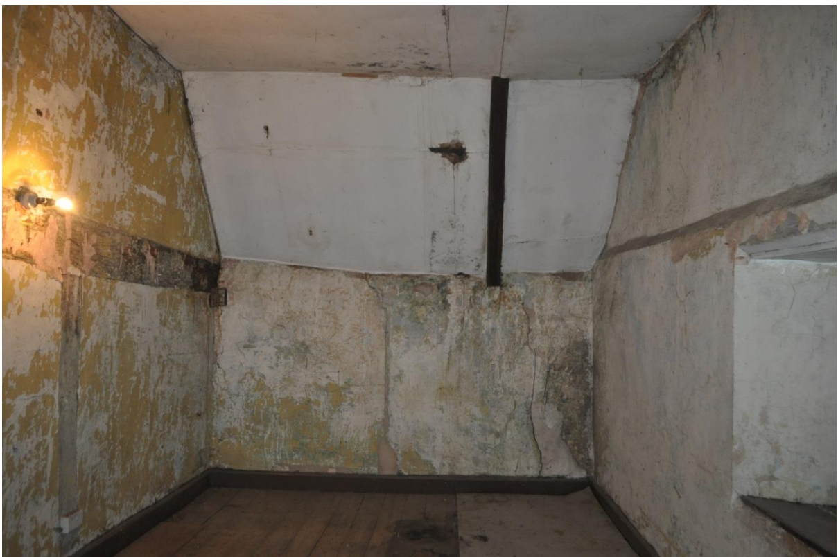
Pl.47: General view looking north in the east first floor room (F1).