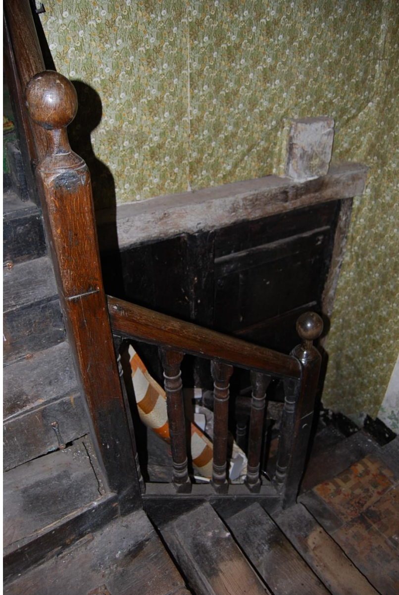
Pl.41: The top quarter landing of the stairs.