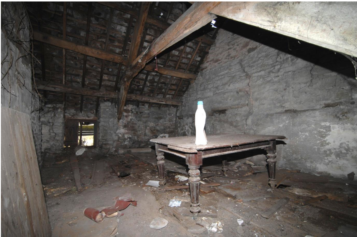
Pl.65: The upper floor of the Rear Wing. Looking south-east.