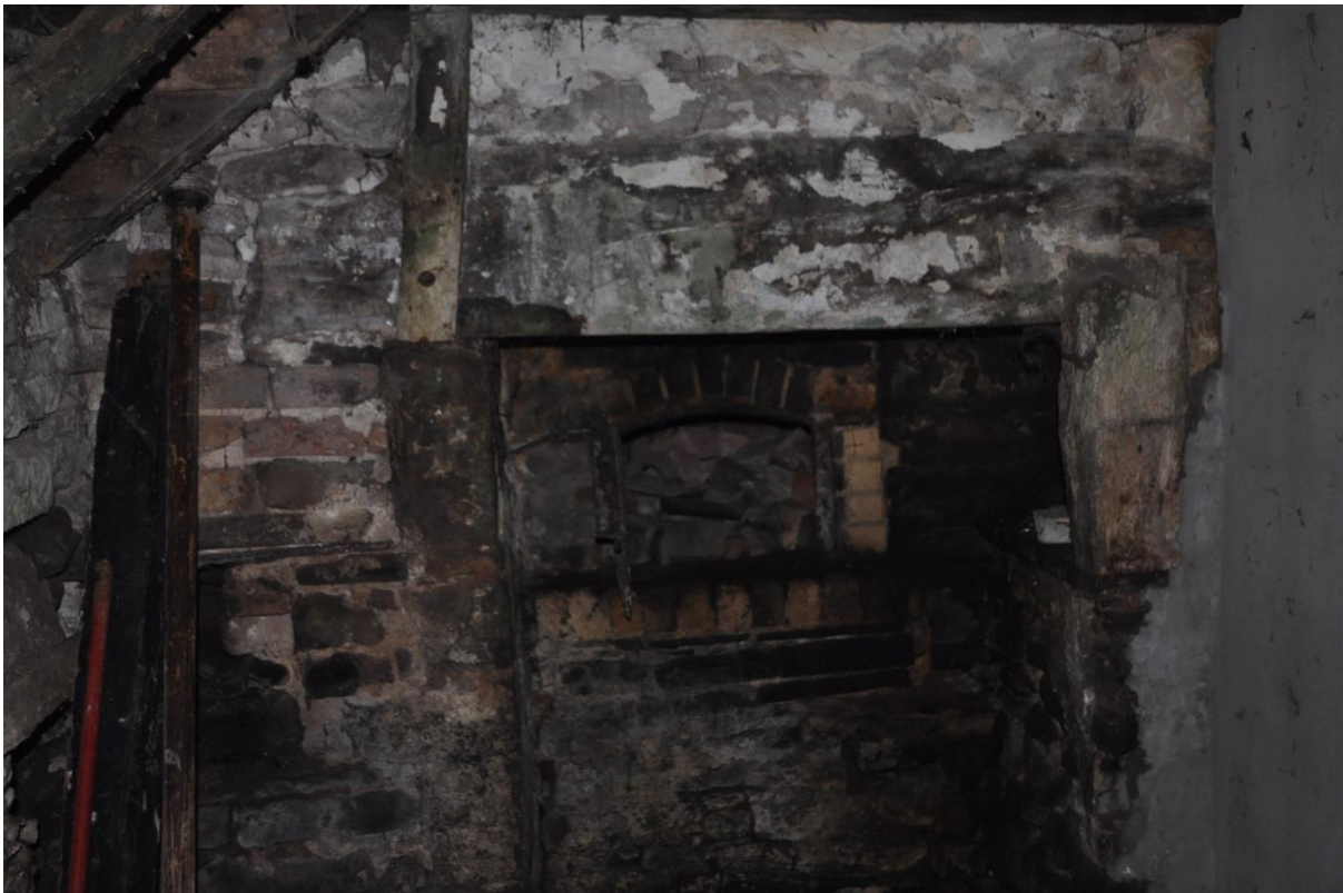
Pl.63: The exposed fireplace and bread oven in G8).