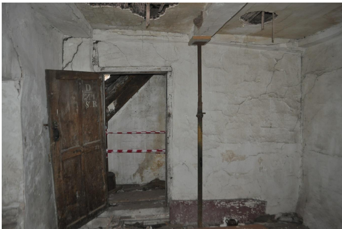
Pl.57: Detail of doorway in the north wall of F4.