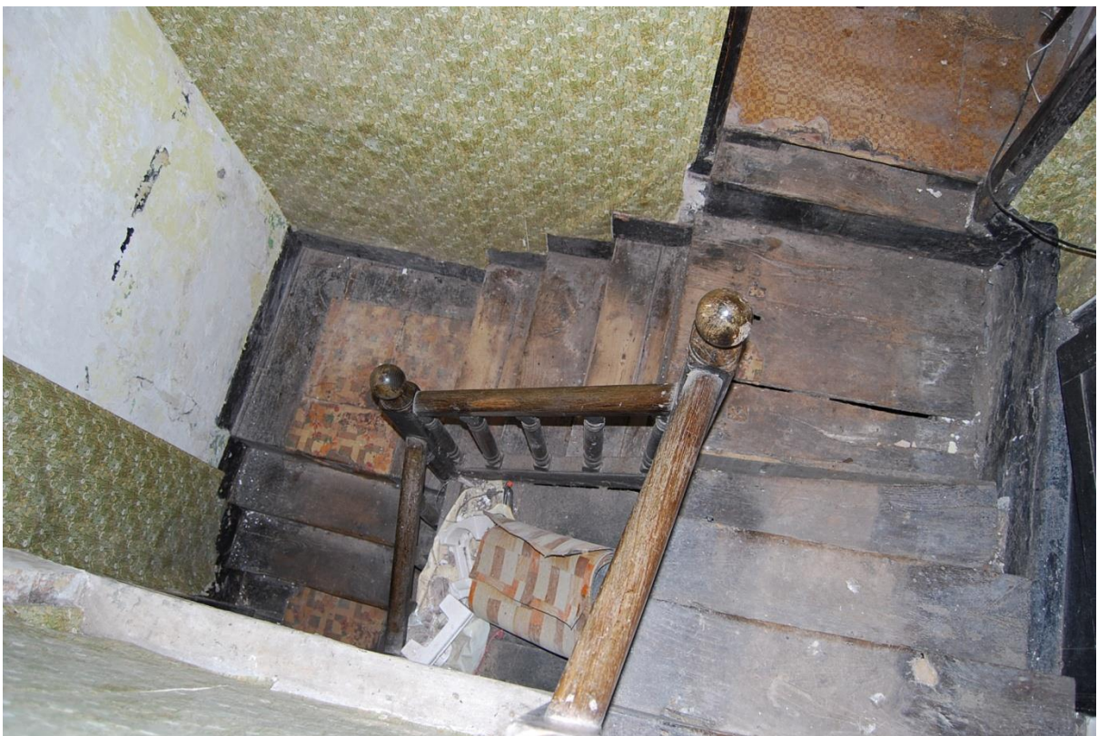
Pl.43: General view of the stairs from the top landing in the Hall section.