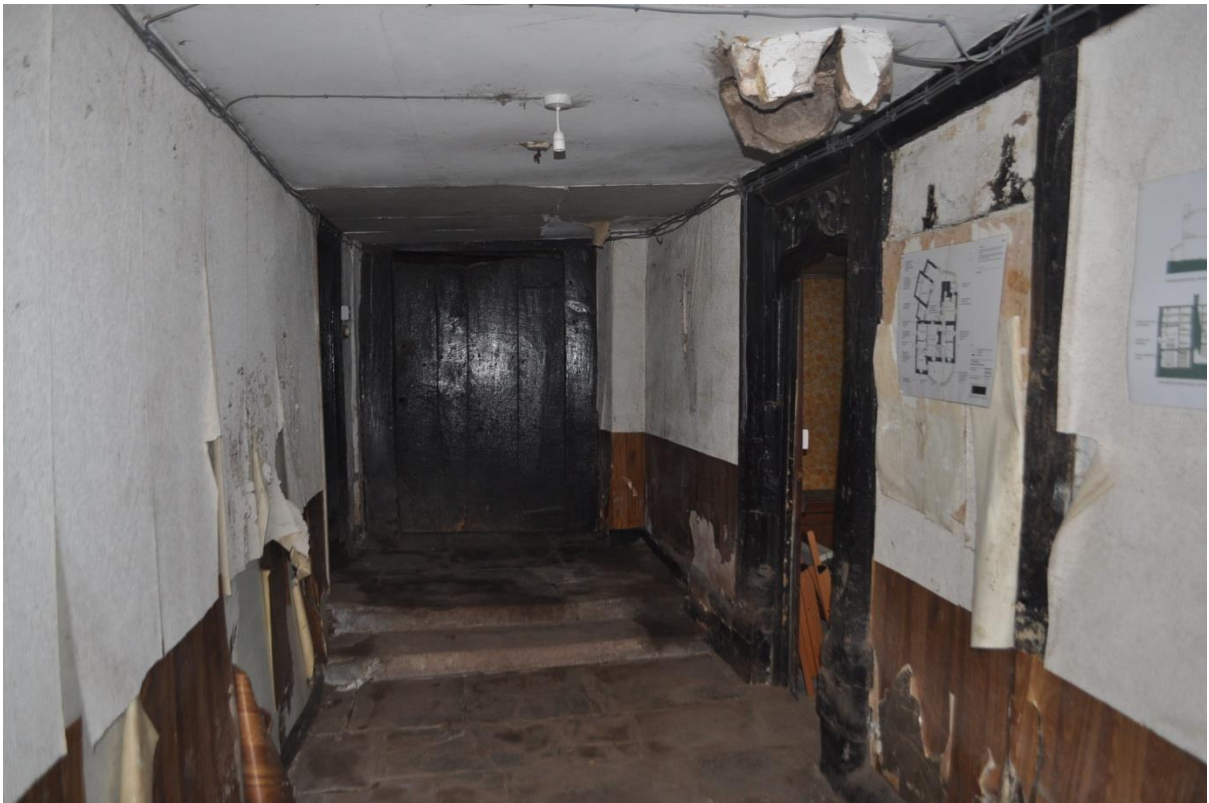
Pl.27: The entrance hall looking north.