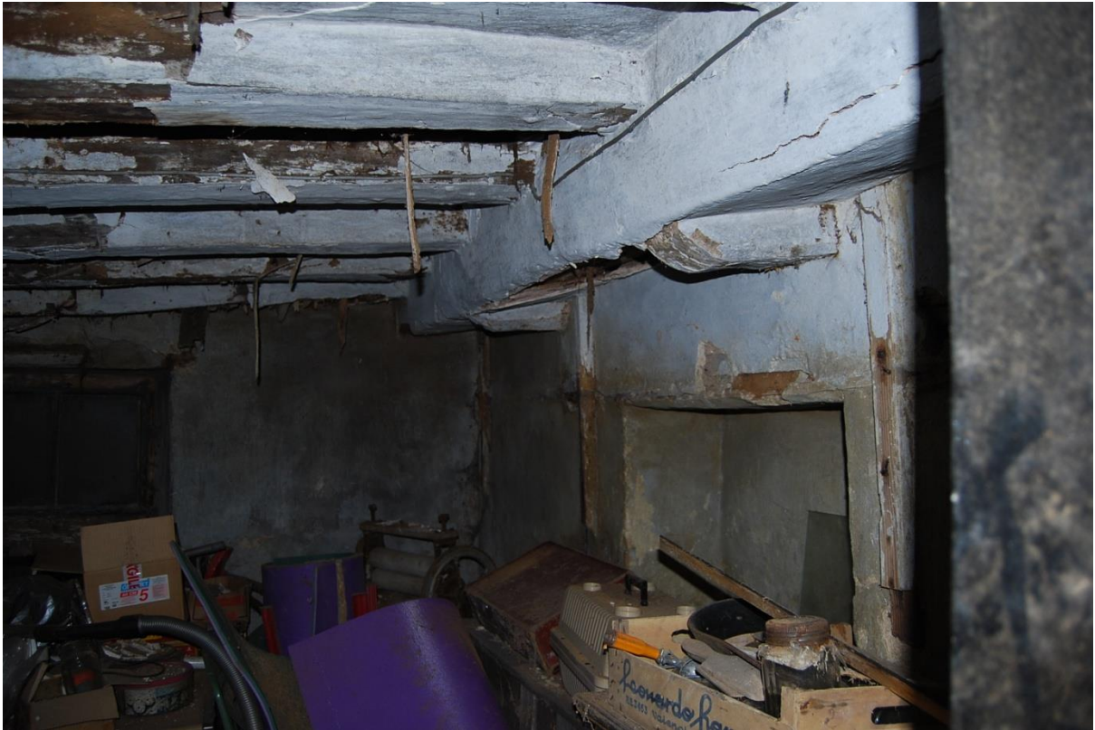
Pl.37: The north closet in the Solar wing (G4).