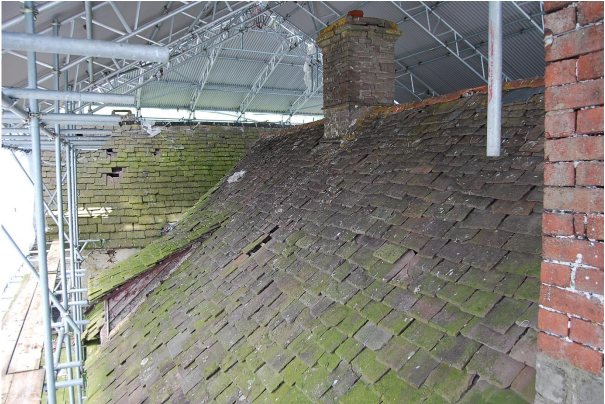
Pl.12: The south slope of the roof over the Hall and Service sections, looking west.