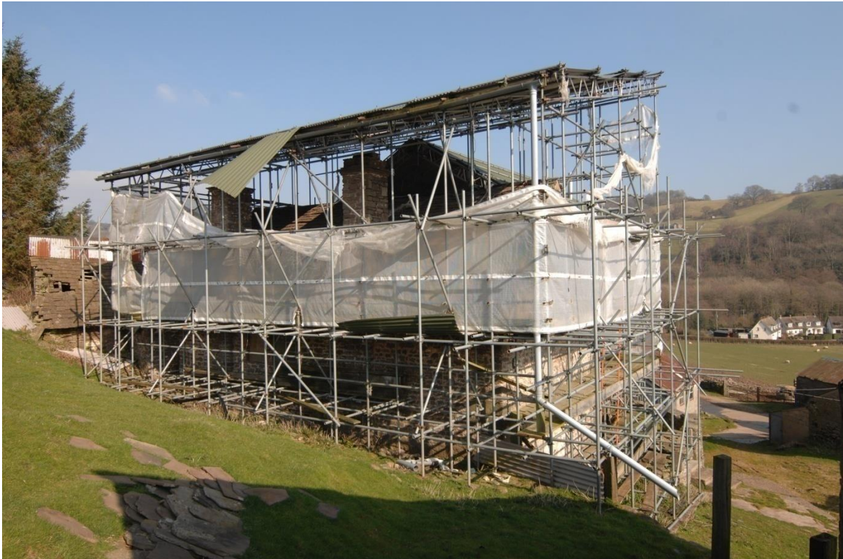
Pl.4: The house from the south-west.