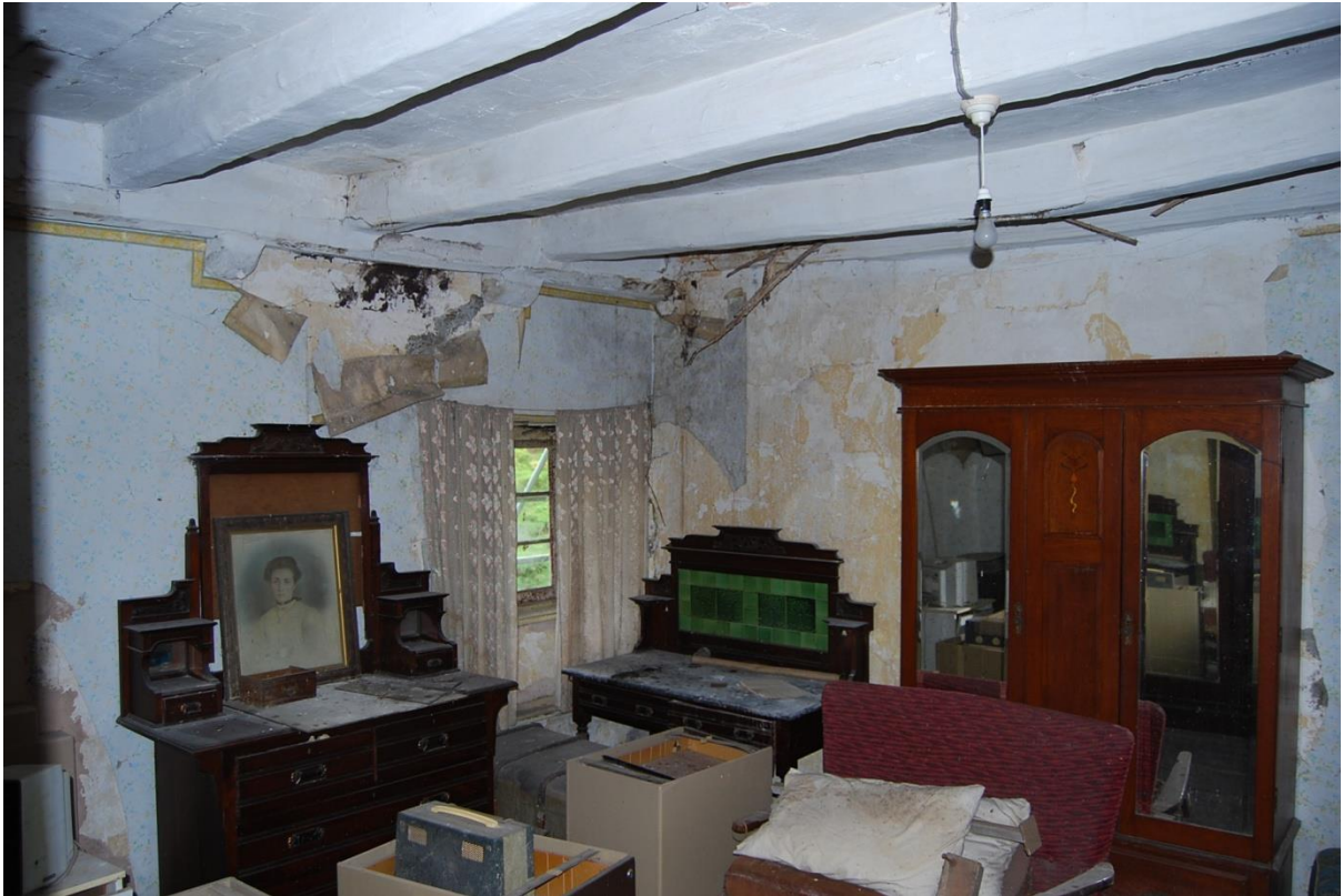
Pl.53: The central first floor room (F5) in the Solar wing, looking north-west in 2009.