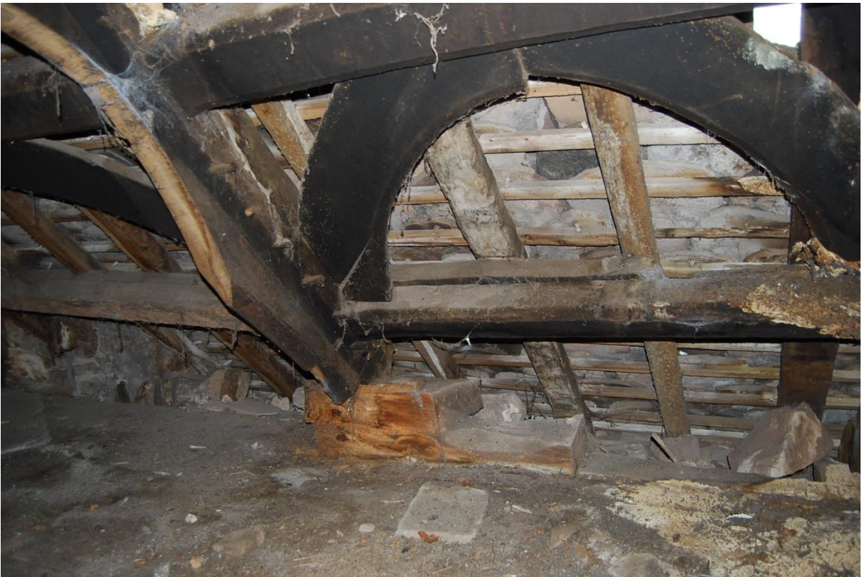
Pl.23: Lower wind-bracing on the west slope of the Solar wing roof.