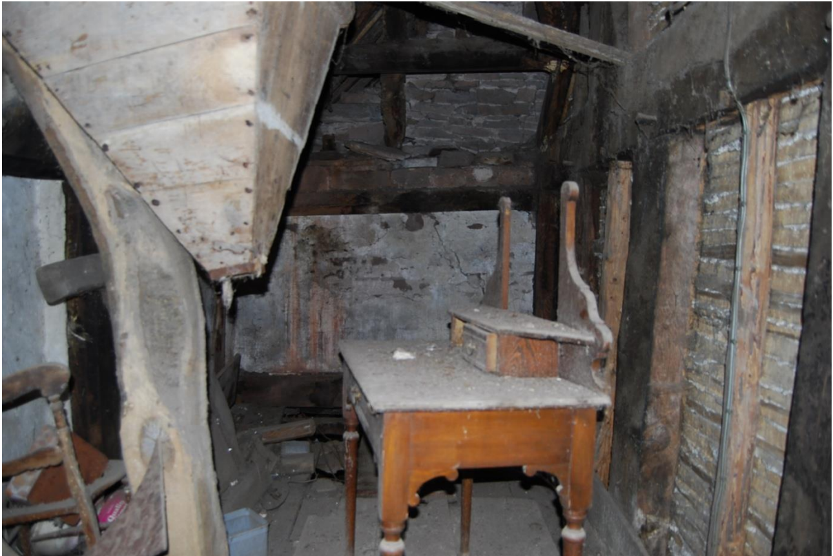
Pl.46: The store above the former cross passage (F2).