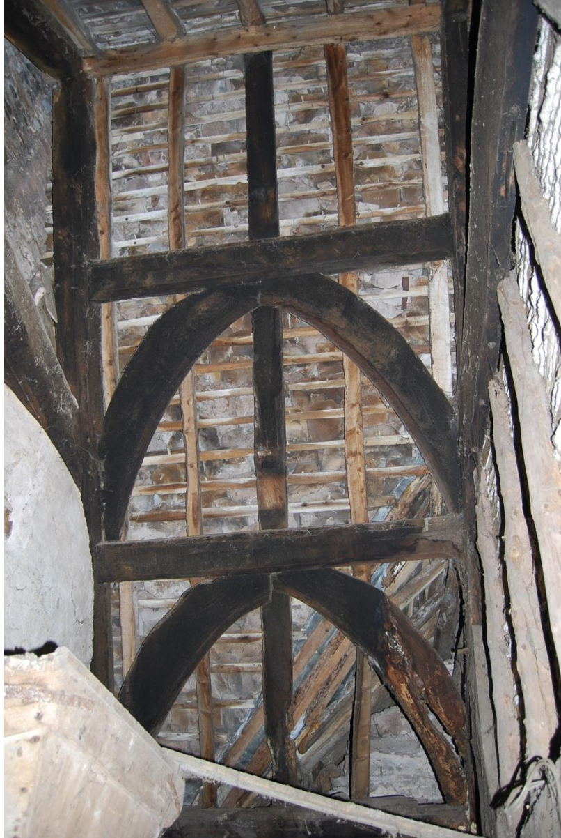
Pl.16: The underside of the north slope of the roof over the screen's passage at the east end of the Hall.