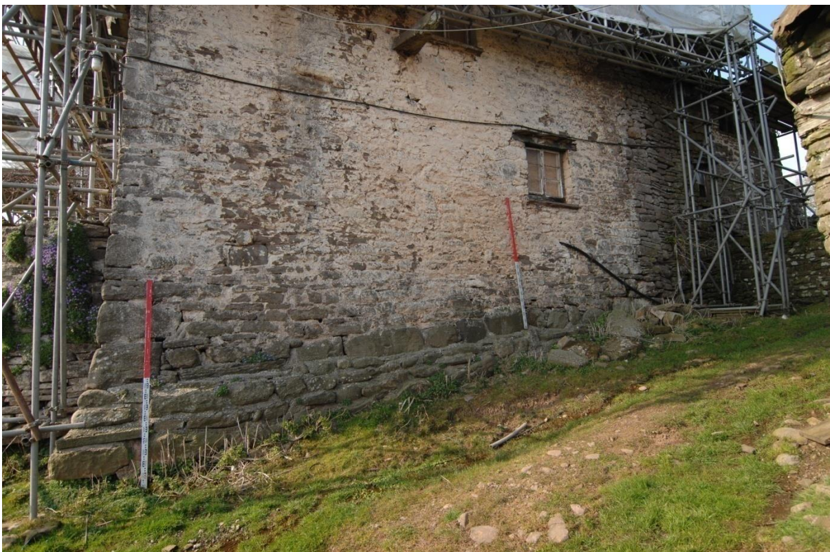
Pl.5: The lower portion of the east gable and the adjacent rear wing.