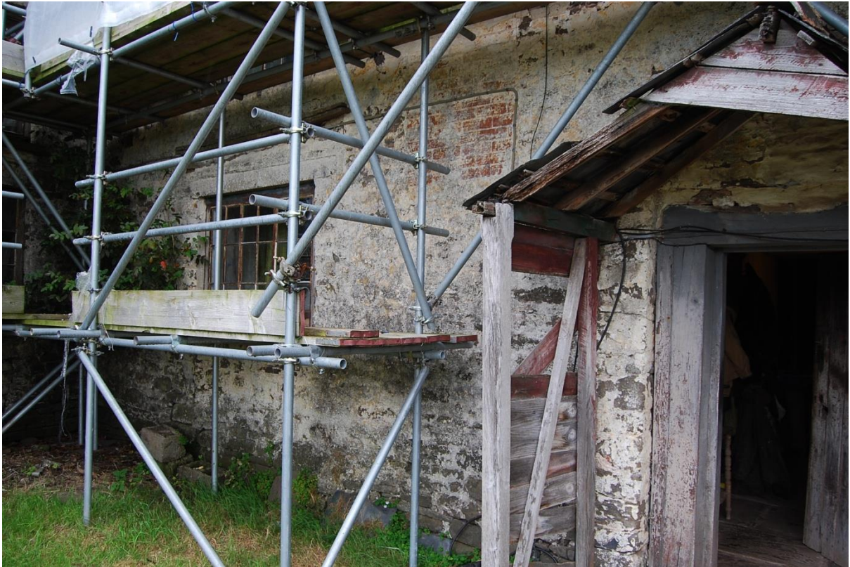
Pl.6: The front, or south, wall of the main hall section, porch to the right.