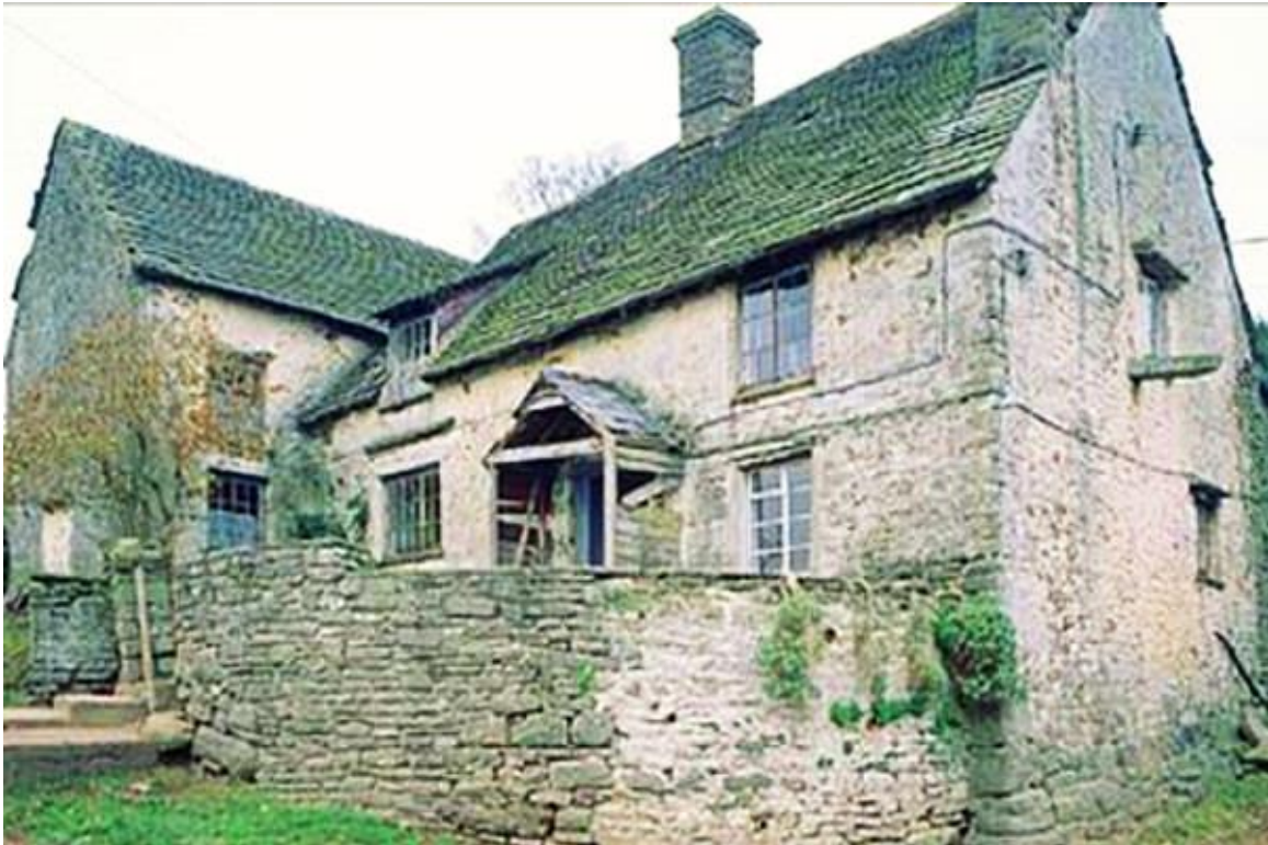
Pl.1: Llwyn Celyn from the south-east, before being swathed in protective scaffolding.