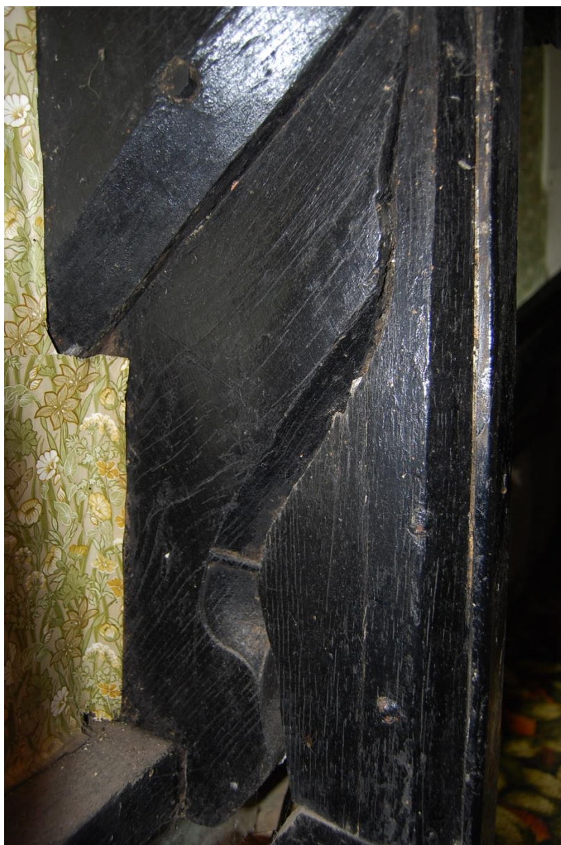
Pl.19: Decorative detail at base of arch-brace in Hall section.