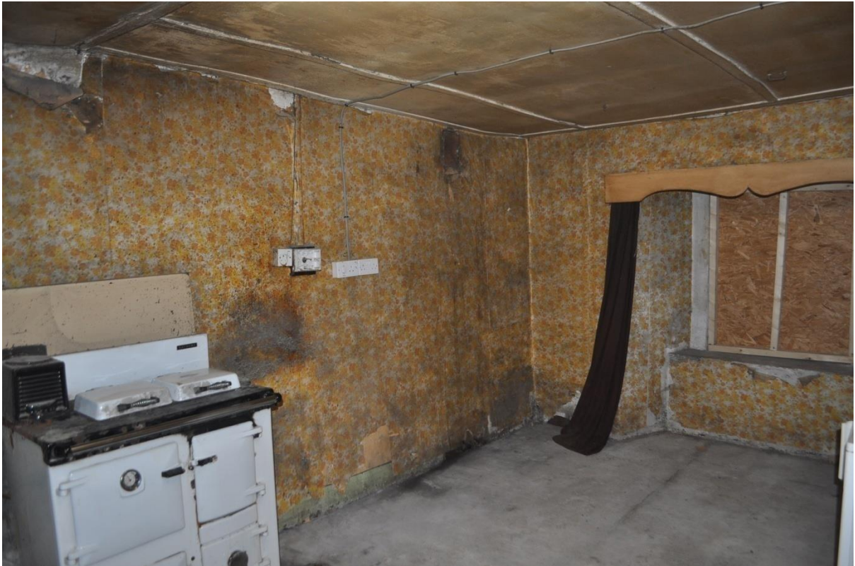
Pl.28: The former services (G1) looking south-east.