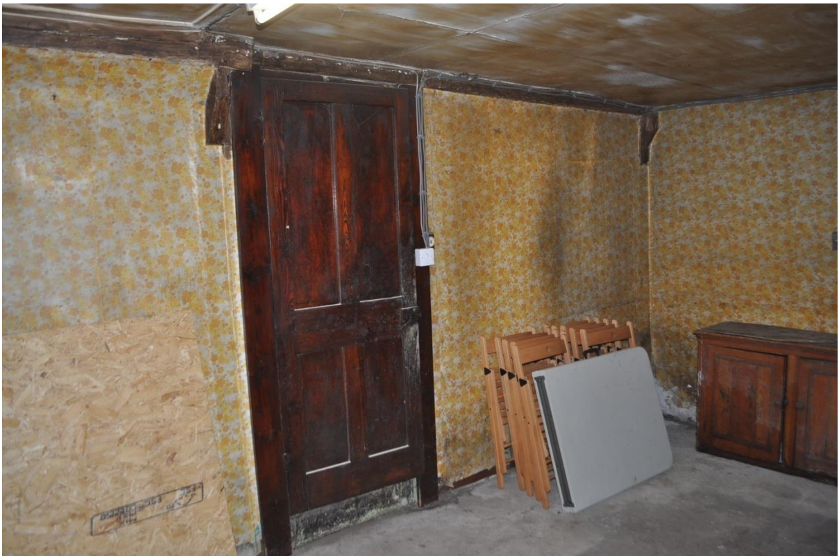
Pl.29: The former services looking north-west.