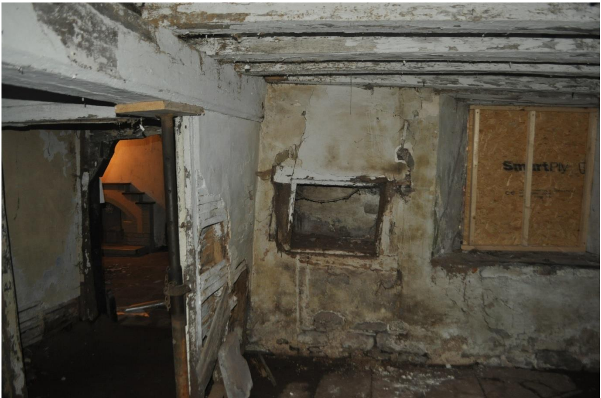
Pl.40: The north-east corner of G5, showing lobby off the adjacent hall (G3).