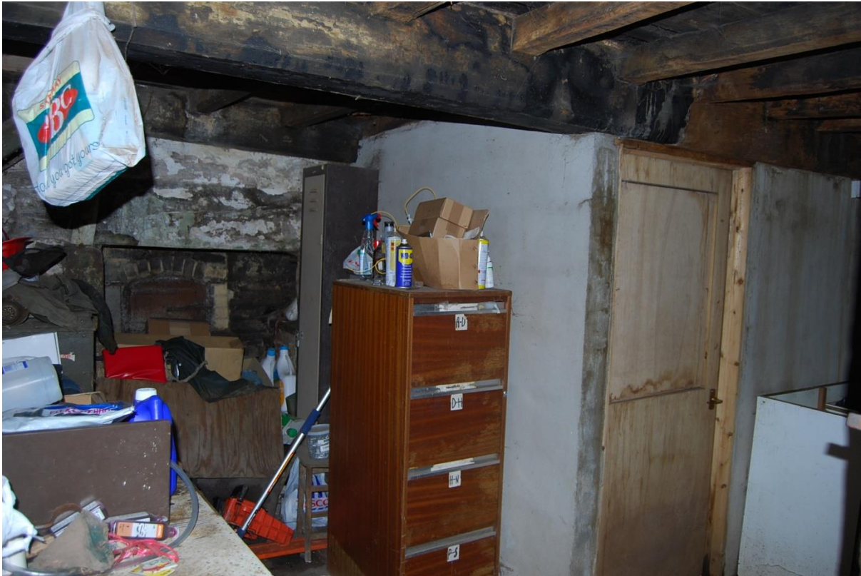
Pl.62: The northern end of the ground floor (G8) in the Rear Wing in 2009.