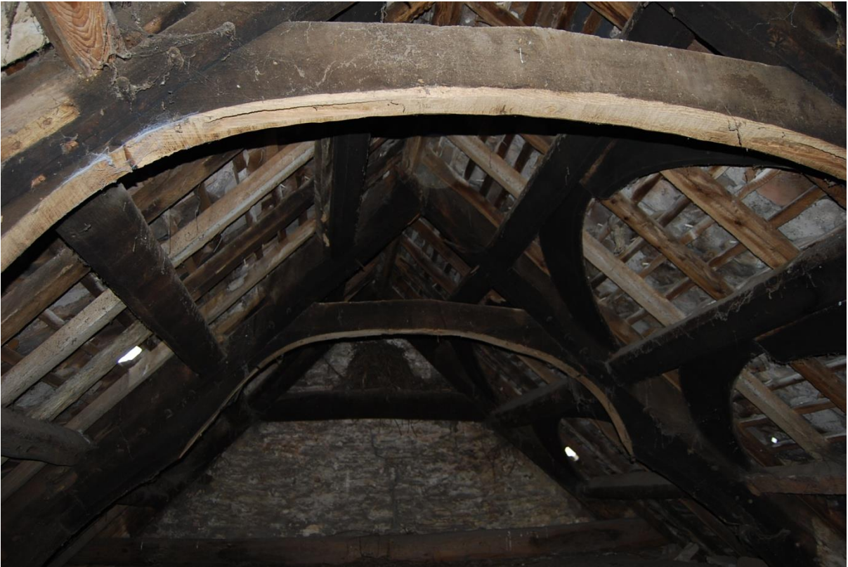
Pl.22: The southern end of the Solar wing roof, looking south.