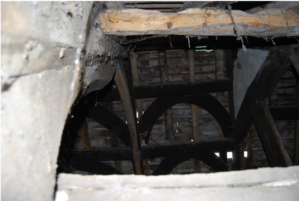
Pl.21: Part of the Solar roof structure viewed through a broken ceiling.