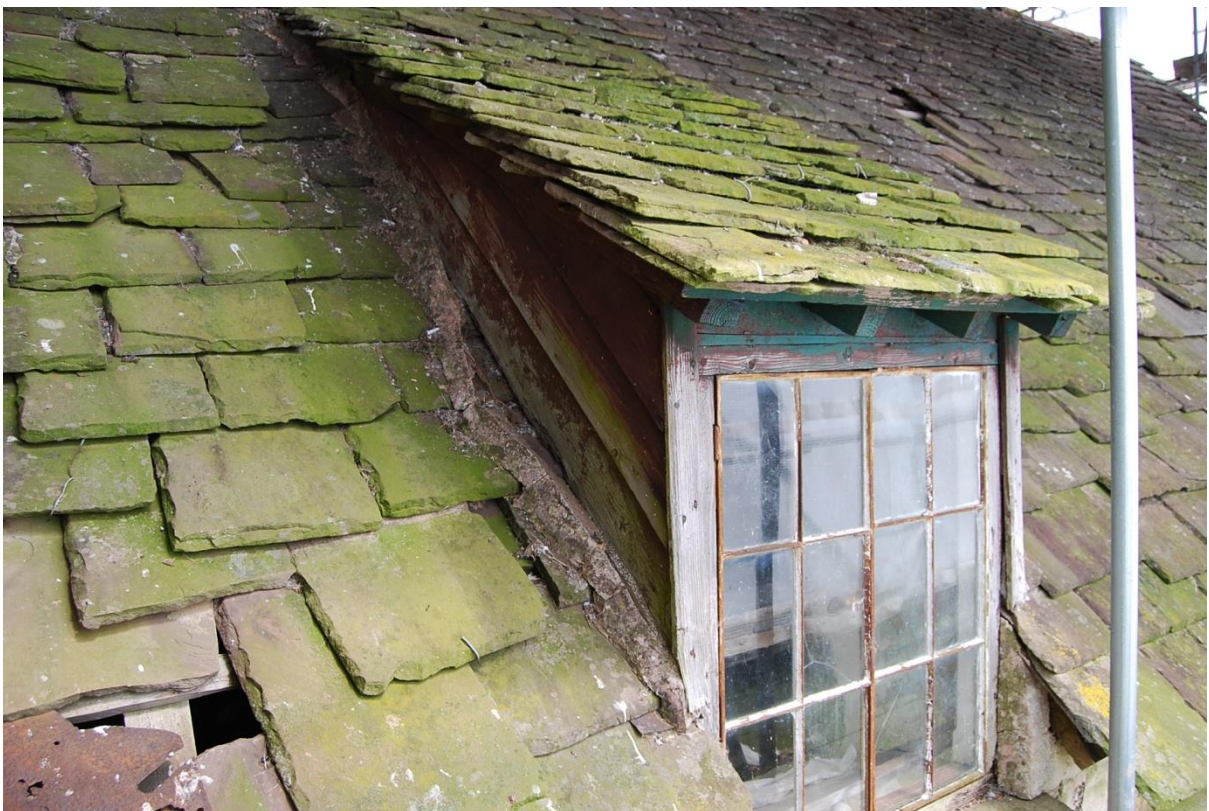
Pl.13: The dormer in the south slope of the Hall roof.