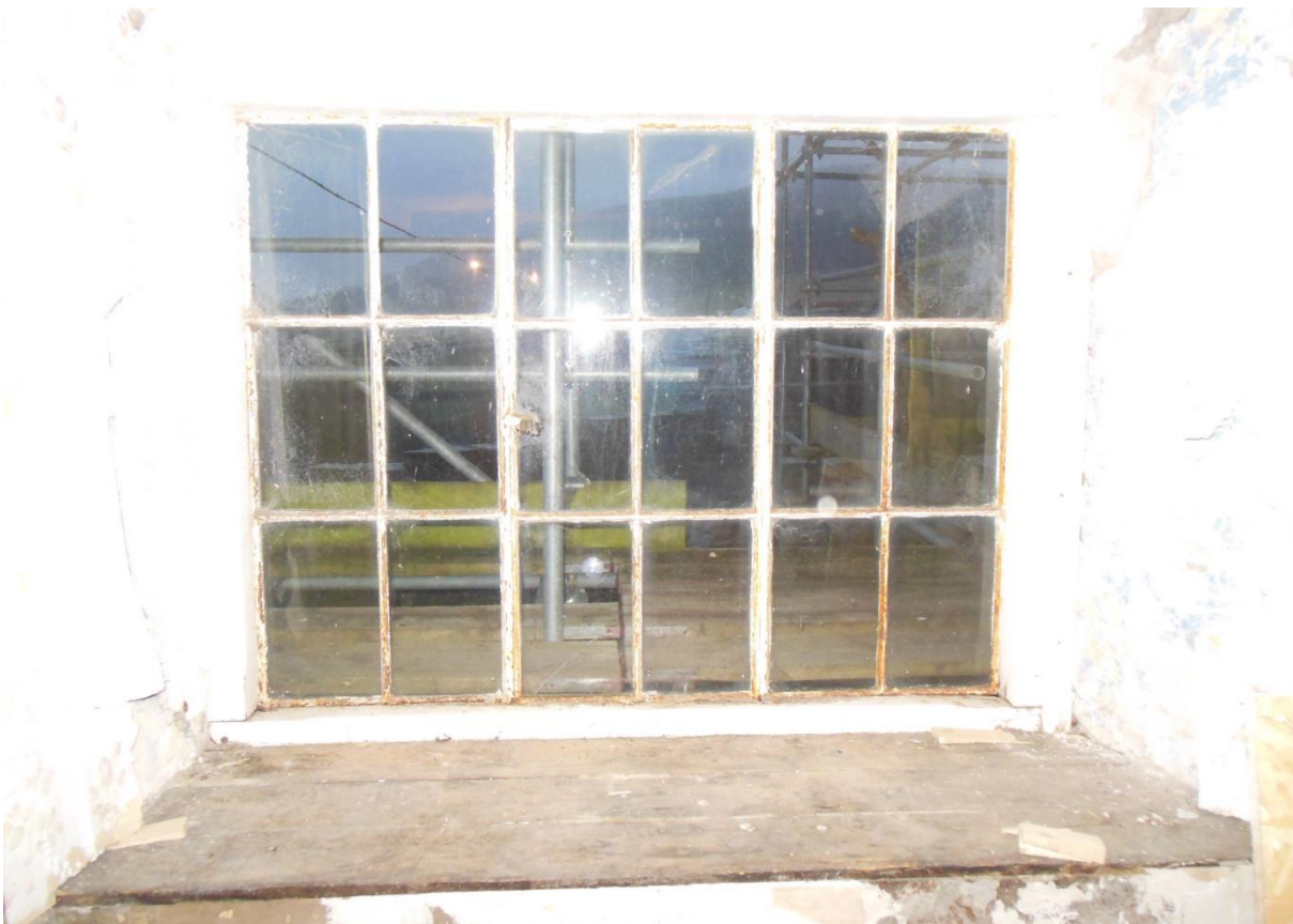
Pl.35: Detail of the window to the hall (G3).