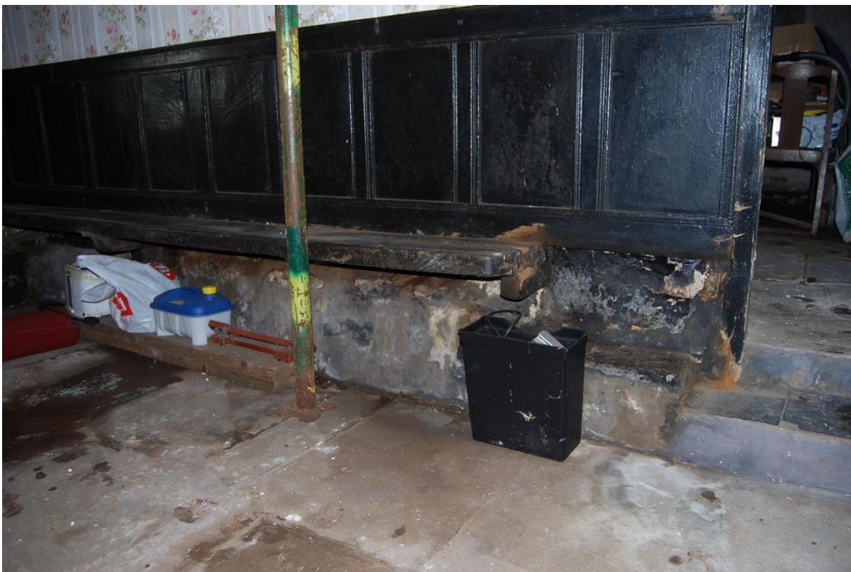
Pl.33: Detail of the dais bench at the west end of the hall.