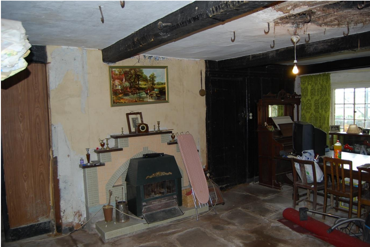
Pl.30: The hall (G3) in 2009, looking south-east.