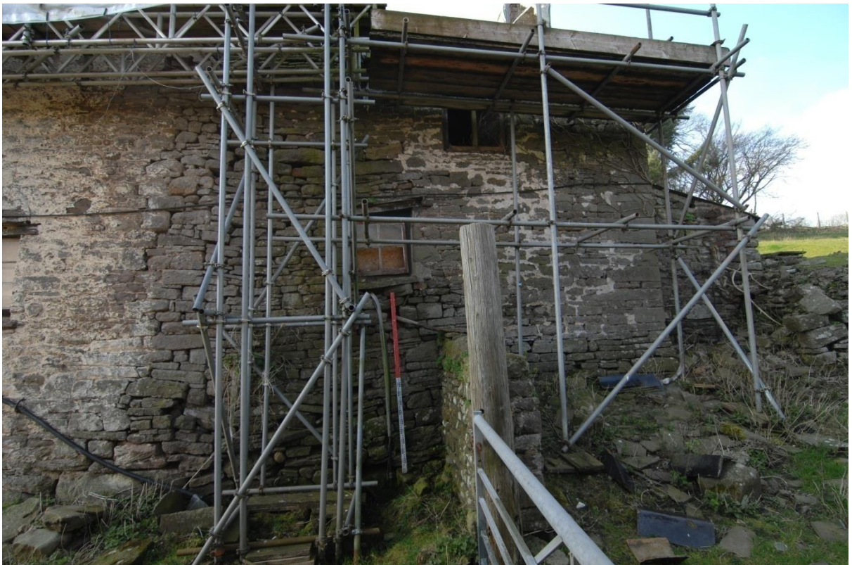
Pl.59: The east elevation of the Rear Wing (Building A3).