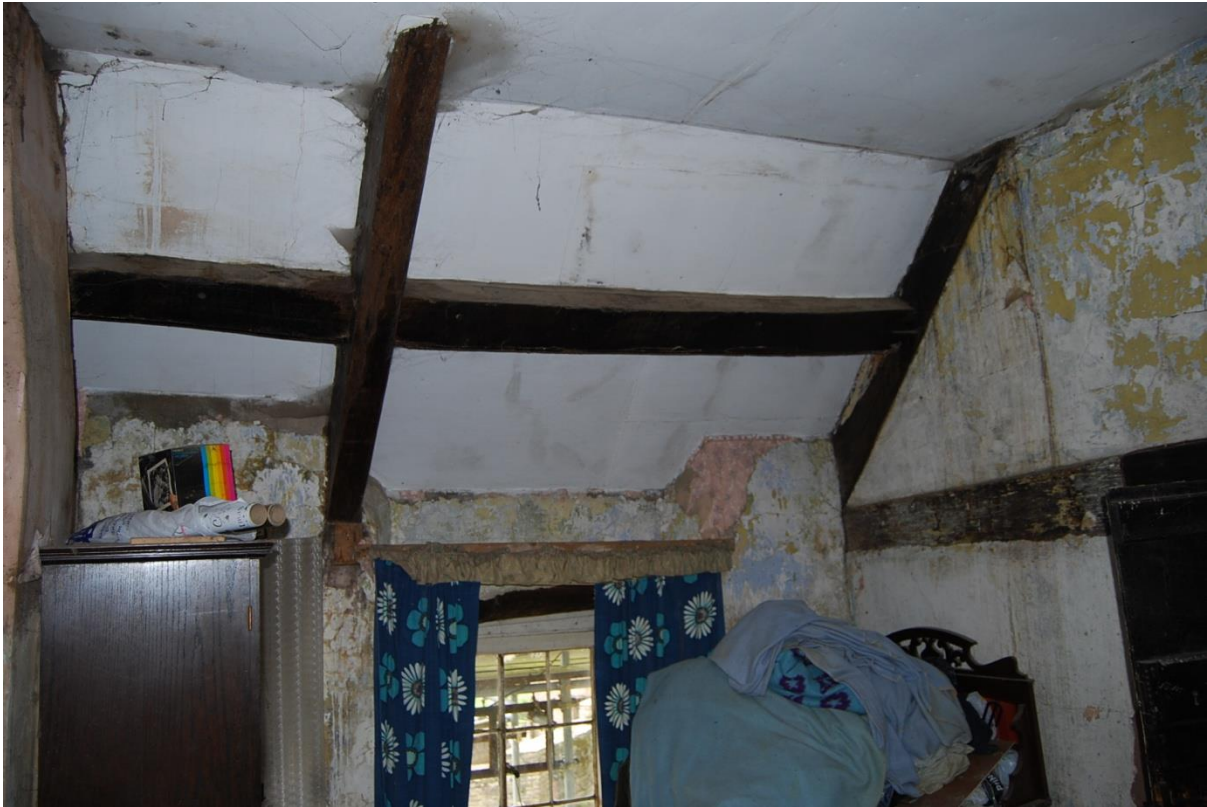
Pl.20: The underside of the south slope of the roof over the Service end.