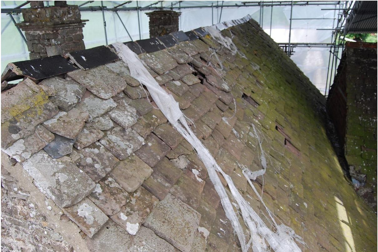
Pl.14: The east slope of the roof of the Solar, looking north.