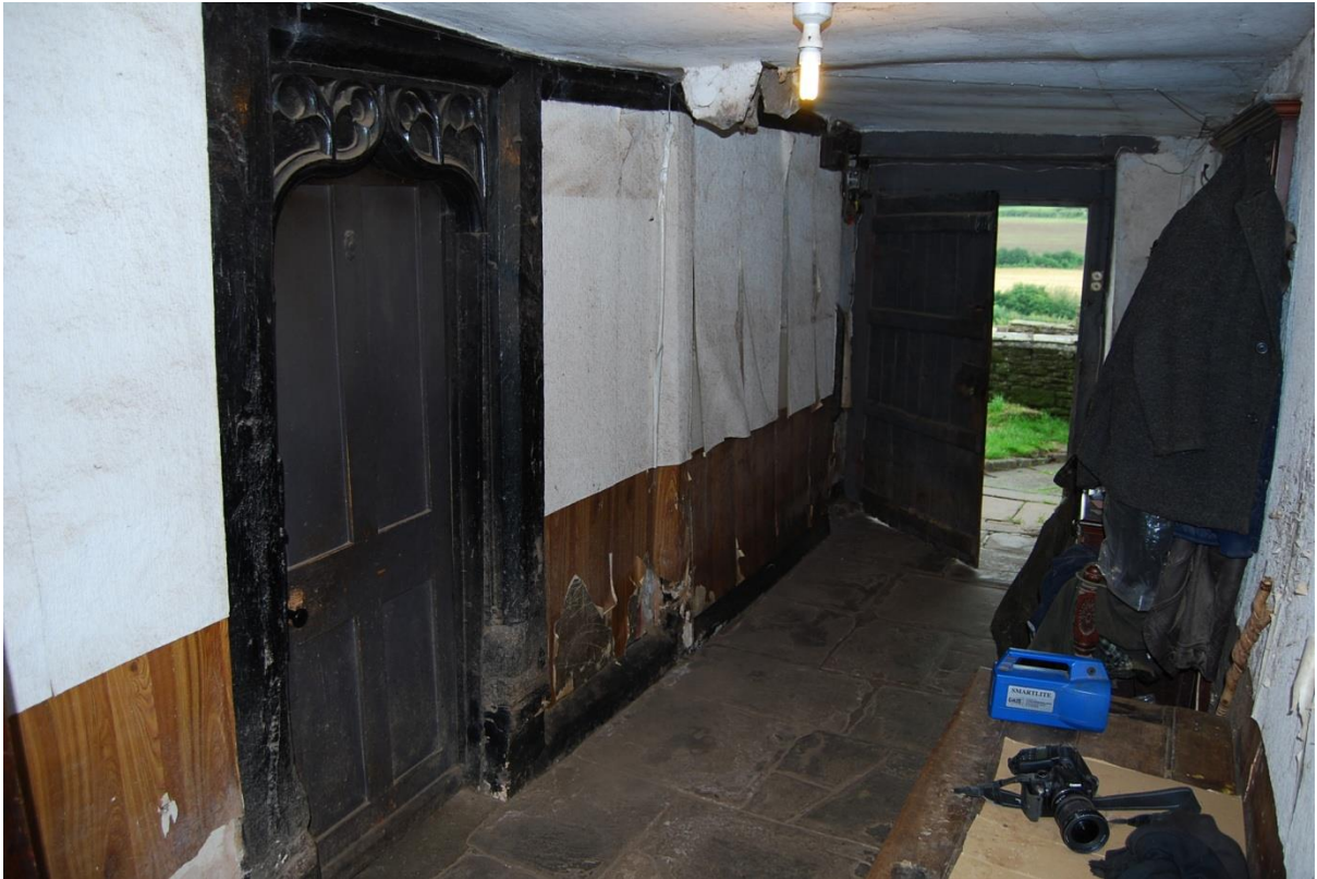
Pl.26: The entrance hall (G2) in 2009.