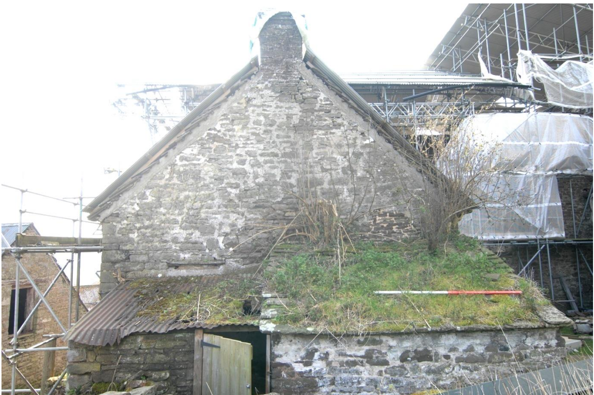
Pl.61: The north gable of the Rear Wing.