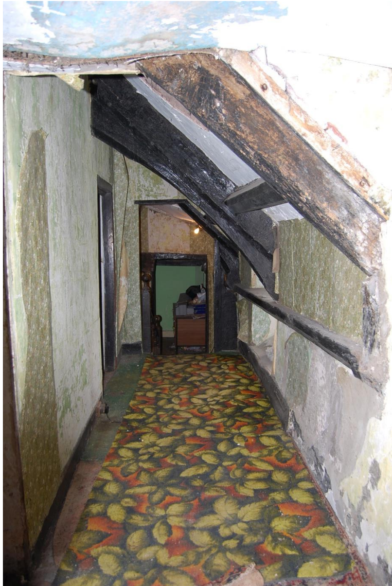
Pl.45: The main first floor corridor, looking east (F7).