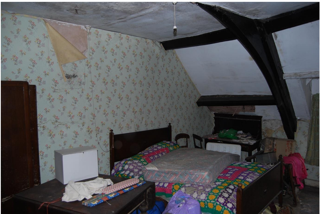
Pl.49: The bedroom (F3) above the hall, looking north-west in 2009.