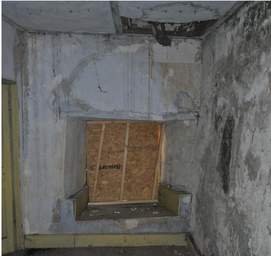
Pl.51: The southern first floor room (F6) in the Solar wing, looking north.