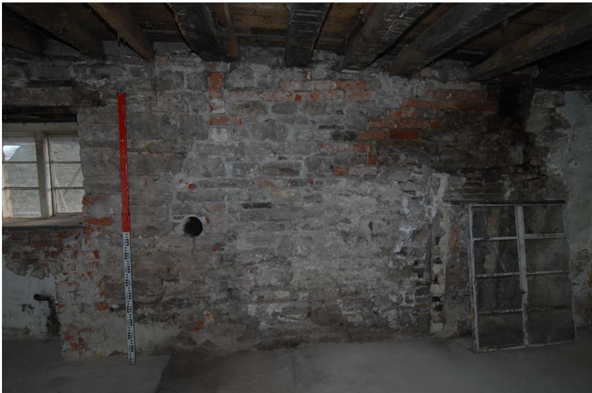
Pl.49: Exposed inner masonry of the western first-floor room of the solar, middle, 2017.