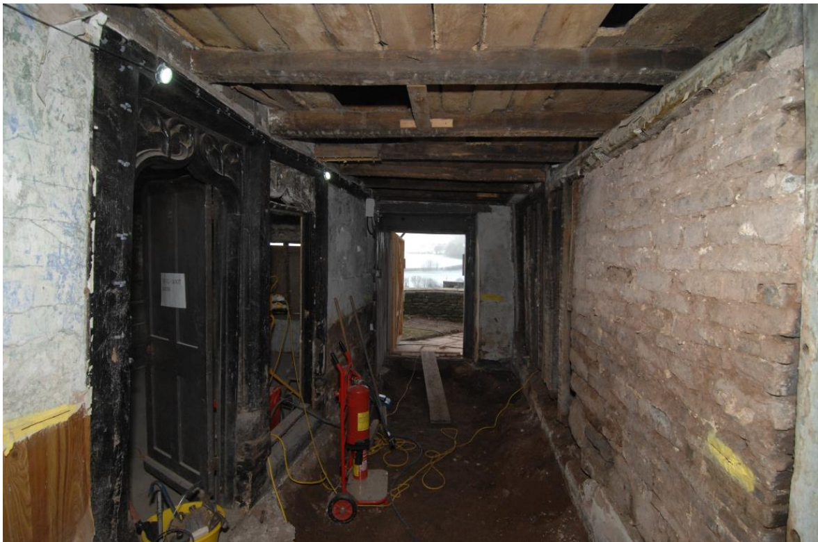
Pl.17: The entrance hall, looking south, 2016.