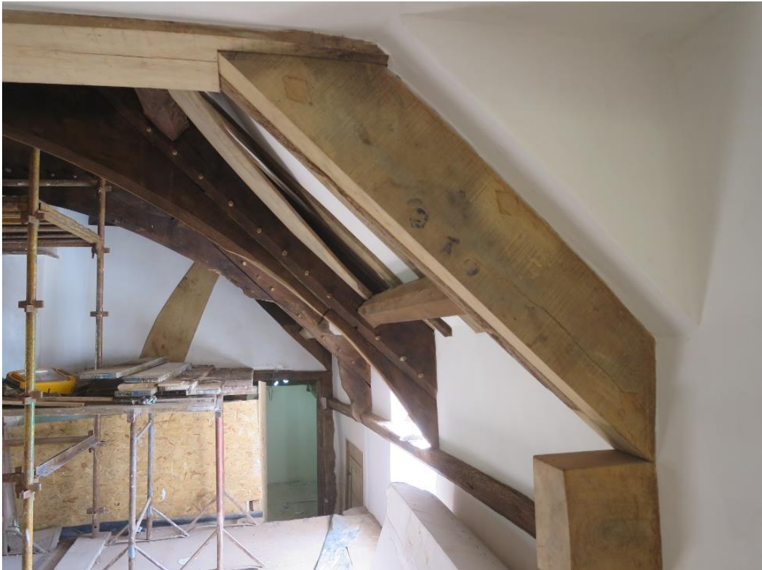
Pl.36: Upper portion of the Hall section during repairs, looking east, side corridor removed.