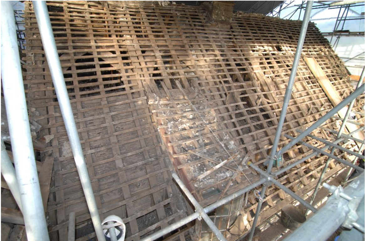
Pl.7: South slope of roof of Hall Range stripped, 2016.