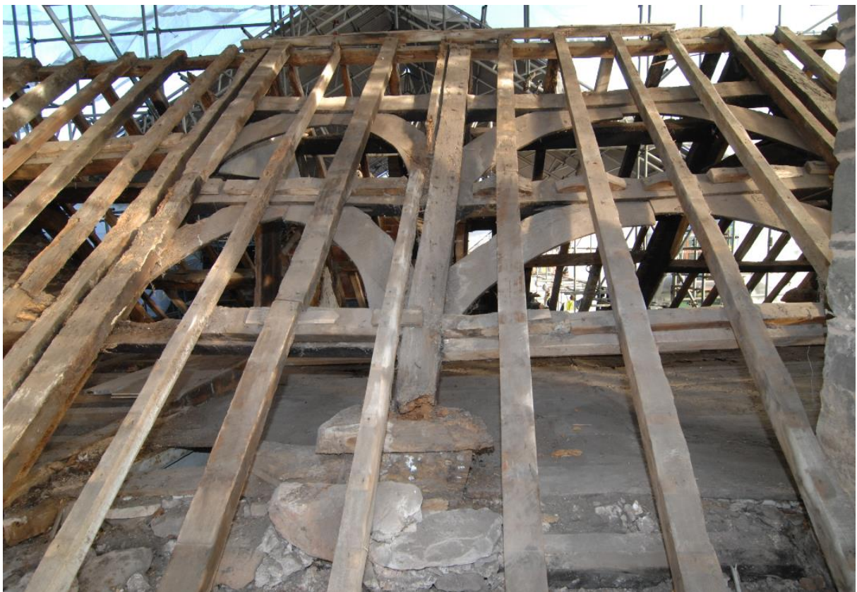
Pl.15: Central section of the west slope of the Solar roof.