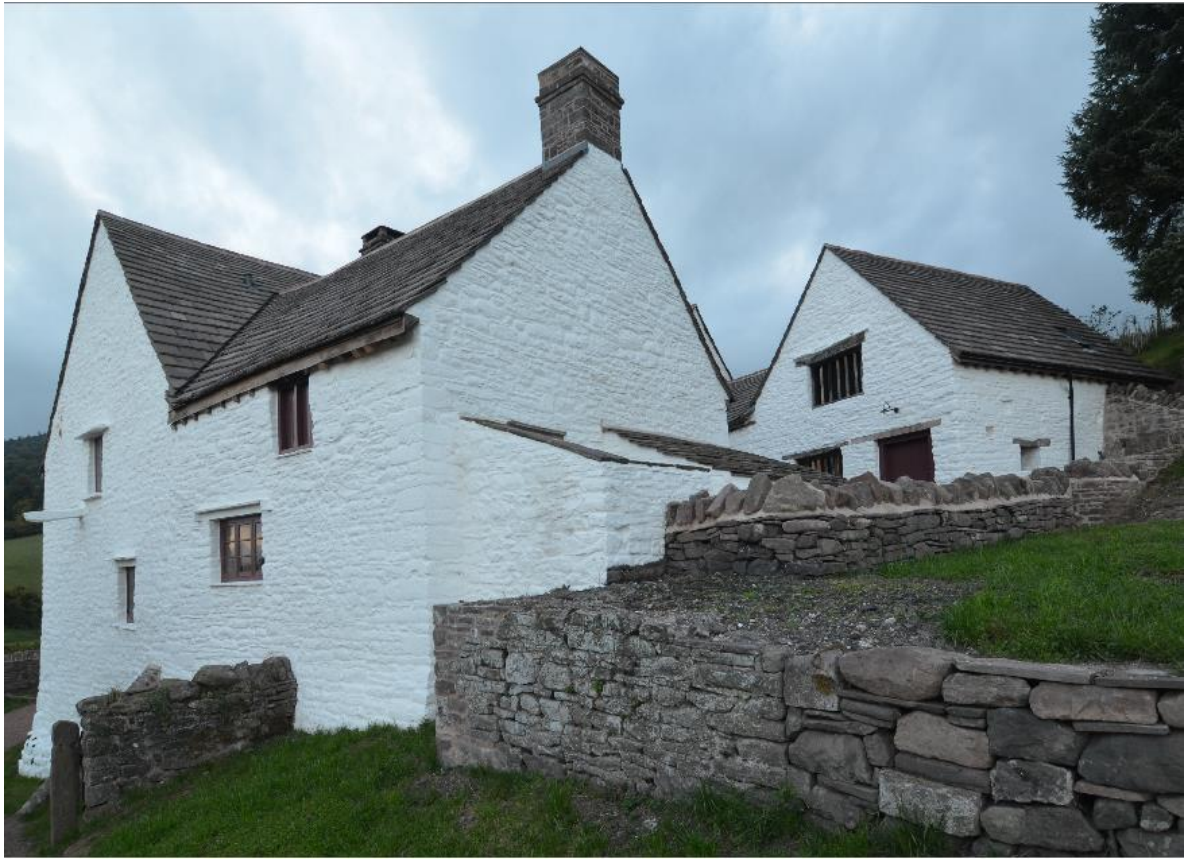
Pl.5: The restored house from the north-east, 2018.