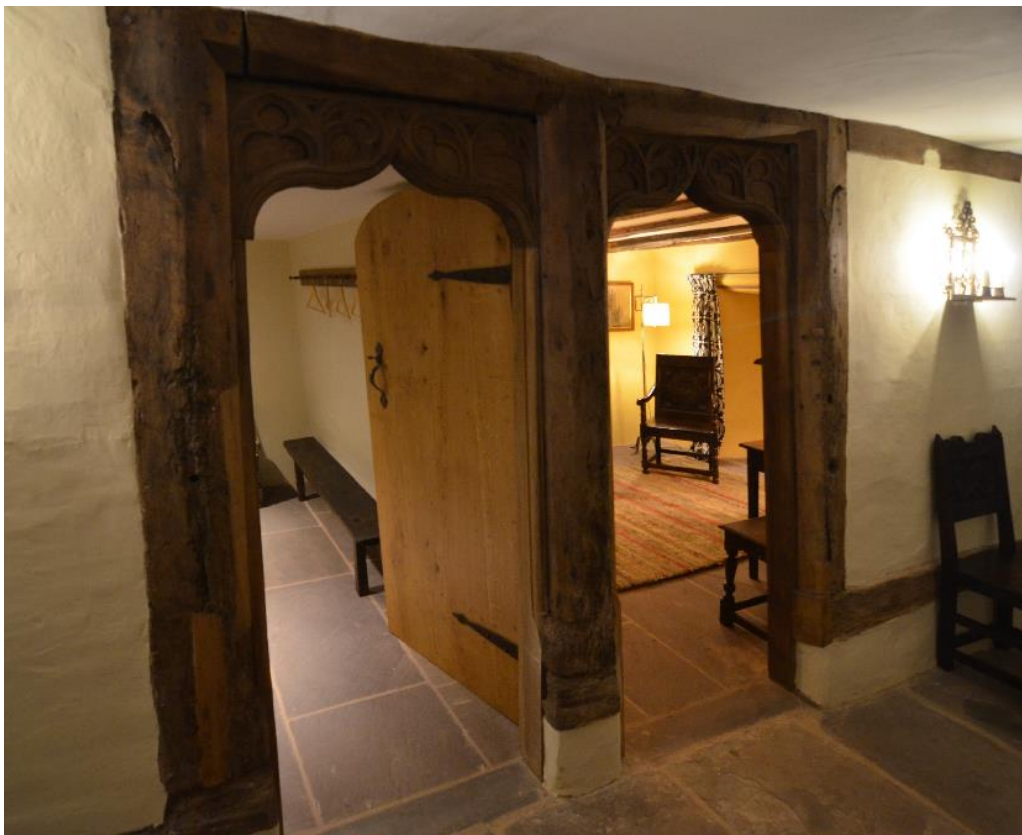
Pl.21: The service doors, 2018.