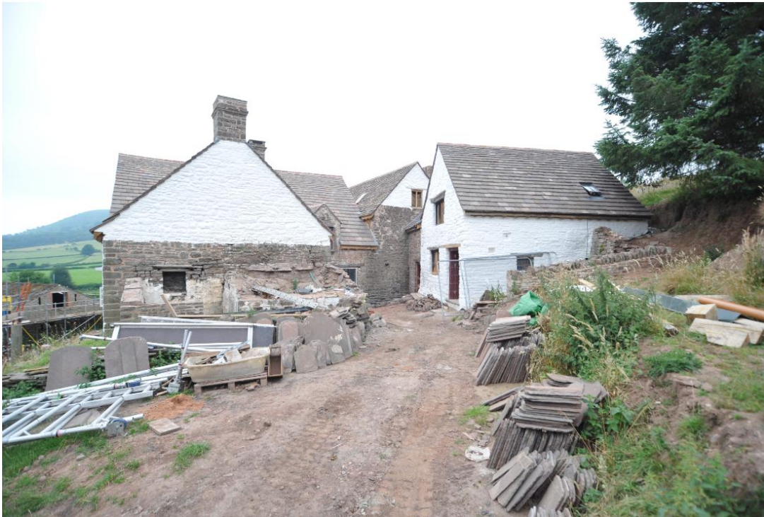
Pl.65: Rear of farmhouse in 2017, with Apple Store (Building C) to right.