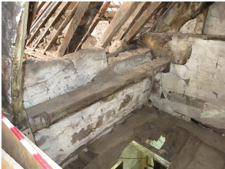
Pl.10: Surviving section on inner wall-plate of Hall roof, north of main stack.