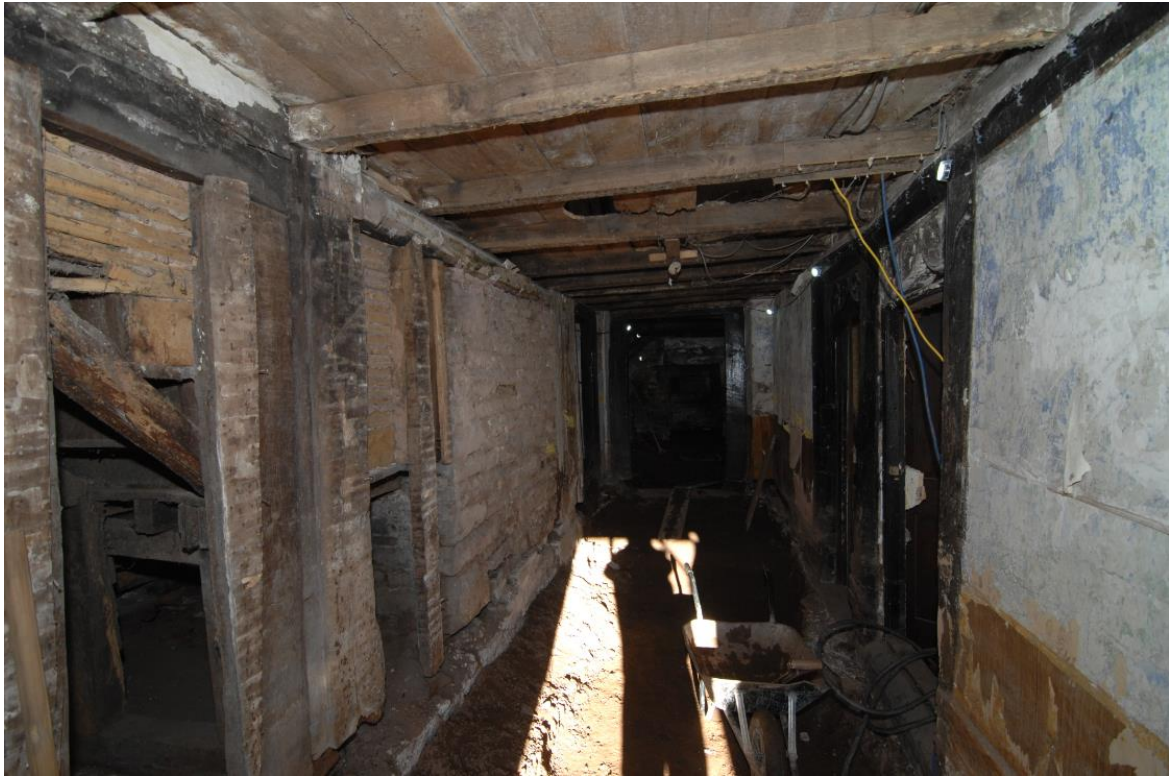
Pl.16: The entrance hall (G2), looking north in 2016.