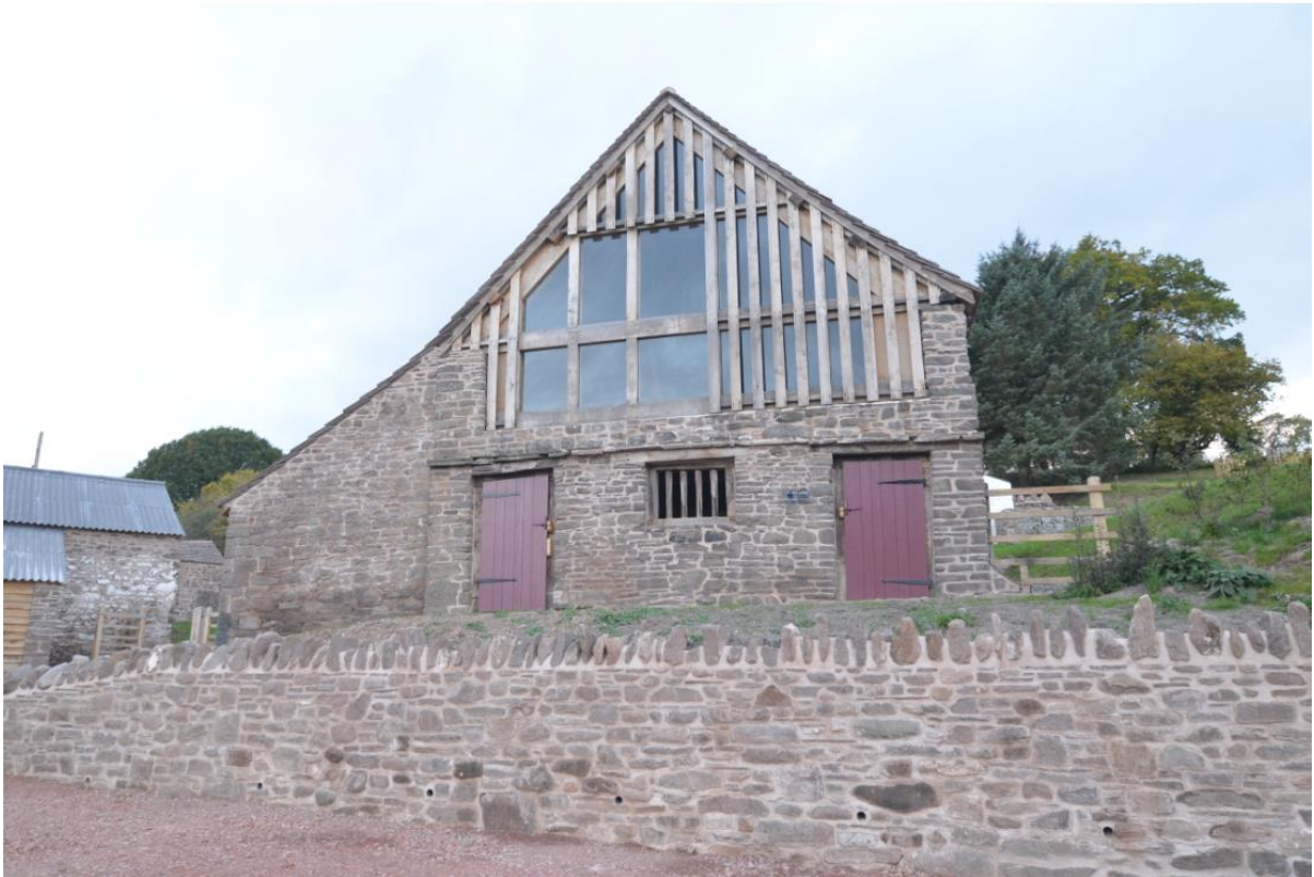
Pl.79: East gable of restored Beast House.