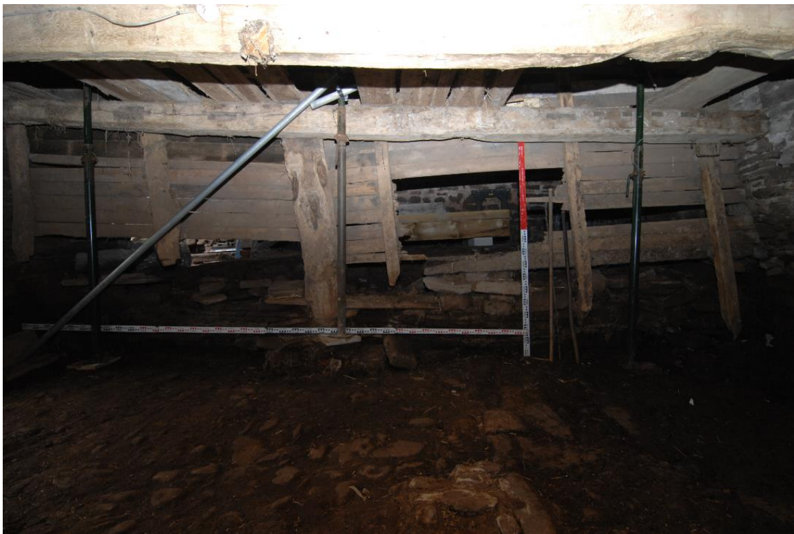
Pl.74: View west in Beast House to revetment wall and boarded cross frame, 2016.