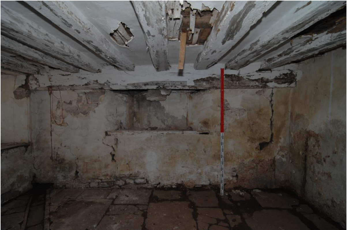
Pl.44: South end of the south ground-floor room in the solar, 2017.