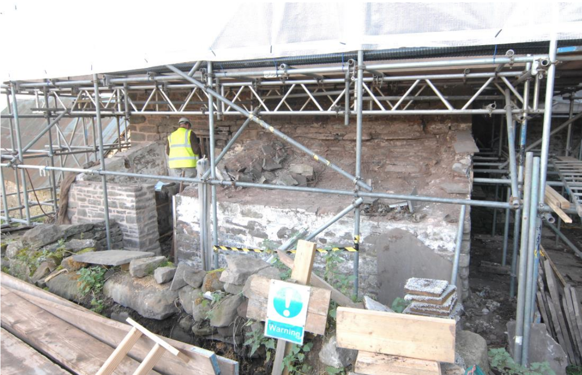
Pl.55: Work in progress on north gable end of the Rear Wing.