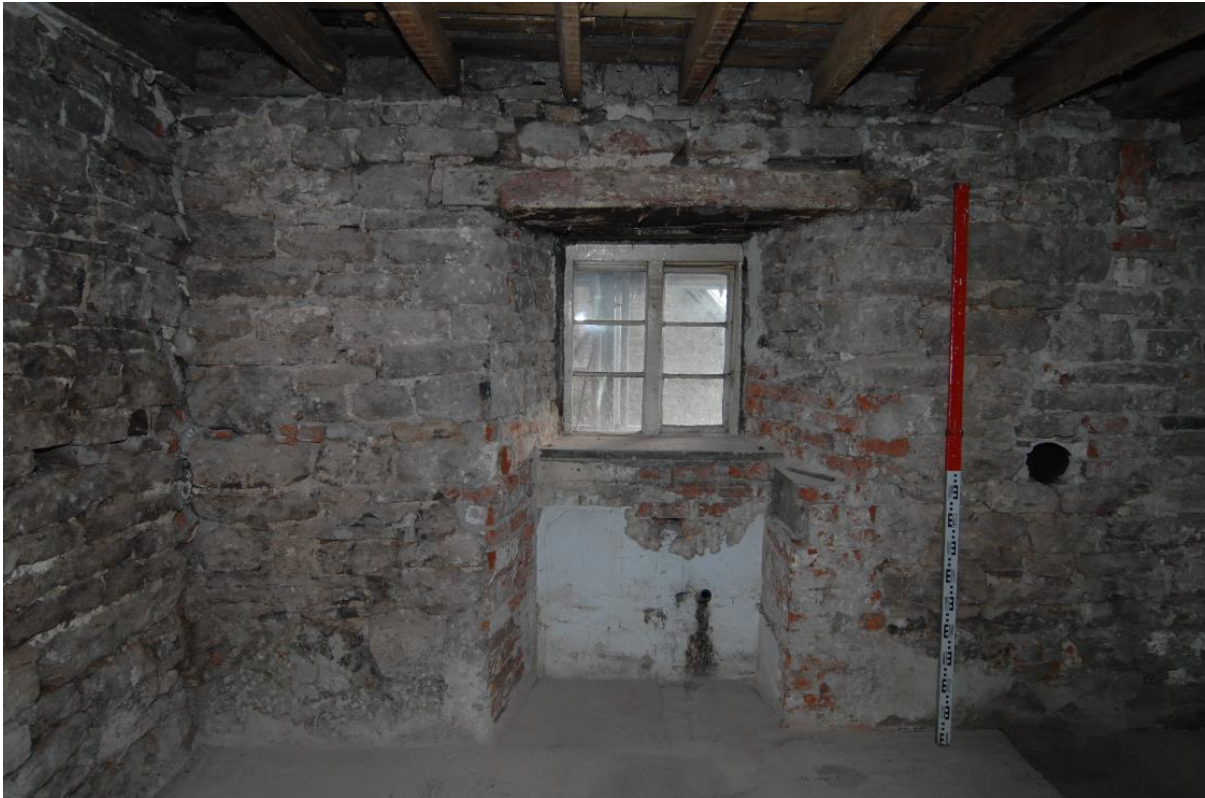
Pl.48: Exposed inner masonry of the western first-floor wall of the solar, south end., 2017.