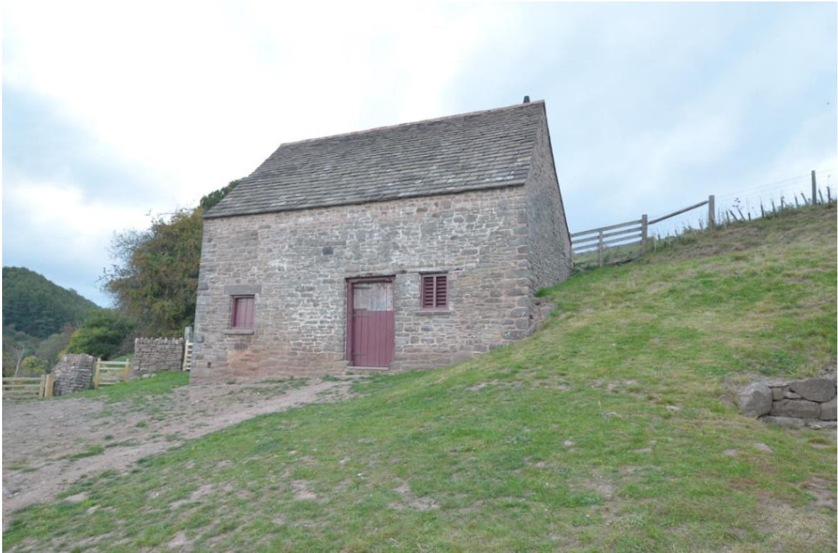
Pl.67: Restored and raised West Barn or Stable, Building E, from the east.