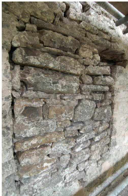
Pl.2: Blocked first-floor window opening discovered in south gable of Solar, now opened.