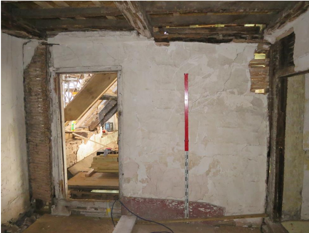
Pl.52: Norther first-floor room in solar, looking east into the hall range, 2017.