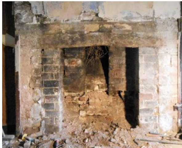
Pl.27: The Phase III arrangements, probably of the later-19 th century.