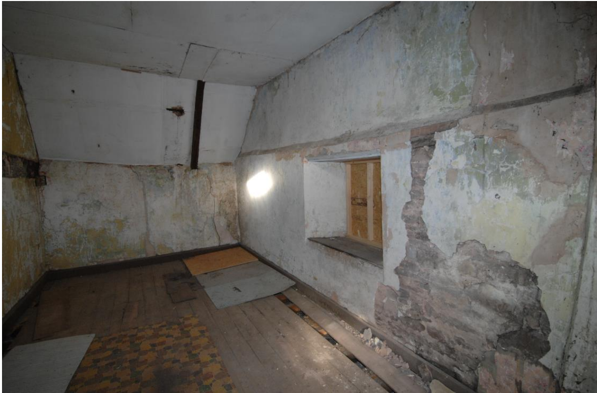
Pl.40: Bedroom over services after clearance but in advance of repairs.