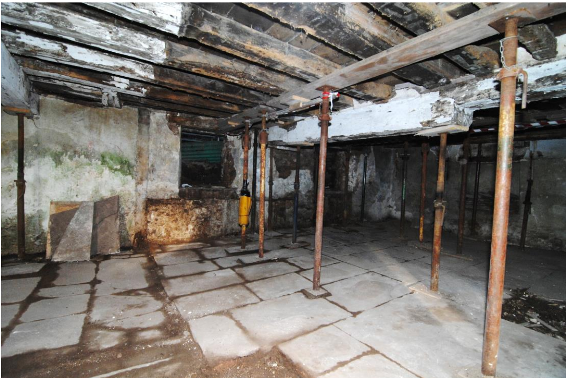
Pl.43: Ground-floor of solar, looking north-west after removal of inserted partitions, 2017.