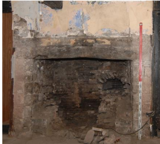
Pl.26: Evolution of the hall fireplace – phases I and II, the original open fireplace of the 17 th century with the inserted bread oven to the right; other remnants belong to Phase III.