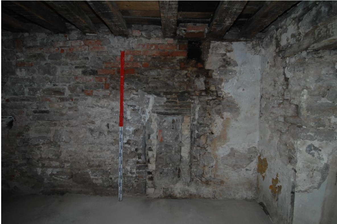
Pl.50: Exposed inner masonry of the western first-floor room of the solar, north end, 2017.