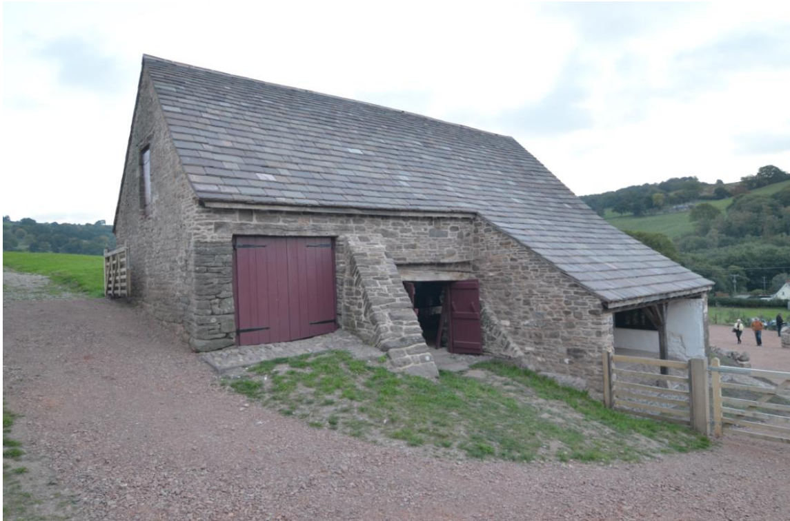
Pl.77: Restored Beast House and rebuilt Shelter Shed (Building G) from the south-west.