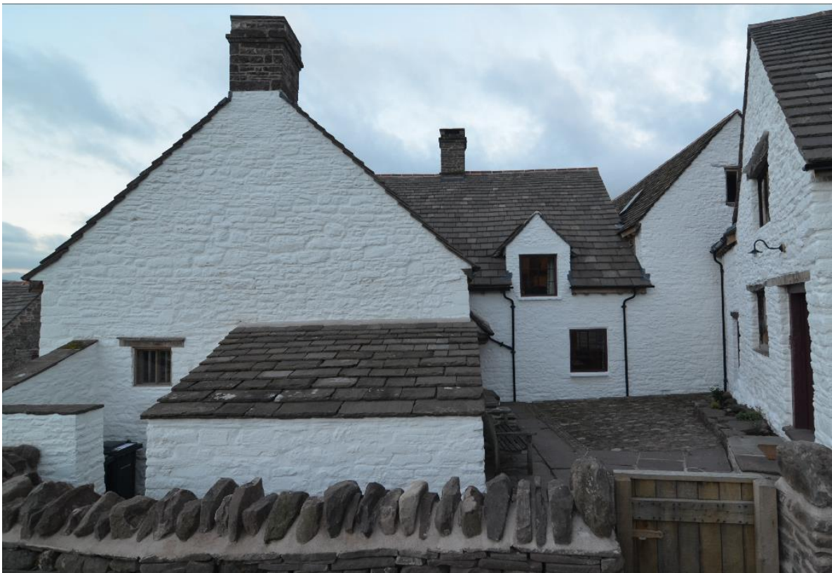
Pl.6: Rear, or north, elevation of the restored house, 2018.