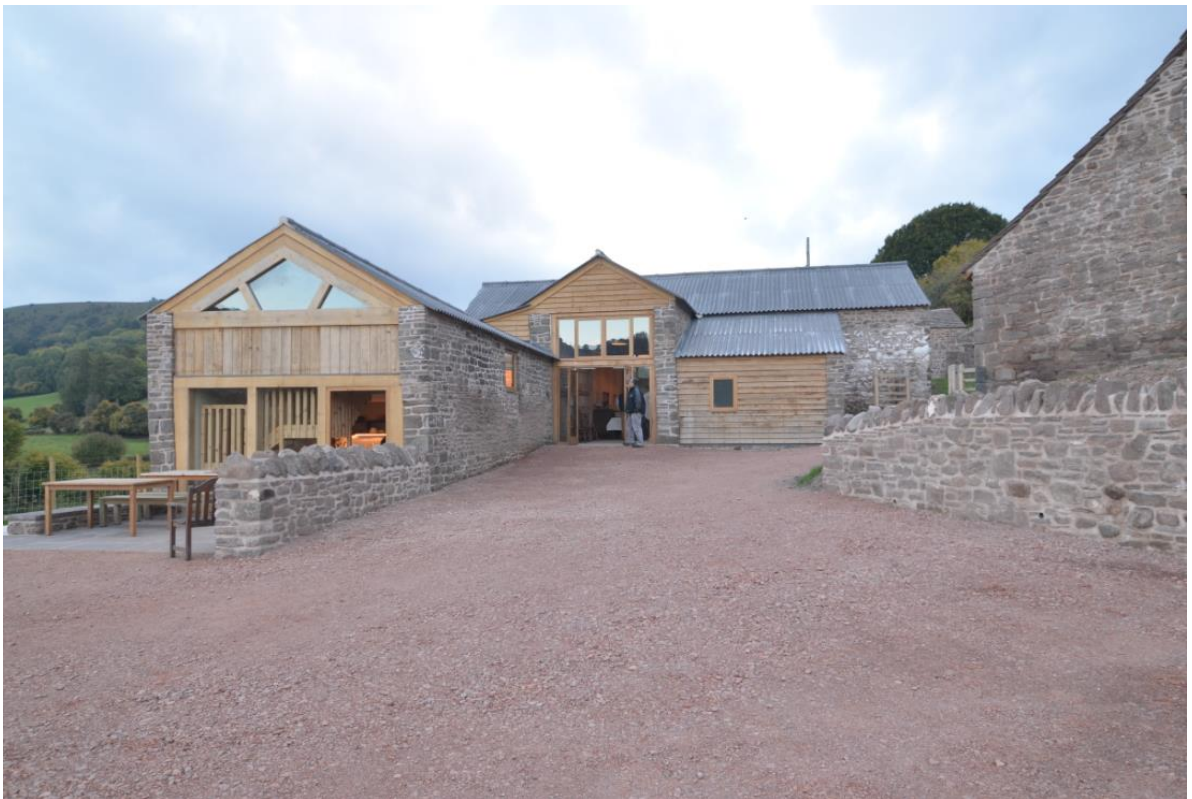
Pl.88: View of the eastern farm buildings from the east.