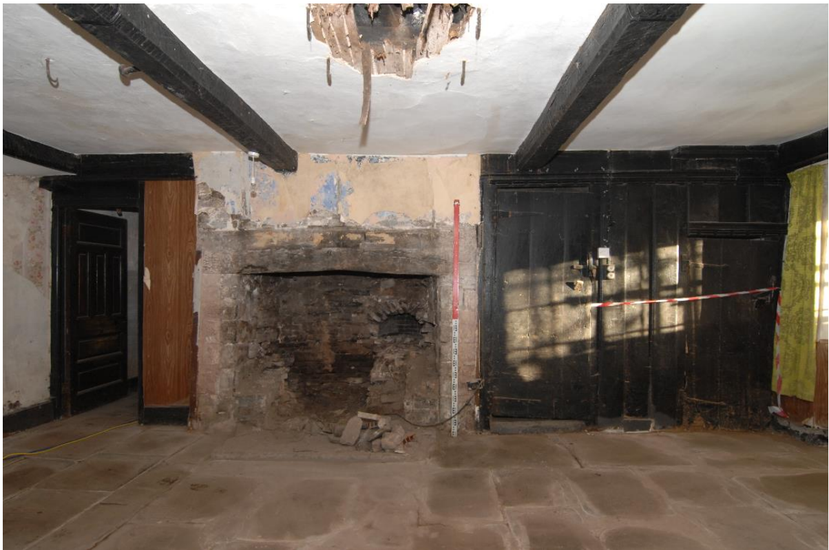
Pl.25: The hall, looking east 2016.