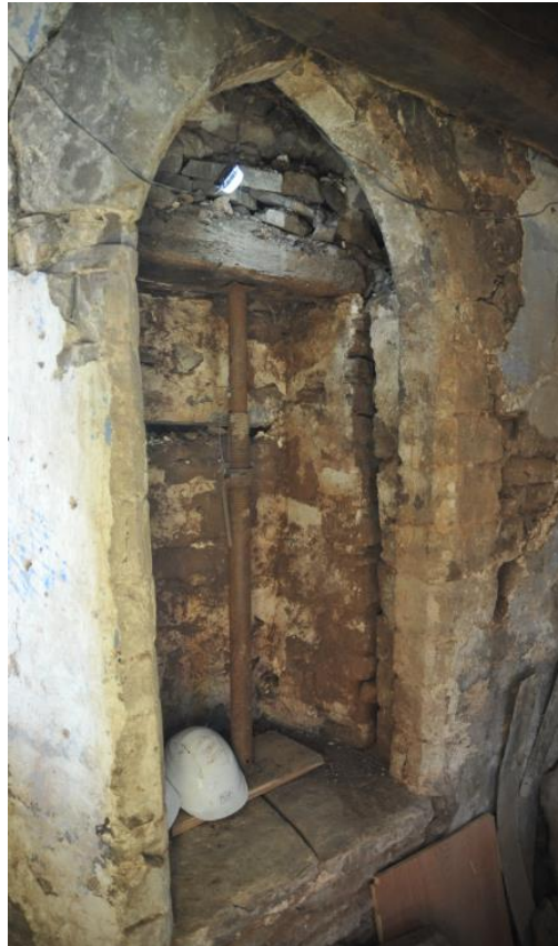
Pl.32: The doorway once the main infill had been removed.