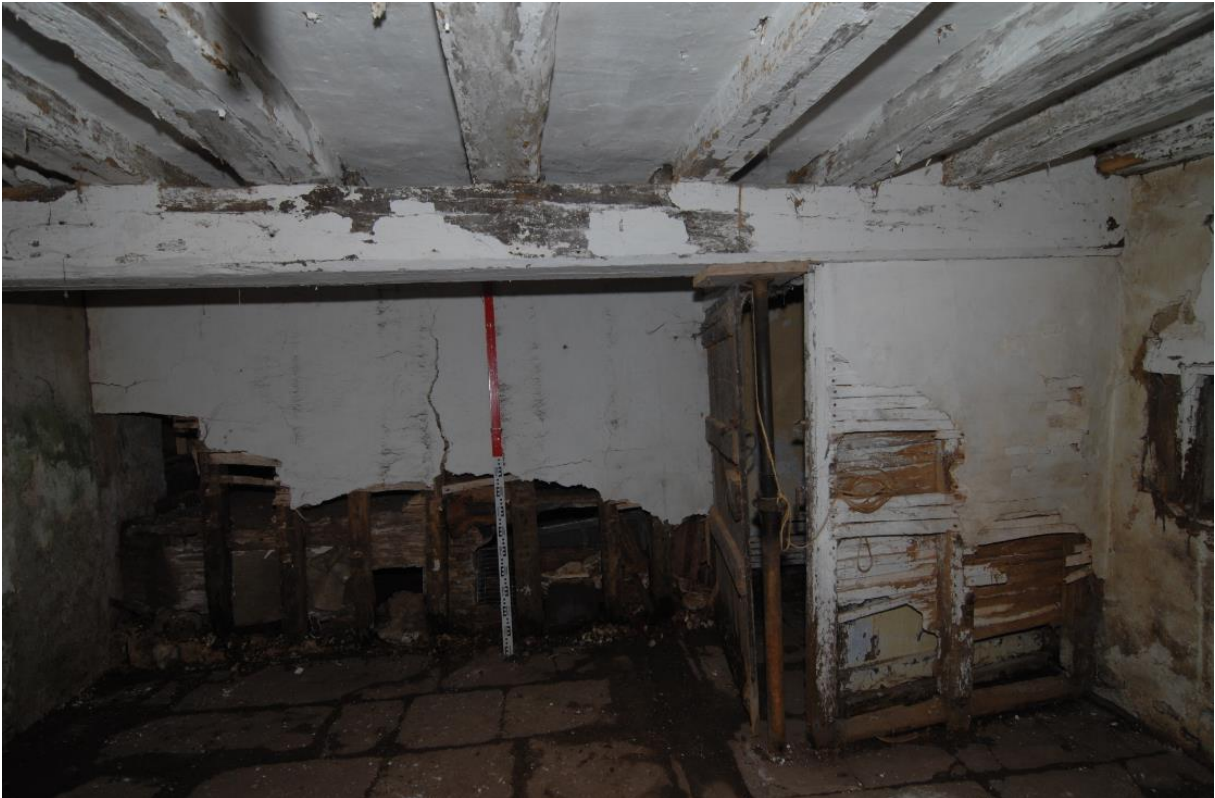
Pl.46: North wall of south ground-floor room of the solar prior to removal, 2016.