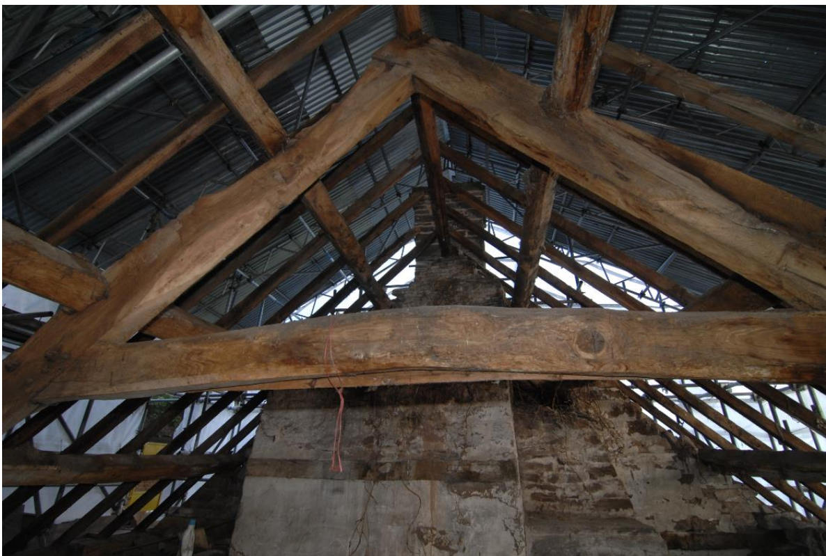
Pl.59: Roof truss of the Rear Wing.