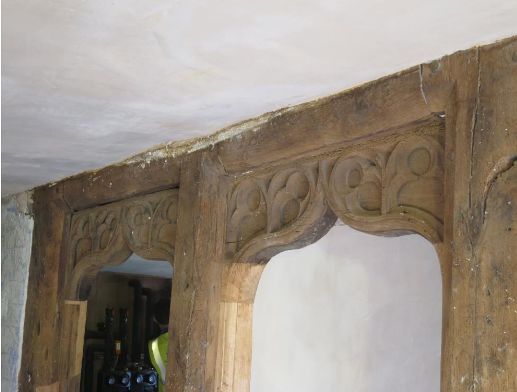
Pl.20: Restored heads of paired doorways to the services, 2017.