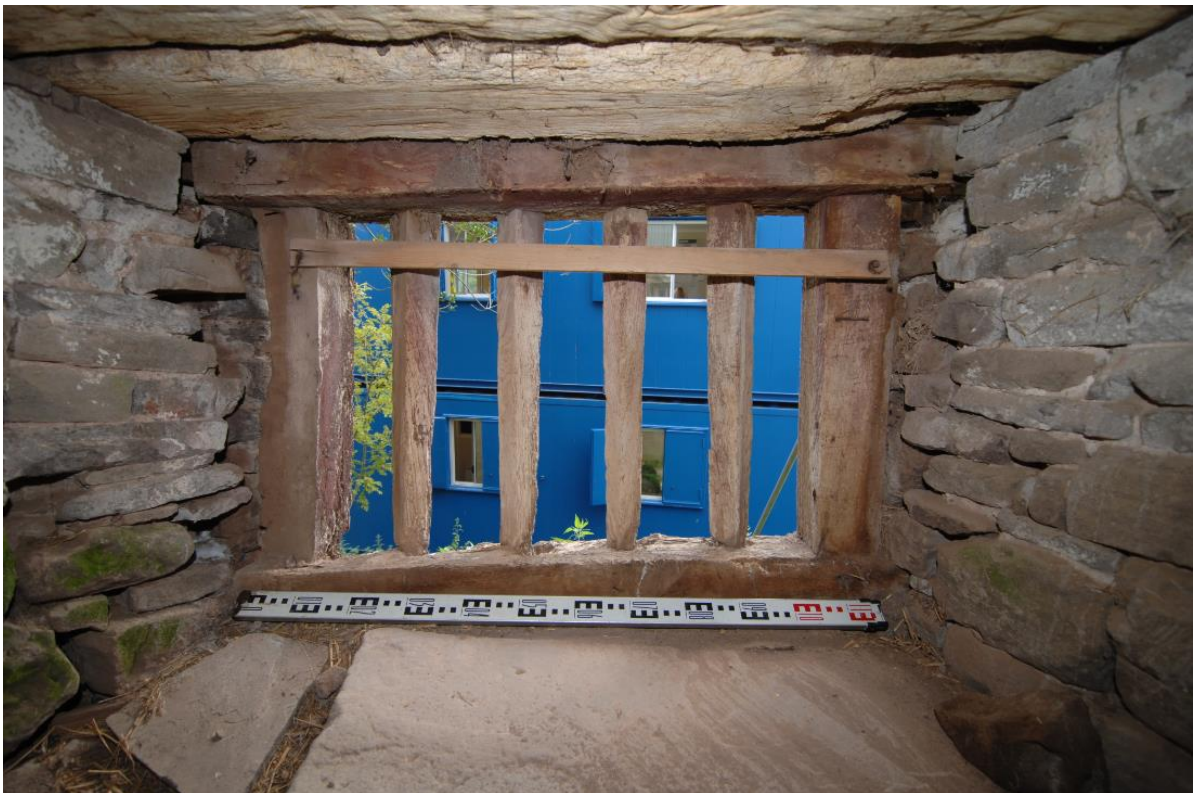
Pl.76: Detail of internal reveal of east gable window of the Beast House.