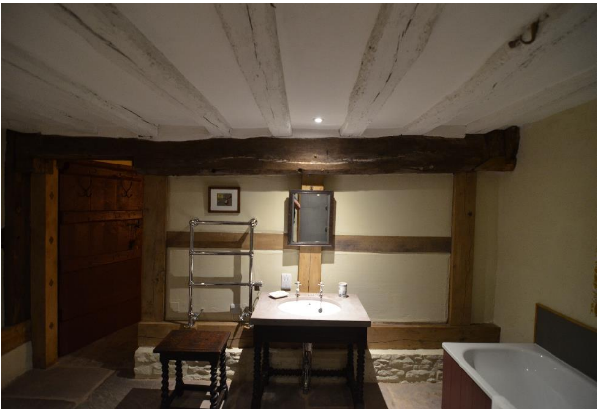
Pl.47: The restored cross-frame between the two ground-floor solar rooms, 2018.