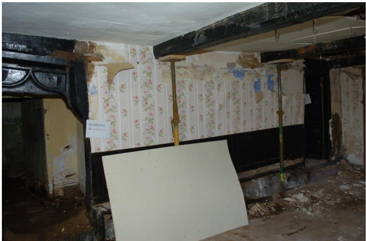
Pl.23: Dais end of the hall early in the project.