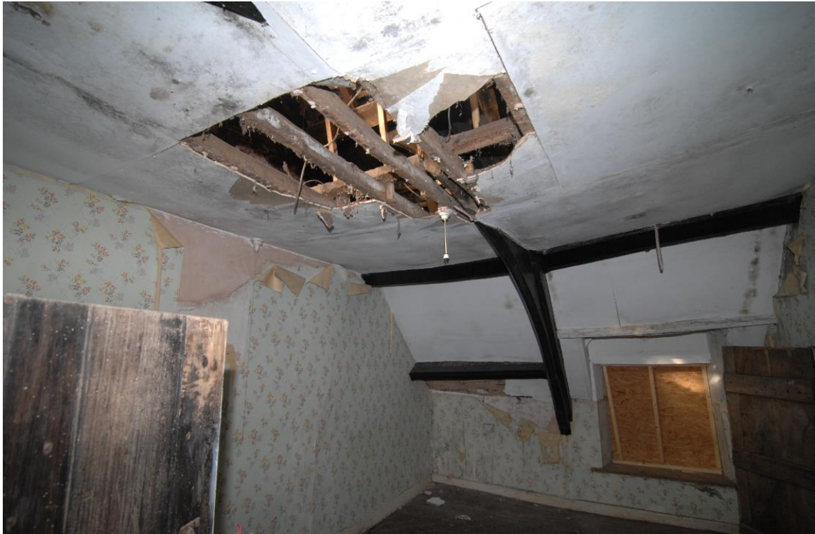
Pl.38: Chamber over hall prior to removal of partitions.