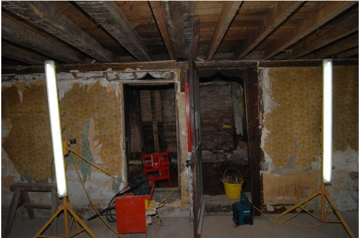
Pl.22 : The former services looking to the paired screens passage doorways, 2016.