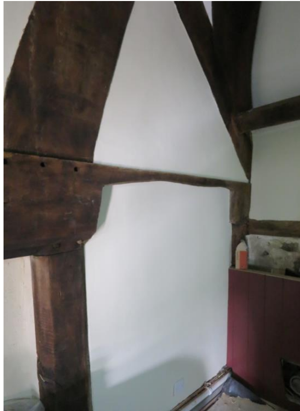
Pl.34: Remains of inserted blocked doorway for stairs through north side of spere truss.