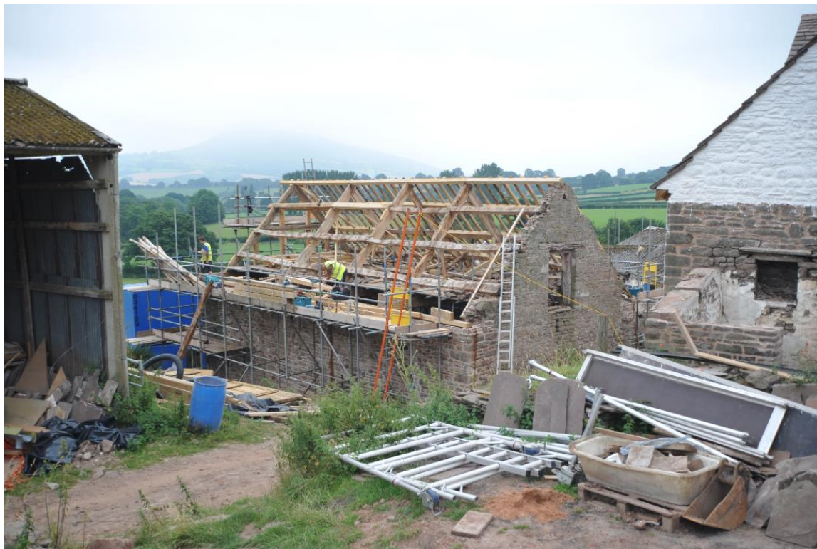
Pl.70: The Beast House from the north-west, 2016, works in progress on roof.