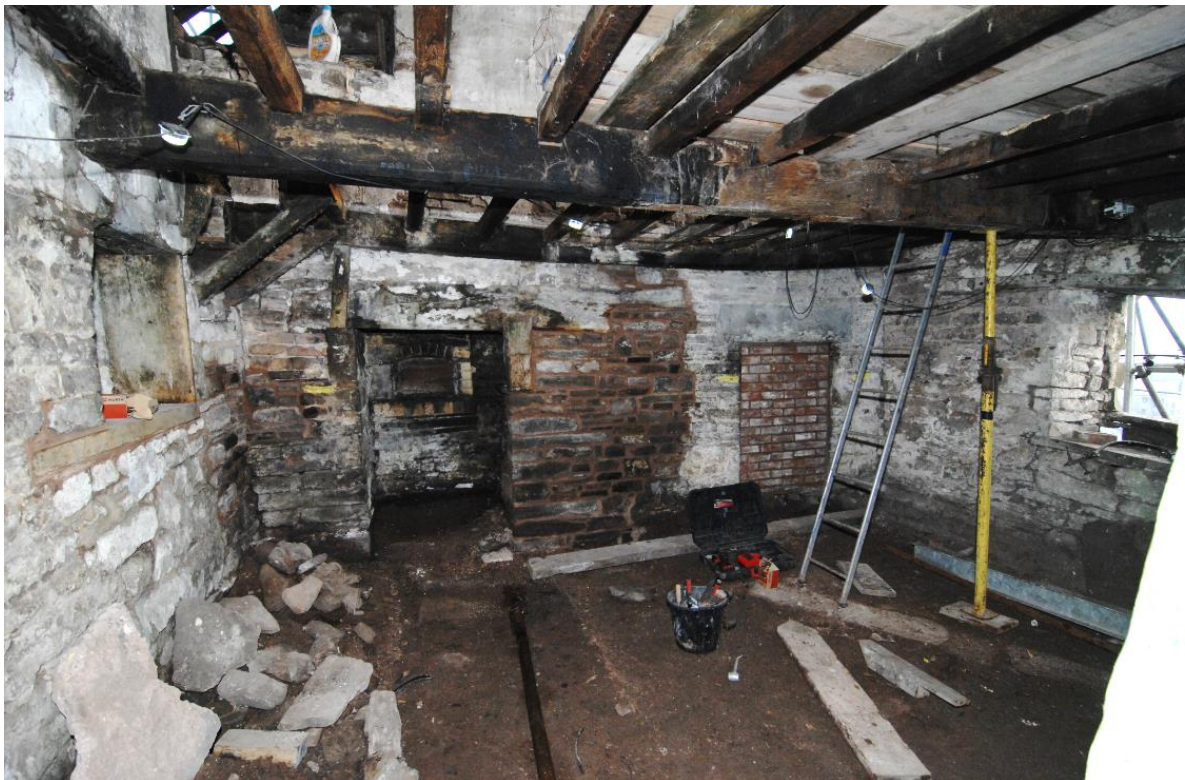
Pl.61: Stripping out work continuing, ground-floor, looking north.