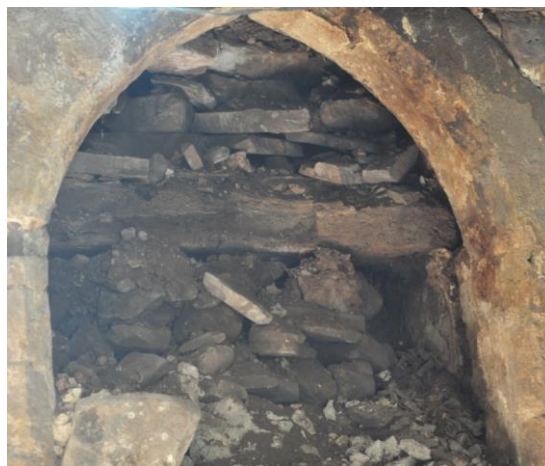
Pl.31: Detail of blocking of the top of the doorway.