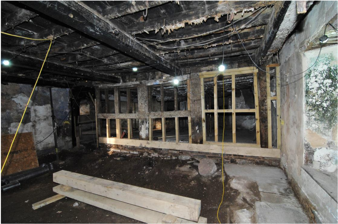
Pl.24: The hall, looking west to the exposed dais end frame.