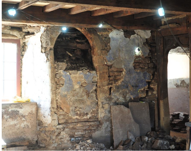
Pl.29: Doorway found on the inner face of the south wall near the dais end of the hall, 2017.