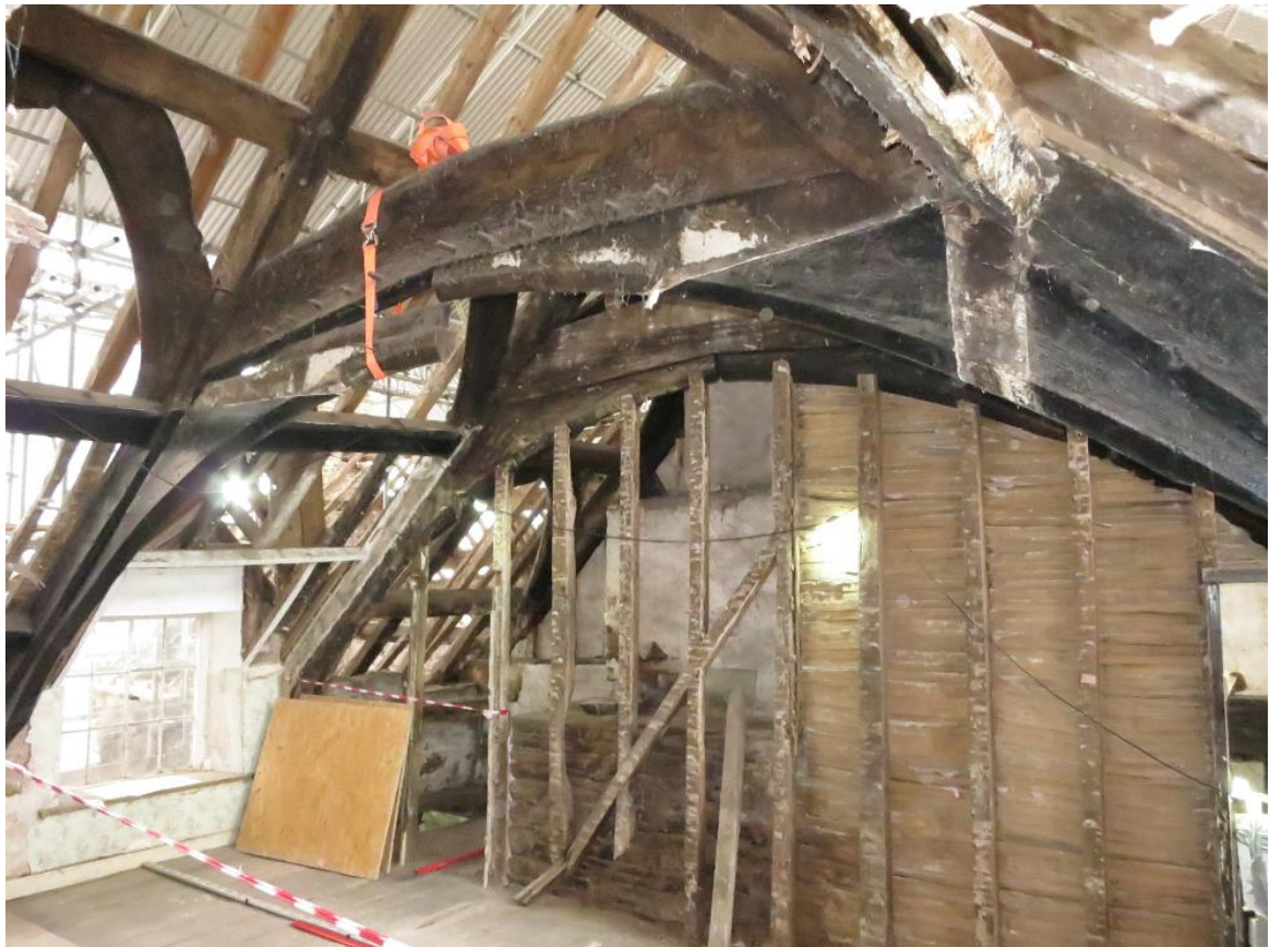
Pl.8: Part of the roof over the former hall in the Hall Range, 2016.