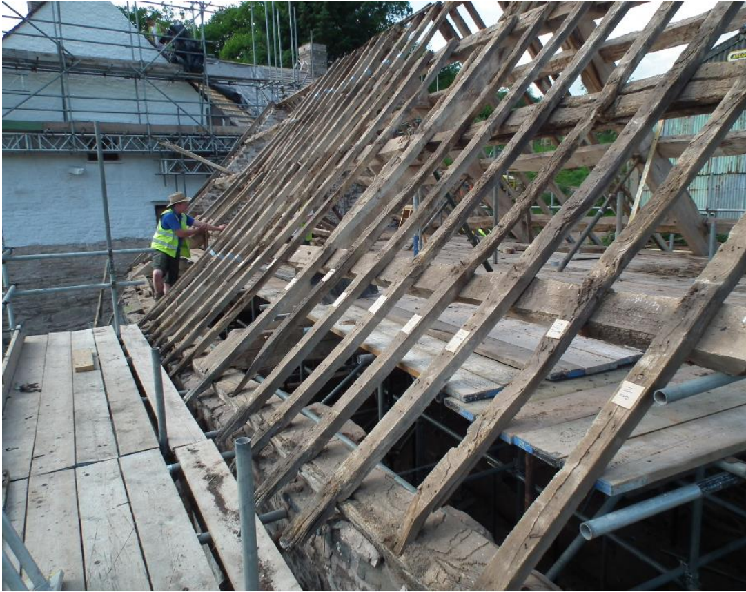
Pl.71: South slope of Beast House roof after being stripped.