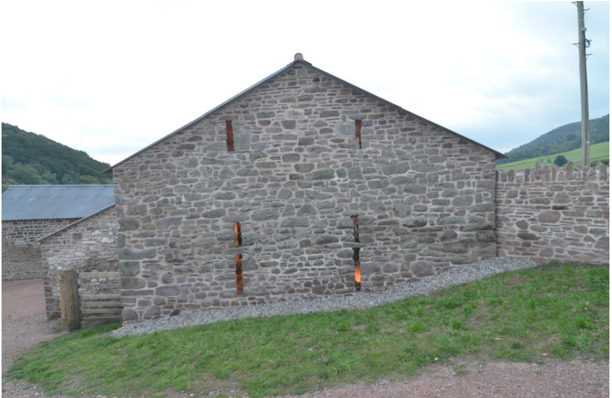
Pl.87: The north gable of the restored Threshing Barn.