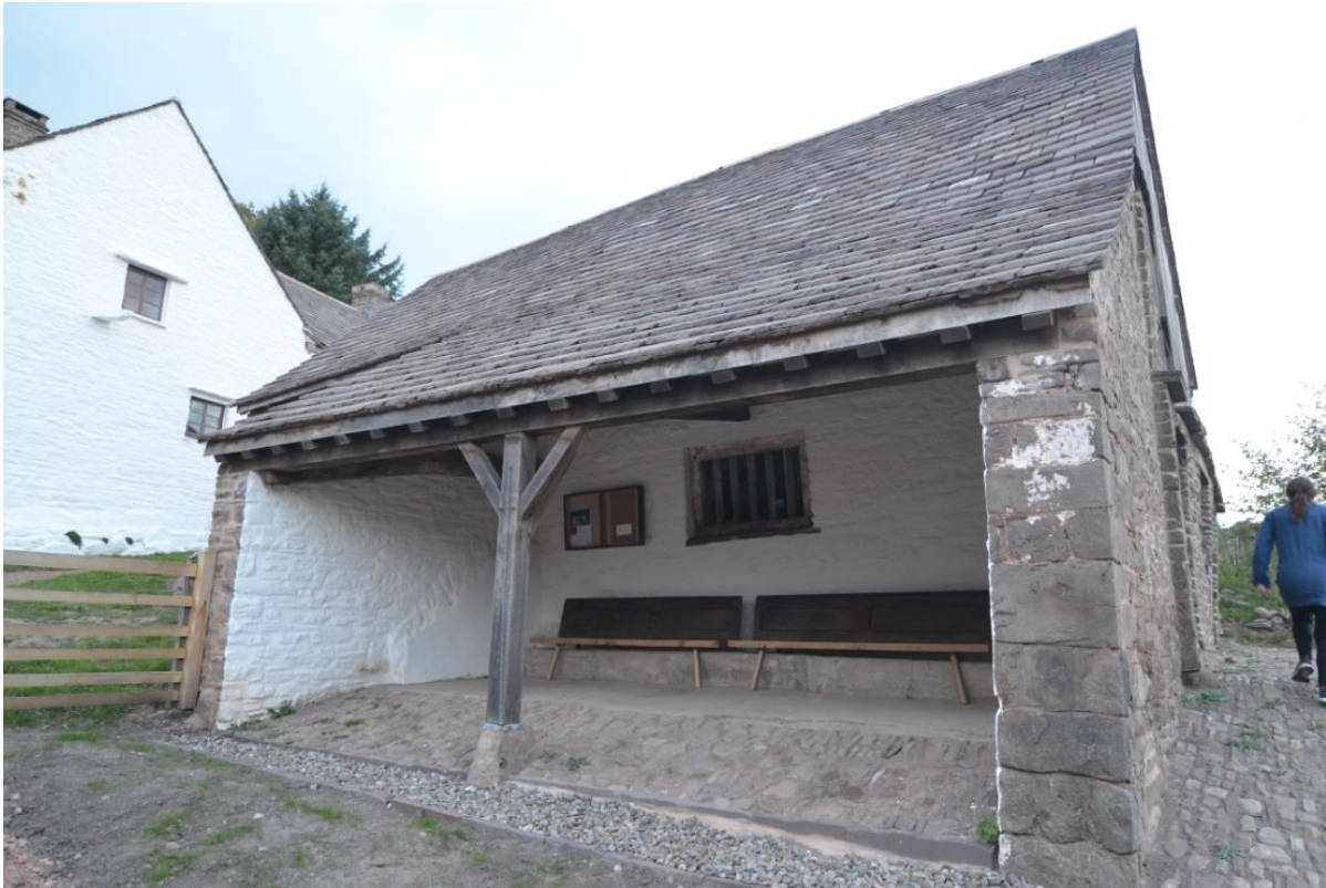
Pl.81: The rebuilt Shelter Shed (Building G).