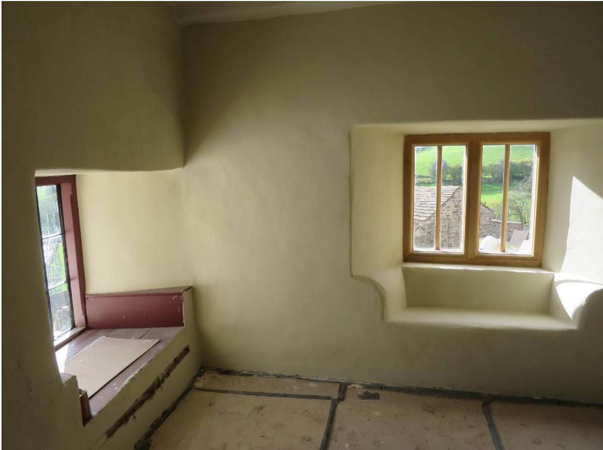
Pl.54: South end of first-floor solar room, with restored window opening in gable end, 2017.