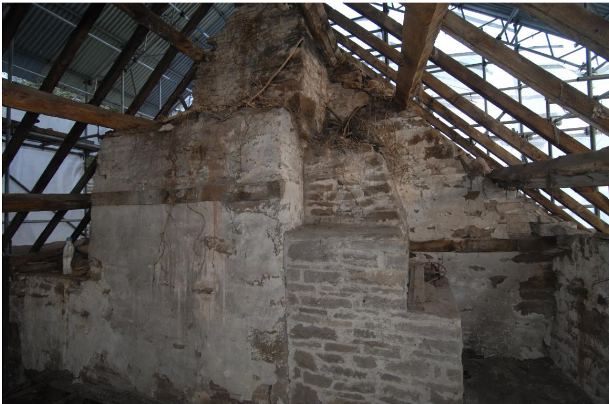
Pl.63: Upper floor of Rear Wing looking north to stack and gable.