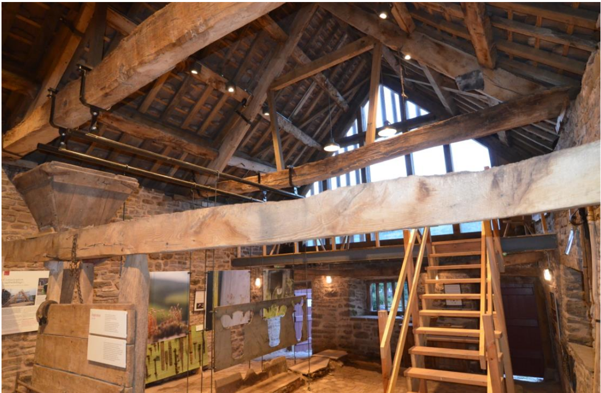
Pl.80: The restored interior of the Beast House.