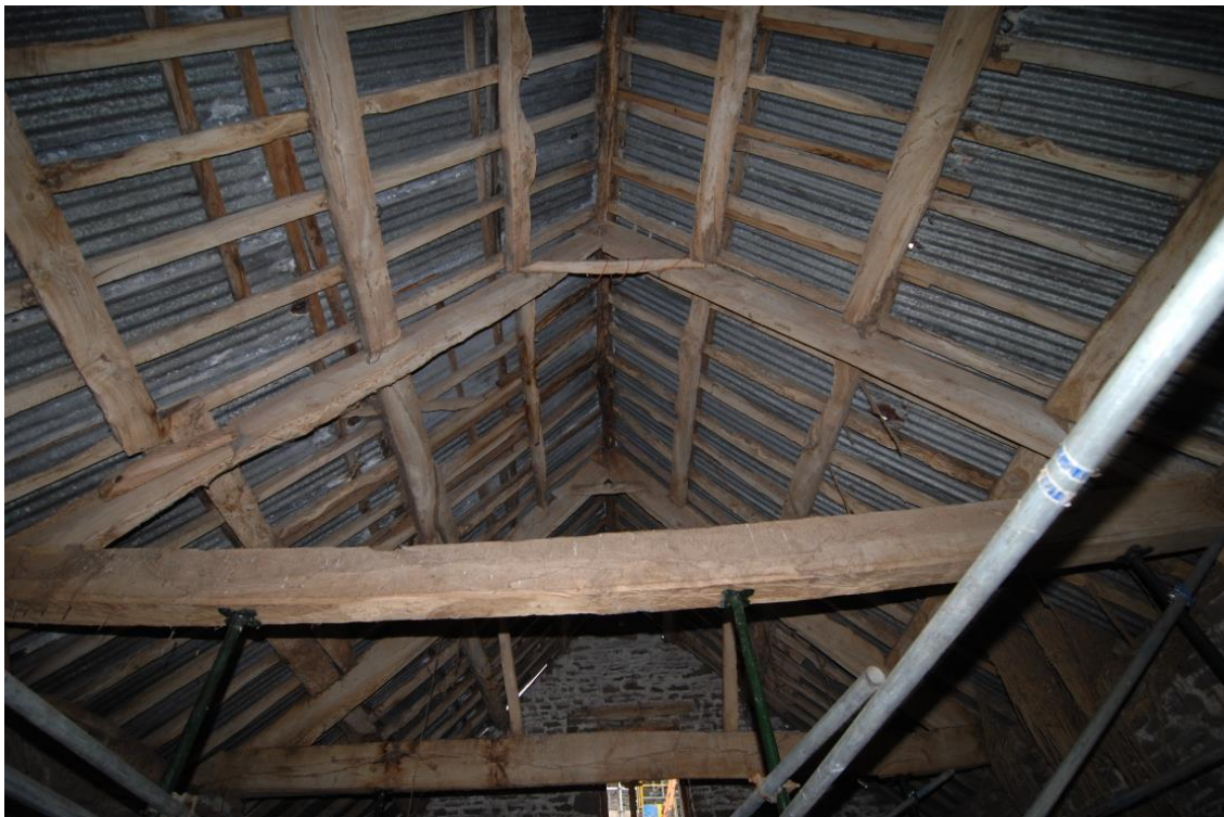
Pl.72: Beast House roof, internal view prior to removal of covering.