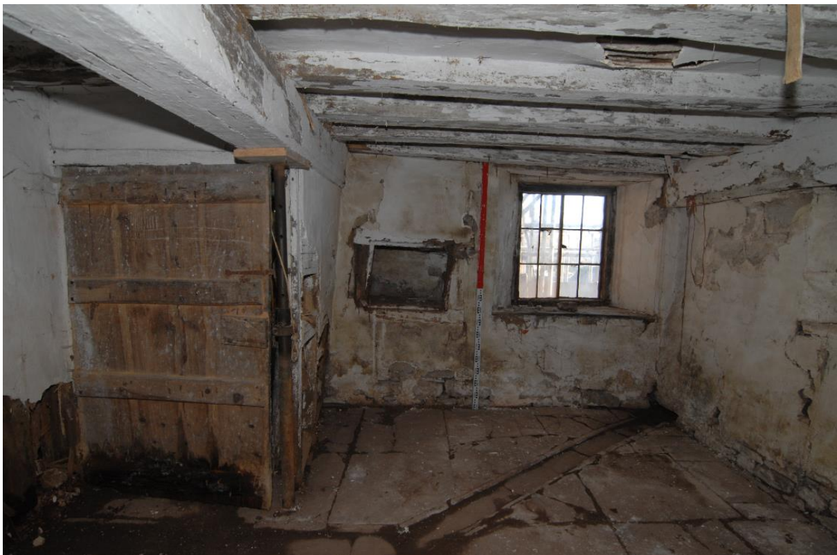
Pl.45: East side of the south ground floor room in the solar, the door lobby led to the hall.