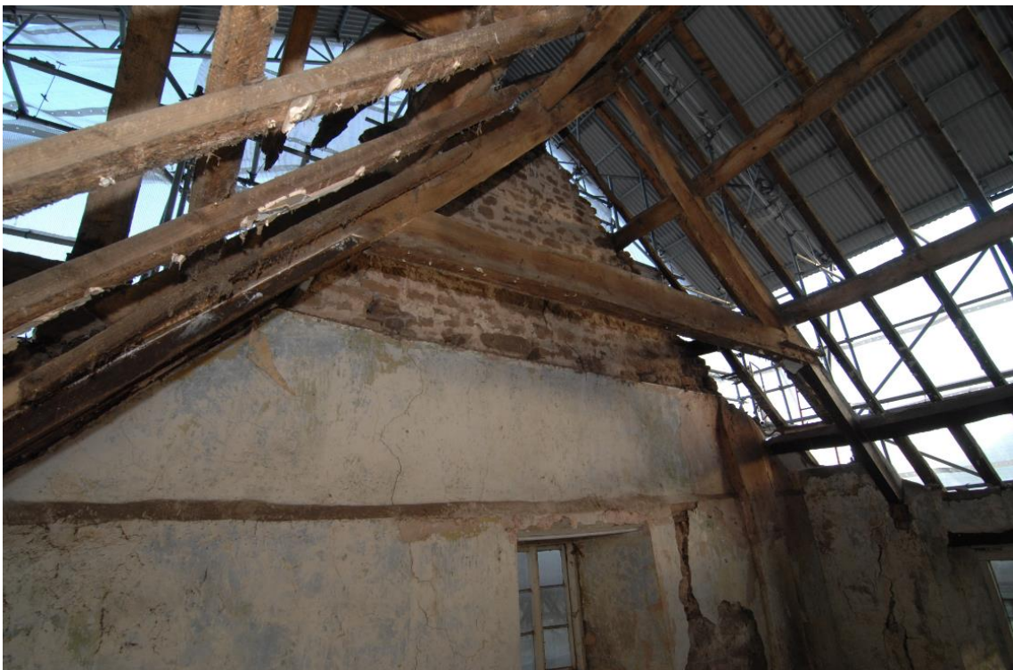
Pl.14: Exposed east gable of the roof over the Services, 2016.