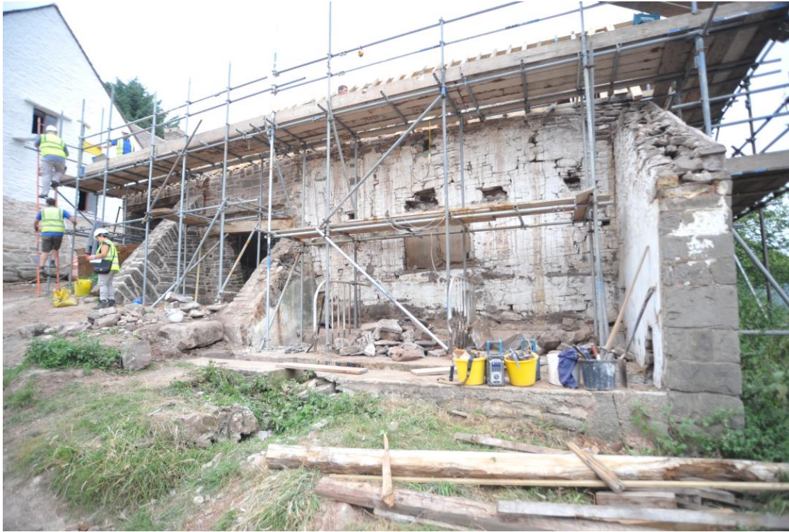
Pl.69: South side of Beast House (Building F) during works, Shelter Shed largely removed.