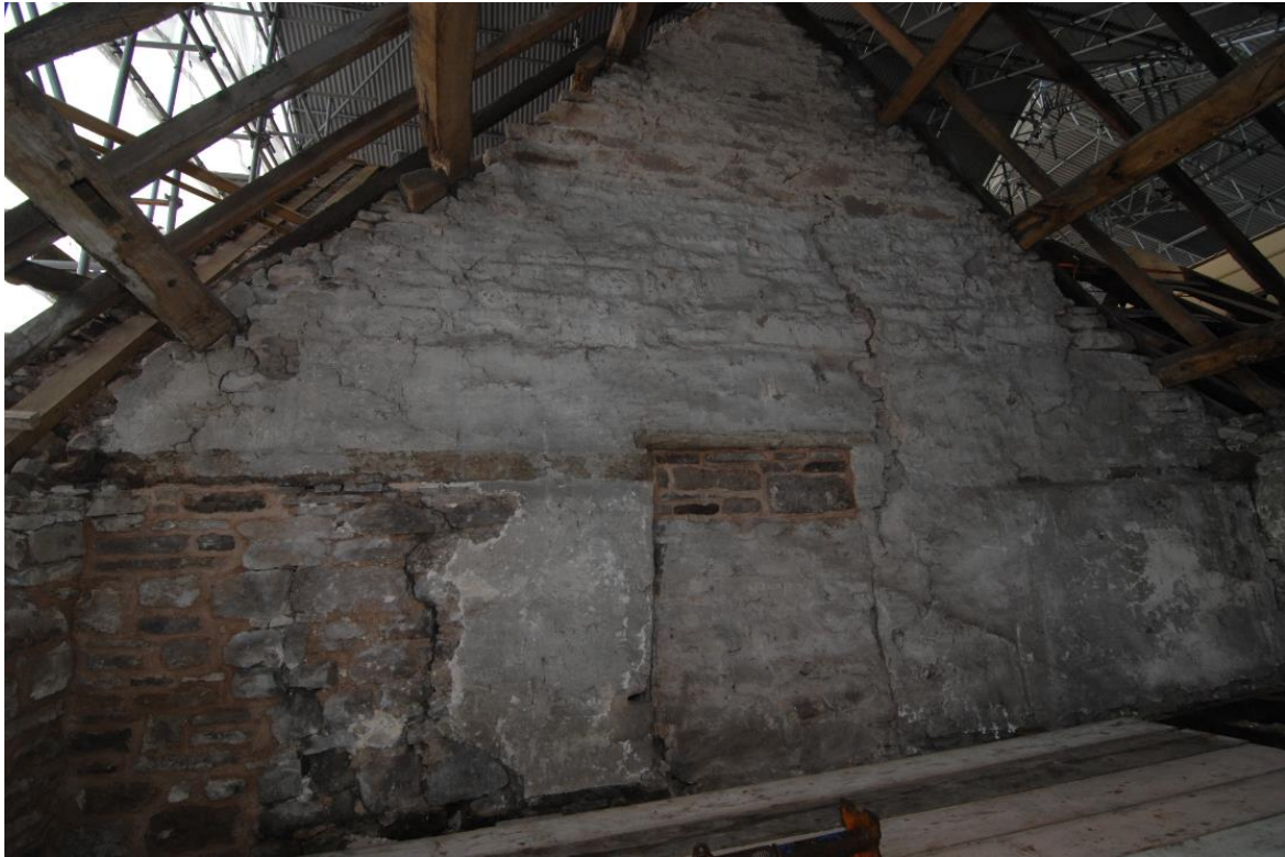
Pl.62: Upper floor or loft of Rear Wing, looking south towards the original house.