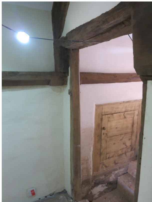
Pl.35: Present almost identical doorway for the present stair landing through south side.