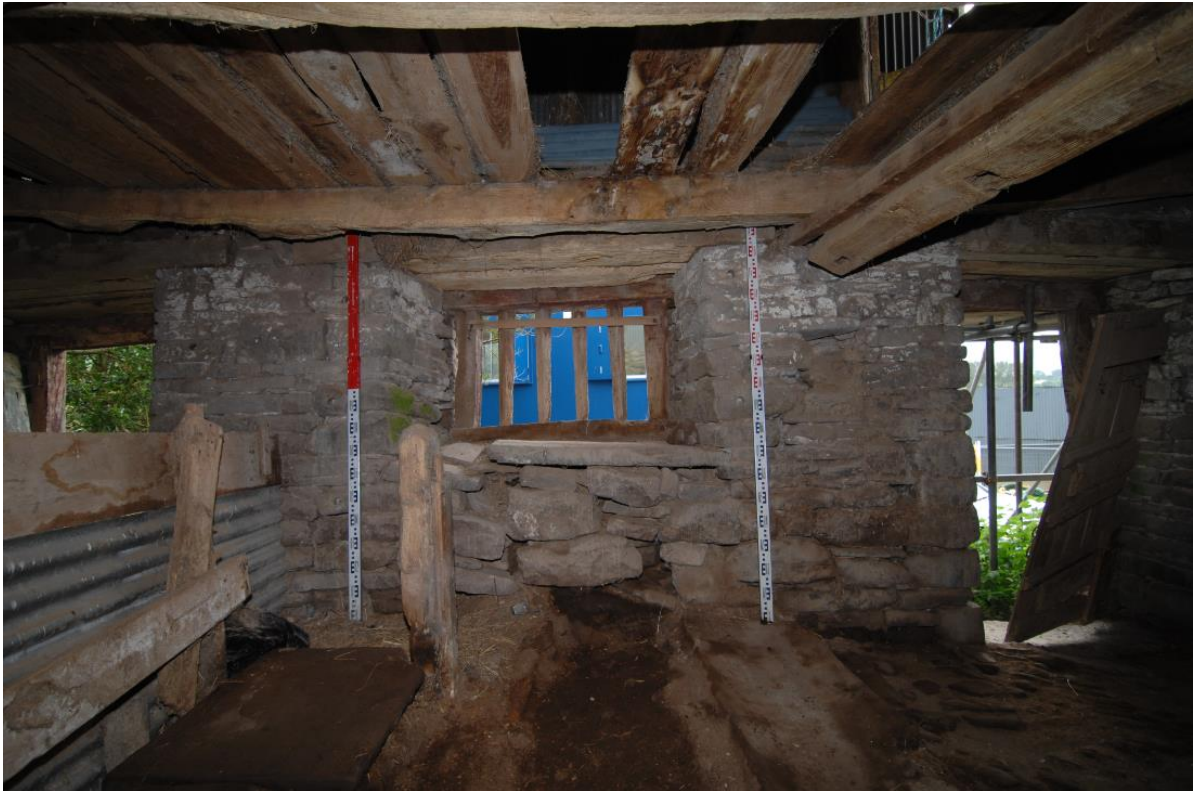
Pl.75: Internal view of the east gable frame of the Beast House at ground-floor level, 2016.