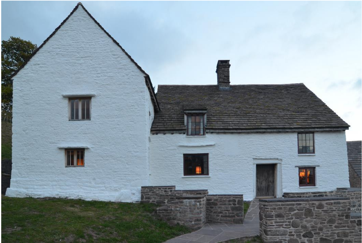
Pl.3: South elevation of the restored house, 2018.