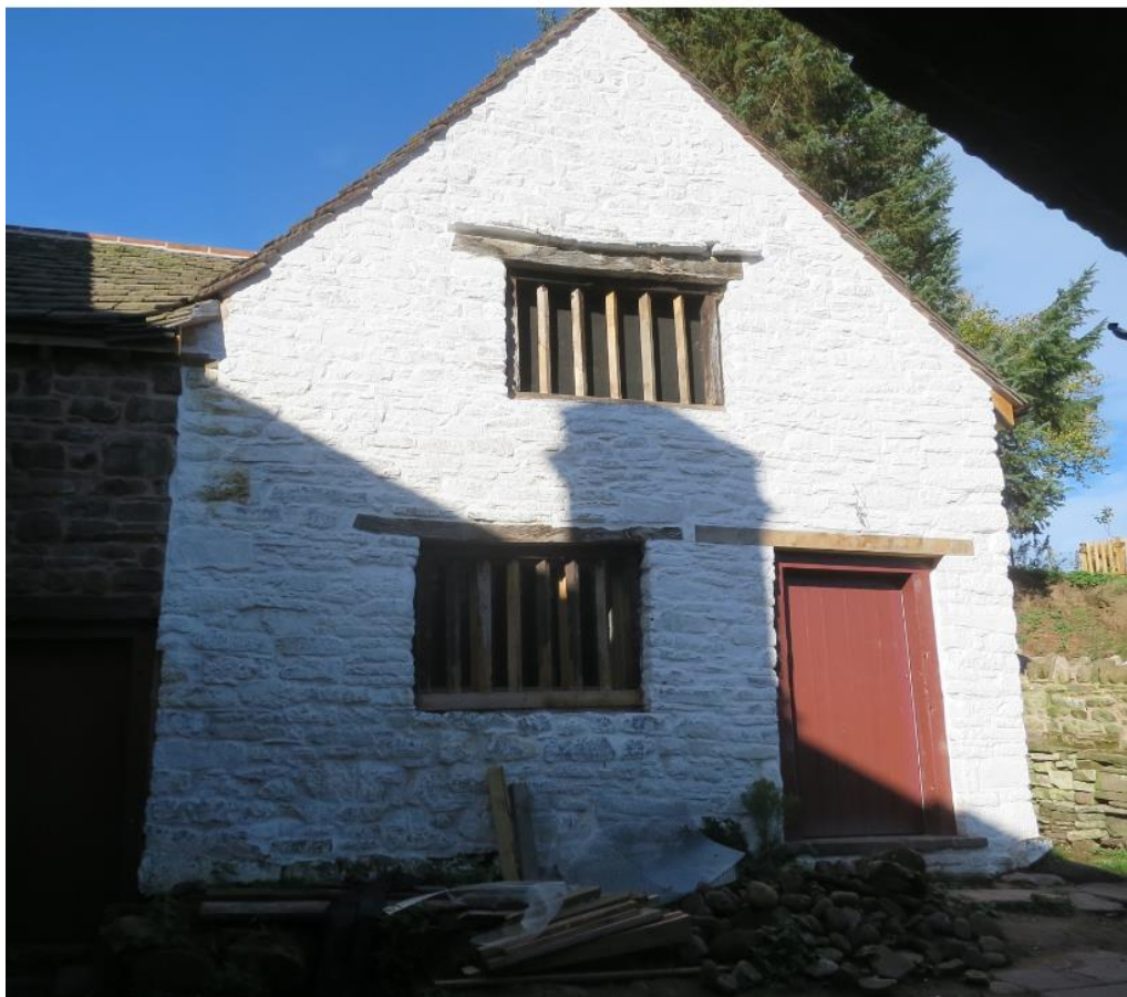
Pl.66: Restored front of Apple Store, 2017.