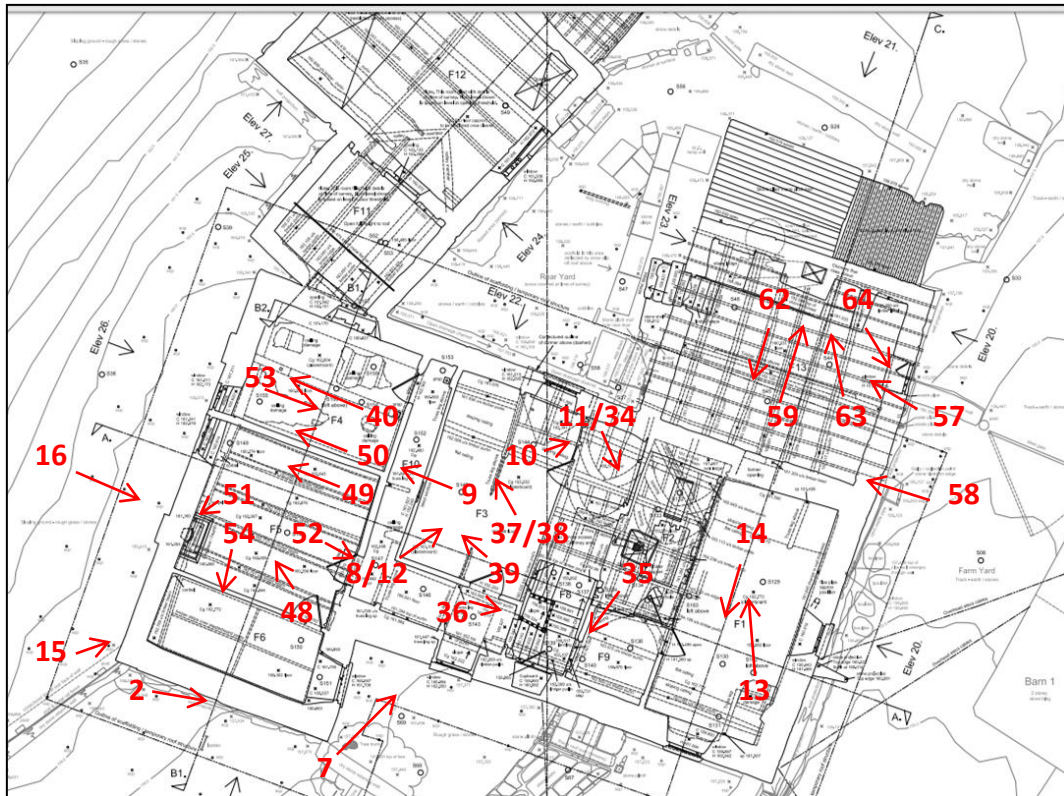
First Floor (and part roof) plan showing photograph locations.