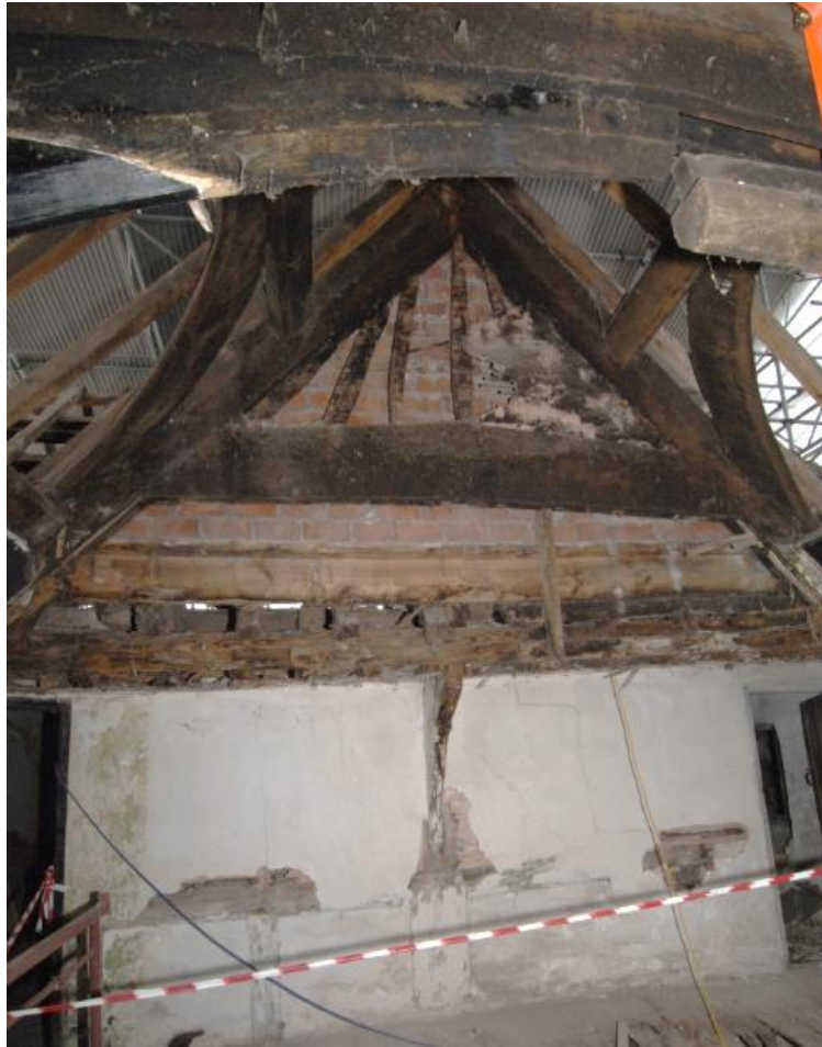
Pl.9: West end of Hall roof, with possible dais canopy traces.