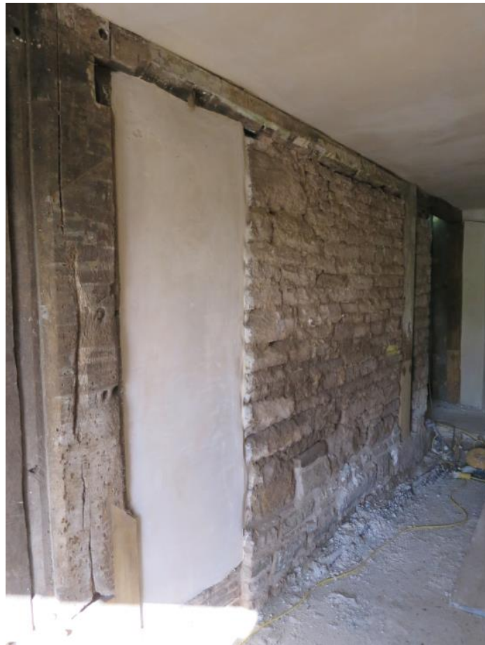
Pl.19: Rear of inserted stack between the spere truss posts.