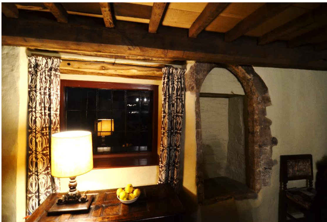
Pl.33: The doorway as restored and expressed, 2018.