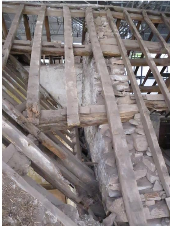
Pl.58: South gable of Rear Wing roof, built up from north wall of the original house.