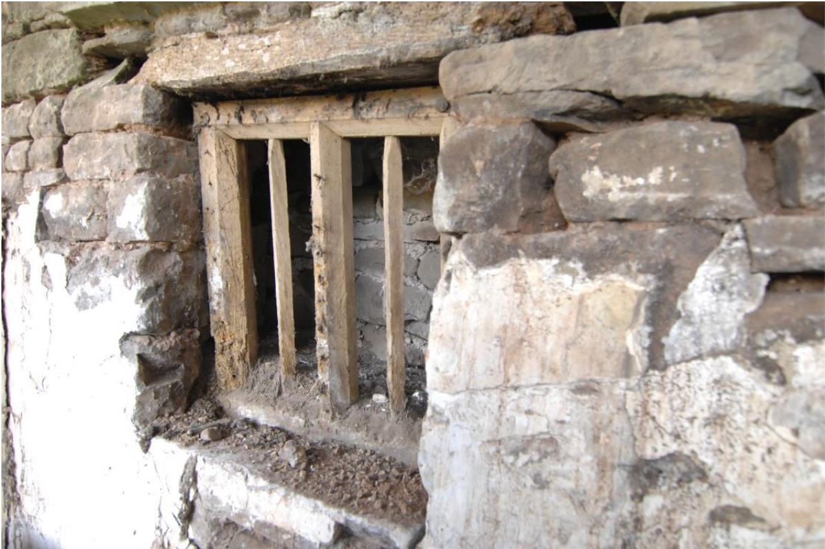
Pl.56: Rediscovered mullioned window in north gable end of the Rear Wing.