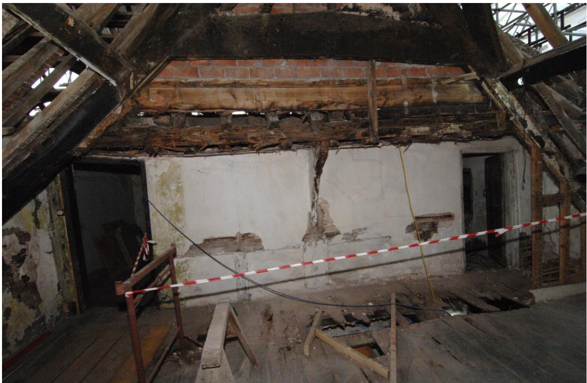
Pl.39: West end of first-floor over hall after removal of corridors.