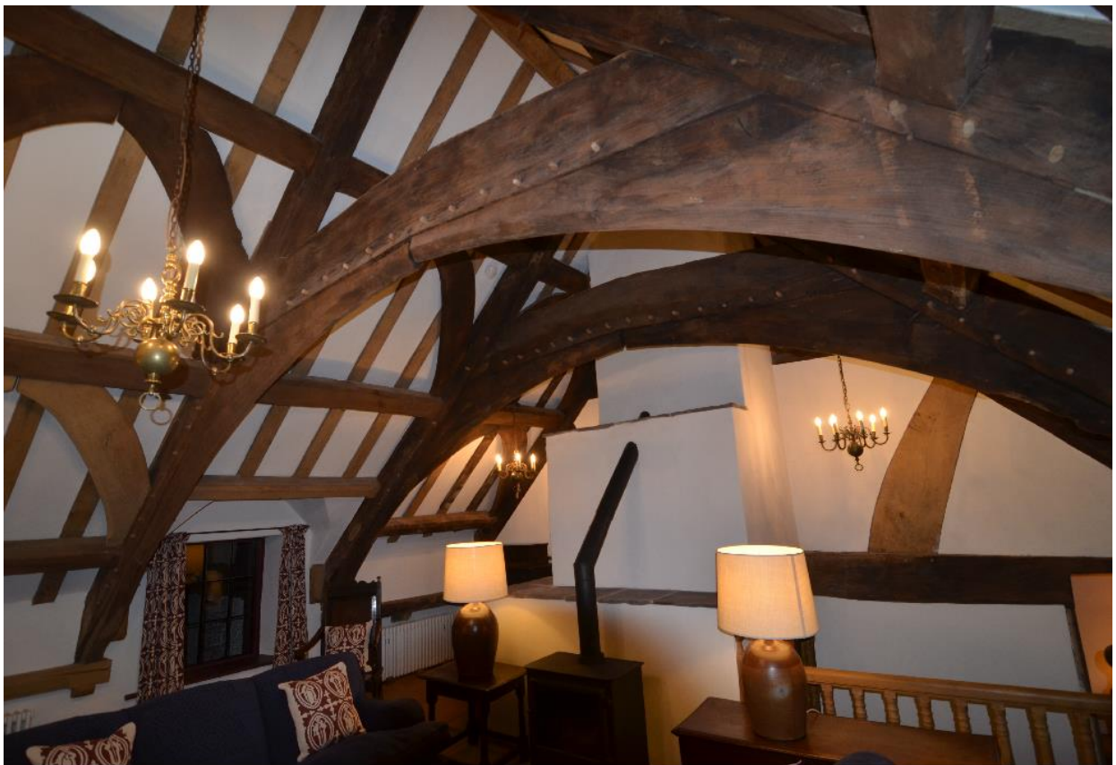
Pl.12: Exposed and restored roof over the Hall range, looking east.