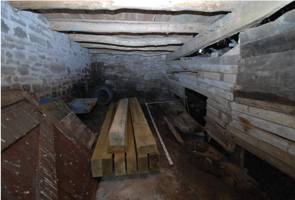
Pl.73: Northern bay of Beast House prior to restoration.