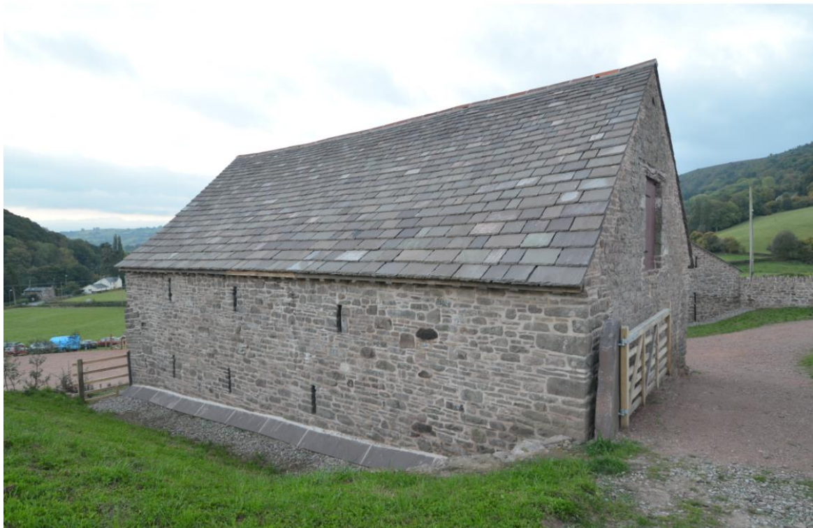
Pl.78: Restored Beast House from the north-west, 2017.