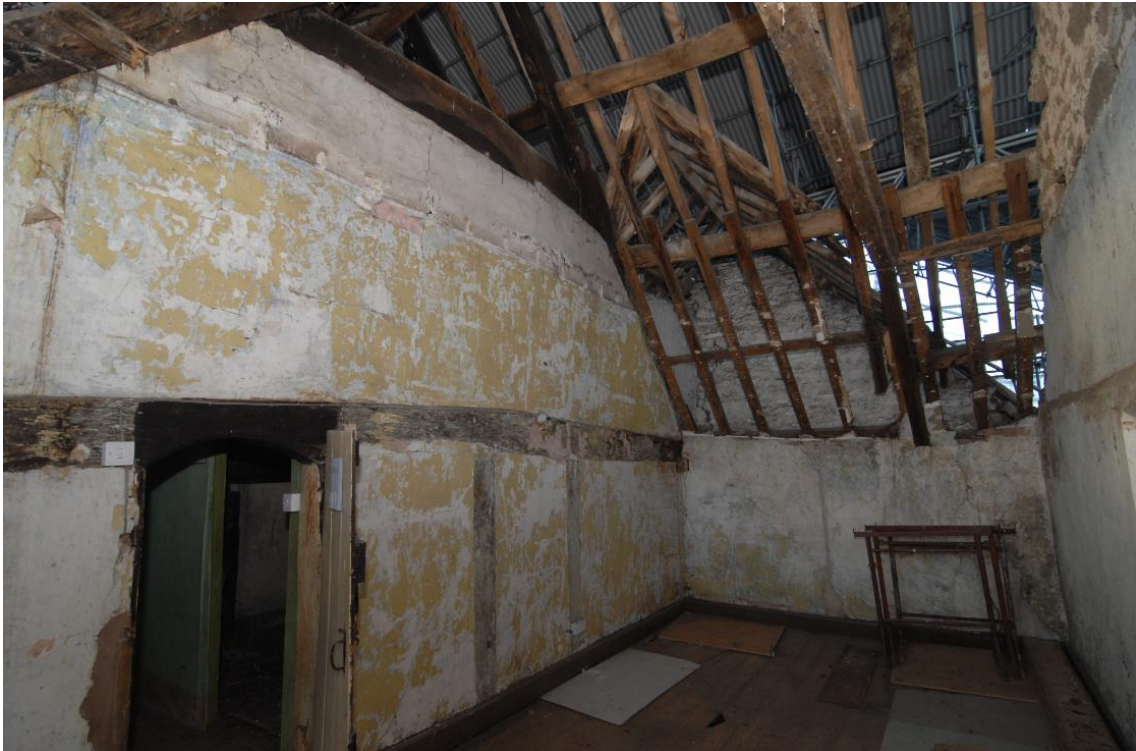
Pl.13: Remodelled roof over the Services, looking north-west, 2016.