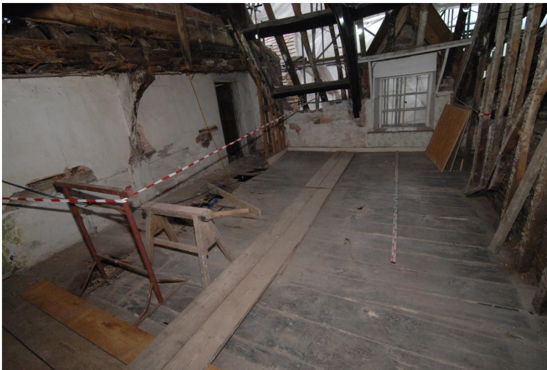
Pl.37: Western portion of the Hall section at first-floor level after removal of cross-corridor.