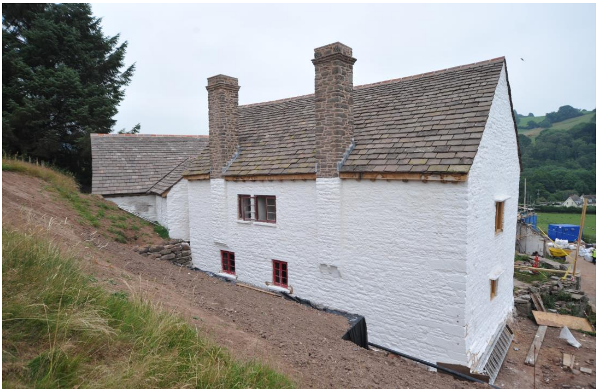
Pl.4: West elevation of the Solar, 2017.