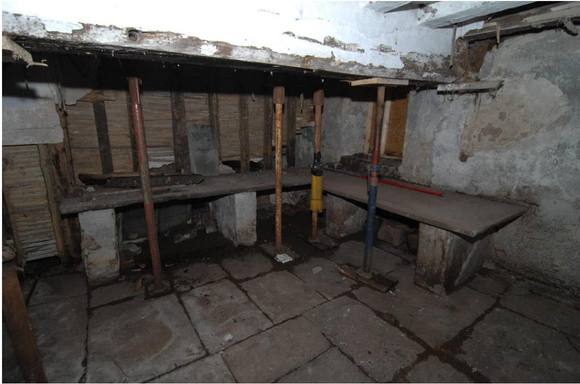
Pl.42: South-western corner of the northern Solar room, 2016.