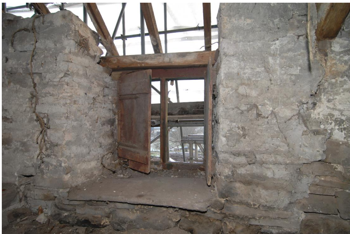
Pl.64: Dormer gable in east slope of the roof of the Rear Wing.