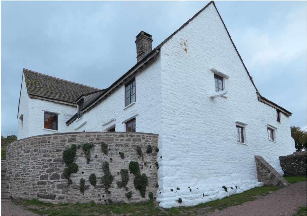
Pl.1: The restored house from the south-east, 2018.