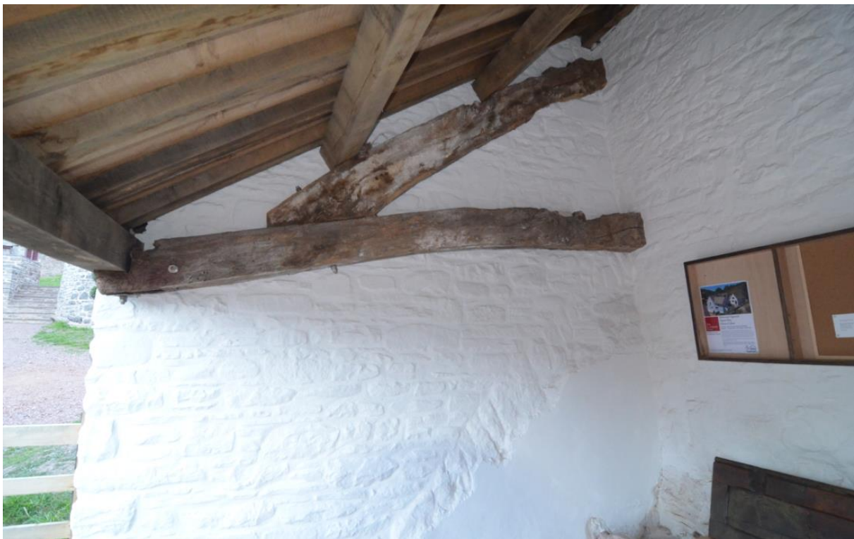
Pl.82: Re-set truss and part frame of earlier structure of Shelter Shed.