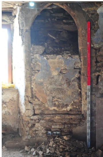
Pl.30: The doorway.