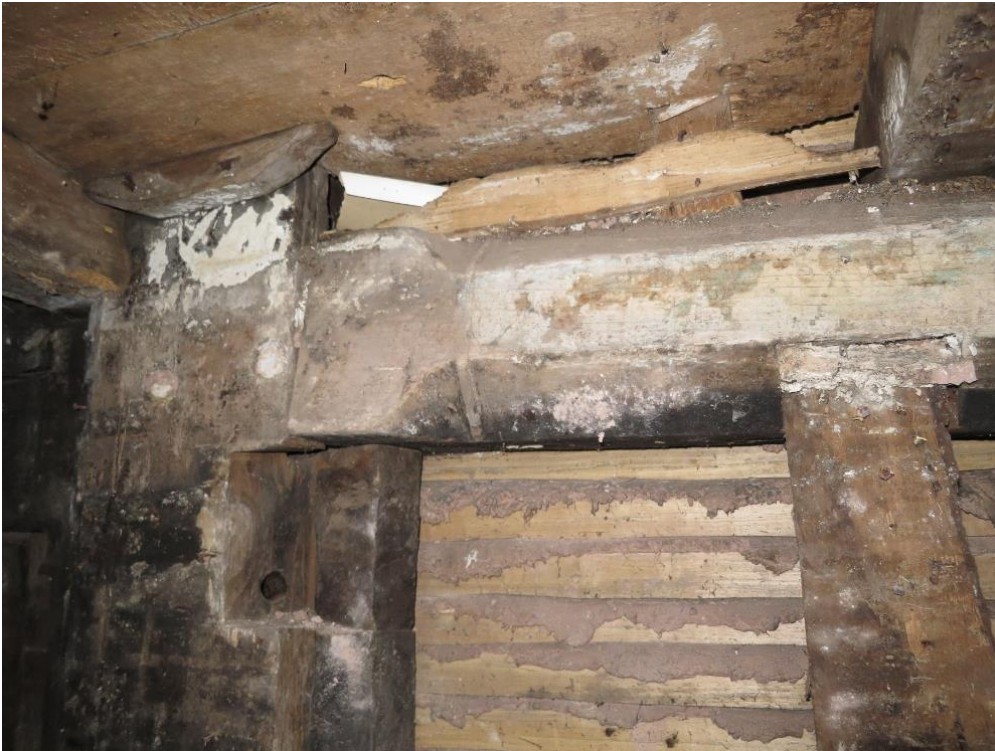
Pl.18: Detail of re-used moulded beam/mullion infilling the spere truss.