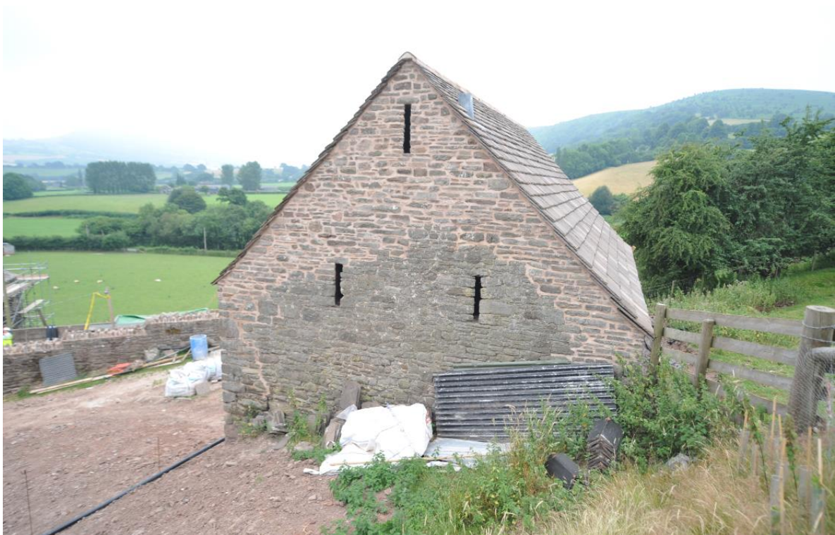
Pl.68: Restored Stable from the north; note raised gable.