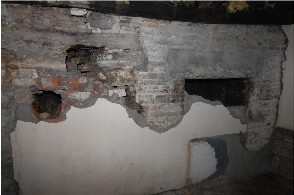
Pl.60: Beginning of internal strip of north gable wall (G8) in the Rear Wing, 2017.