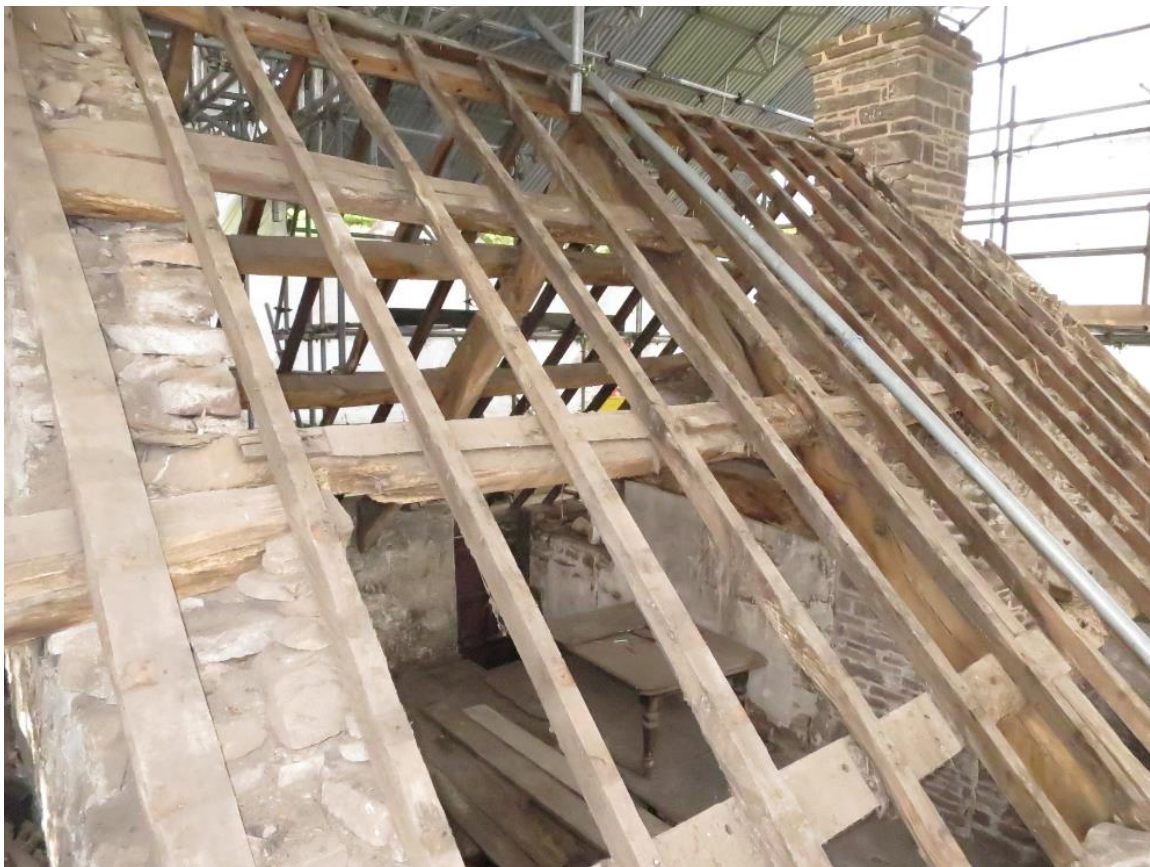
Pl.57: East roof slope of Rear Wing after de-slating, 2017.