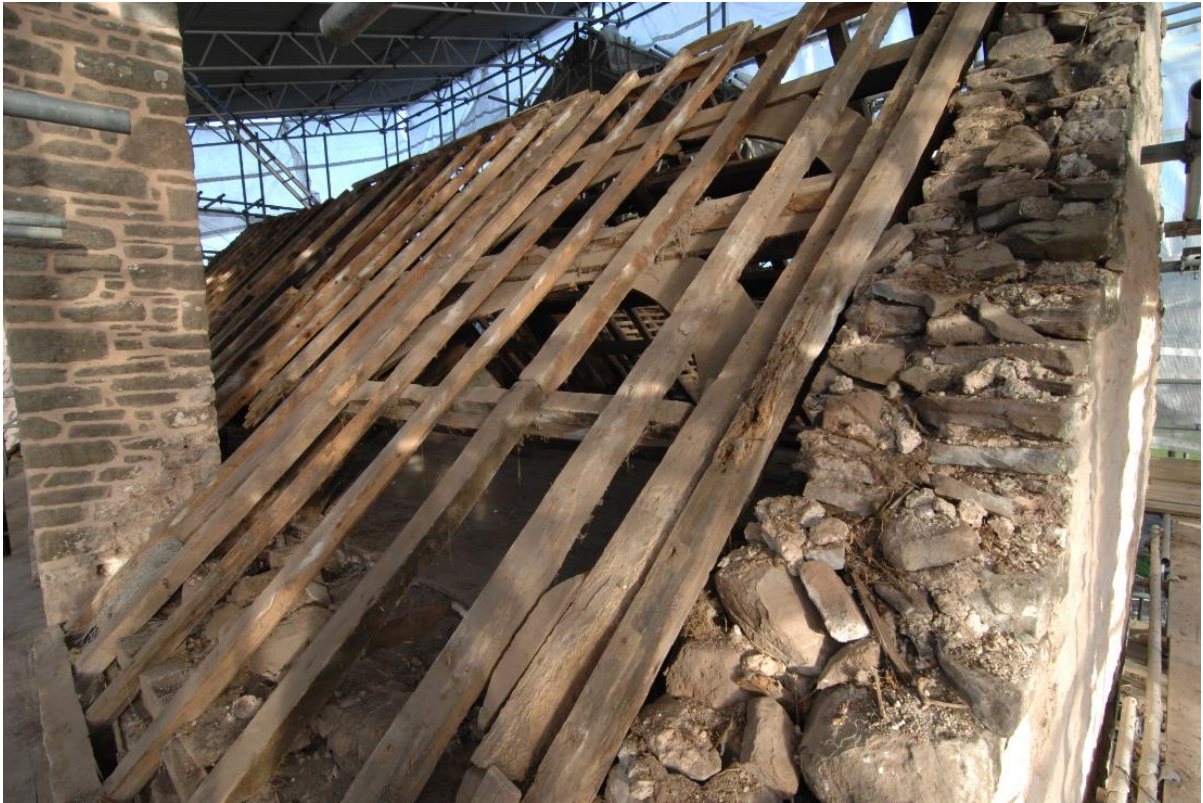
Pl.15: South-western corner of the Solar roof, stripped ready for repair, 2016.