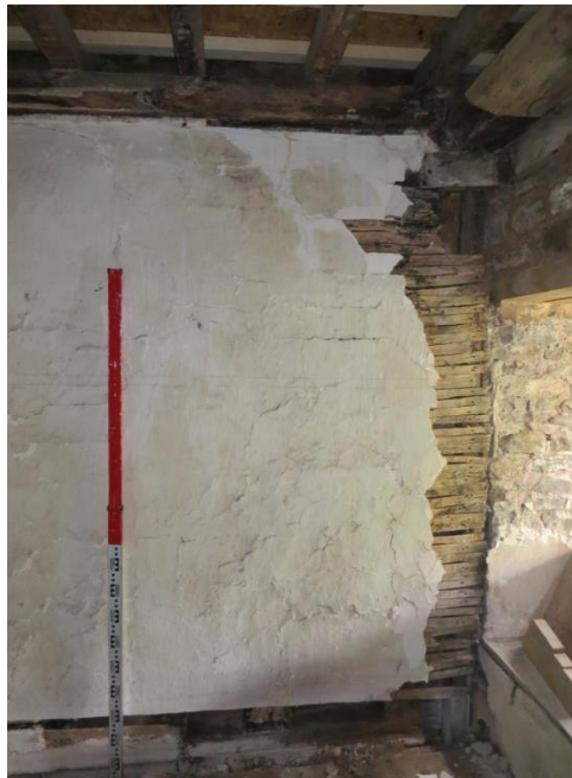
Pl.53: Western end of cross-frame at first-floor level in the solar range, and position of the primary doorway through it – replaced by one at opposite end.