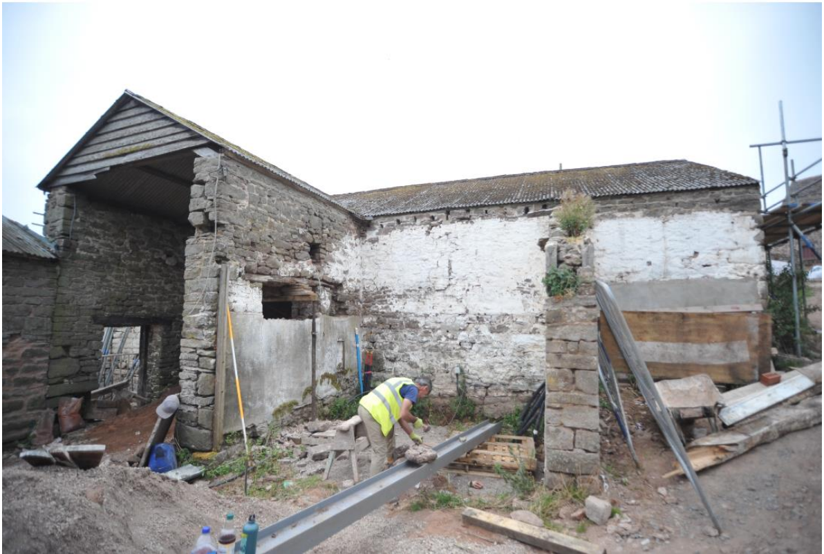
Pl.85: Threshing Barn (Building J) from the east under restoration.