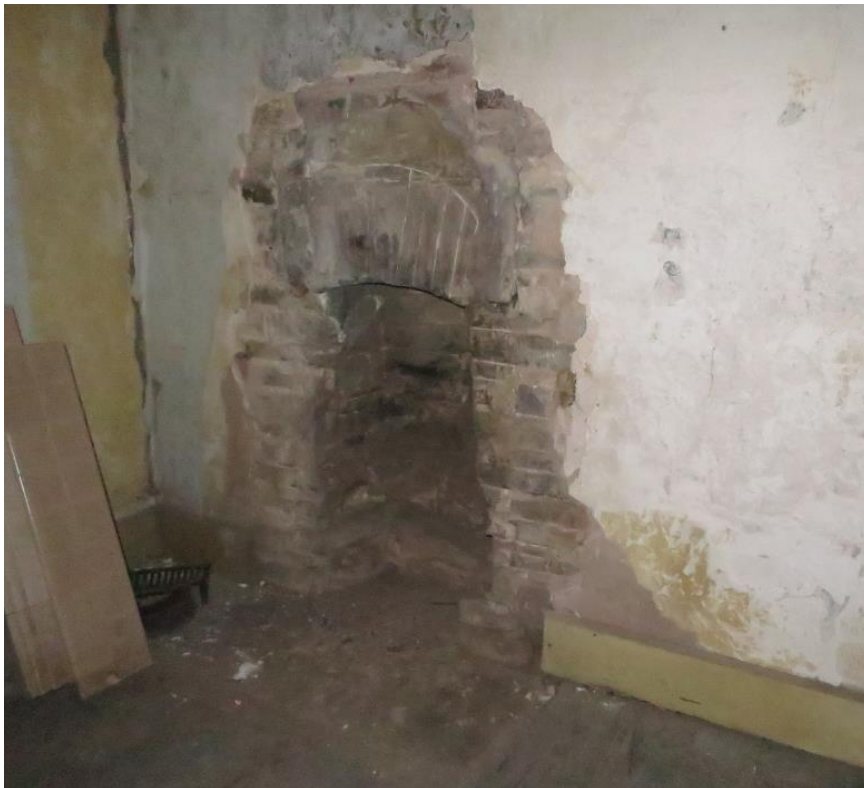
Pl.51: Exposed early inserted fireplace in the west wall of the solar at first-floor level with incised head.