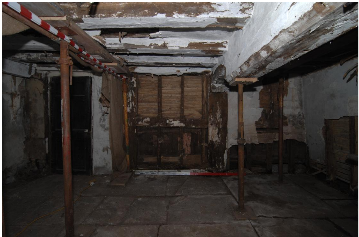
Pl.41: Northern ground-floor room in solar wing, looking east to the hall.