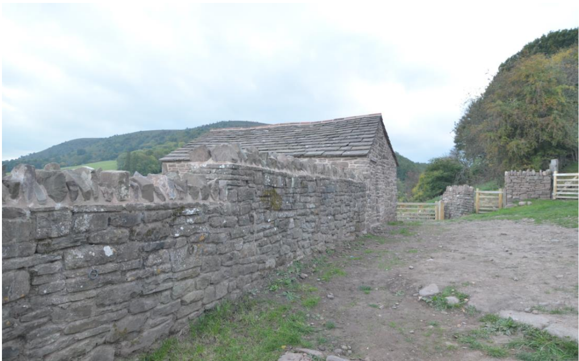
Pl.84: General view westwards towards the restored Corn Drier.