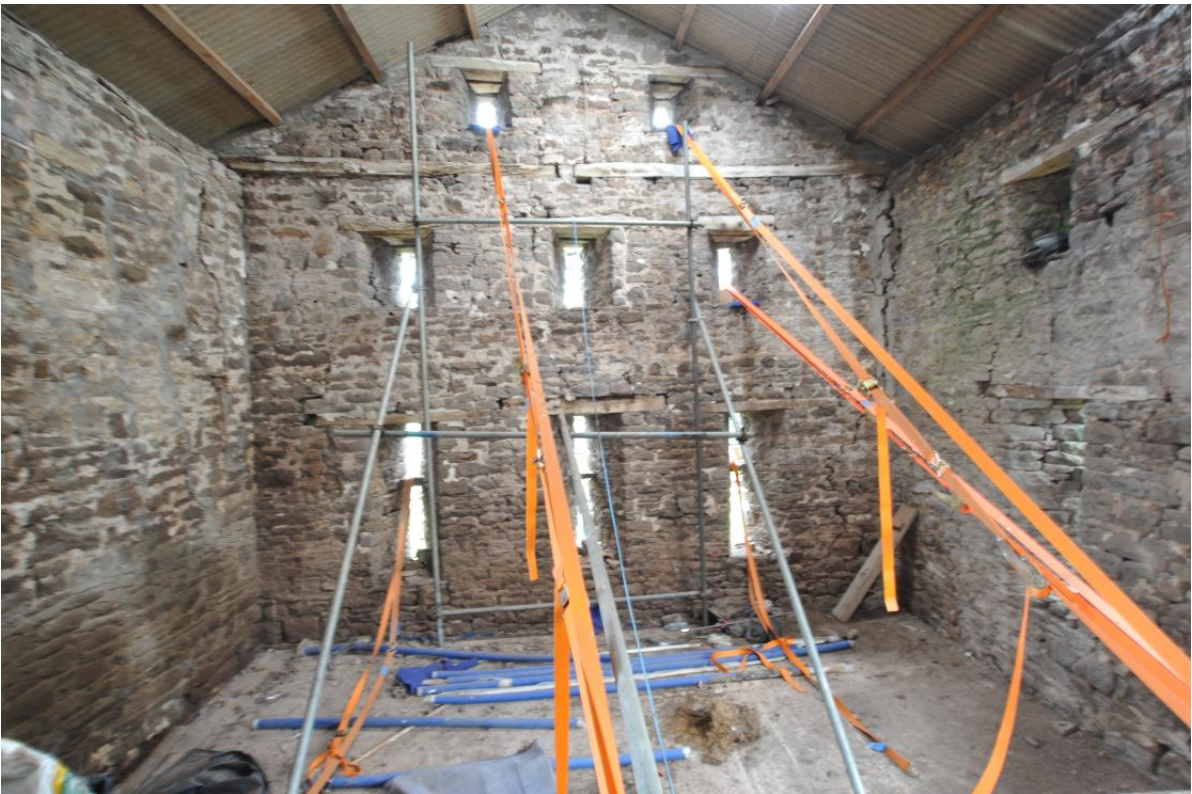
Pl.86: Stabilisation works within the Threshing Barn, looking north.