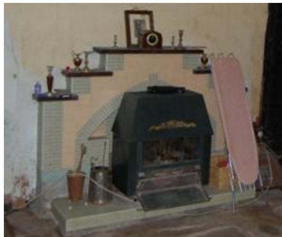
Pl.28: The Phase IV mid-20 th century chimneypiece and later-20 th century stove of Phase V.