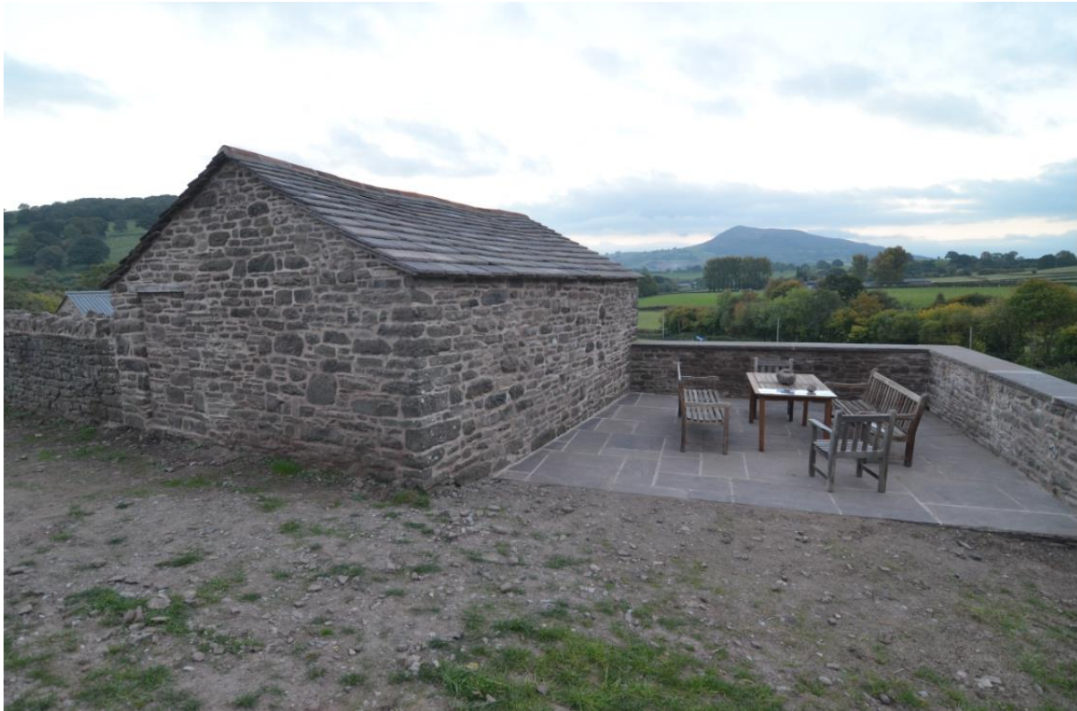
Pl.83: View of the Corn Drier (I, left) and site of Piggery (Building H) from the north-west.