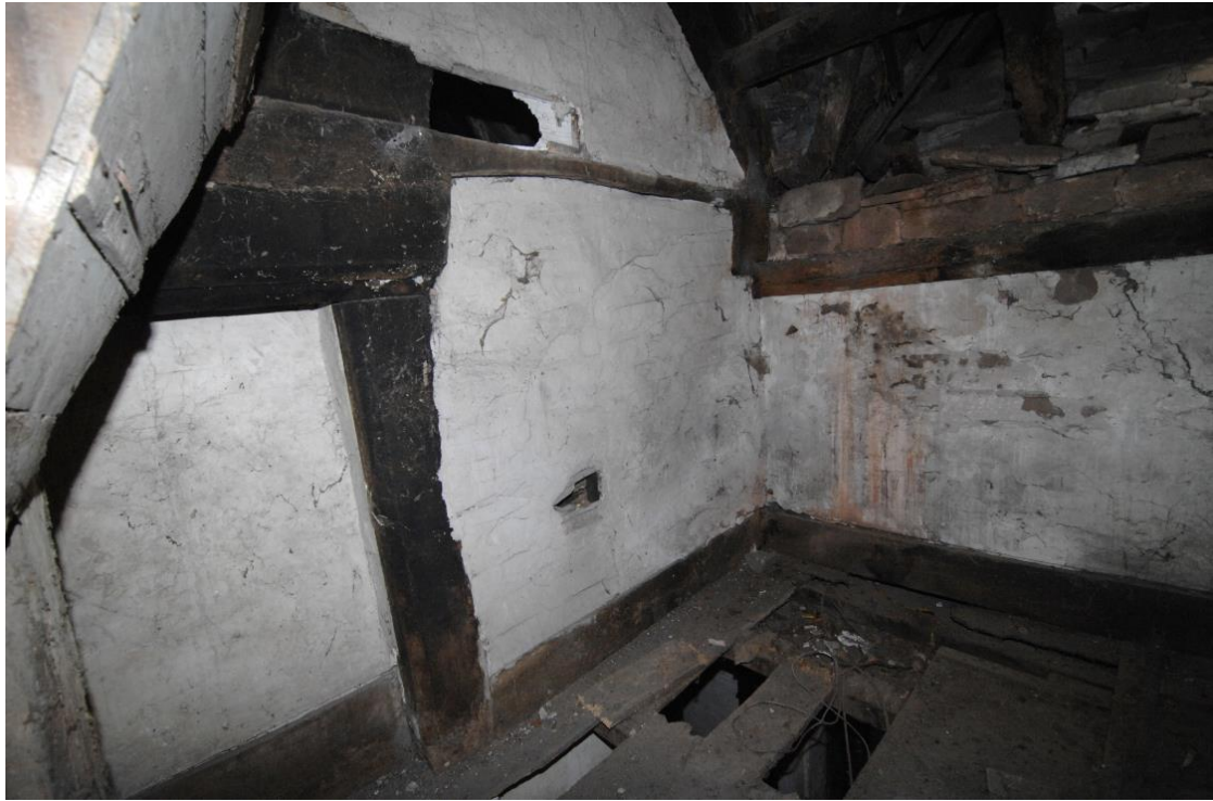
Pl.11: Top of spere truss and blocked inserted doorway through it, north of stack.