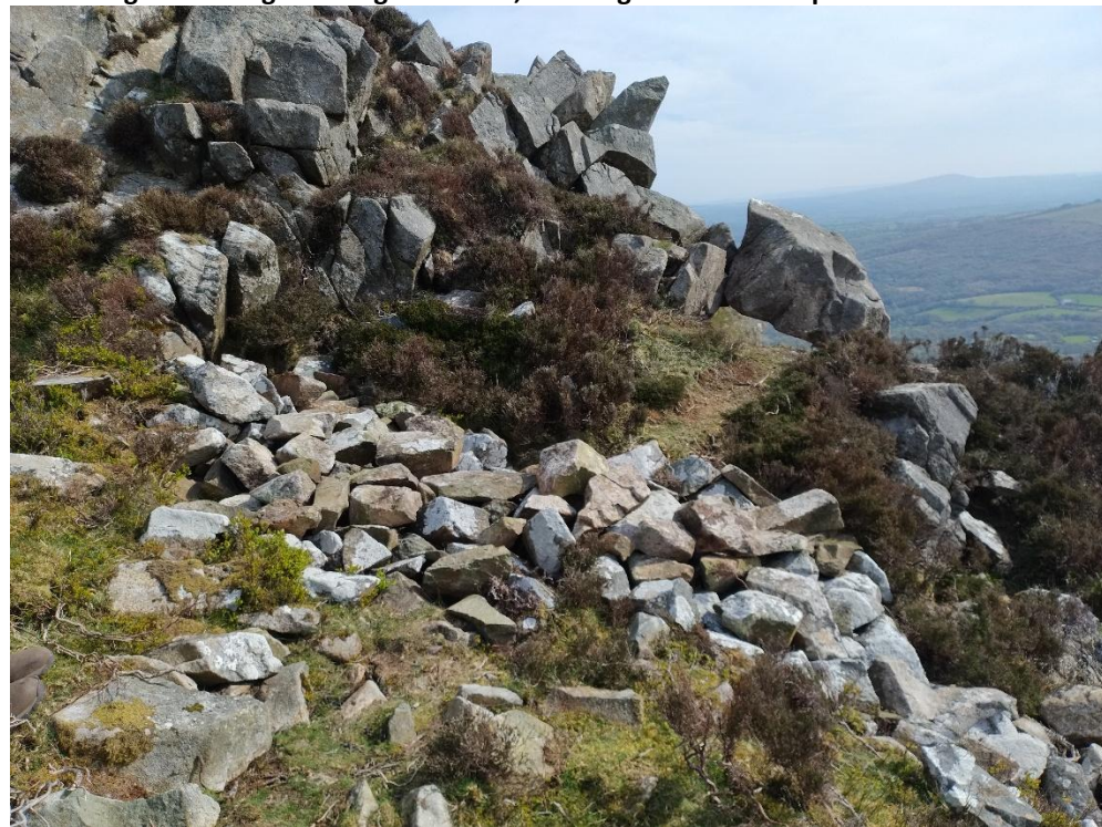
Figure 4. Image looking northeast after reconsolidation work.