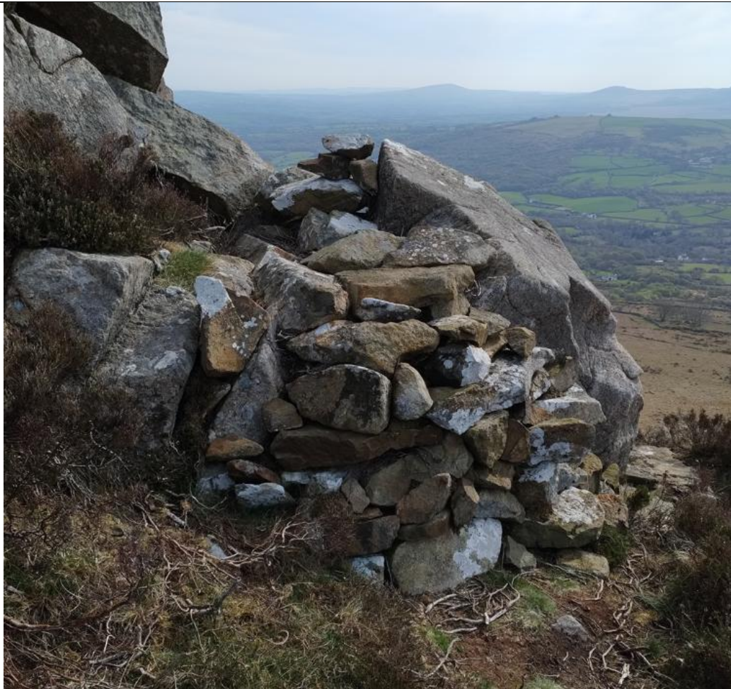
Figure 5. Image looking northeast showing shelter.