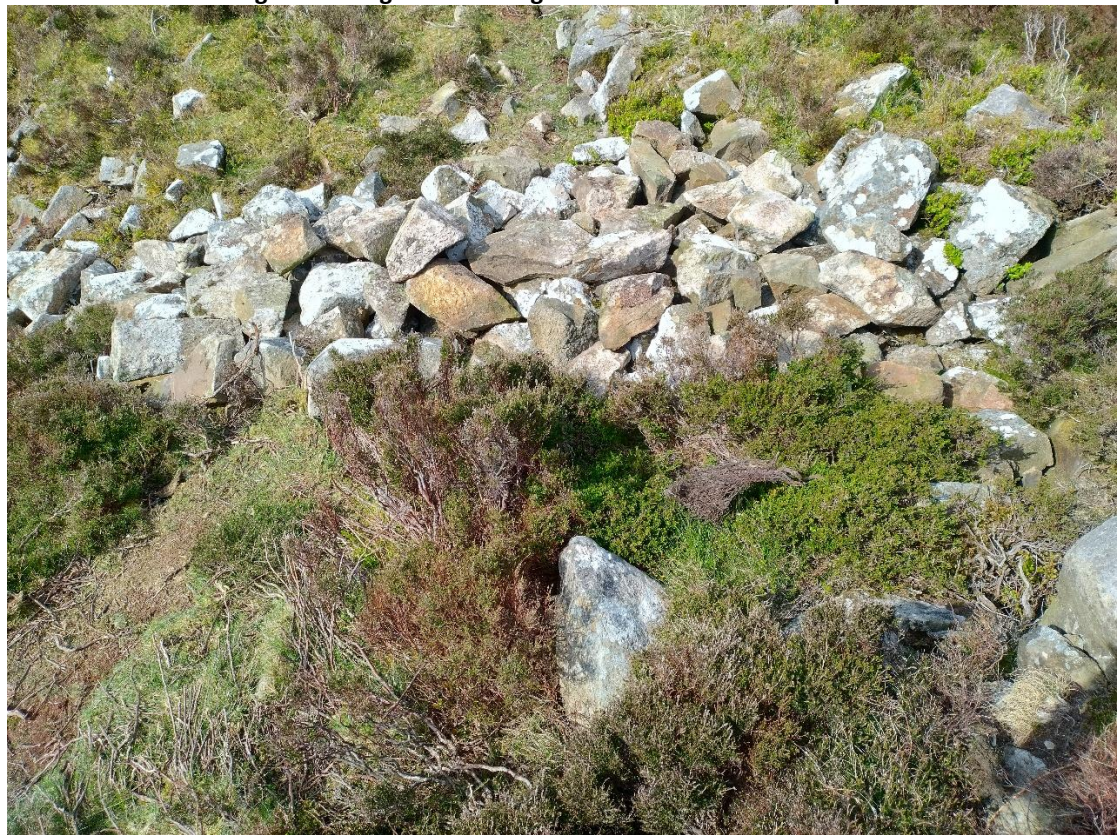
Figure 8. Image overlooking the rampart after the reconsolidation work.