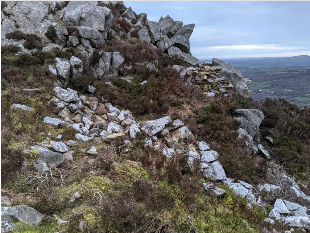
Figure 3. Image looking northeast, showing disturbed rampart and shelter.

The National Park Authority staff and volunteers will continue to monitor the monument on an ongoing basis and report issues. Any subsequent disturbances will be reported to Dyfed-Powys Police and information shared with Cadw and Heneb as required.