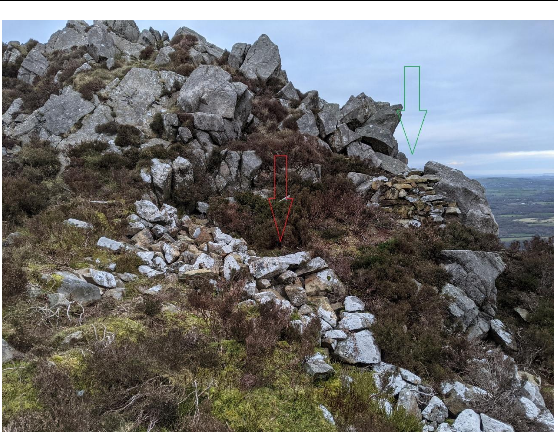
Figure 2. Image showing the disturbed rampart (red arrow) and shelter created using the rampart stones (green arrow).