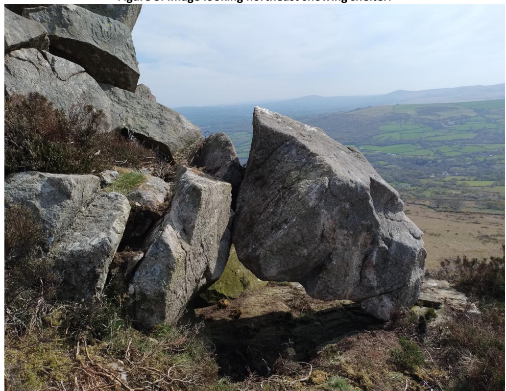
Figure 6. Image looking northeast after dismantling shelter and showing impressive leaning boulder.