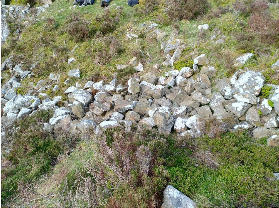
Figure 7. Image overlooking disturbed area of the rampart.