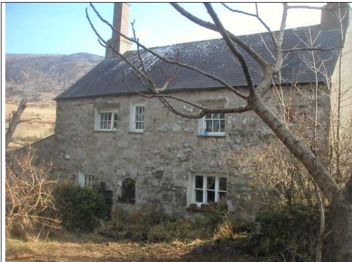
Plate 1 South-west elevation