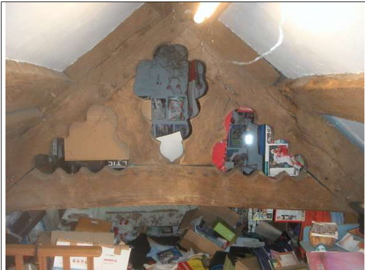
Plate 6 Truss 1