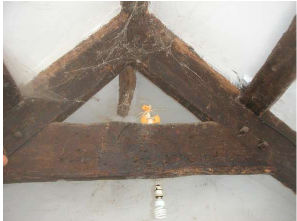
Plate 5 Truss 3 (porch roof)