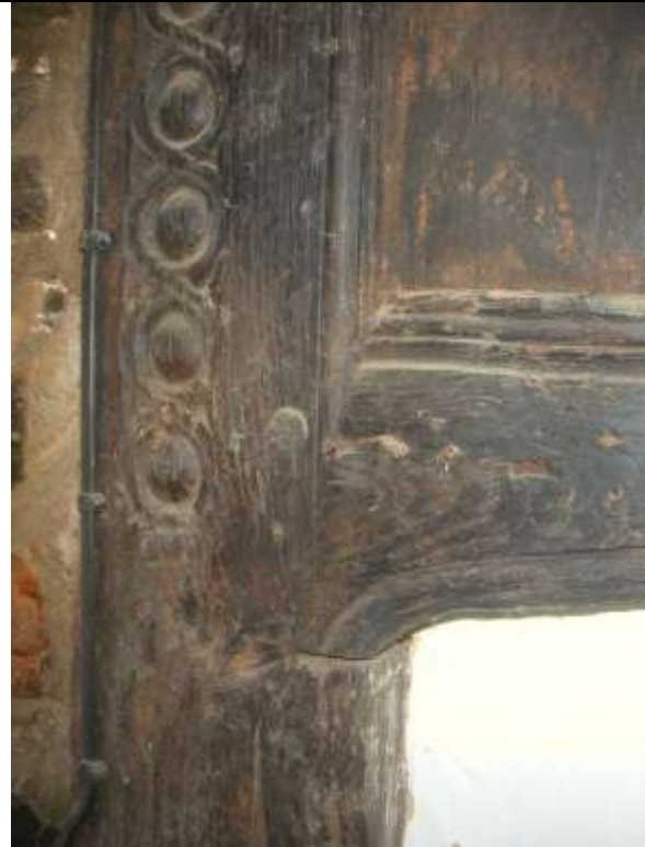
Plate 4 Doorway detail