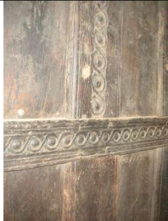
Plate 3 Screen detail