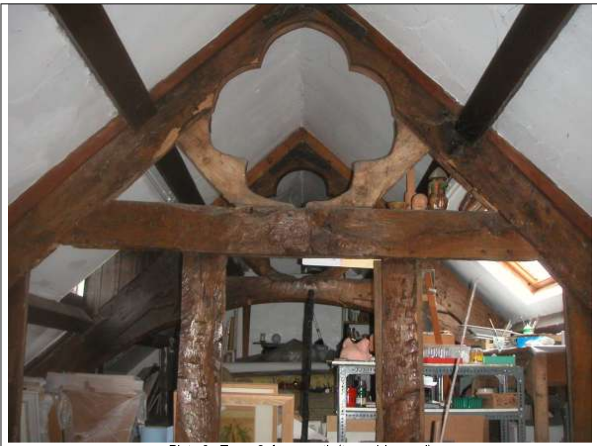
Plate 3 Truss 2, from south (truss 1 beyond)