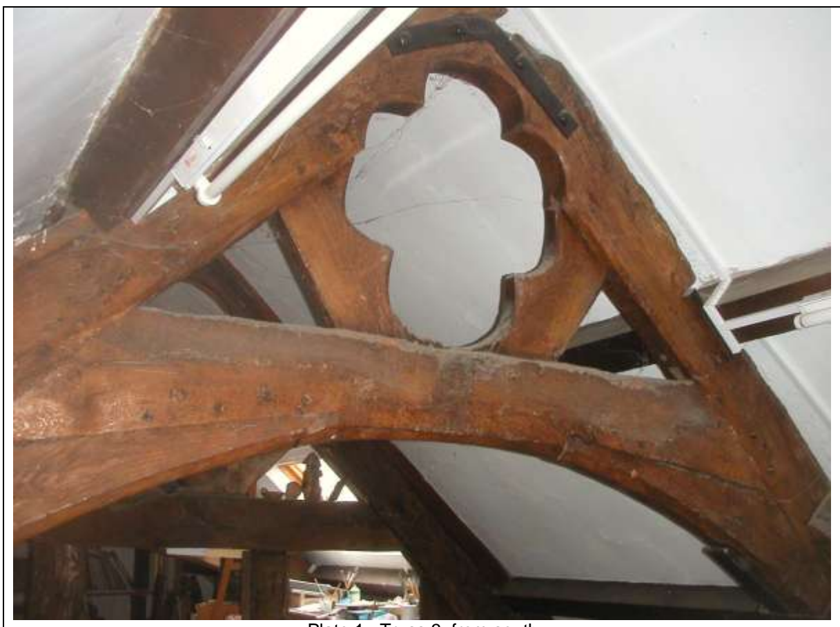
Plate 1 Truss 3, from south