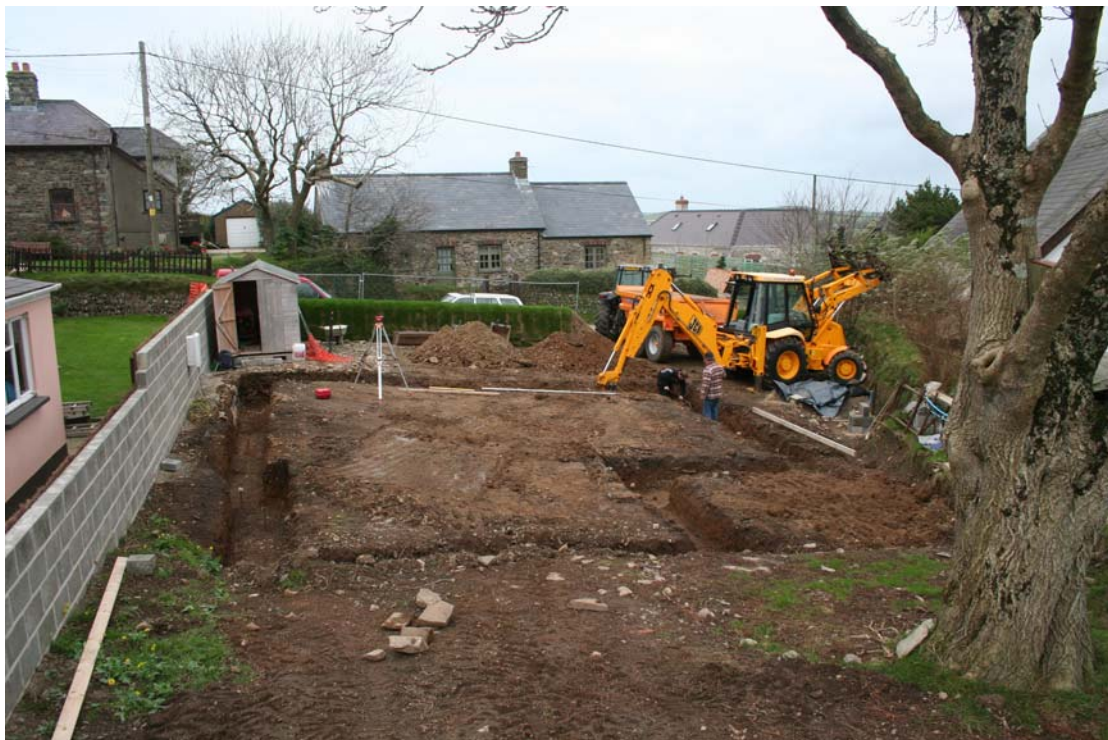
Plate 1: Foundation trenches near completion. View to north.

The LPA's archaeological advisor was informed that the foundation trenches had not produced any archaeological results and it was agreed there was no necessity to observe any further works on the site.